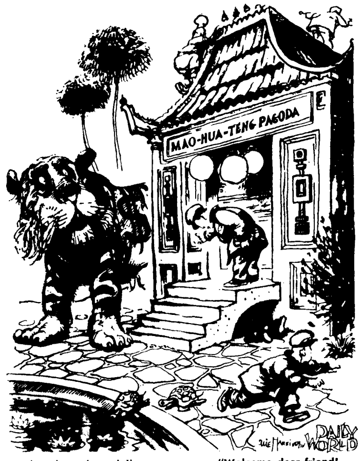
American imperialism strengthens its foothold in China.

A.B. I have my doubts. Chinese-American partnership is burdened with considerable difficulties and contradictions. This is, if you like, a partnership without trust or, let us say, with a minimum of trust. The Americans want to play the "Chinese card", i.e., use China in their political aims. But the Chinese too are not unwilling to play the American card. This being so, it is too complex to think in the categories of a long-term perspective. I feel rather that medium-term calculations predominate.