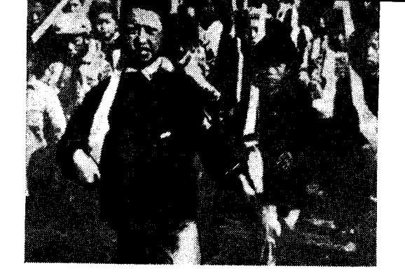
So far, wooden weapons...

Chinese themselves commented upon them. They include photos, excerpts from letters, periodicals and the semi-legal dazibao, official slogans, and utterances by the country's political leaders.