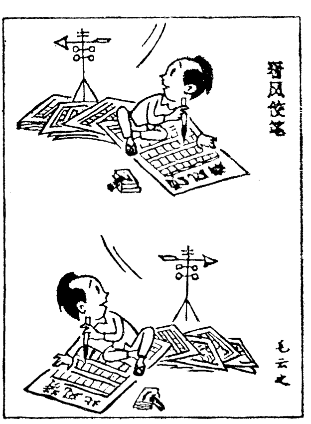
The Maoists' repressive measures against the artistic intellectuals breed in them feelings of passivity and uncertainty.

Judging by the admissions of the Chinese press, the attempts to win the trust of the intelligentsia by the already familiar method of organizing one more campaign have not yielded the desired effect.