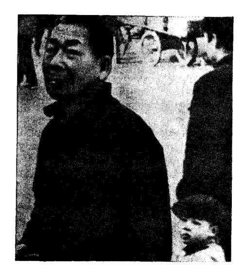
A hundred million suffer malnutrition.