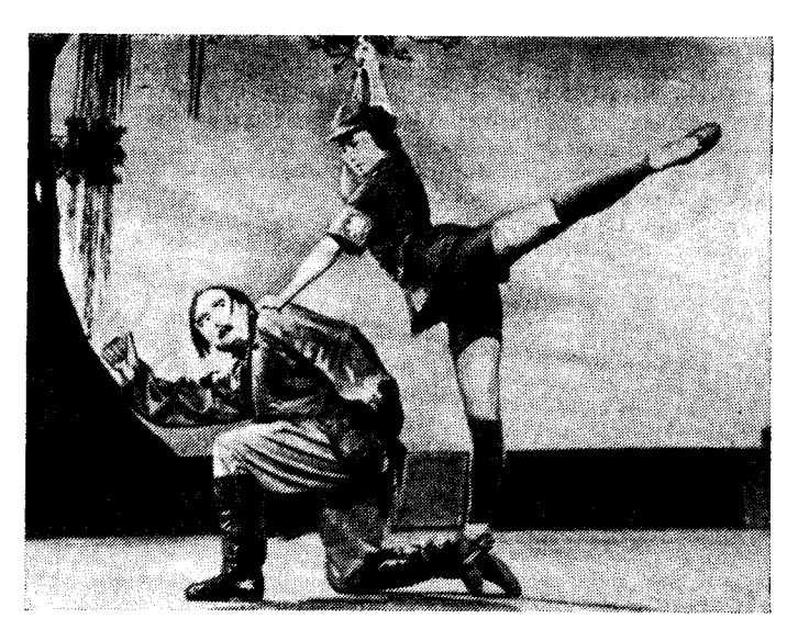
The Chinese theatre continues the Maoist chauvinistic and hegemonistic course in culture. Photo: A scene from the ballet glorifying victory over "Soviet revisionists".

Such "masterpieces" as "The Light of Red Lanterns" are found in galore on the Chinese stage. Take, for instance, the opera, "Oulei Yilan". The unseemly aim of its creators was, by means of operatic art, to impregnate some basic concepts of contemporary Chinese historians who are attempting to "substantiate" somehow the Maoists' absurd territorial claims made to areas in the Soviet Far East and Central Asia, and distort the history of Russian-Chinese and Soviet-Chinese relations. Probably, realizing that their arguments in favour of the territorial claims are unconvincing, the authors make up for this loss by issuing highly emotional bellicose cries for a crusade against the Soviet Union.