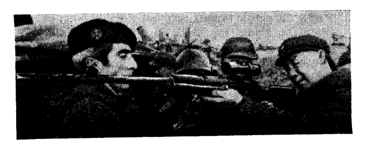
Photo: Peking's buyers on the capitalist countries' military technology market.

Over recent years China has spent about 10,000 million dollars on the purchase of foreign military technology.