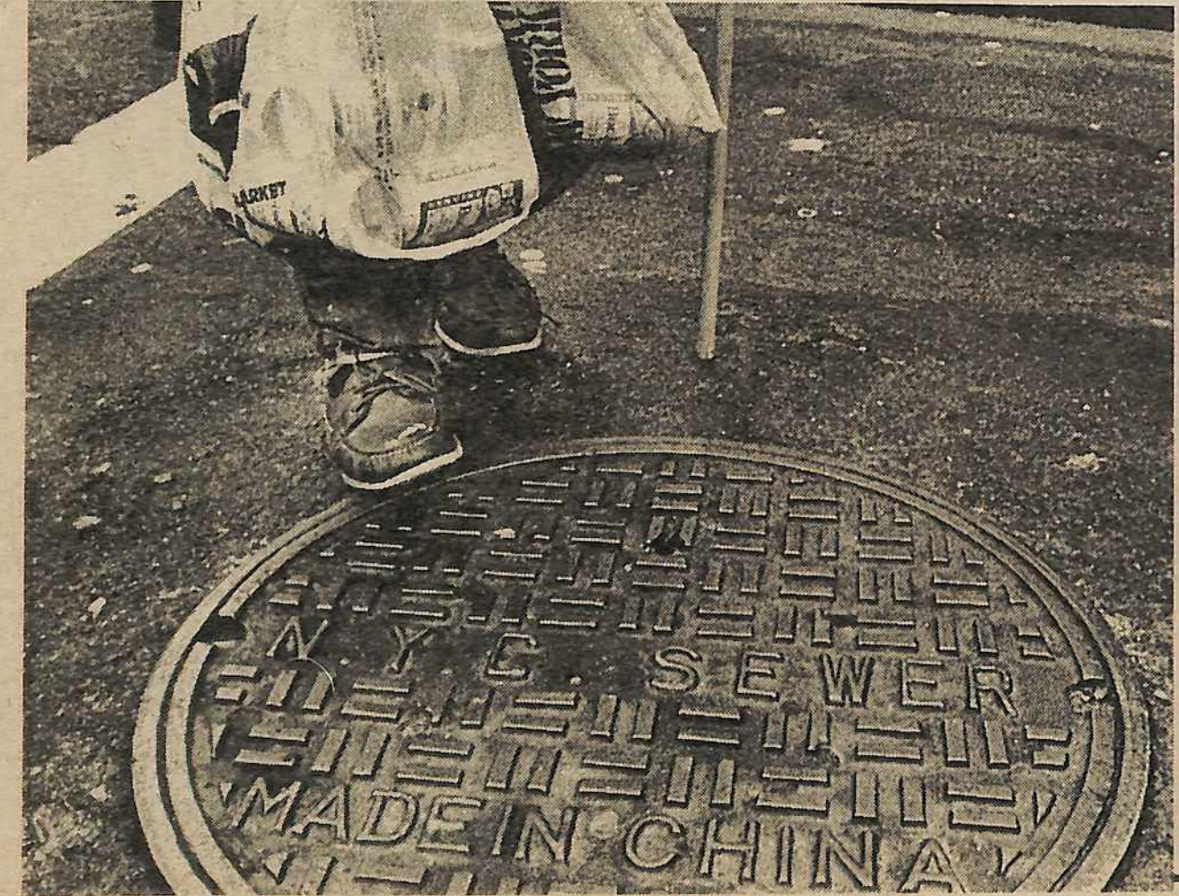
Homeless woman and New York City sewer cover made in China.

ism. Speculation was getting out of hand. The government responded with a program to slow down the economy and regain more central control. But this has only led to more speculation and unauthorized financial activities at the local levels and to new difficulties. For instance, because of the tightening up of the money supply, the government has not been able to pay peasants the full contract price for grain. As a result of government cuts in investment, the official rate of unemployment has jumped to 15 percent, and real unemployment is much higher. Inflation is now running at about 30 percent. Chaotic reform has been followed by chaotic retrenchment.