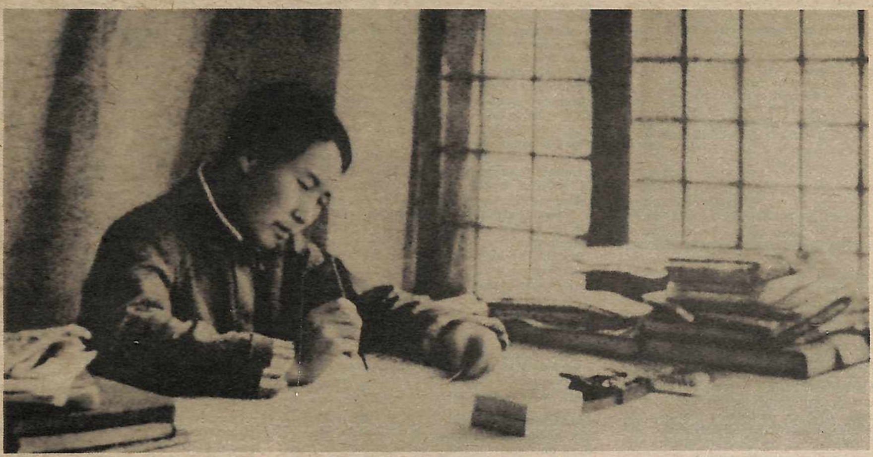
Mao in Yenan where he wrote On Practice and On Contradiction.