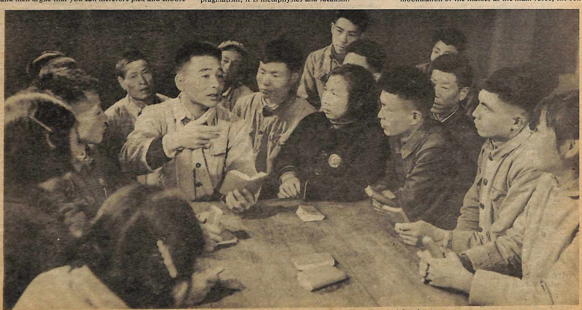
Mao not only contributed greatly to the development of Marxist philosophy; he laid particular stress on the need for the masses of people to study and apply philosophy. Above, peasants meet to discuss Marxist philosophy during the Cultural Revolution.

Both of these erroneous tendencies were incapable of recognizing the dialectical unity between the present stage (or sub-stage) of the struggle and its future development. The dogmatists generally refused to recognize the necessity of proceeding through the anti-Japanese united front to the completion of the newdemocratic revolution and the advance to socialism, or they posed "left" policies that would wreck the united front (though at certain points many of them dogmatically applied in China the policies of the Soviet Union toward Chiang Kai-shek and advocated reliance on and capitulation to the Kuomintang in the anti-Japanese struggle). The empiricists generally failed to recognize the aspects of the future that existed within the stage of the anti-Japanese struggle-the mobilization of the masses as the main force, the con-