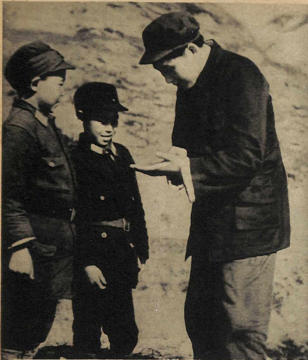
Mao talks with young fighters of the Eighth Route Army in Yen-an in 1939.