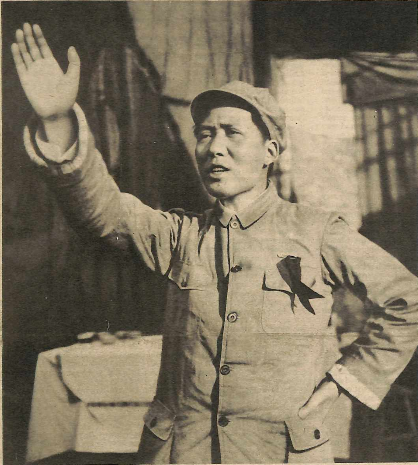
Mao Tsetung addresses a meeting marking the third anniversary of the founding of the Chinese People's Anti-Japanese Military and Political College in Yen-an in 1939.