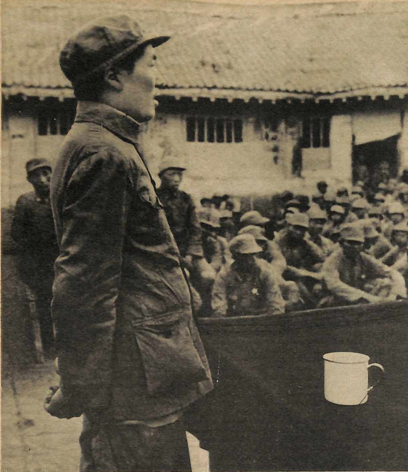
Mao Tsetung delivers the report "On Protracted War" at the Chinese People's Anti-Japanese Military and Political College in May, 1938.