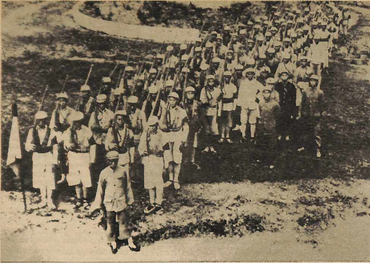
A contingent of Red Army troops at the Kiangsi base in 1931 before the Long March.