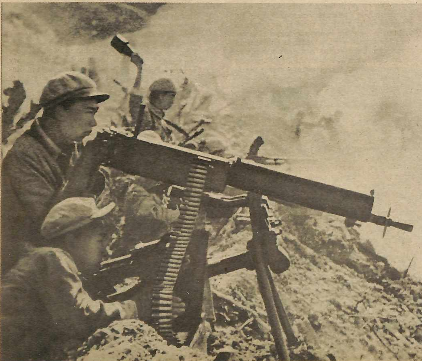
Chinese People's Volunteers unit during Korean War defends a position against U.S. invaders attack.

Down to the very end Mao Tsetung not only continued to champion and support revolution in China but also the revolutionary struggles of the peoples of the world. And it can be clearly seen that Mao Tsetung's overall analysis and basic line and theory on the question of warfare, as on other questions, is a powerful weapon for the revolutionary people in all countries and has enduring and universal significance, though its concrete application may differ from country to country. On the question of warfare and military line, as on other questions, Mao Tsetung has made truly immortal contributions to the revolutionary struggle of the working class and oppressed peoples throughout the world and to the cause of communism. ■