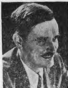
FOR PRESIDENT EARL BROWDER

EARL BROWDER was born May 20, 1891, in Wichita, Kansas, of early Virginia pioneer stock, his grandfather having fought in the War of 1812. At fifteen he was already an active trade unionist and a member of the Socialist Party. In 1917 he was sentenced to Leavenworth prison for opposing America's entry into the imperialist World War. Since 1919, when he joined the Communist Party, he has played an increasingly important role in the struggles of the American people to win a better life, working closely with William Z. Foster from 1921 to 1926 in the campaign for a Labor Party and for amalgamation of the craft unions of the A. F. of L. In 1930 he became General Secretary of the Communist Party and has served in that capacity ever since.