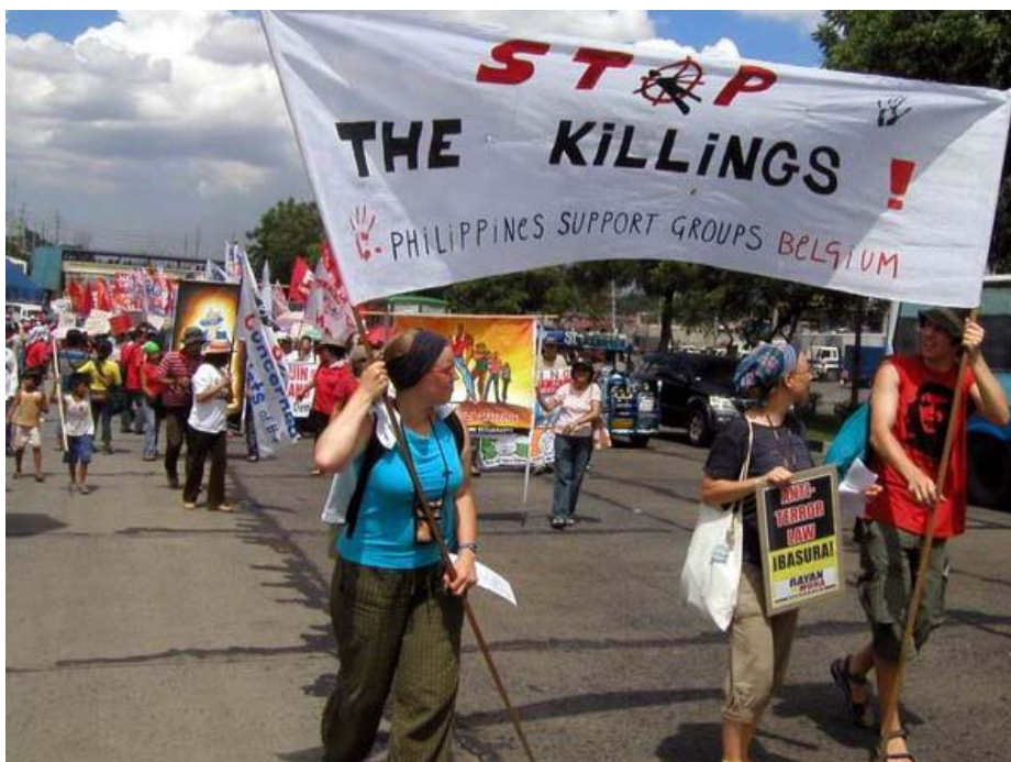
Foreign friends and comrades joined the massive demonstration in Manila on 23 July 2007 dubbed the "People's SONA", to expose the lies of US-puppet president Gloria Arroyo in her State of the Nation Address (SONA).

To better understand the hardships they go through every day, we decided to join some peasants in planting rice. After just a