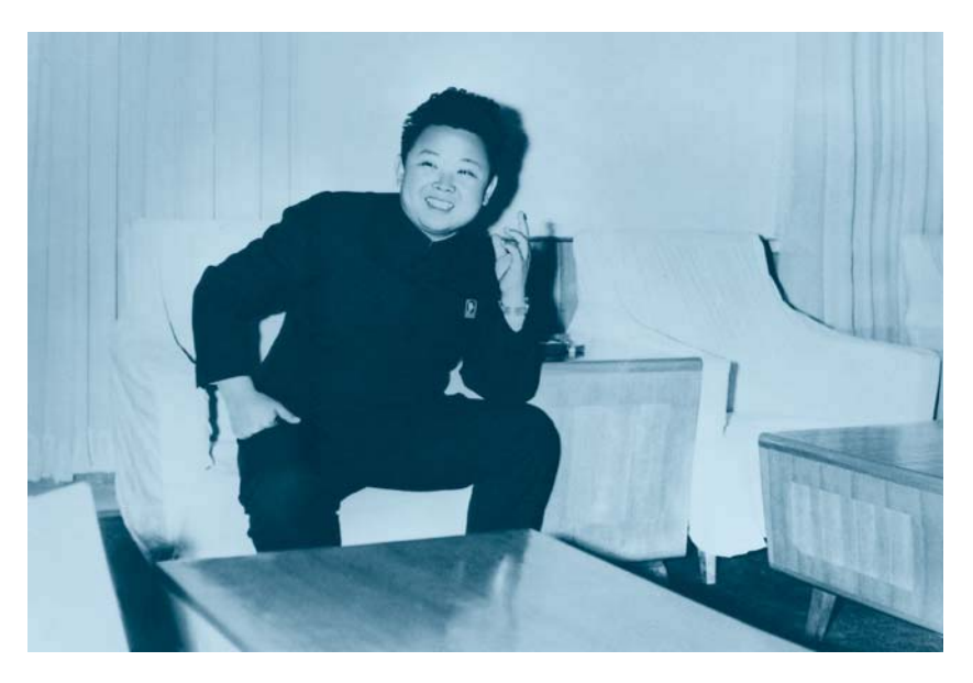
\begin{tabular}{ll} Kim Jong II guiding the production of the revolutionary opera, \\ \it The Sea of Blood \end{tabular}