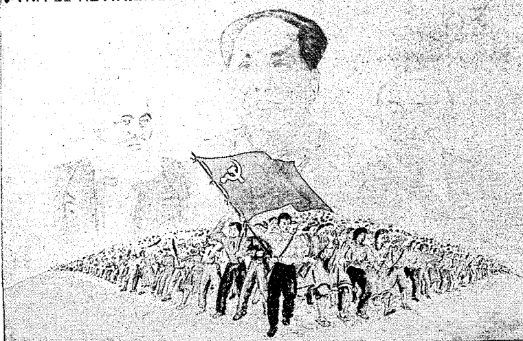
"Long Live the Revolutionary Internationalist Movement!" Painting done by political prisoners in Peru before the "Day of Heroism" in 1986, when 300 were killed by government troops.

What follows is a list of some People's War actions in Peru from January to early June 2001 reported in the Peruvian local and national reactionary press. It was compiled by the editors of Red Sun , a publication of supporters of the PCP abroad, and has been slightly edited for publication here. The superscript number following each action refers to the location of the action on the accompanying map. -AWTW