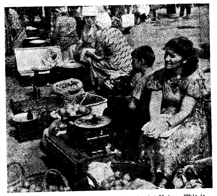
Free markets grow everywhere in the Soviet Union. This is a glimpse of a free market on the coast of the Black Sea.

rely on the supplies of the free markets for their nonstaple food. Free market potatoes in some regions and cities make up 80 per cent of the local supplies, vegetables 70 per cent, eggs 50 per cent and meat 40 per cent.