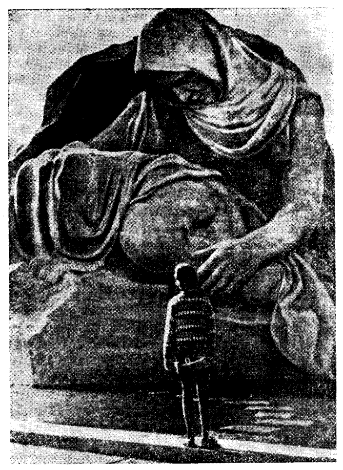
Sculpture of a "distressed mother" on the "Monument to the Heroes" who fell in the Battle of Stalingrad.