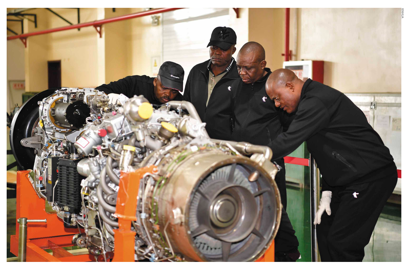
Angolan technicians observe an aircraft engine at a maintenance workshop of Avic Xi'an Aircraft Industry Co. Ltd. in Xi'an, northwest China's Shaanxi Province, on April 16