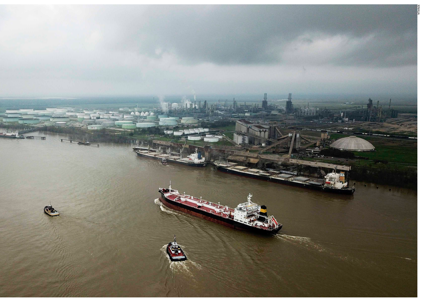
An aerial view on March 2 shows the Port of South Louisiana, which used to be a major U.S. port exporting soybean to China

enterprises will also have to bear higher prices for raw materials.