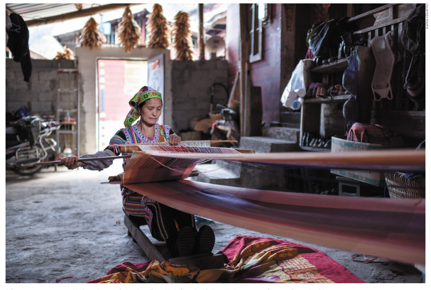
A \ Derung \ woman \ weaves \ a \ blanket \ at \ home \ in \ Dulong jiang \ Township \ in \ Gongshan \ Dulong-Nu \ Autonomous \ County \ in \ December \ 2017

dicinal herb, which is well-suited for the local climate