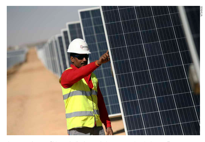
A man works on a Chinese-built photovoltaic power project in Aswan, Egypt, on March 18 \,

country, in the early stage of development, it does not make money but only burns money. Therefore, China has taken advantage of the adverse conditions of African countries' underdevelopment and lack of funds, and pretended to promise aid for construction, but in fact, while exporting excess capacity, it has pushed African countries into huge foreign debts. Once these countries are unable to repay, China will naturally and reasonably require them to make concessions.