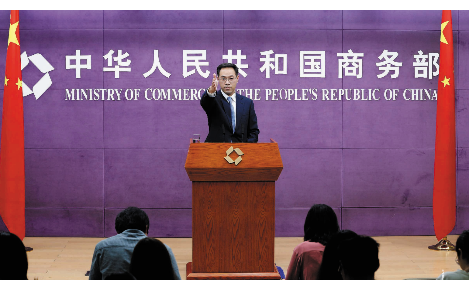
Gao Feng, Ministry of Commerce spokesman, clarifies China's stance at a press conference on June 13 in Beijing