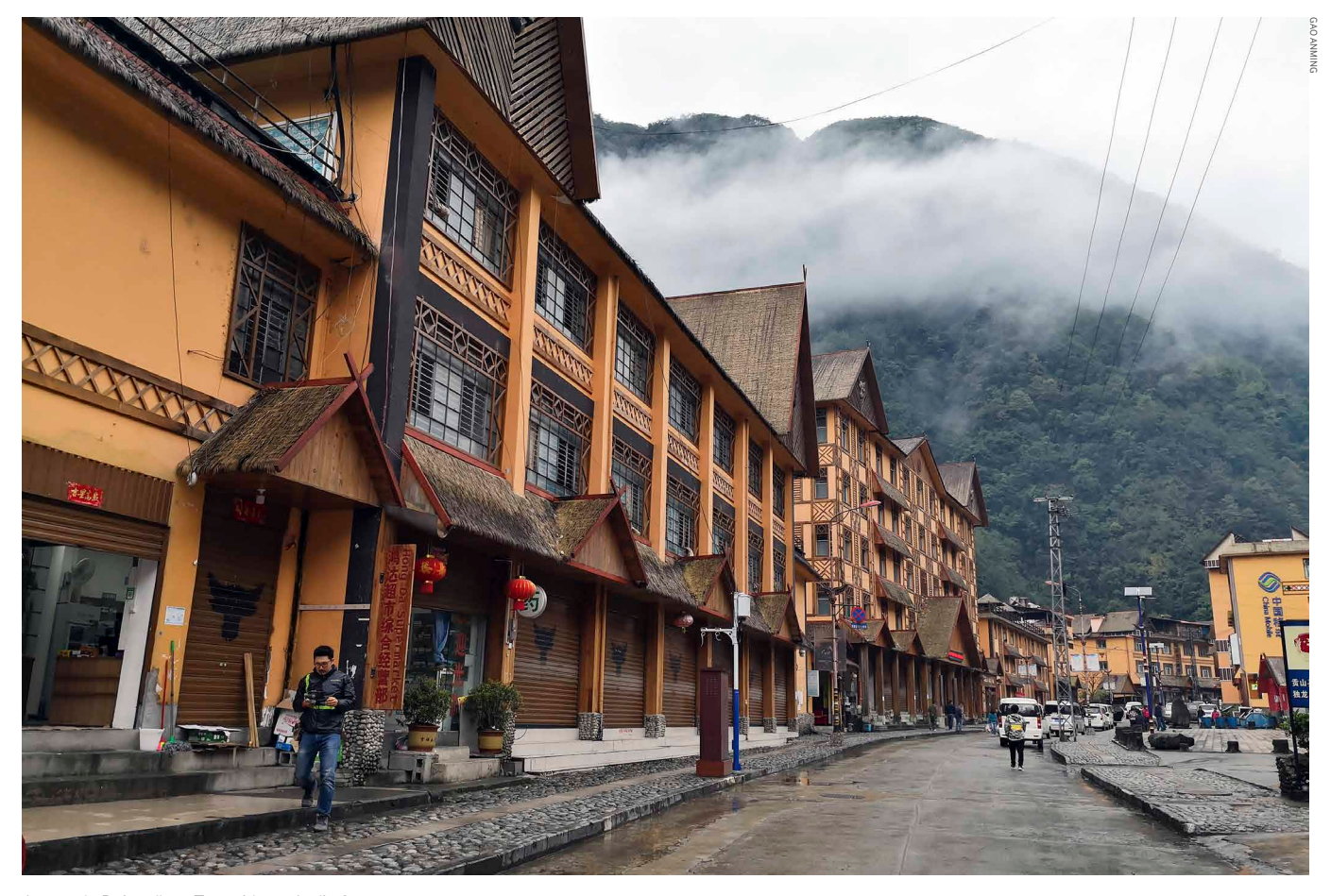
A street in Dulongjiang Township on April 18

In the early 2000s, a school covering six years of elementary and three years of secondary education was set up in the township. Children don't have to slide along a wire to attend schools further away anymore.