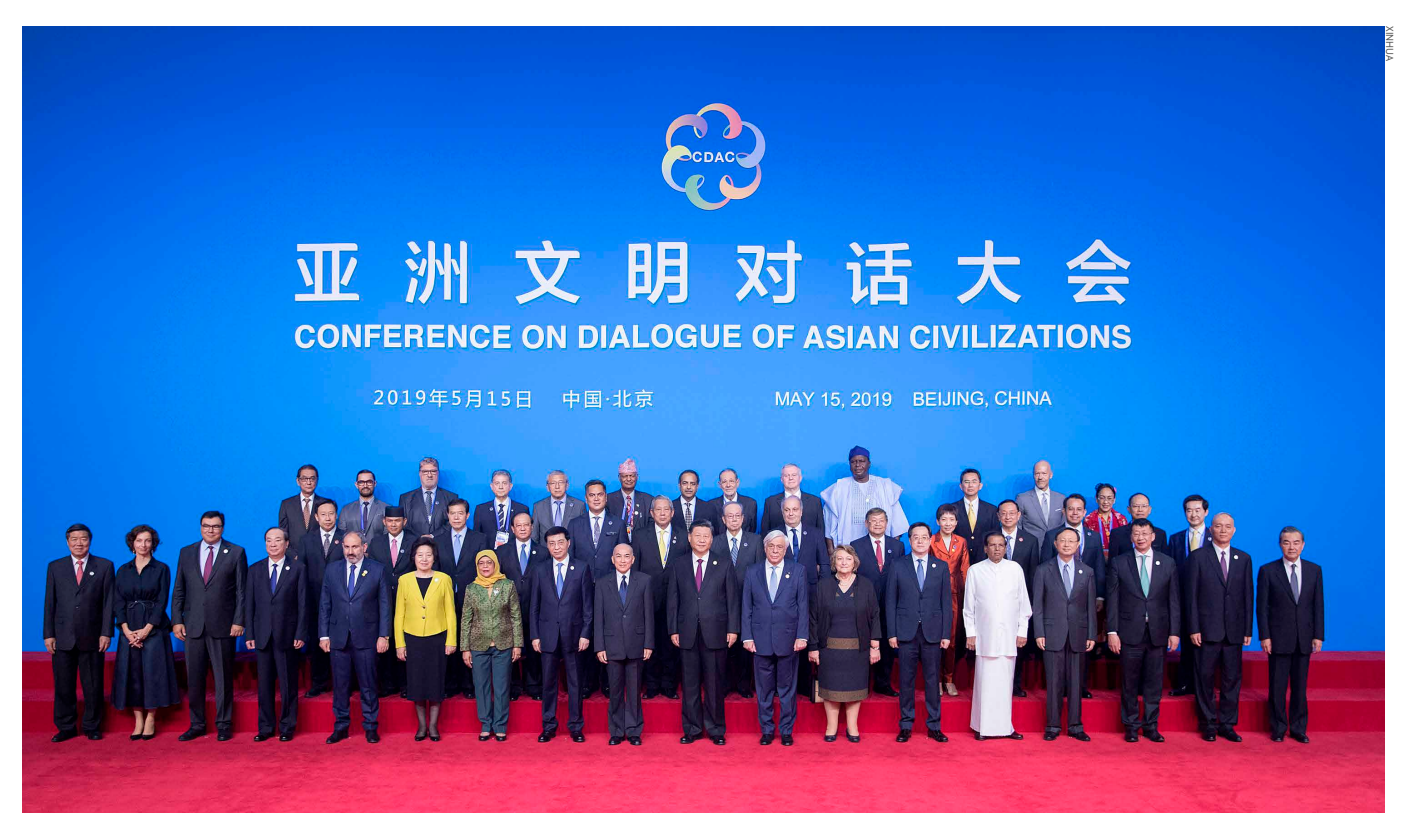
Chinese and foreign leaders pose for a group photo with some participants ahead of the opening of the Conference on Dialogue of Asian Civilizations in Beijing on May 15