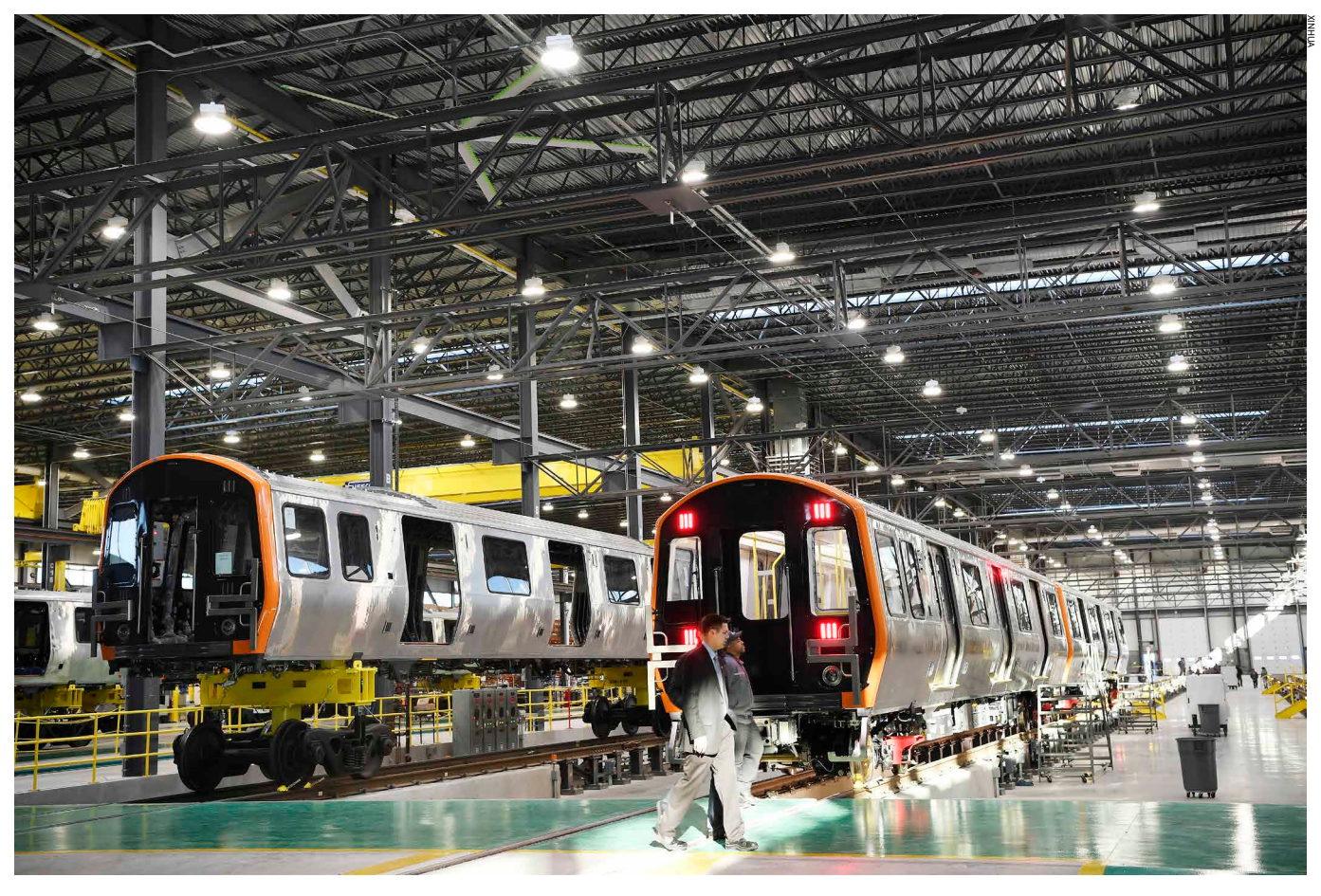
The photo taken on December 18, 2018, shows Chinese rail company CRRC's completed subway earmarked for delivery to the U.S. state of Massachusetts in the corporation's first North American plant in Springfield

the low-profit real economy to the financial sector for speculation.