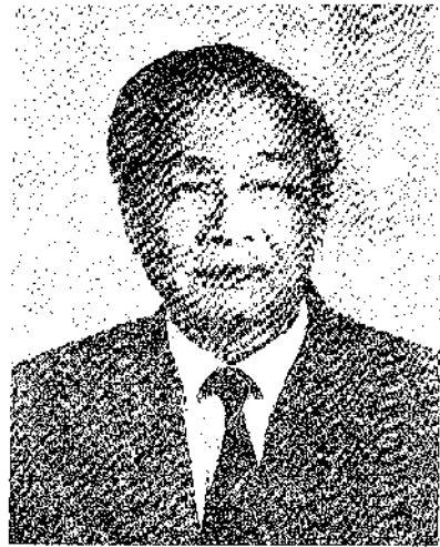
VÕ VĂN KIẾT