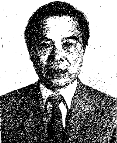
PHAN VĂN KHẢI