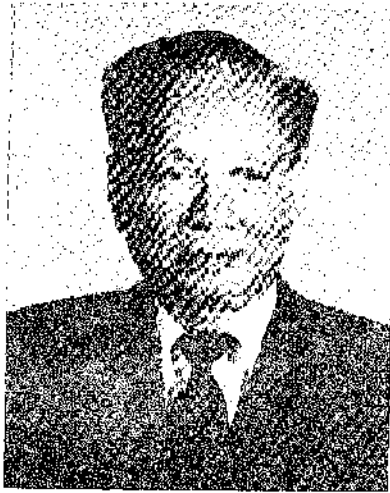
LÊ ĐỨC ANH