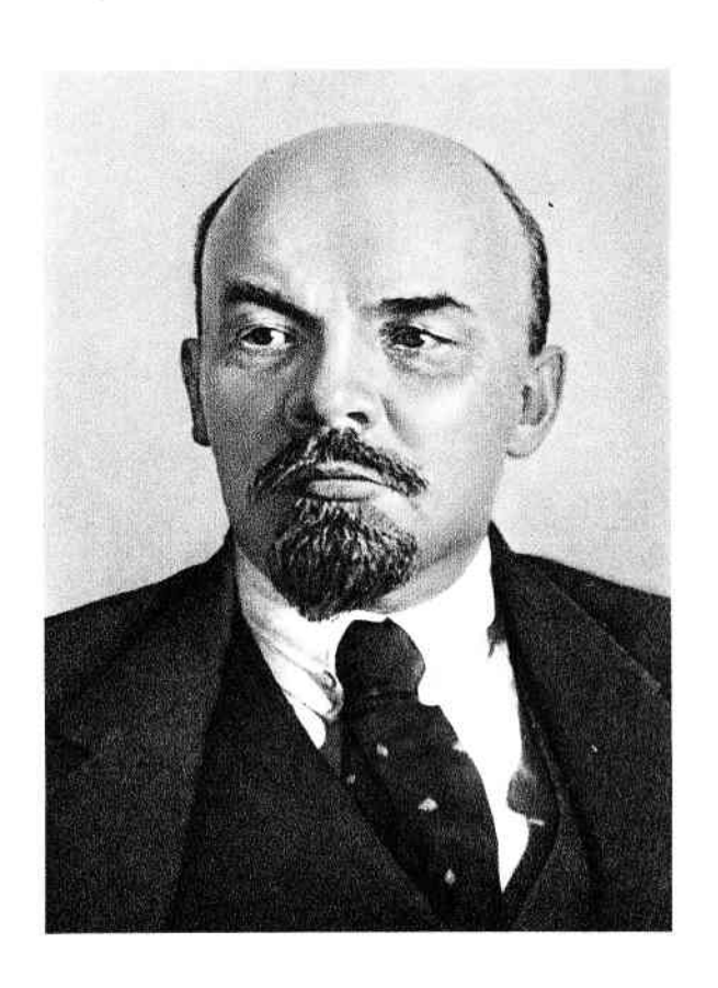
Mublud / Comm)