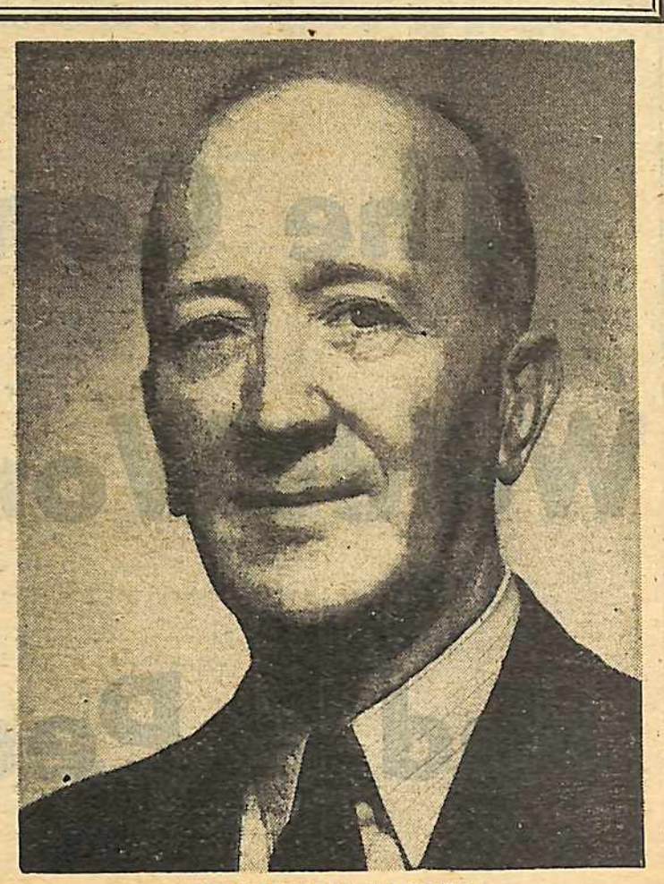
WILLIAM Z. FOSTER

f) The organized formation of a world peace movement which speaks for the majority of man-