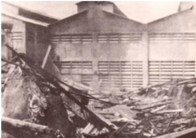
Burnt Shell of World Bank aided Cyntex Mill in Ratmalana

By seven in the evening, I received the news of the attack on the army. All Tamils started phoning each other – expecting the worst, but hoping for the best: At about 1 o'clock, on the morning of Monday, the 25th, I was woken by a telephone call from a Sinhalese friend telling me that Tamil houses in Rosmead Place were burning. It was the start of a nightmare that was to last for days.