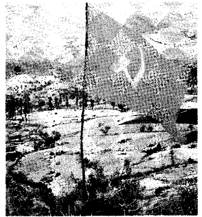
PCP flag in Peru

The U.S. government's "war on drugs" is not about stopping drug addiction; instead, it is a reactionary offensive aimed at intensifying repression of the proletariat and oppressed nationalities in the U.S., and defending the U.S.'s political and military interests in Latin America, including through stepped-up intervention against the people's war being led by the Communist Party of Peru.