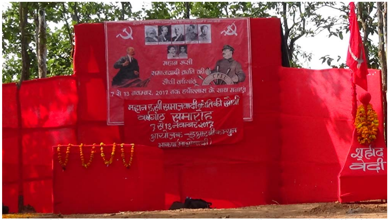
Centenary of the Great October Revolution celebrations in a guerrilla zone in Bihar-Jharkhand

and militarily defeating the ruling classes of not only Tsarist Russia but the alliance of fourteen imperialist powers, the victorious October Revolution demonstrated that that the armed proletariat led by the Communist Party and in alliance with the democratic classes can not only destroy the old state the reactionary classes and defend the Soviet state but can also build a new society by using this new state power. The name of October Revolution will remain etched in history forever as the first victorious proletarian revolution, the starting point for building socialism and a world socialist system.