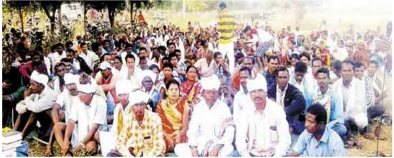
Masses protest against proposed police station in Dilmili village

An Ultra mega steel plant has been proposed in Dilmili village of Darbha block in Bastar district under the aegis of the comprador capitalists, for the security of which a police station there has already been sanctioned by the Indian government. But the