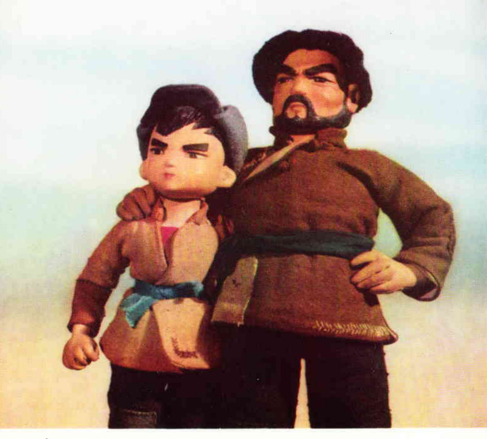
Struggle brings victory

The ruthless economic exploitation and political oppression of the peasants by the landlord class forced them into numerous uprisings against its rule.... It was the class struggles of the peasants, the peasant uprisings and peasant wars that constituted the real motive force of historical development in Chinese feudal society.