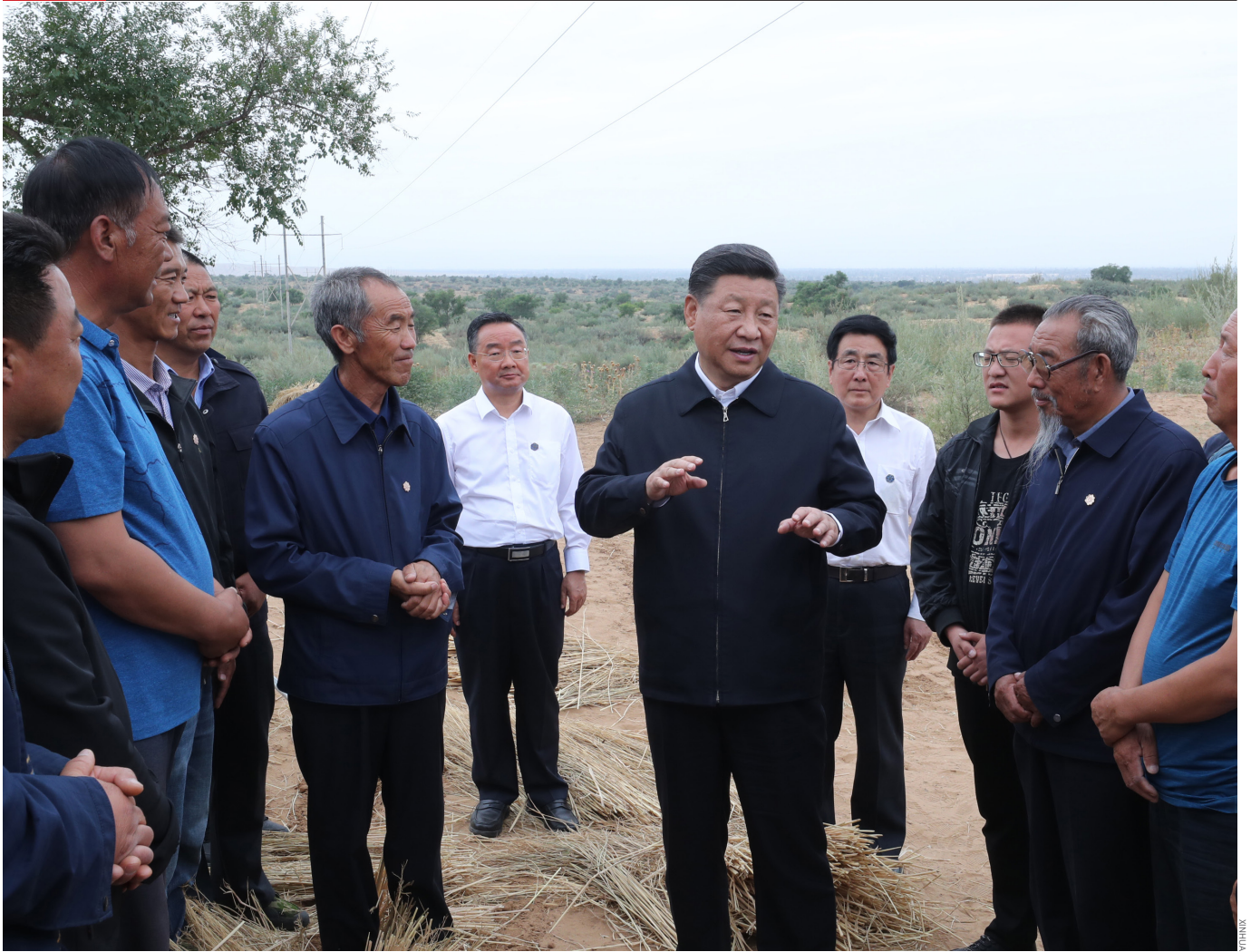
President Xi Jinping visits the Babusha Forest Farm in northwest China's Gansu Province on August 21