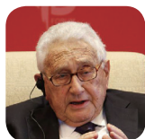
Henry Kissinger, former U.S. Secretary of State and National Security Advisor:

At a special session of the China Development Forum in Beijing on September 7, participants reviewed the history of China-U.S. relations and drew lessons for the two countries to conquer current difficulties and move the relationship forward. Edited excerpts of their views follow: