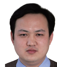
By Lan Xinzhen

Of course, there still remains a lot to be improved. But given time, human rights will make even greater headway. But probably even then, some people will continue to malign China's human rights situation since it is a political exercise for them, no matter what the truth is. C