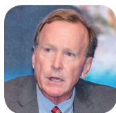
Neil Bush, founder and Chairman of the George H.W. Bush Foundation for U.S.-China Relations:

China and the United States are the two countries with the greatest capacity in terms of their technology, political experience and history to influence the progress and peace of the world. They have a different history and a different culture so that the challenge of cooperating is very great. Having had the opportunity to participate in the Sino-American relationship for 40 years, I believe strongly that both countries have a duty to the peace and progress of the world, to find means of cooperation to solve the important problems they have before them.