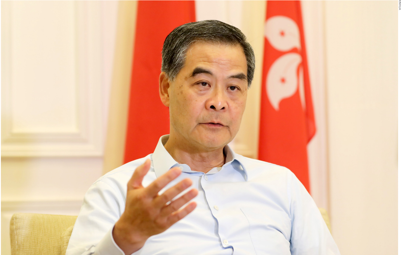
Leung Chun-ying, Vice Chairman of the National Committee of the Chinese People's Political Consultative Conference, speaks to reporters in Hong Kong on August 14. Leung urged Hong Kong residents to help bring radicals who blocked the airport and attacked a traveler and a reporter to justice

Hong Kong residents call for end of violence