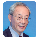
Zhang Baijia, former deputy head of the Party History Research Office of the Communist Party of China Central Committee:

Talks help avoid misjudgments and clarify each other's intentions. The Warsaw negotiations are an indication that China and the United States can find solutions through talks. I believe the two countries have the wisdom to deal with current problems.