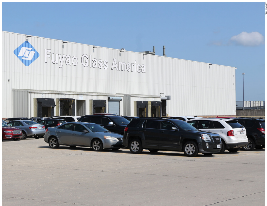
The Fuyao Glass America factory in Moraine, Ohio