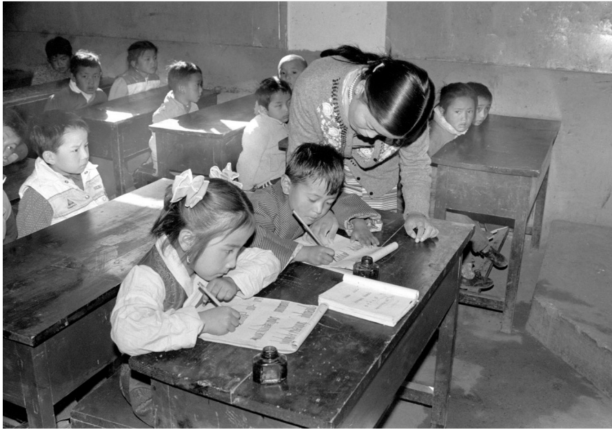
(Above) Primary school students learn the Tibetan script in Lhasa, southwest China's Tibet Autonomous Region, in 1991; A computer class at a primary school in Lhasa in July 2019