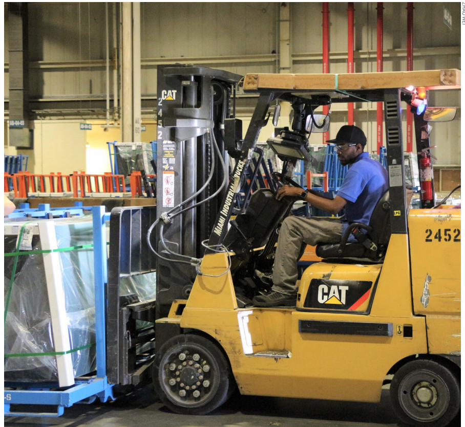
A worker drives a forklift at the Fuyao Glass America factory in Moraine, Ohio