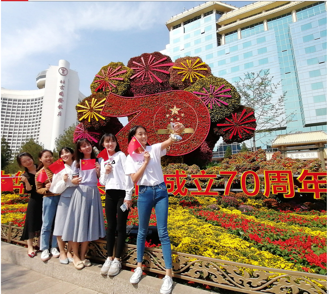
College students pose for photos with the national flag in front of a flowerbed in celebration of the 70th anniversary of the founding of the People's Republic of China in Beijing on September 23