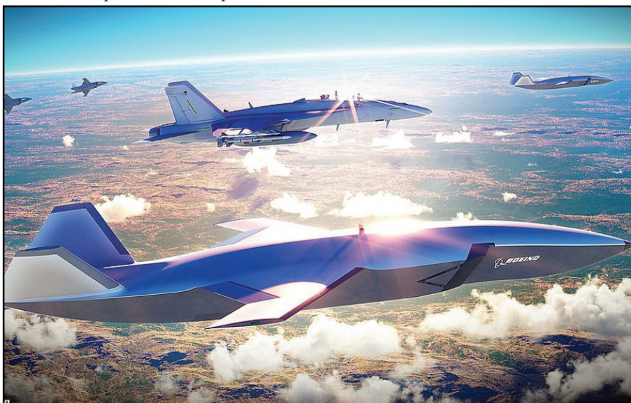
Australia's new Air Force: Loyal Wingman to US imperialism