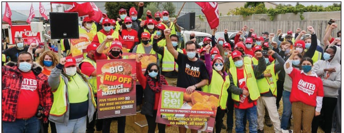
McCormick's workers win 3%, $5000 bonus and keep conditions after 6 weeks on strike!

The “independence” of such an agenda means precisely not being dependent on, and not thinking it is possible to rely on, Labor and its