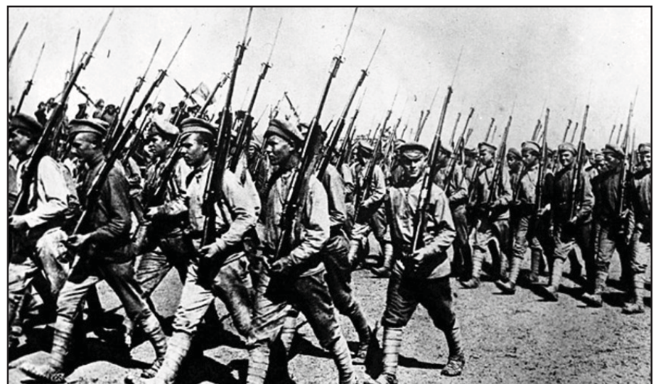
Red Army - Defending the Revolution

That is why the oppressed in the world will inevitably have to carry out two, three and more Octobers!