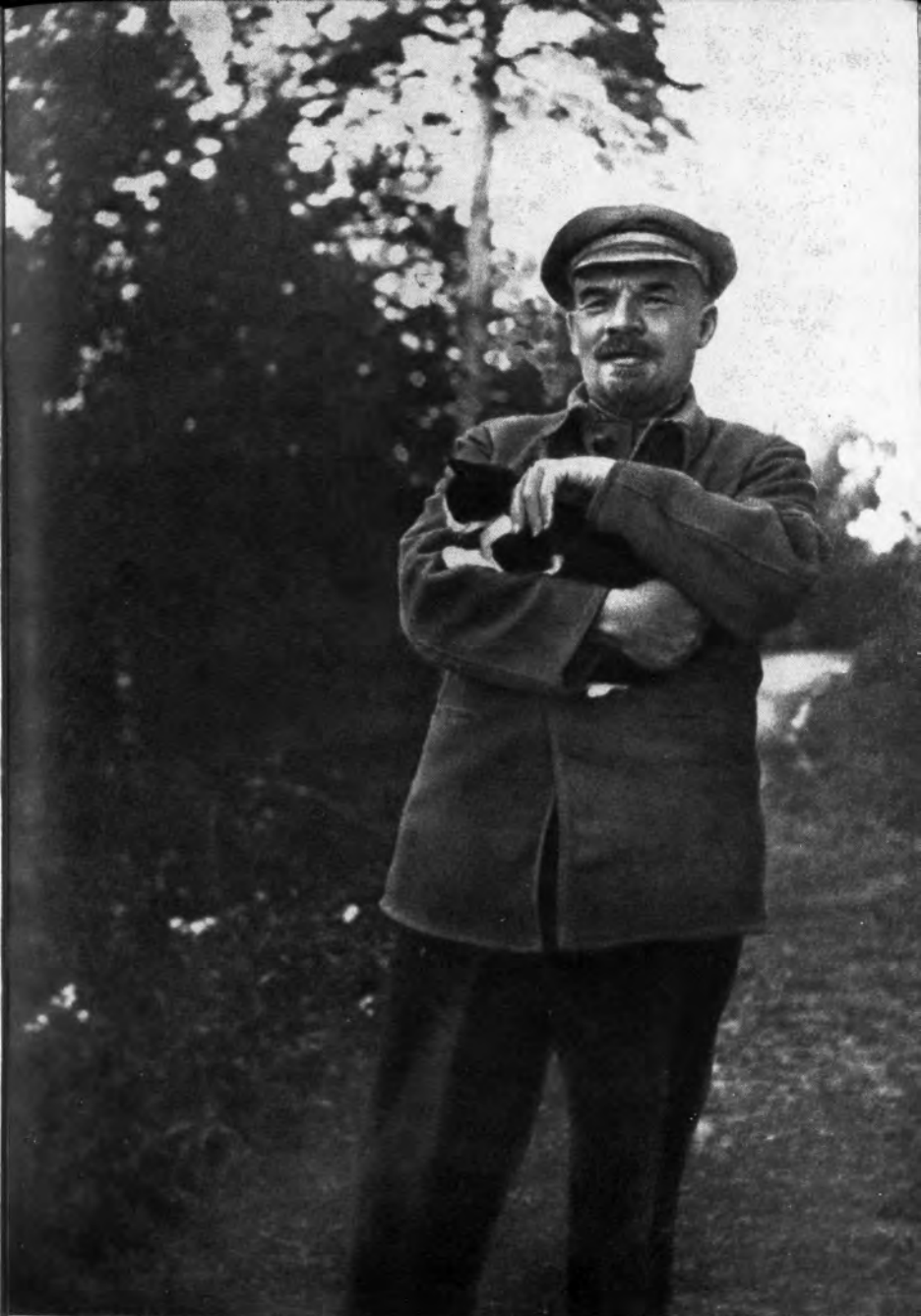
V. I. Lenin taking a stroll in Gorki. 1922