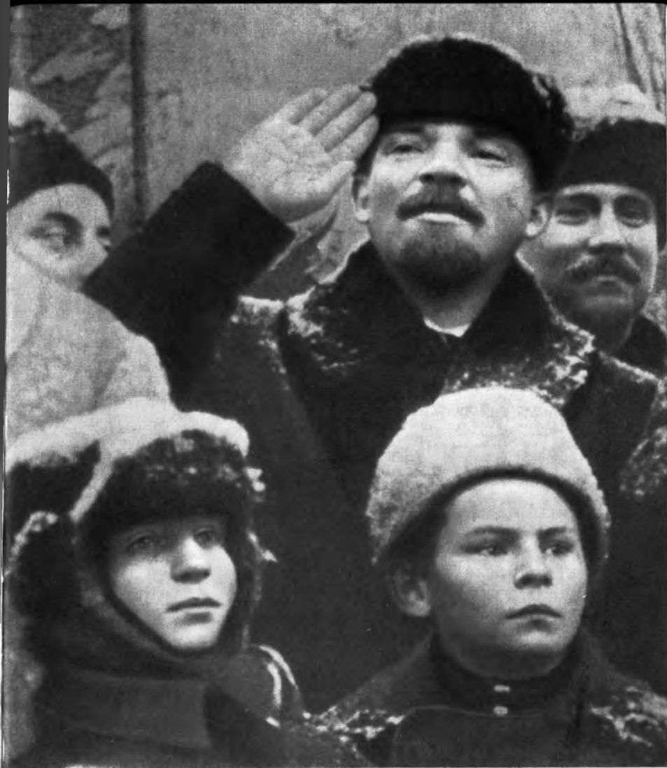
V. I. Lenin on the Red Square. November 7, 1919