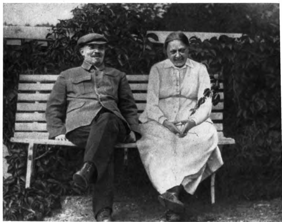
V. I. Lenin and N. K. Krupskaya in the garden in Gorki. August-September, 1922