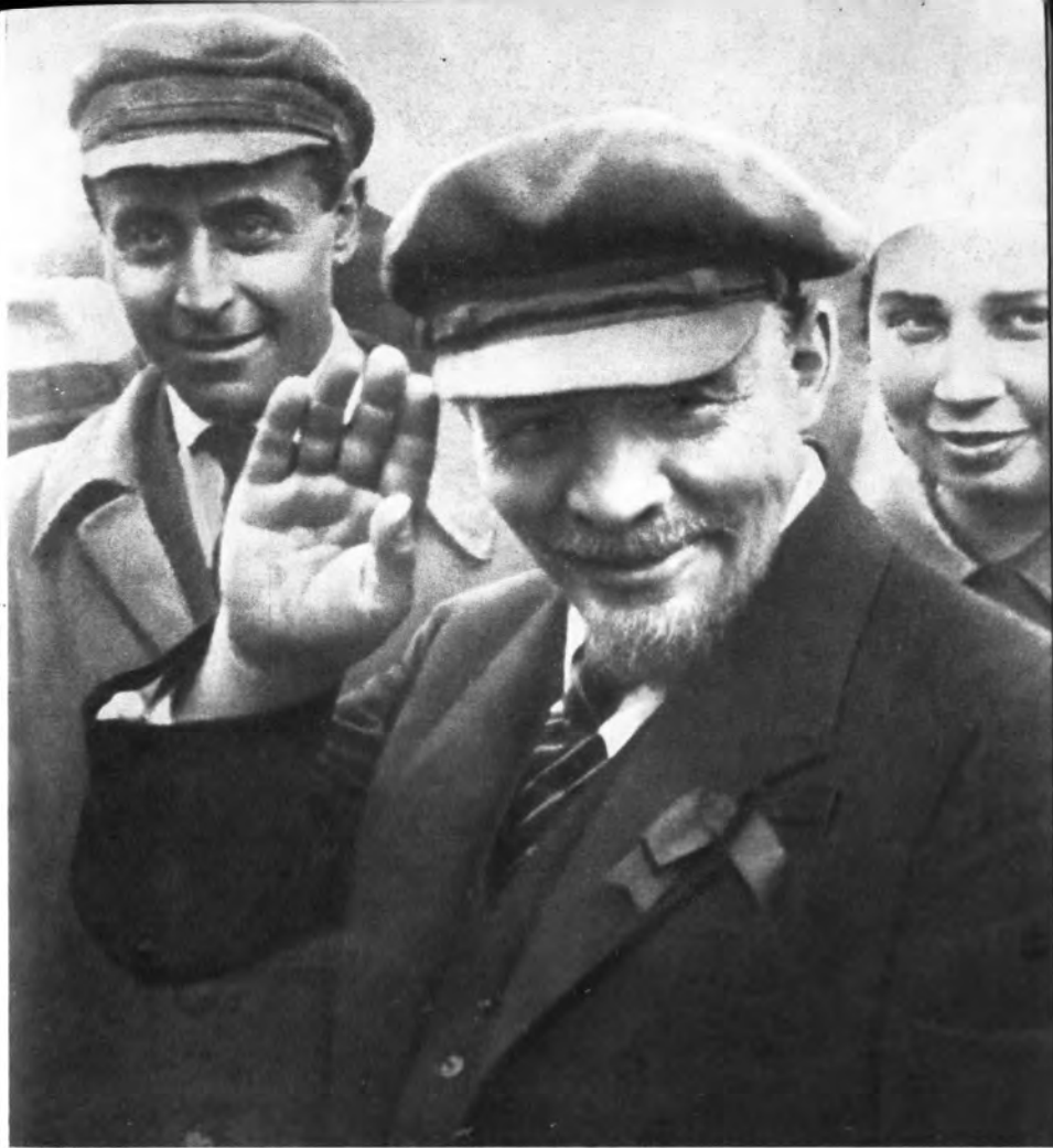
V. I. Lenin. A still. 1920