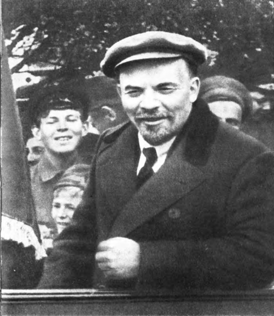
V. I. Lenin. A still. 1919