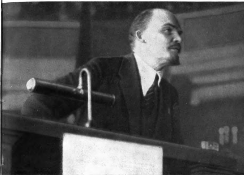
V. I. Lenin at the Second Congress of the Comintern. 1920