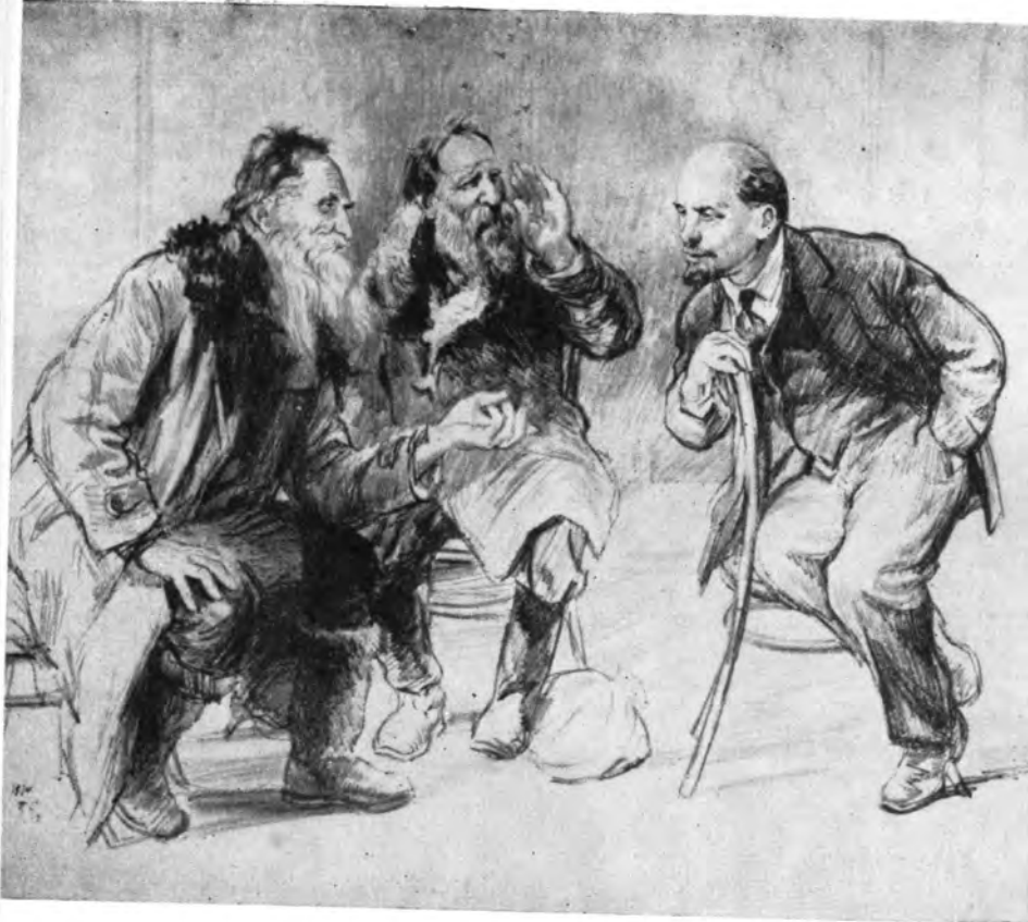
A heart-to-heart talk (drawing by N. Zhukov)