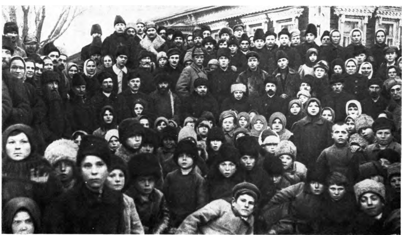
V. I. Lenin and N. K. Krupskaya among peasants of Kashino village, Moscow Gubernia. 1920