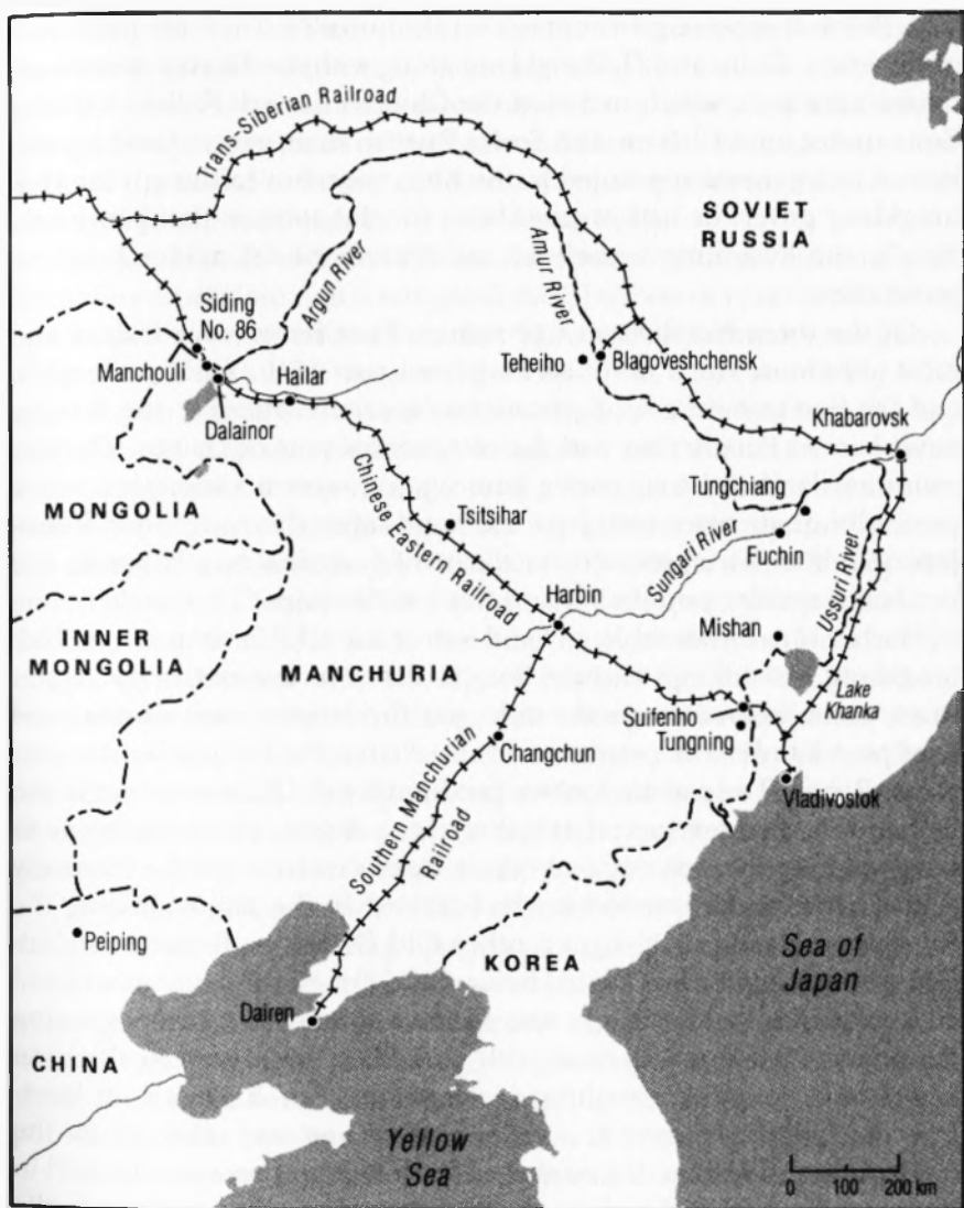
Map 1. Manchuria