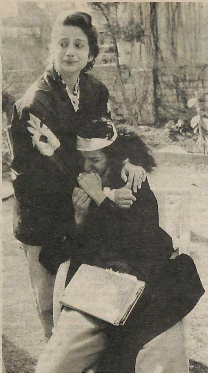
Iraqi women whose house was bombed.

In any case, the fact is that the massive campaign of outrage launched against Iraq