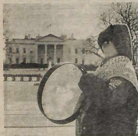
Drumming outside the White House.

ing on drums in Lafayette Park, across from the White House. Last month Bush had to admit that the protesters' drums were keeping him awake at nights. The police have set a limit of 60 decibels on the noise that can be made in the park—which would make even crows and seagulls illegal. The police have also physically attacked the drummers. One witness reported: "On February 9 I spent the afternoon in Peace [Lafayette] Park. I saw several incidents where the police would try to confiscate personal property or grab a drum because the drummer was resting or had forgotten to keep his drum off the ground. At one point I observed several police entering the park one at a time and standing separately at various distances. Then one policeman came in and lunged at one of the drummers, trying to take his drum away. When the drummer refused he was thrown to the ground and surrounded by many policemen. Another drummer was then thrown to the ground because he had tried to view the situation. The crowd responded by standing and trying to calm a very tense situation. We, the drummers, kept drumming and more or less 'walking' the police back to the gate to Pennsylvania Avenue. As I was standing there I was elbowed quite violently from behind and as I turned to respond to