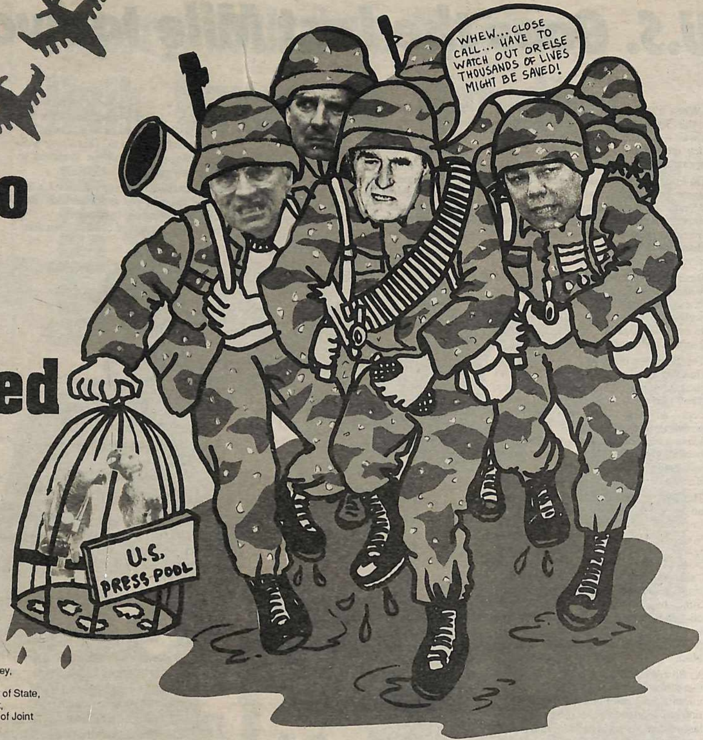
Left to Right: Dick Cheney, Secretary of Defense, James Baker, Secretary of State, George Bush, President, Colin Powell, Chairman of Joint Chiefs of Staff.

For a week the people of the world watched in horror as the U.S. president torpedoed a possible settlement of the Gulf war. Then on Saturday, February 23, the U.S. launched a massive air-land assault on Iraqi forces in Kuwait and southern Iraq.