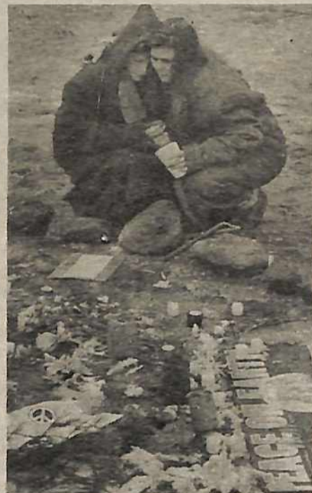
Amherst site where anti-war protester set himself on fire.

ing on drums in Lafayette Park, across from the White House. Last month Bush had to admit that the protesters' drums were keeping him awake at nights. The police have set a limit of 60 decibels on the noise that can be made in the park—which would make even crows and seagulls illegal. The police have also physically attacked the drummers. One witness reported: "On February 9 I spent the afternoon in Peace [Lafayette] Park. I saw several incidents where the police would try to confiscate personal property or grab a drum because the drummer was resting or had forgotten to keep his drum off the ground. At one point I observed several police entering the park one at a time and standing separately at various distances. Then one policeman came in and lunged at one of the drummers, trying to take his drum away. When the drummer refused he was thrown to the ground and surrounded by many policemen. Another drummer was then thrown to the ground because he had tried to view the situation. The crowd responded by standing and trying to calm a very tense situation. We, the drummers, kept drumming and more or less 'walking' the police back to the gate to Pennsylvania Avenue. As I was standing there I was elbowed quite violently from behind and as I turned to respond to