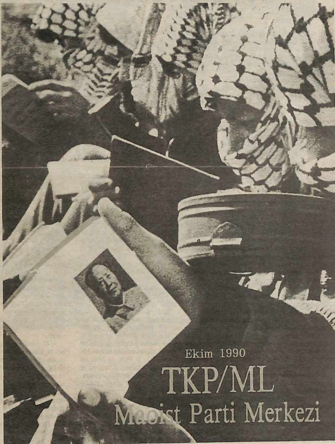
This poster was put out by TKP/ML Maoist Party Center, an organization of Maoist revolutionaries from Turkey. It says: "People of the Middle East: Unite and Destroy the Imperialists and Their Lackeys with People's War."

The following are excerpts of a statement the RW received from the Information Bureau of the Revolutionary Internationalist Movement: