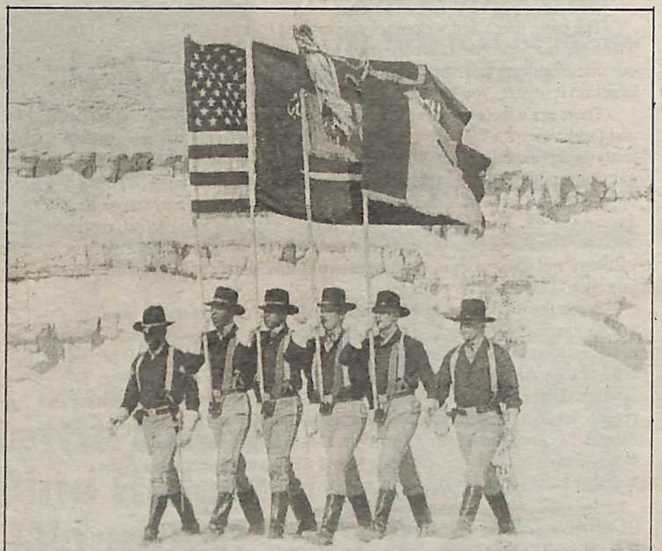
1990—The U.S. cavalry in Saudi Arabia. For ceremonial occasions, the cavalry still uses uniforms designed like those worn while they massacred the Indians. In fact, the U.S. military currently refers to the land separating U.S. and Iraqi forces as "Indian country"!