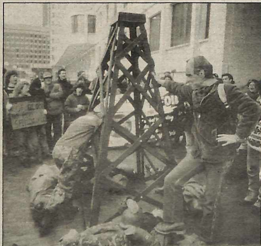
Anti-war demonstration in Boston.

This Yellow Ribbon Is Soaked In The Blood of Iraqi People