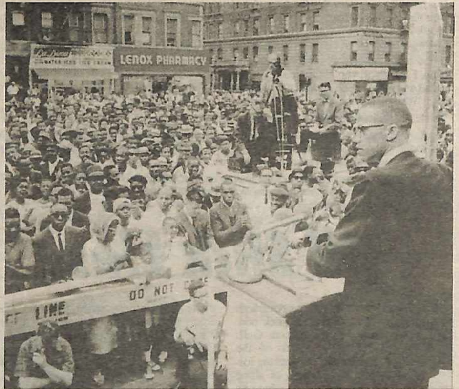
Malcolm X addresses Harlem crowd in the early 1960s.

From Malcolm X's speech, "The Homecoming Rally of the OAAU" (Organization of Afro-American Unity), November 29, 1964, published in the book Malcolm X, By Any Means Necessary