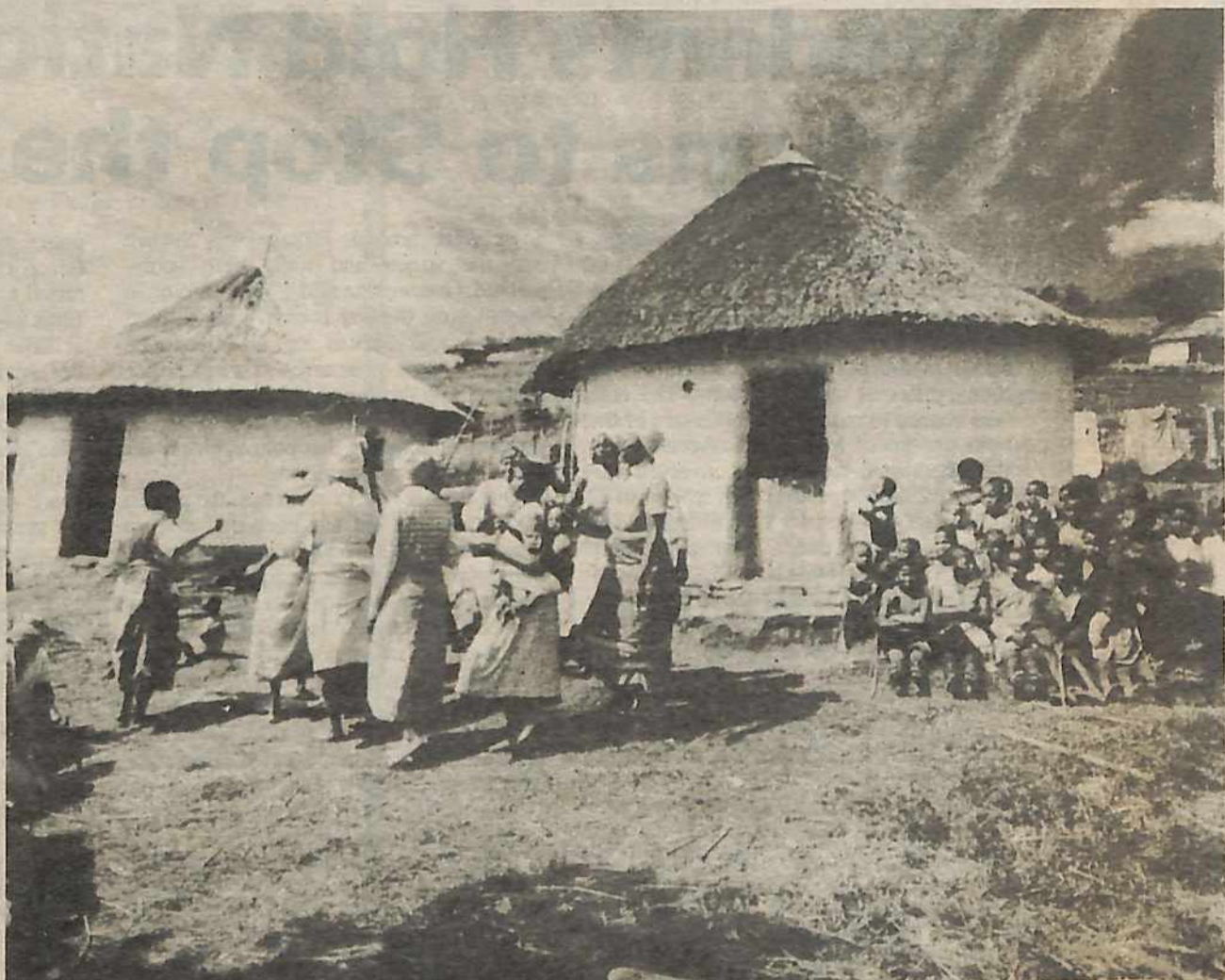
A village in the countryside.

"I am in the process of mobilizing people into the movement myself. I want to fight the revolution and I will only go with those who also do this. I have been involved in the struggle from way back. I can't really remember but I think it was four years and I am now 17 years of age. But for most of that time I have not been in structures. We would have meetings to discuss the situation and to make our plans but we had no organization. We would always toyi-toyi to the meetings and toyi-toyi from the meetings. Sometimes we would even raise the banner of the ANC because that is all we knew and system said we could not raise that banner so we said that we must raise it. It is only now I am coming to know of Mao, only since meeting these comrades here."