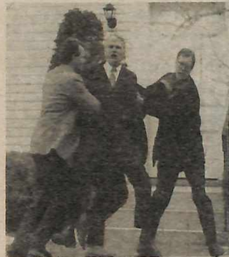
Busted at Bush's church.

The powers are trying to deal with anti-war protesters in two ways. One is to use their media to black out or play down the opposition while putting the spotlight on the pro-war forces. The other is to use violent police suppression against those