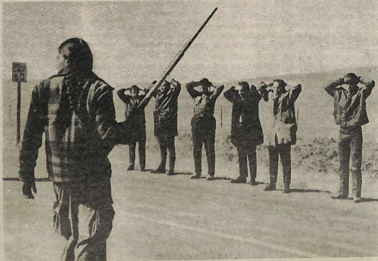
Wounded Knee, 1973—Indian guards four U.S. government agents and two farmers.

AIM's influence on the reservation threatened to jeopardize the mining in the