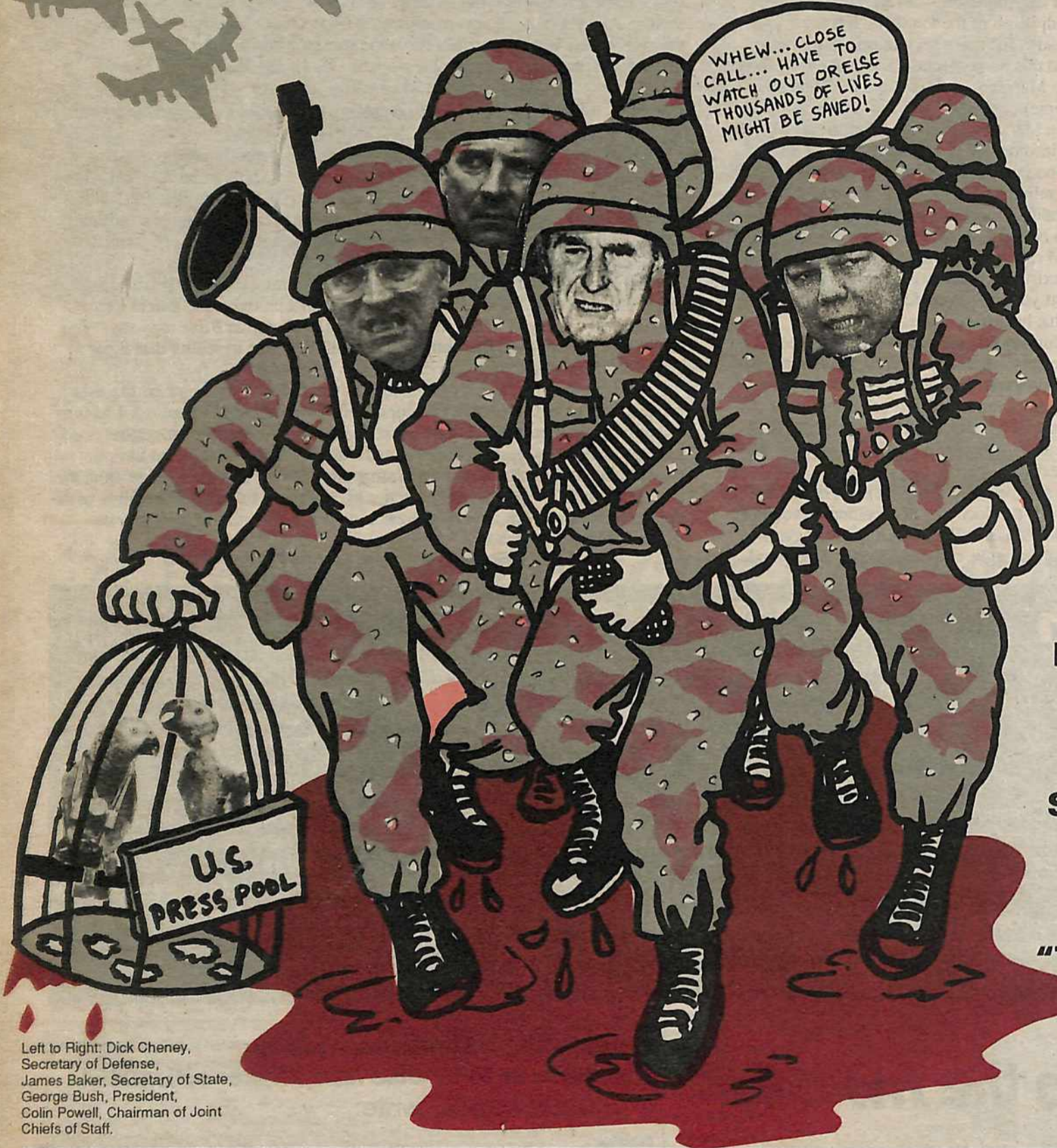
Left to Right: Dick Cheney, Secretary of Defense, James Baker, Secretary of State, George Bush, President, Colin Powell, Chairman of Joint Chiefs of Staff.