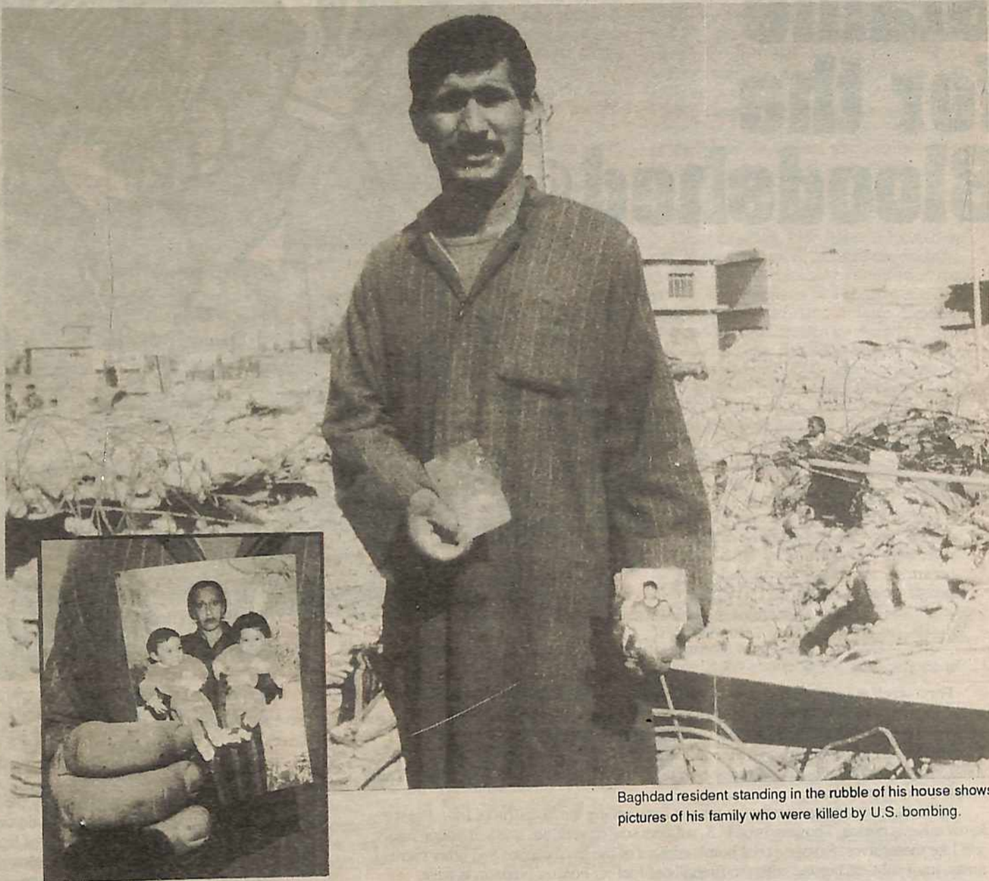
Baghdad resident standing in the rubble of his house shows pictures of his family who were killed by U.S. bombing.

In fact, by the time the Saturday noon deadline came, the U.S. ground war was already underway. □