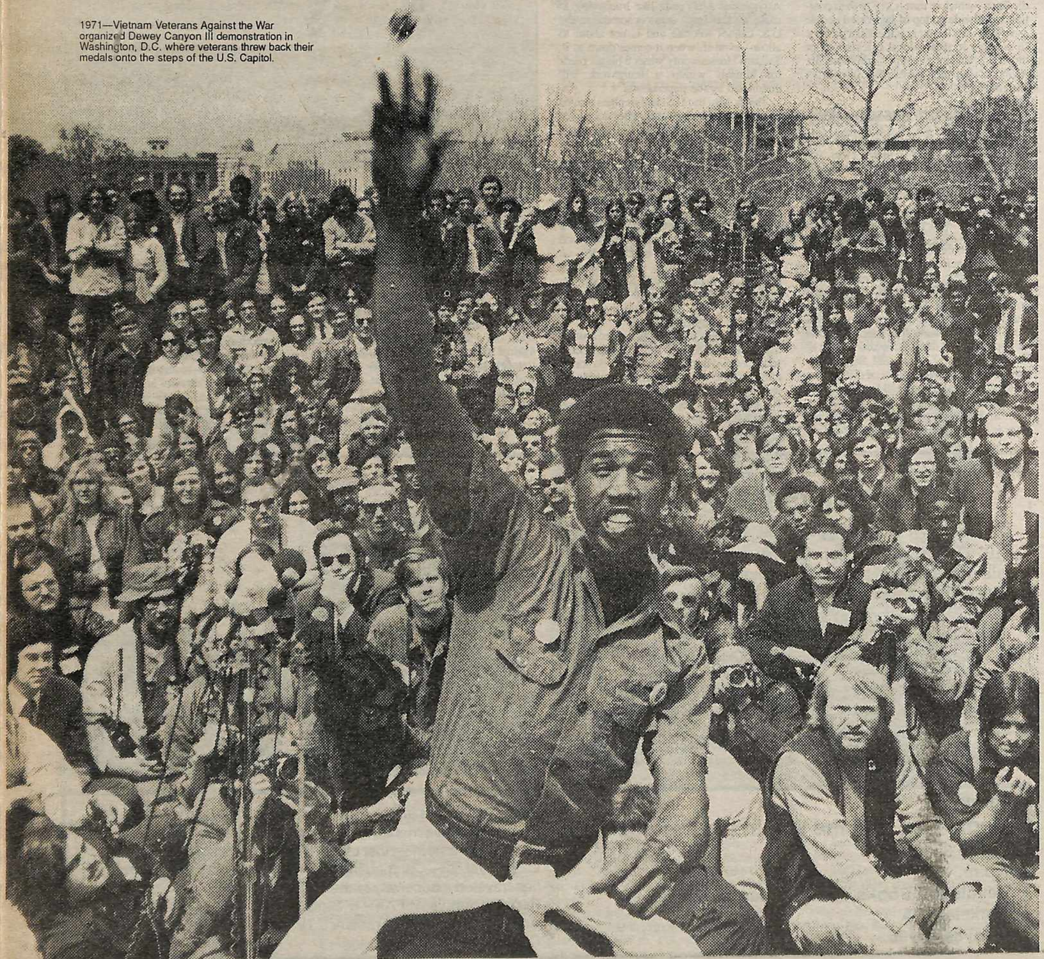
1971—Vietnam Veterans Against the War organized Dewey Canyon III demonstration in Washington, D.C. where veterans threw back their medals onto the steps of the U.S. Capitol.

Secretary of State Baker told front line troops in Saudi that they will "return with honor and dignity." The ones returning now are coming home in body bags wrapped in American flags and the brass tell the grieving families that they should be proud. This is pure bull!! The nightmares of Vietnam vets are filled with the horrible realization that we were nothing but puppets for the Powers in an unjust war. There is no dignity in dying as a chump cannonfodder for the rich and the powerful. And there for sure is NO honor in bombing and killing the basic people of another country. You must take a hard look at reality. Hard as it may be to own up to it, you are being used as cannonfodder for a brutal system. DON'T BELIEVE THE HYPE!!!!!! FIGHT THE POWER!!!