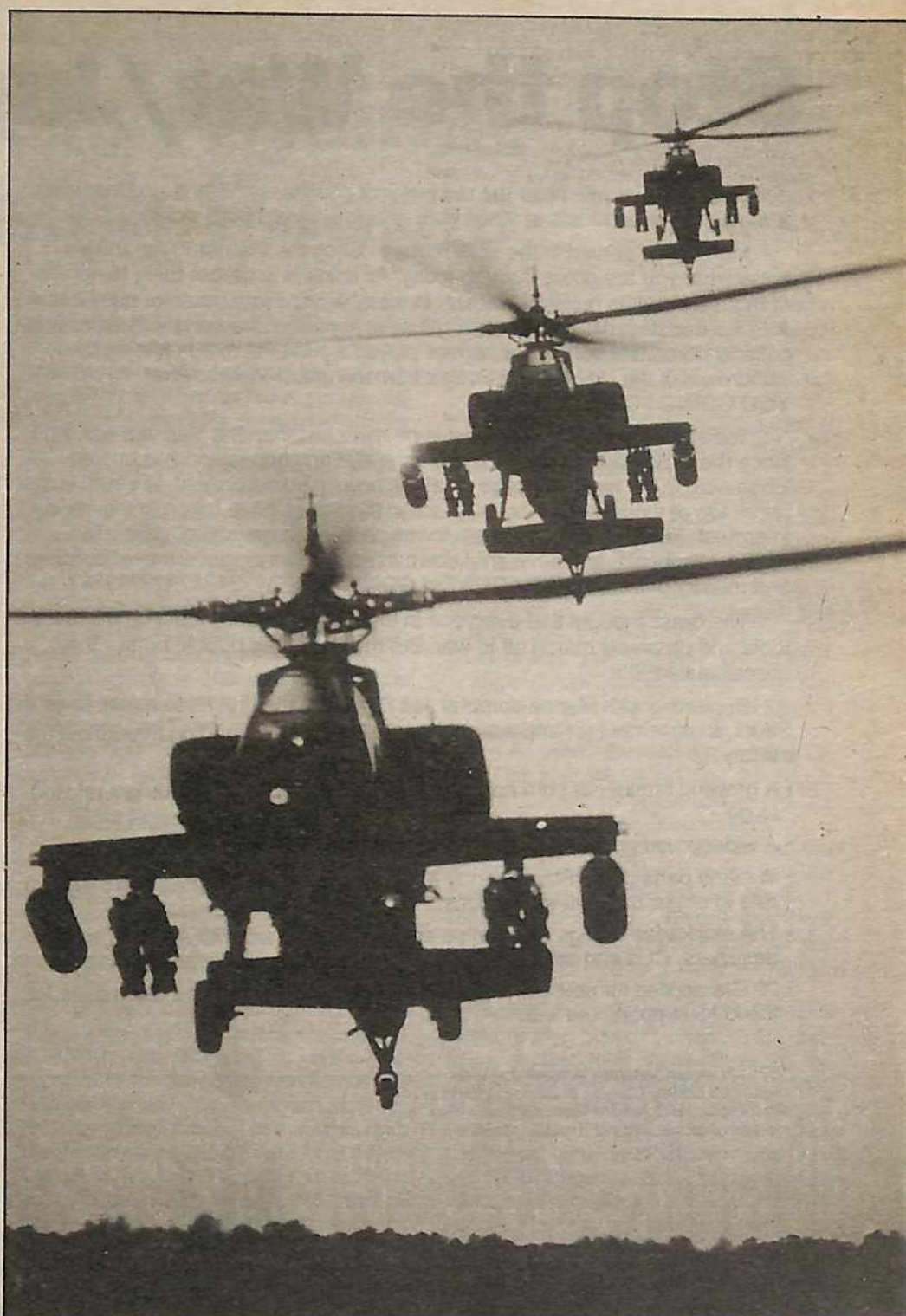
U.S. Apache helicopters.

At the very least, the U.S. created a situation where Hussein felt he was being squeezed and undercut and had to do something to deal with this. There is evidence that the U.S. even encouraged or "enticed" Hussein to move into Kuwait in order to set up a justification for ganging up on Iraq. For example, the U.S. ambassador to Iraq