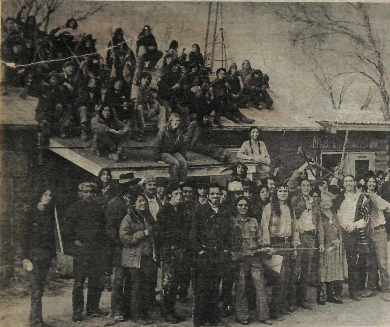
Wounded Knee, 1973.