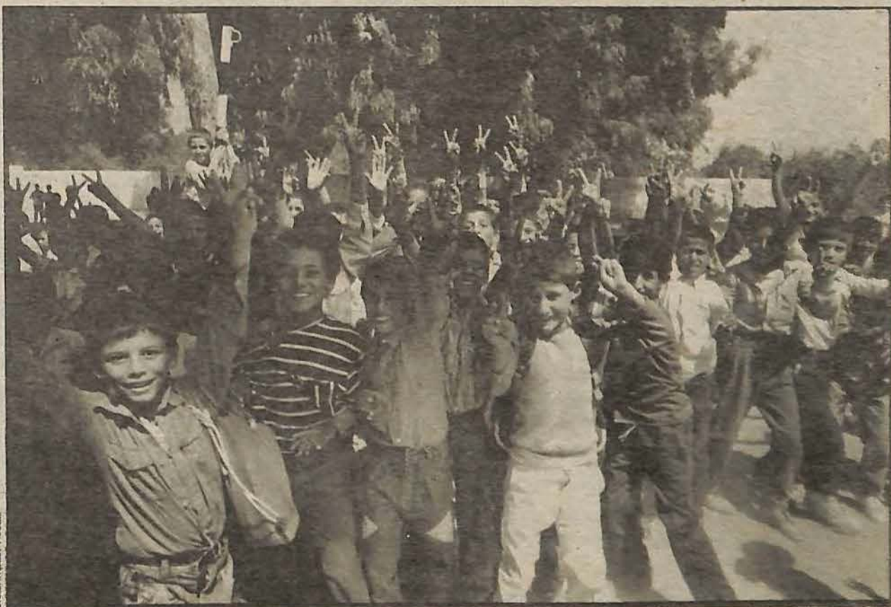
Schoolchildren in Bureij Refugee Camp.

Definitely. The more oppressed they are the stronger I think that makes them. People talk of martyrs. It's like everyday talk. A martyr to us, it means something different. To them it's an everyday occurrence. There's a strength in that, I guess. It's an honor to fight for the resistance. People that don't, I don't think they're held in high regard. The culture to me is really generous. They are very proud. They don't want any dishonor. And I think they feel dishonored enough that they won't take it anymore. □