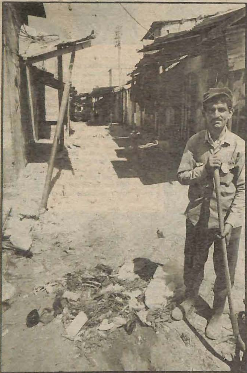
A street in Bureij Refugee Camp in the Gaza Strip.

The RW was able to talk with a progressive photographer who recently traveled to occupied Palestine. The following are excerpts from that interview: