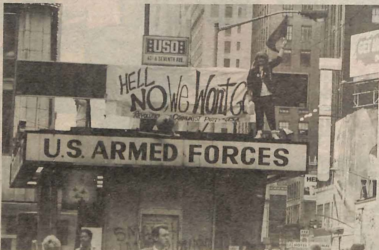
Times Square, New York, Sept. 11.