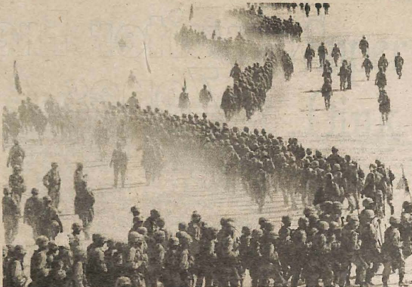
Soldiers from the U.S. First Cavalry Division in Saudi Arabia.

The dangerous times require that these determined actions continue and expand. The war criminals in power must be stopped from carrying out their deadly plans. □