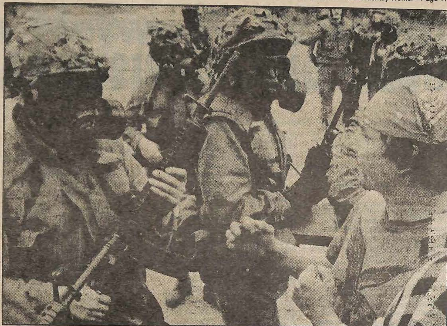
Mohawk warriors face off against Canadian soldiers earlier this year.

Meanwhile Akwesasne, a Mohawk territory that straddles the border between Canada and the U.S., remains occupied by hundreds of New York State police and Canadian police. The Mohawks at Kahnawake have defeated several invasion attempts by the army (see RW No. 580). They have fought with their bare hands against troops equipped with armed personnel carriers and machine guns.