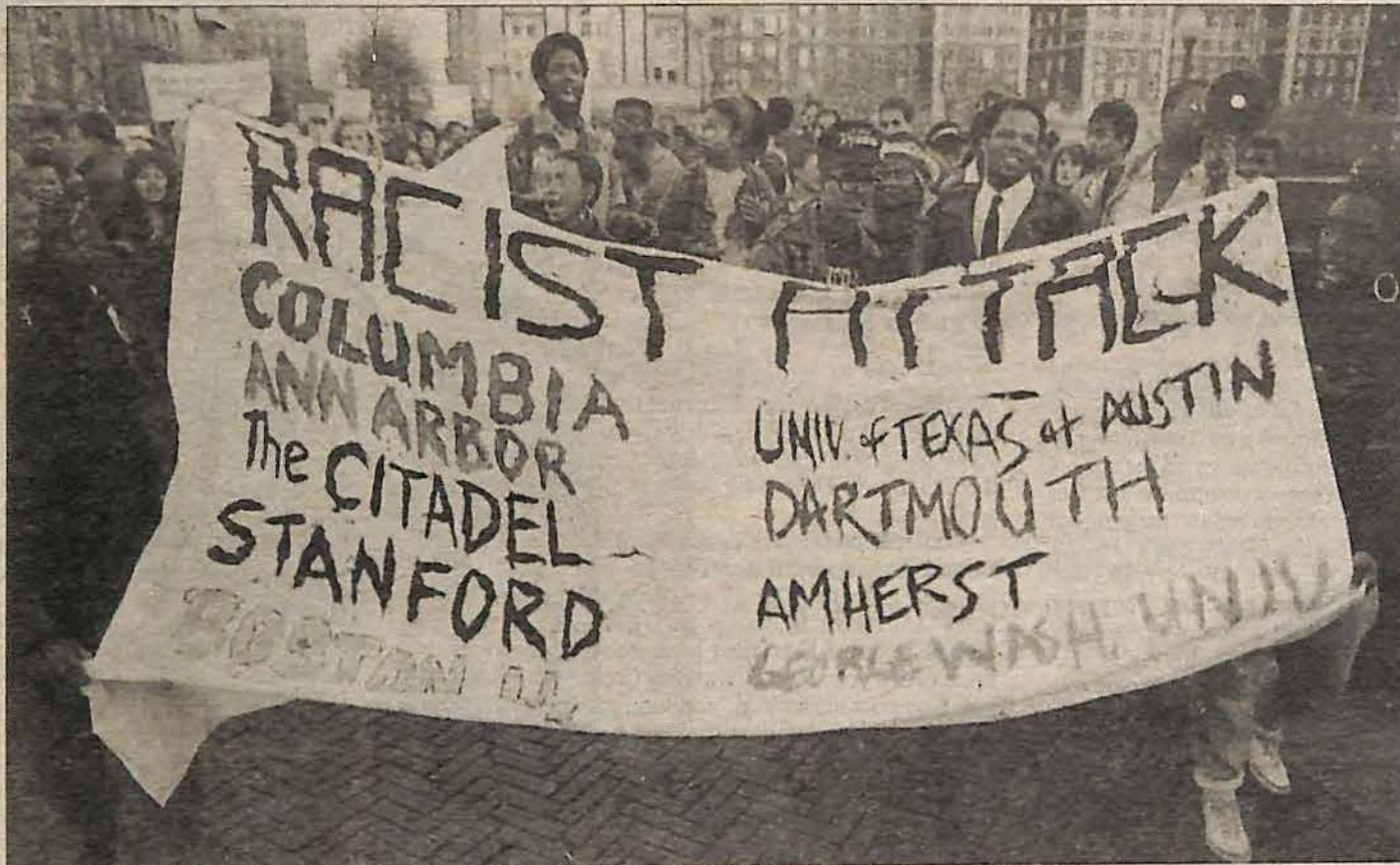
Protest at Columbia University, 1988.

The RW calls on students on campuses across the country to correspond with us and expose all these racist and male-dominator incidents going down on the campuses. □