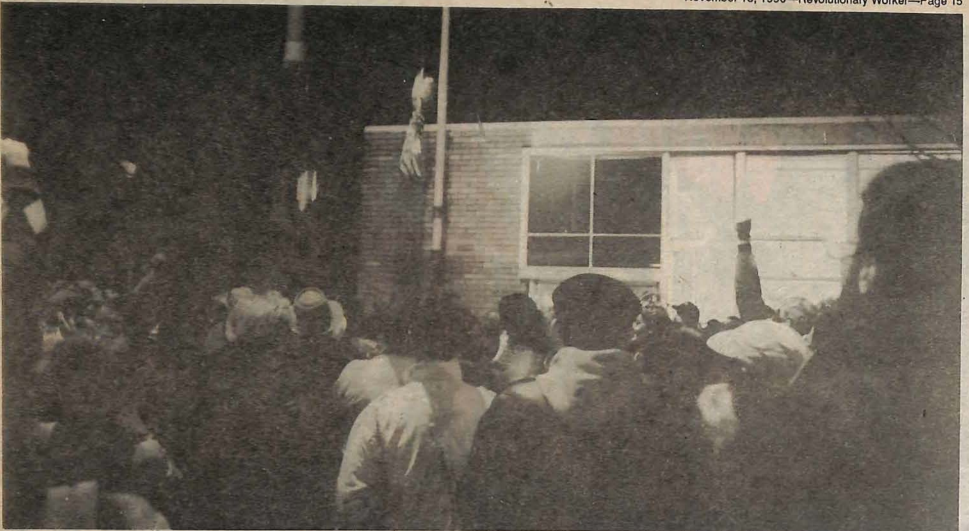
October 28, 1989—U.S. flag burns over Post Office in Seattle.