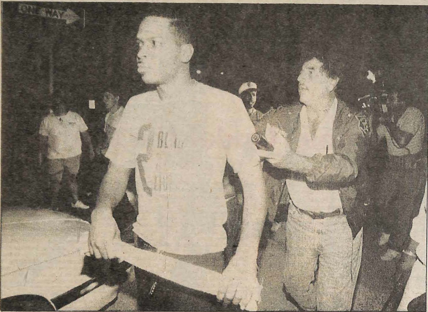
Luther Campbell from 2 Live Crew being arrested in Ft. Lauderdale, Florida

the people struggle they CAN deliver the other side some defeats.