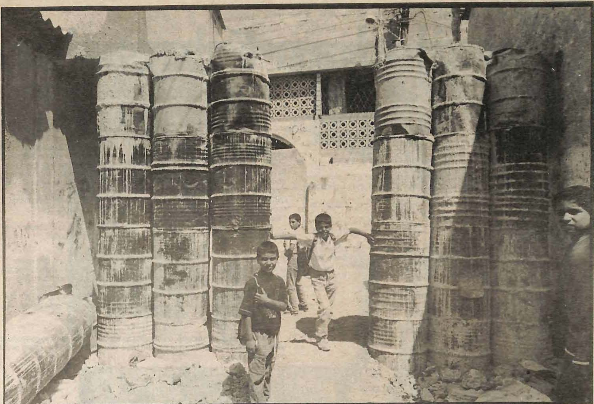
Cement-filled oil drums erected by Israelis to block alleys in Bureij Refugee Camp. Again, the residents knock them down.

such a U.S.-dominated line. They say it's betrayal of their own nations. They definitely see it as a betrayal of the Palestinian cause.