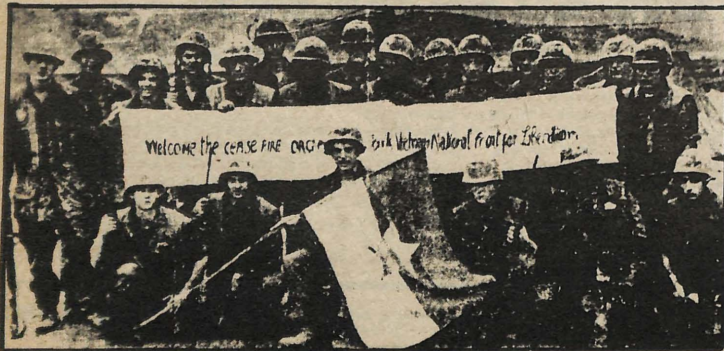
A group of active duty GIs during the Vietnam war display "the enemy's" flag.

I was part of a whole process of GI's and veterans becoming more in unity with the revolutionary people and becoming revolutionary themselves. Certainly one of the key lessons that I learned was that at every stage along the line it was the advanced vets and GI's, it was the advanced struggles of the people of the world, it was the advanced people within the movement, who were key. There was always this process; you bounced your ideas off of the most advanced ideas at that time. At that time we were not trying to bow down and tone down our arguments and try to play down the politics within the organization. We didn't understand a lot. We weren't studying Marxism-Leninism and taking up the science of revolution. But certainly our thrust and our emphasis was in that direction. That was obviously what was behind the Winter Soldier Investigation. That was the thrust behind it, that we could take on all the questions in the society. We had a program that talked about everything from sexism to racism. We wanted to expose and take on all of the questions and really make some kind of fundamental change. □