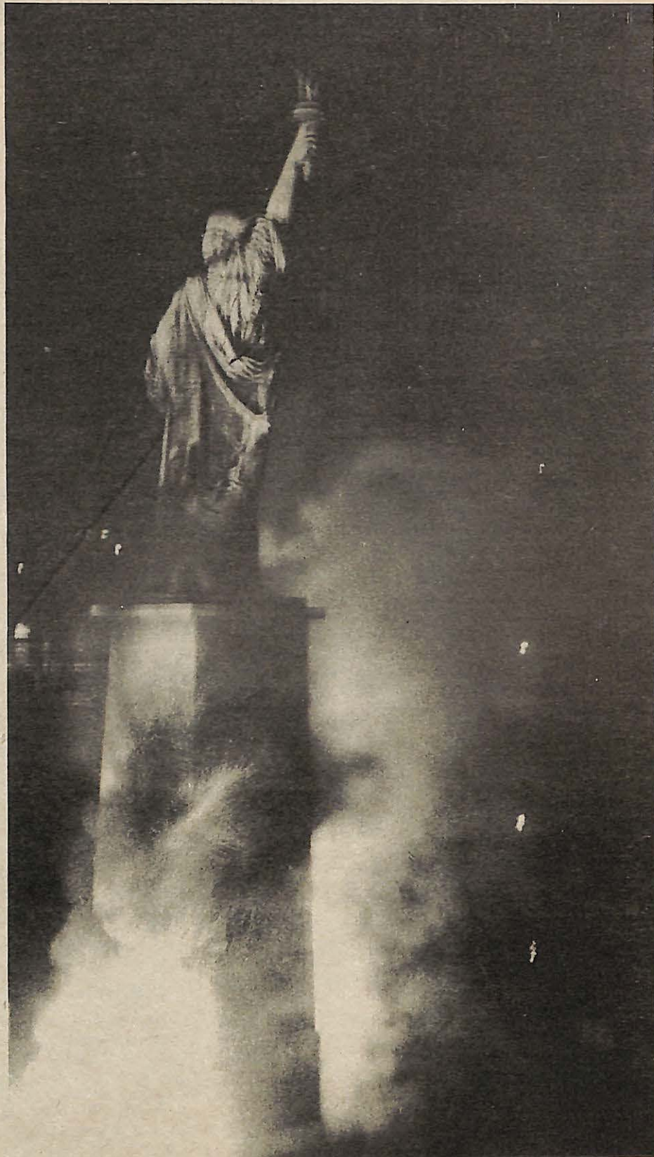
In December of 1971, Vietnam veterans seized the Statue of Liberty in New York in opposition to the bombing of North Vietnam and in support of the Vietnamese people. In support of the vets' takeover, French radicals burned a replica of the Statue of Liberty in Paris.

But they have quite a bit to chisel away at and really quite a bit to fly in the face of. I remember in 1970 when I got hit with orders for Nam, talking with returning vets on the west coast who pointed with pride to the fact that they had refused to fight the "enemy" for months and that the last hostile actions their unit had had was when they fragged their CO. Talking with Black vets who got captured by the VC and asked why they were helping to oppress the Vietnamese people when their people weren't free and then released. Being shocked by reports of vets and GI's in uniform marching in anti-war rallies and several weeks later joining them myself. I also remember 1971 in Leavenworth in the hole hearing that the commandant/