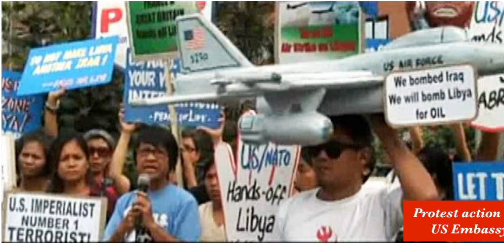
Protest action in front of the US Embassy in Manila