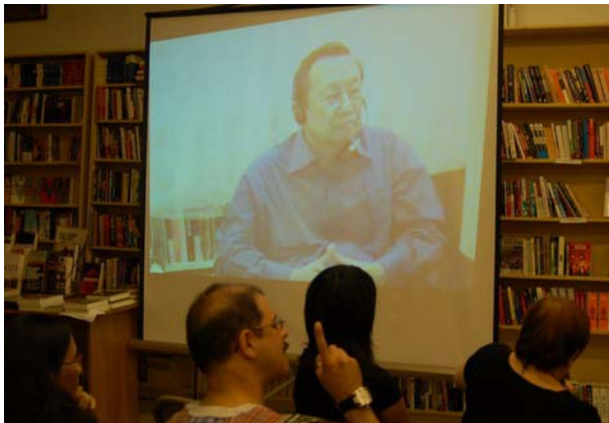
Prof. Jose Maria Sison interacts with New York audience via video conference.

The dictatorial regime of Ferdinand Marcos held him political prisoner for more than eight years, from 1977-1986. In 2002, the US State Department declared that Sison, the CPP and the New