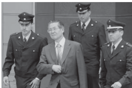
Former president Fujimori (1990-2000) back in house arrest.

The victims who survived and relatives of the victims of death squads have been campaigning for the trial of Fujimori.