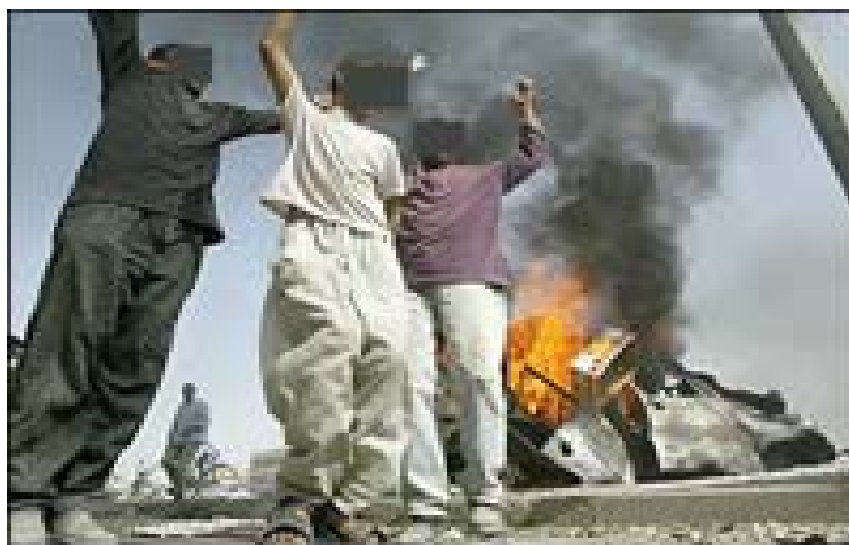
Iraqi civilians celebrating victory of the Iraqi resistance fighters against US forces

Interestingly, criticisms and calls for change coming from the Washington