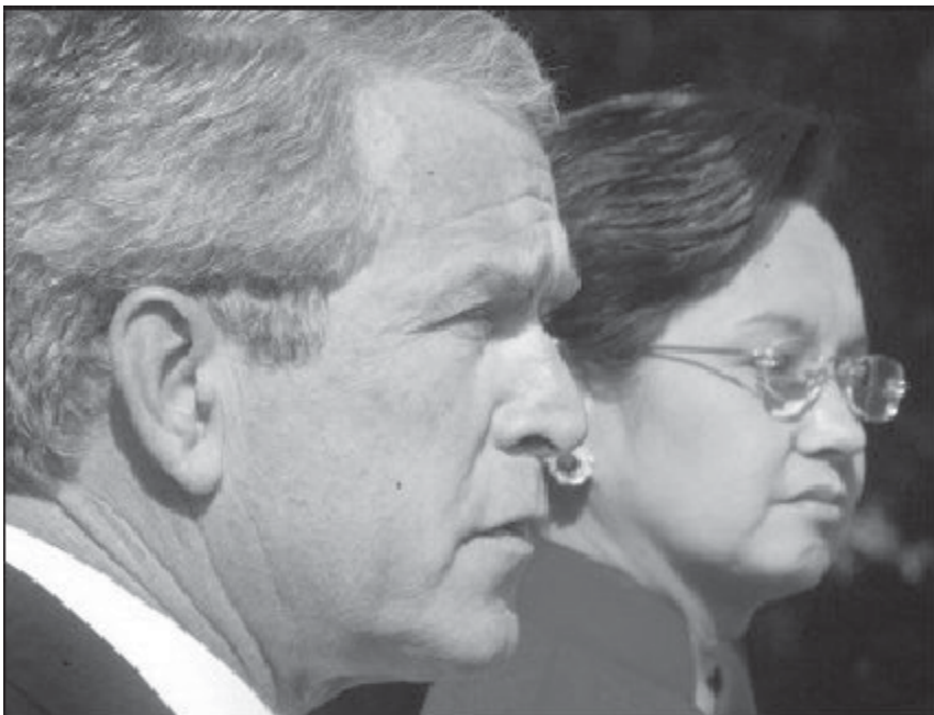
Bush and Arroyo are both war criminals

As the Philippines continues to be the US' Second Front in its so-called war on terror, and the US-backed Arroyo regime's puppetry to the US deepens even more, expect the fascist plague to further spread throughout the country. But as the history of the people's resistance also shows us, more repression breeds more resistance. The outpouring of anger and condemnation of OBL's fascist killings and other war crimes is steadily expanding the ranks of the revolutionary movement in the Philippines and the international solidarity for the Filipino people. ■