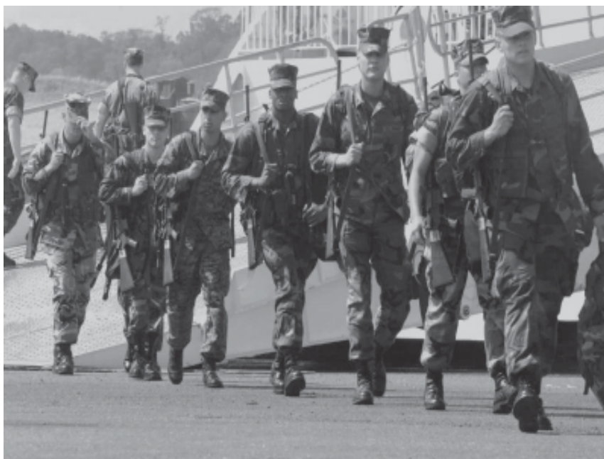
US Marines arrive at the former US naval base in Subic, Zambales, in northern Philippines, from their High Speed Vessel, for the "shoulder-to-shoulder" joint military exercise.

This Anti-Terrorism Bill, just like the US Patriot Act and the US Military Commissions Act, must be vigorously opposed by the Filipino people and all freedom-loving peoples. ■