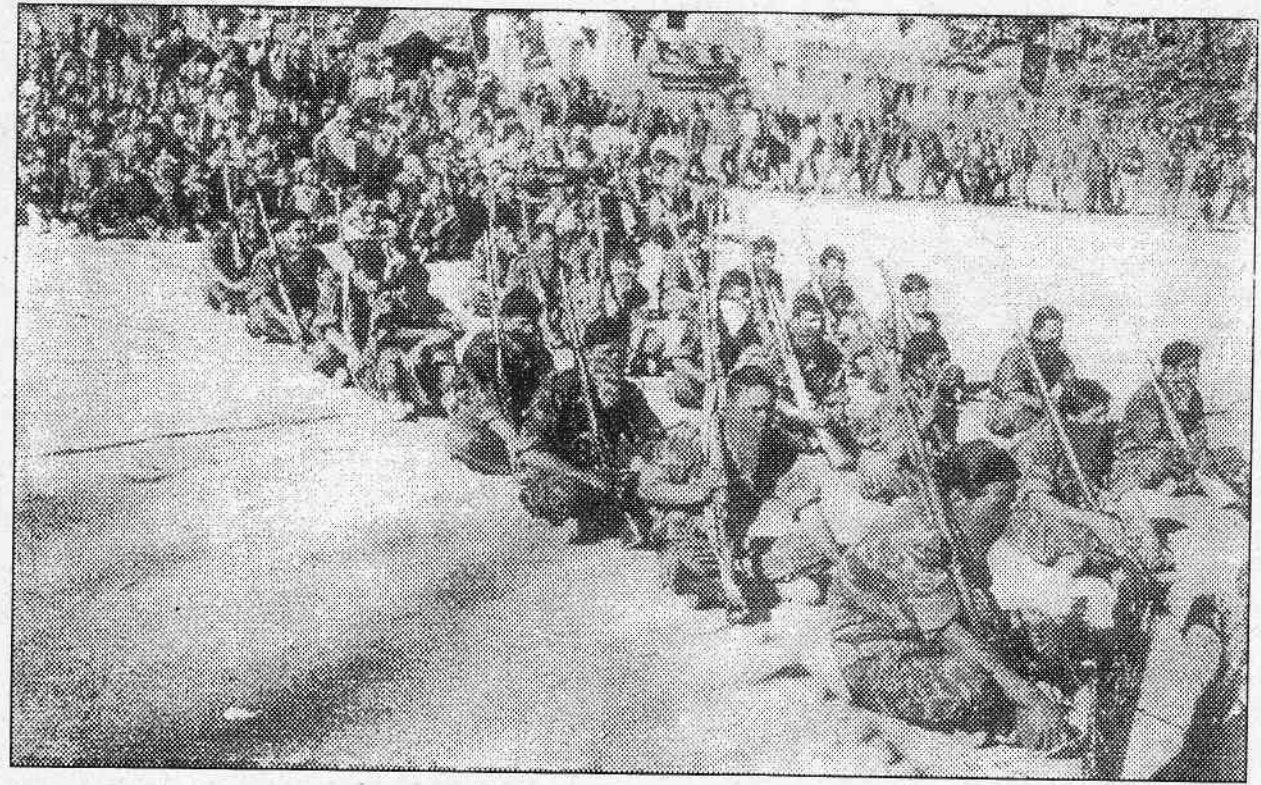
Public declaration meeting of District People's Committee, Rukum

leadership of the Party. In the Western Region these People's Committees have been functioning openly and exercising people's power according to tentative rules and regulations formulated by the higher level of the Committee.