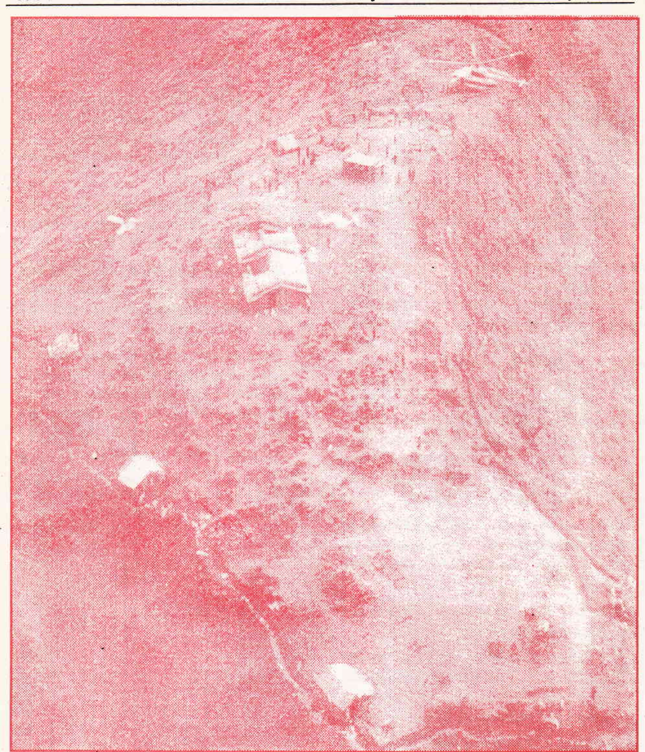
The heavily fortified hill-top out-post at Rukumkot destroyed during the 1st April, 2001 raid