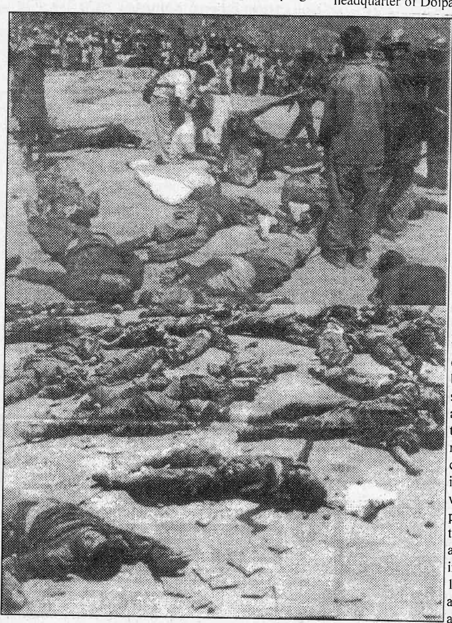
The Aftermath of the Naumule (Dailekh) Raid

these at Rukumkot, the virtual bastion of PW, on April 1, is widely acknowledged as the topmost military action to date. if one sees it from the strict military point of view. Since it was the first successful attack against a company-level fortification of the Special Striking Force of the enemy's police force located on a strategic hill-top. The recently constructed fortification on a specially chosen hill-top consisted of an outer fence, then a thick stone wall with eight observation posts and finally a trench inside the wall. The fortified post was manned by 76 policemen at the time. However, the people's guerillas of a company-level formation, aided by local militias, successfully stormed into the fortification with a lightening speed and destroyed the enemy camp within 45 minutes. As a result, 32 police commandos including one inspector were killed, 14 wounded and 22 were taken into people's custody. Together with this a large quantity of arms and ammunitions were captured, including 58 rifles, 6 magnums, 1 shotgun, 3 pistols, 3 revolvers, around 6000 pieces of ammunitions and some communication sets. This great