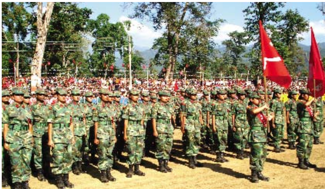
Women PLA soldiers performing march-past parade during the inauguration ceremony

The event was inaugurated by Comrade Prachanda by hoisting the PLA flag and kickstarting an entertaining football game where two teams were trying to score goals in posts named Democratic Republic! The PLA artist performed songs in between. There were march-past parades, a mock camp raid conducted by 18 PLA special commandos and a lot more. ■