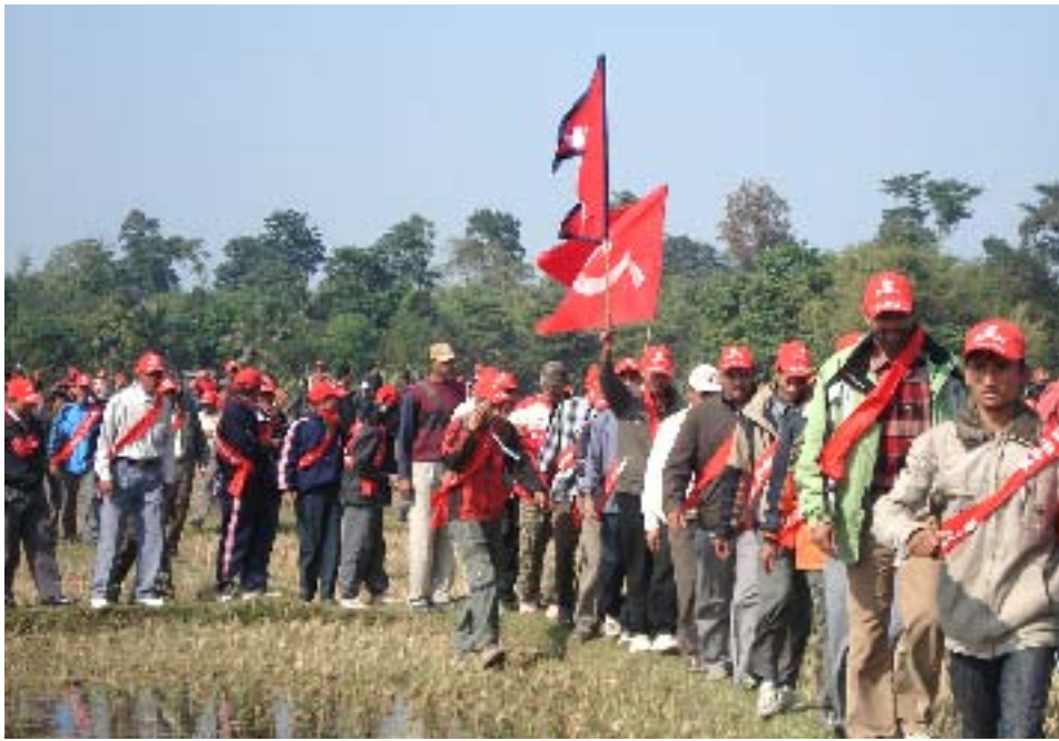
YCL cadres marching in Susta where Indian State has encroached Nepali territory

eastern and central Nepal and various places including Susta (Nawalparasi) in the western Nepal. In one of the incident, the Indian Boarder Security Force has mistreated the League activists while they were visiting the en-