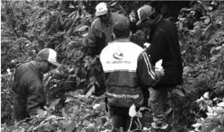
NHRC team investigating the suspicious site at Shivapuri area

Coincidentally, soon after the news about the suspicious site revealed, six ruling political parties and CPN-Maoist agreed to