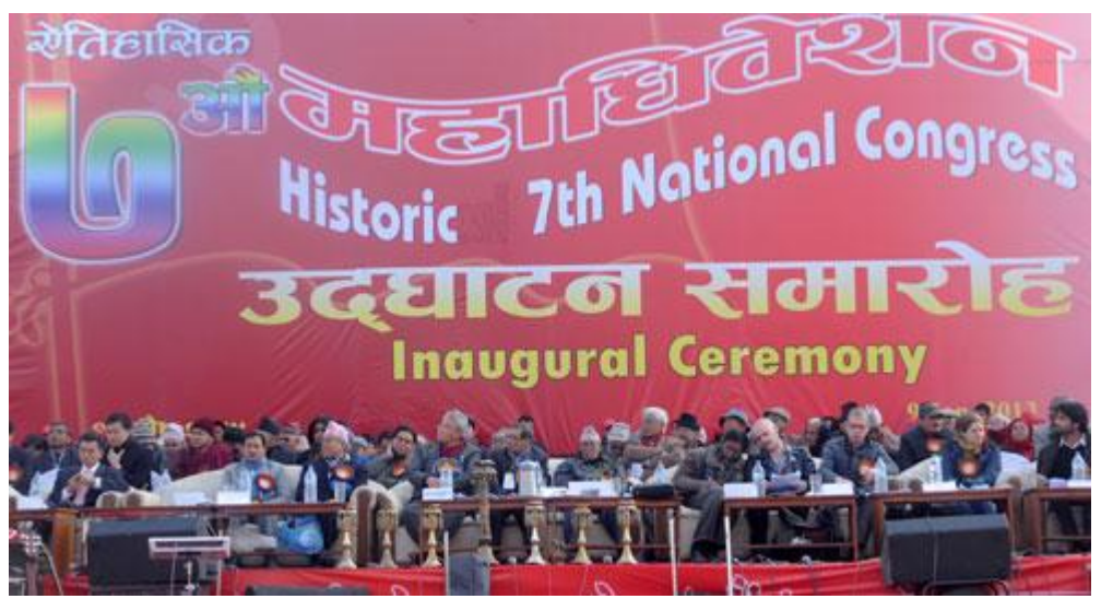
Maoist leaders in the convention.

Representatives of fraternal communist parties from 11 countries including USA, India, Turkey and Canada, who were also present, expressed their good wishes and solidarity.