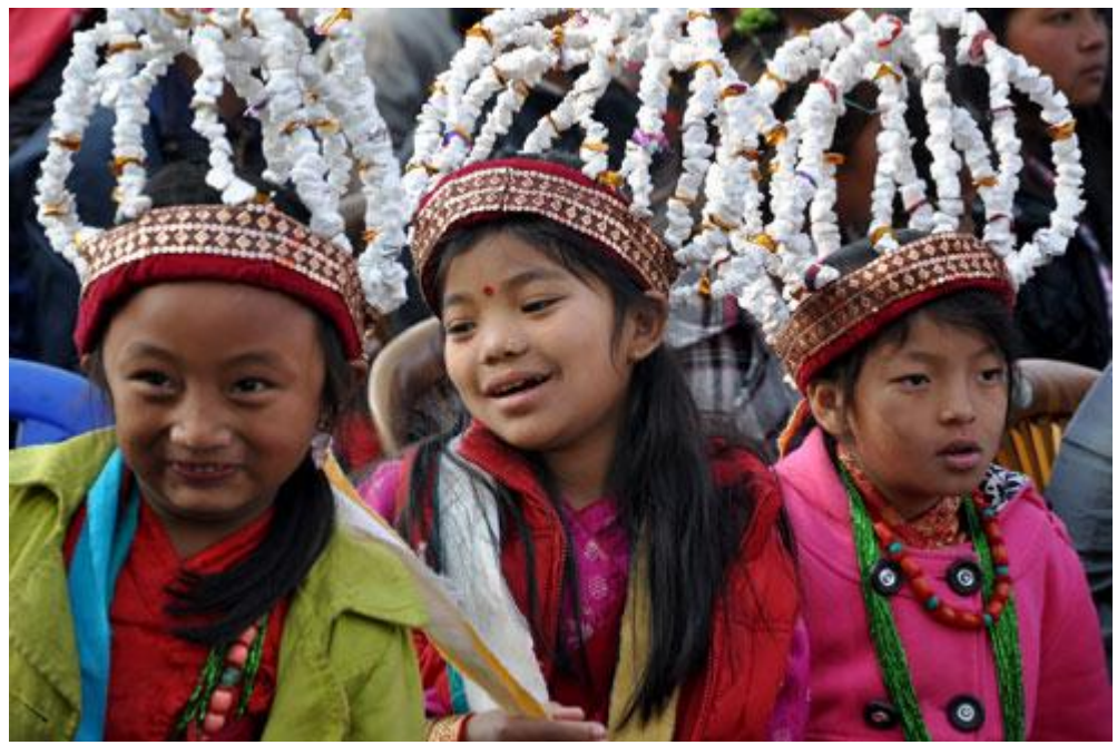
Girls in the convention.