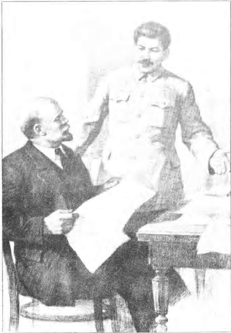
Lenin and Stalin during the Civil War