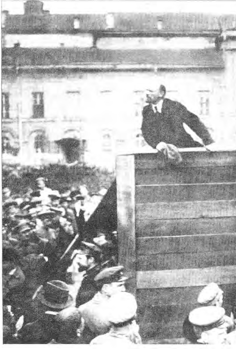
Lenin giving a speech to the soldiers of the Red Army during the Civil War, May 1920