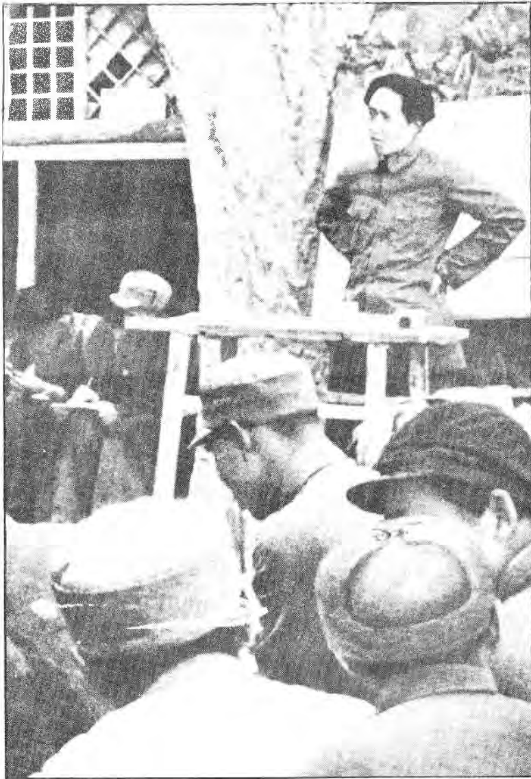
Chairman Mao at the Lu Hsun Institute of Literature and Art in Yen-an in May 1938.

and one's address abroad. If we tackle this properly, my word, we could revolutionise the distribution of underground literature in Russia. Don't forget that transportation, at best, takes four months. And that's with a weekly paper! As for the enveloped copies, probably from 50 to 75 per cent will be delivered at postal speed.