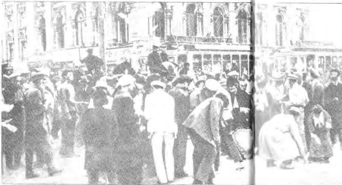
Distribution of Bolshevik leaflets. August 1917