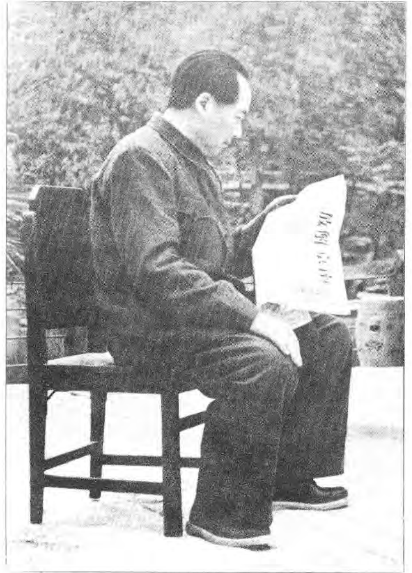
Chairman Mao reading the news of the liberation of Nanking in 1949