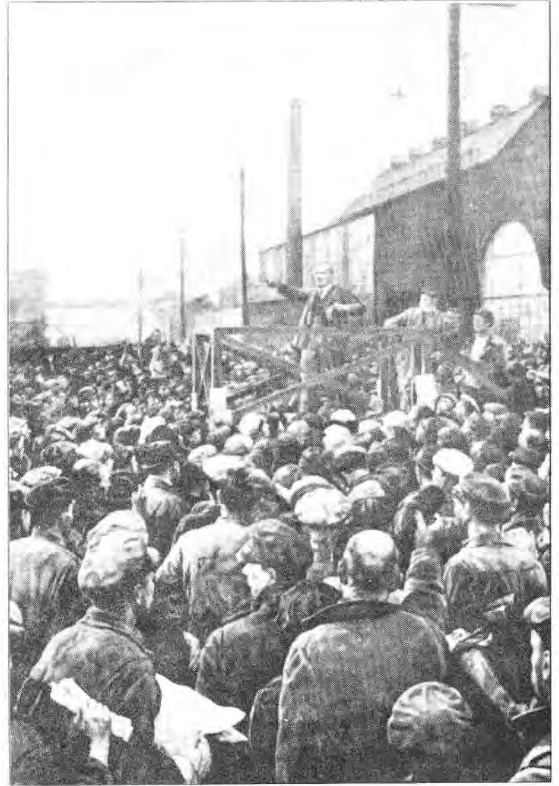
Drawing of Lenin giving a speech to the workers at the Putilov factory in Petrograd after the revolution.