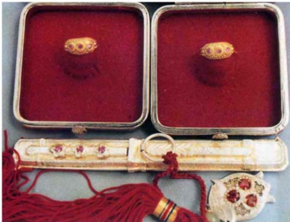
Triplets born in Korea receive a silver sword or a gold ring on which magnolia is carved.