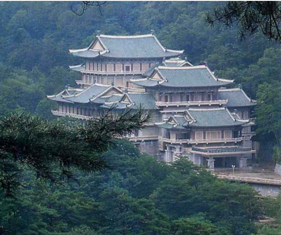
Magnolia pattern decorated in the International Friendship Exhibition