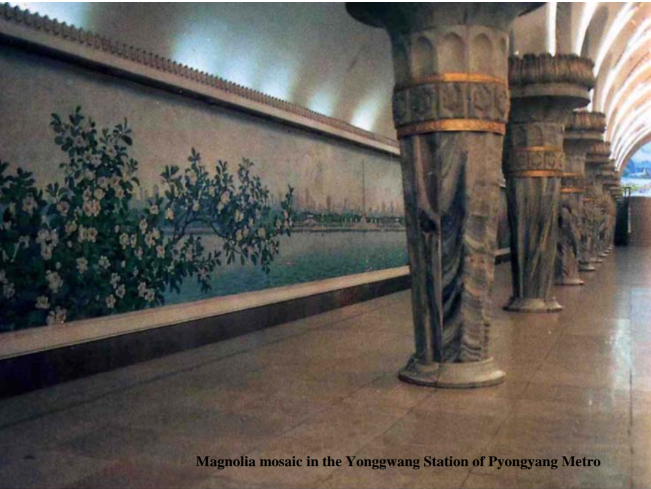
Magnolia mosaic in the Yonggwang Station of Pyongyang Metro