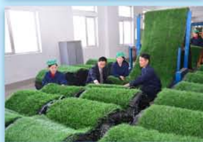
Wonsan City Corn Processing Factory, Wonsan Kimchi Factory and other local industry factories are highly conducive to improving the living standard of the provincial people