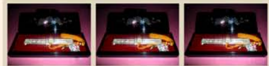
Ornamental silver daggers for the triplets (June 2013)