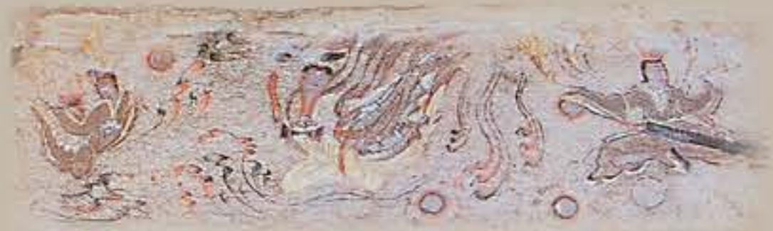
Korean Folk Dance