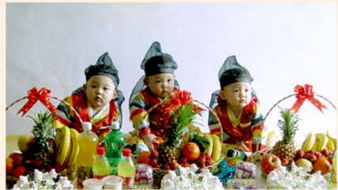
On the first birth anniversary (April 2014)