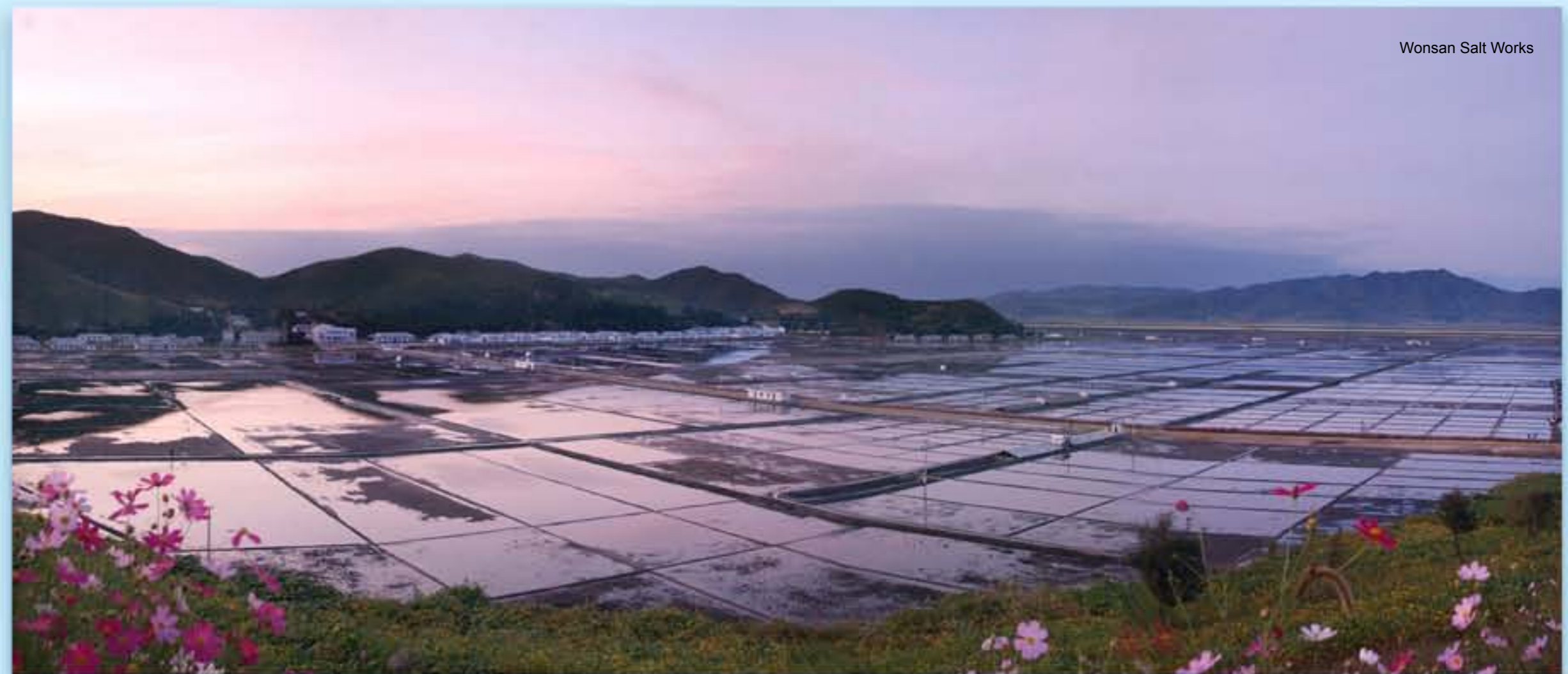
Wonsan Salt Works