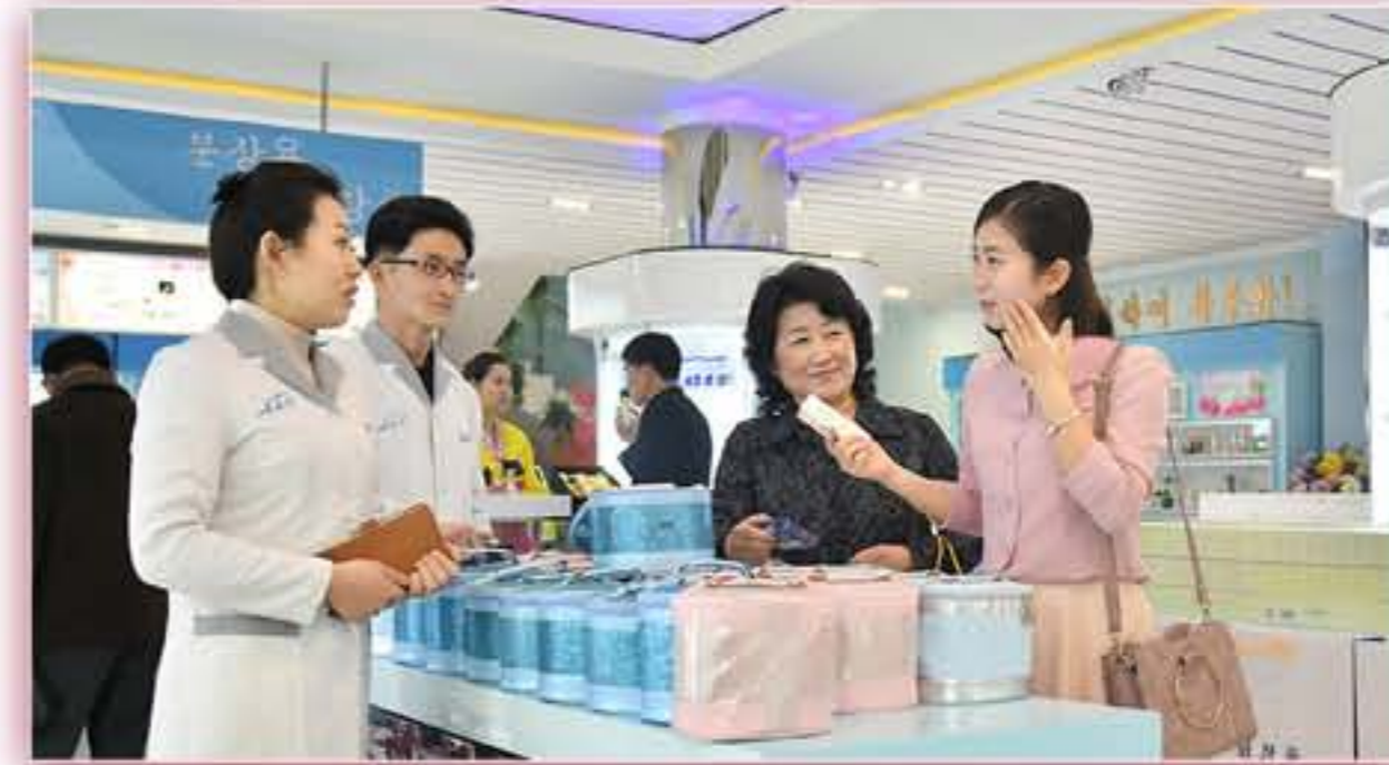
Unhasu cosmetics enjoy popularity among people

Unhasu cosmetics of the Pyongyang Cosmetics Factory are enjoying popularity among users.