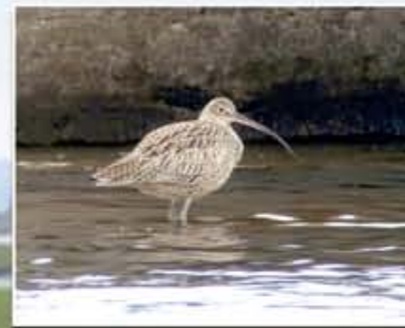
Far Eastern Curlew(EU)