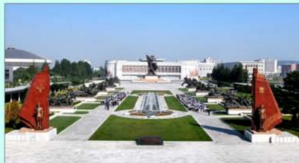
Victorious Fatherland Liberation War Museum