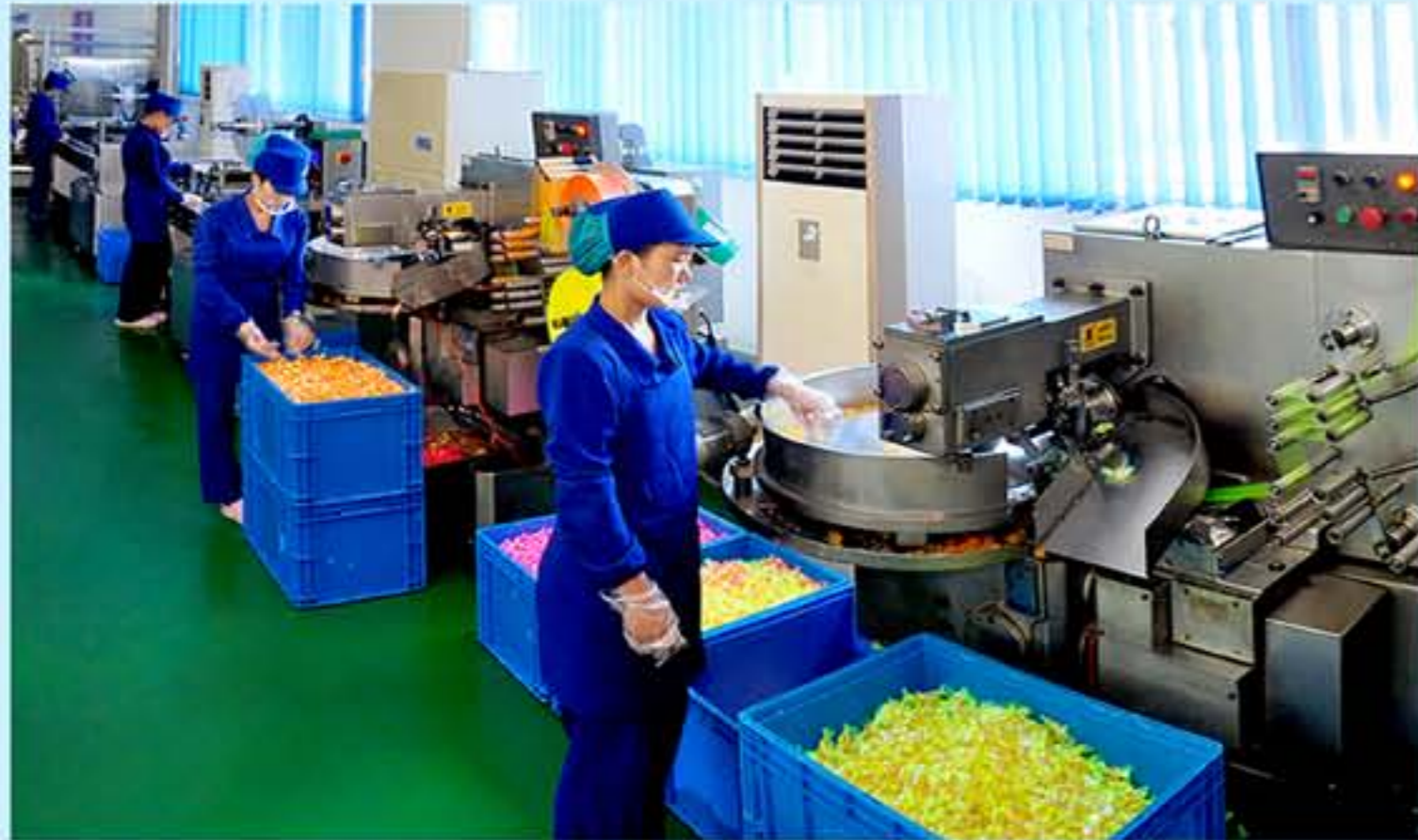
Songdown General Foodstuff Factory relies on locally available materials in production