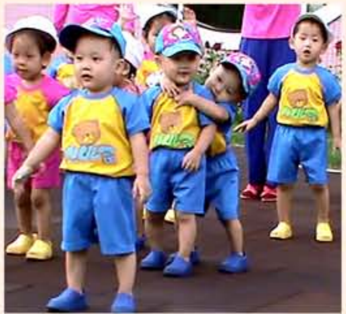
At the Pyongyang Baby Home (2015)