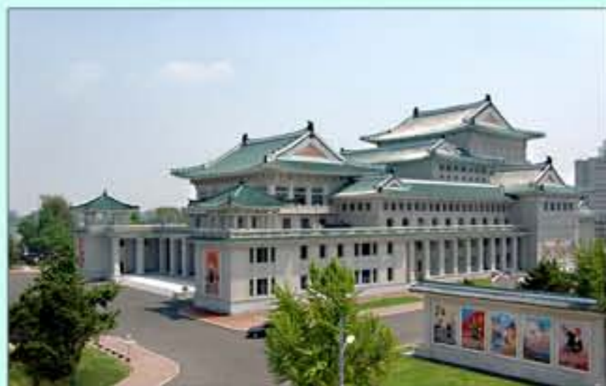
Pyongyang Grand Theatre