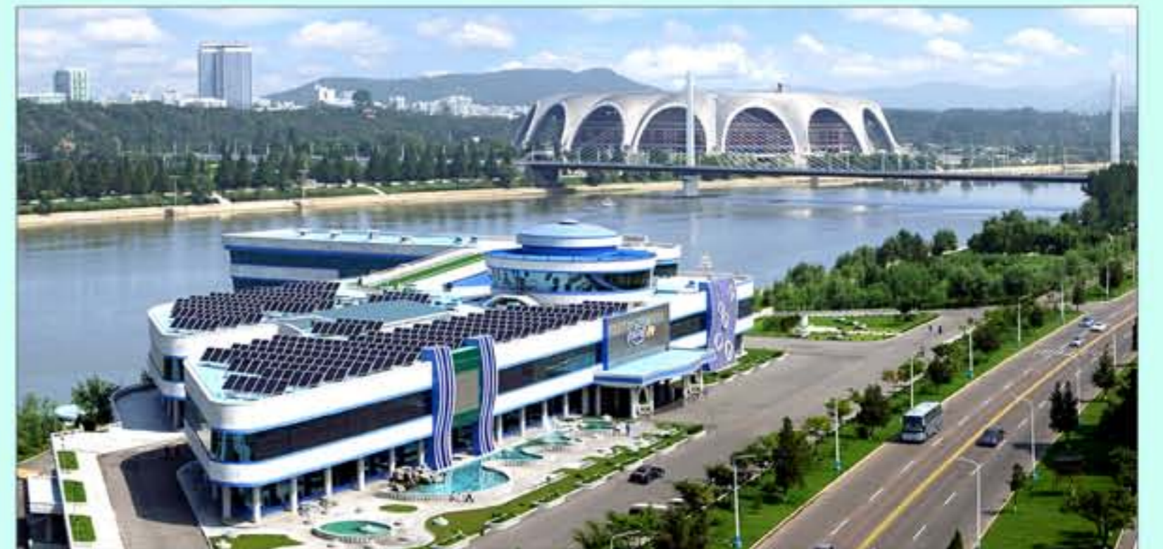
May Day Stadium and other sporting and cultural establishments erected on the banks of the Taedong River