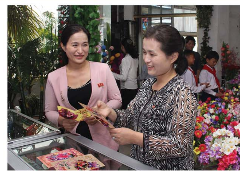
People visit souvenir shops to prepare gifts for their mothers

Everyday she went to work earlier than others to clean her bus and prepared spare parts for accident-free run in advance. This earned her everybody's respect. She once provided a driver's wife in sick bed with honey, and prepared