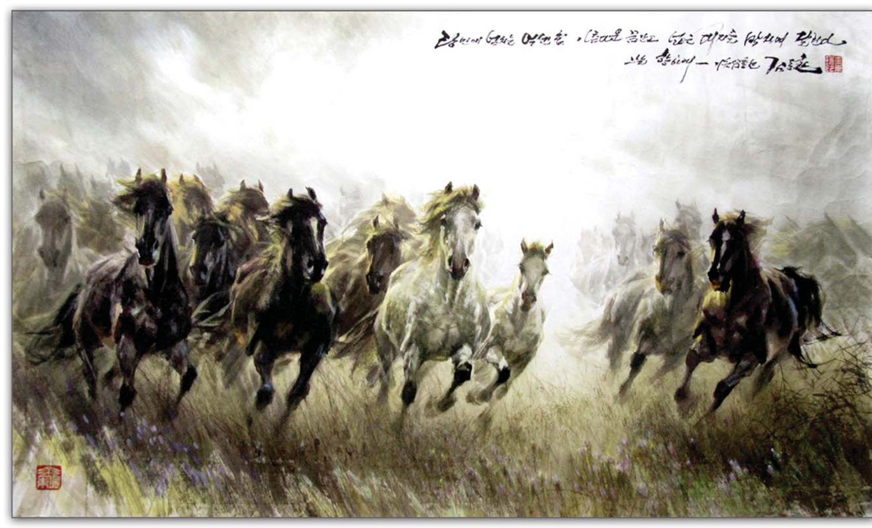
Korean painting Galloping in the Vast Field