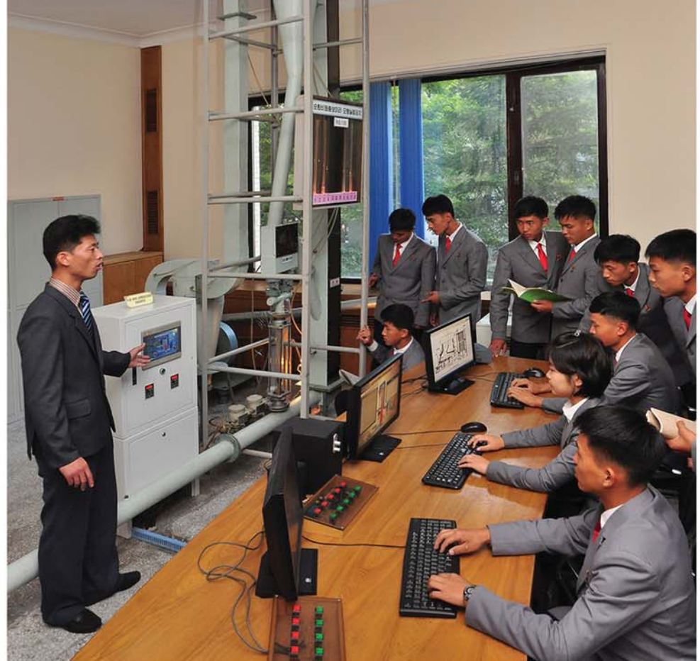
The university focuses on training all students to become creative talents with high application ability by making educational content practicable, comprehensive and up-to-the-minute and improving teaching methods