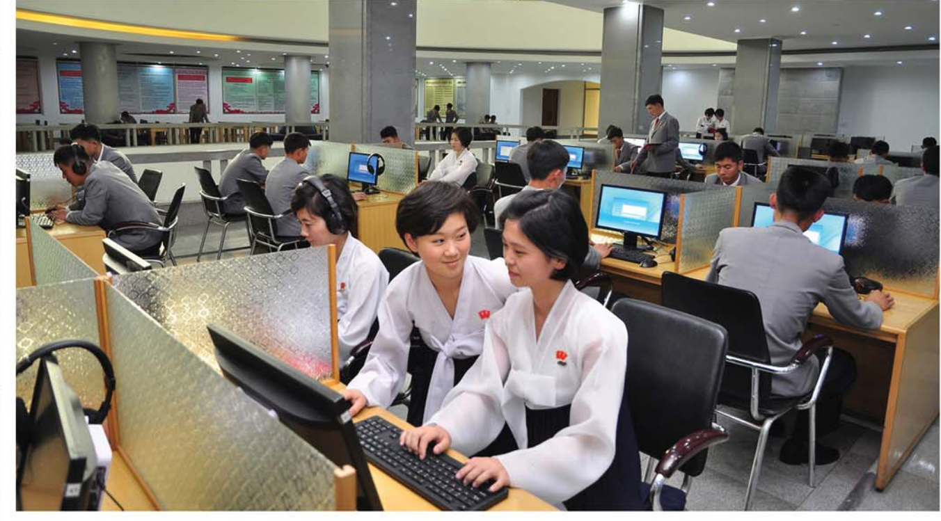
At the e-library