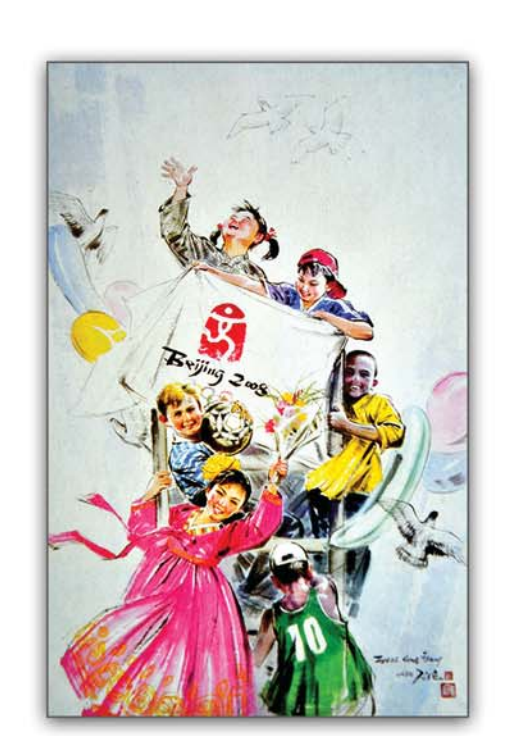
Korean painting Towards a Peaceful World