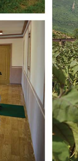
The aged people regain their health and vigour, having medical checkups and doing exercises regularly at the old people's home

Tn Korea where such popular policies Las free education system and free medical care system are enforced, the state is responsible for taking care of the elderly's life.