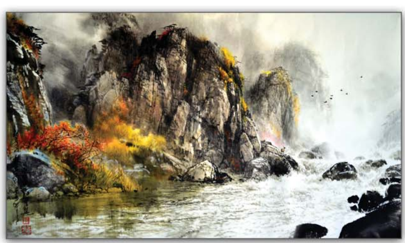
Korean painting A Valley in Sinphyong in Autumn