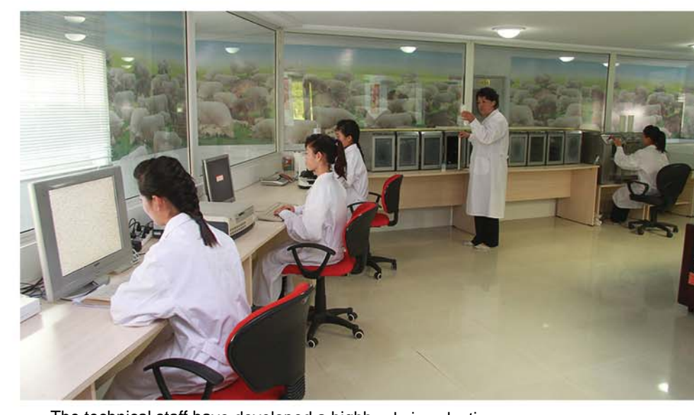
The technical staff have developed a highbred pig selection program to preserve highbred pigs in an effort to increase production

Article: Choe Ui Rim