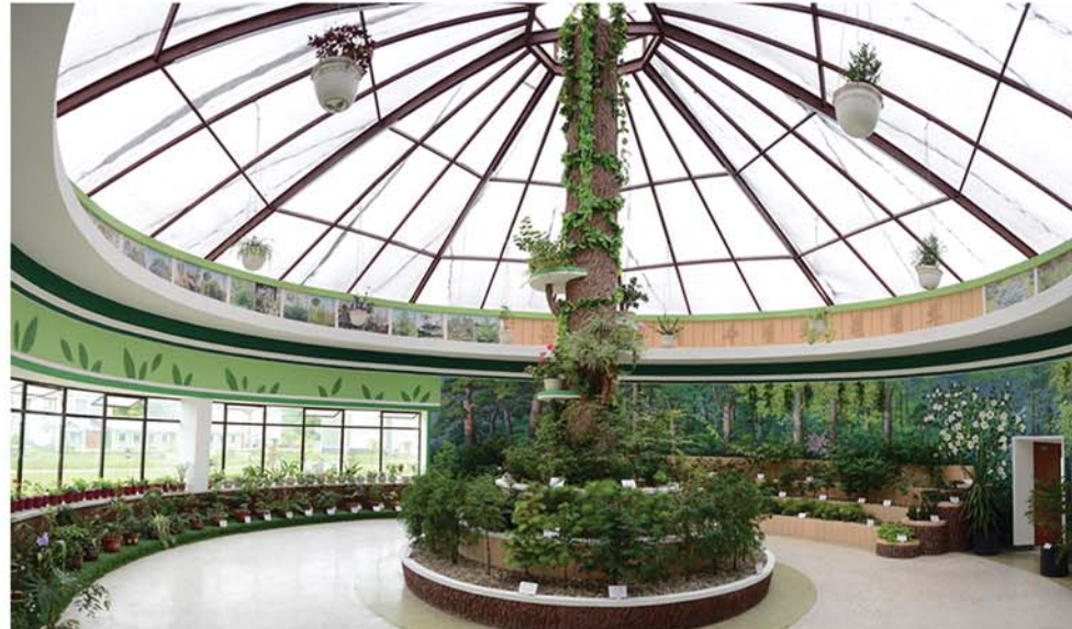
The tree nursery is furnished with plastic panel greenhouse, outdoor cultivation ground, round cutting bed and other modern and IT-based production bases