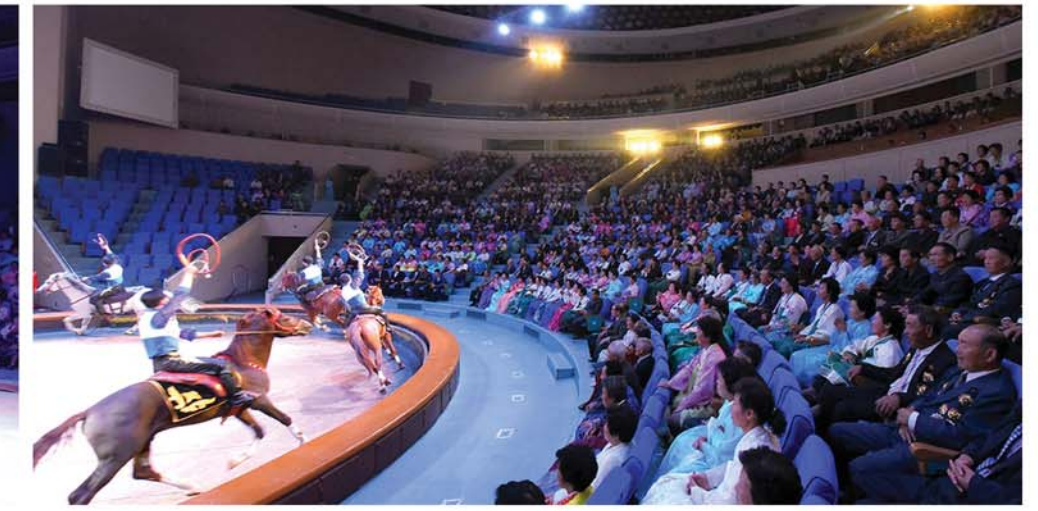
An art performance is given for the elderly to mark the International Day of Older Persons