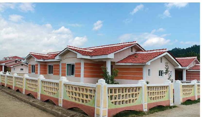
Dwelling houses, the Songchon Health Complex with public welfare facilities, agricultural sci-tech learning space, hall of culture and school have been newly built to provide farmers and their families with every convenience for living