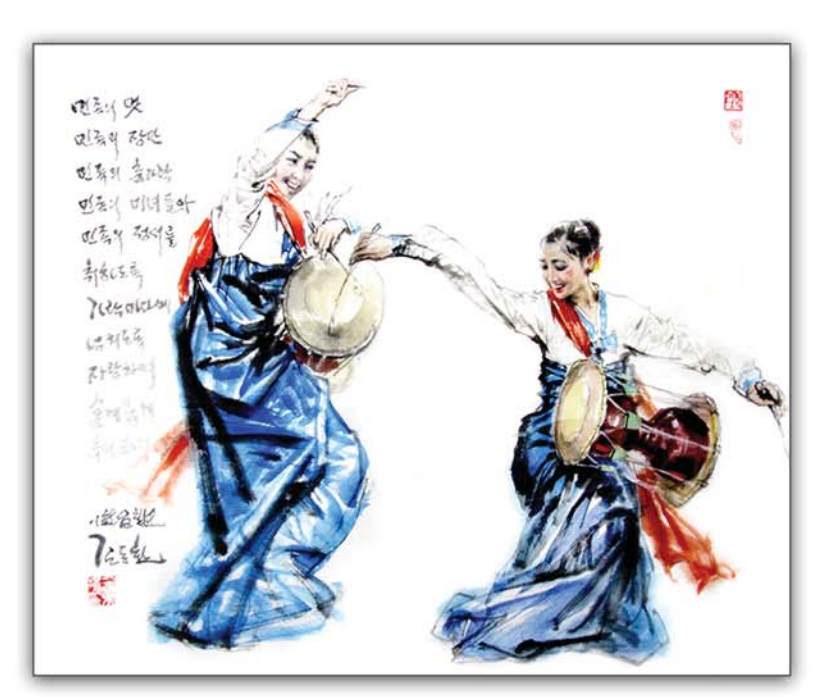
Korean painting In Time with National Tune