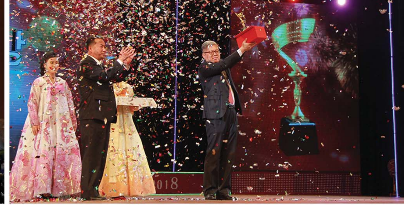
At the closing ceremony films presented to the festival were introduced, the results of judgment announced and prizes awarded