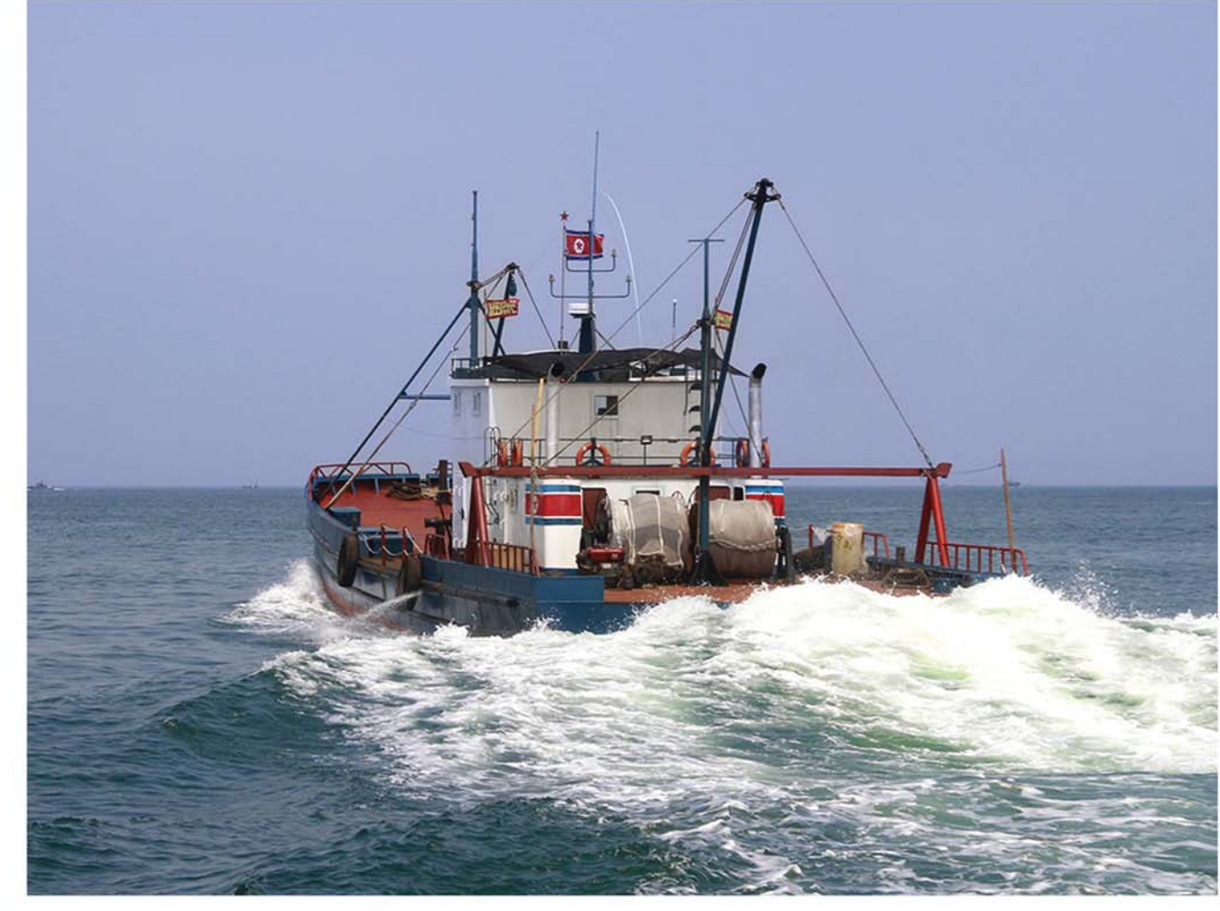
The vessel is equipped with fishing tackles to carry out a variety of fishing work including long sack-shaped and gill nets and trawls