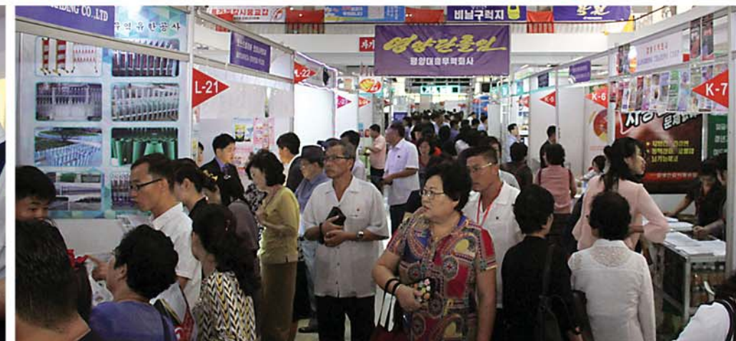
The 14th Pyongyang Autumn International Trade Fair made a great contribution to boosting diversified economic and trade dealings and exchanges of science and technology among nations