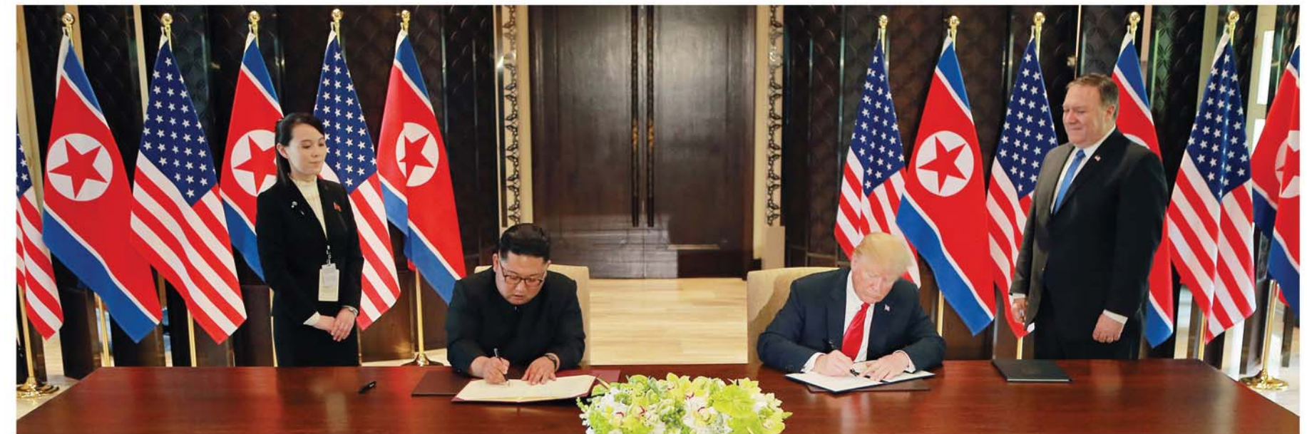
Chairman Kim Jong Un and President Donald J. Trump signing the joint statement of the Singapore summit [June Juche 107 (2018)]