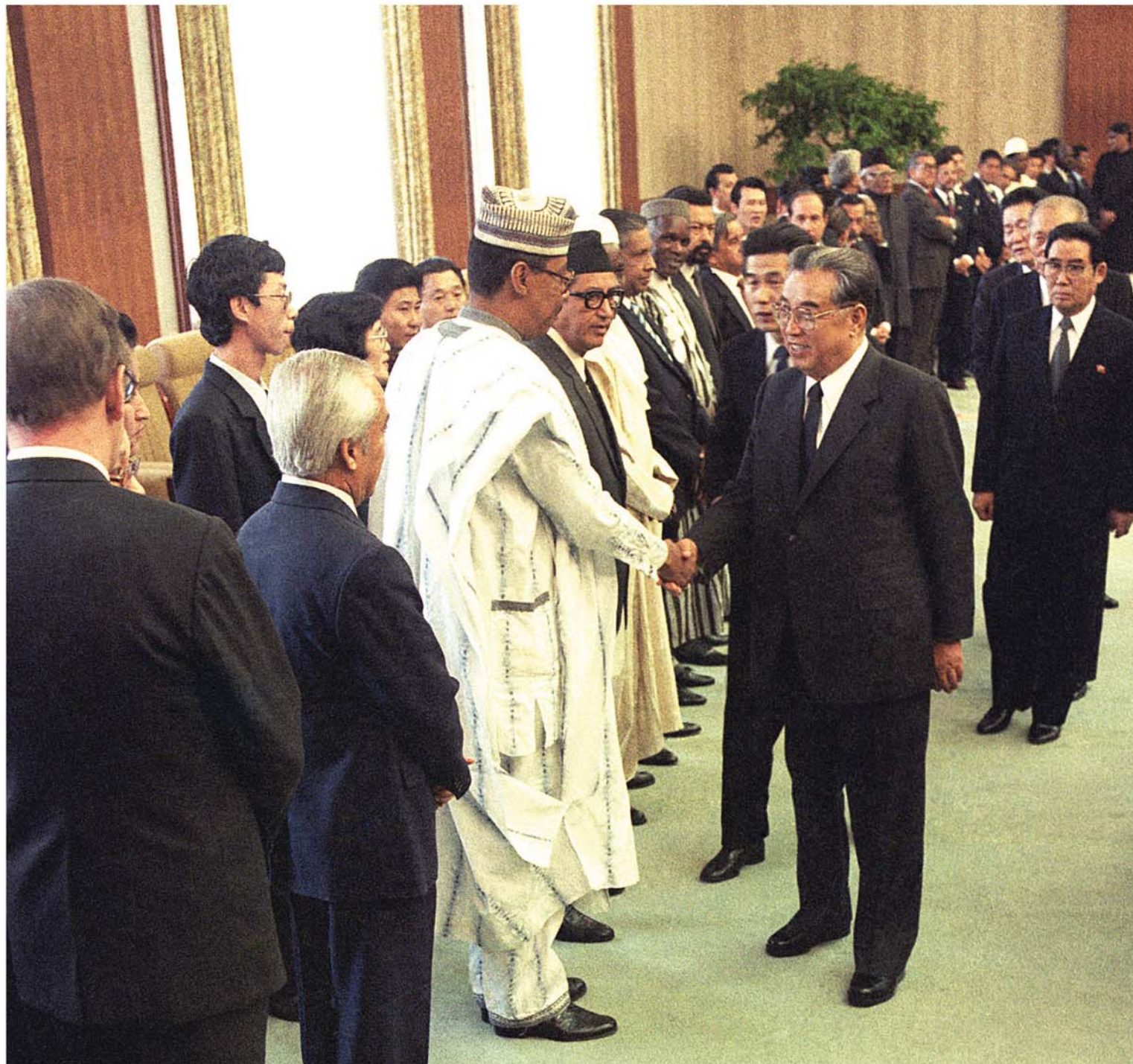
Kim Il Sung meeting heads of state and government and delegations of foreign countries [April Juche 76 (1987)]