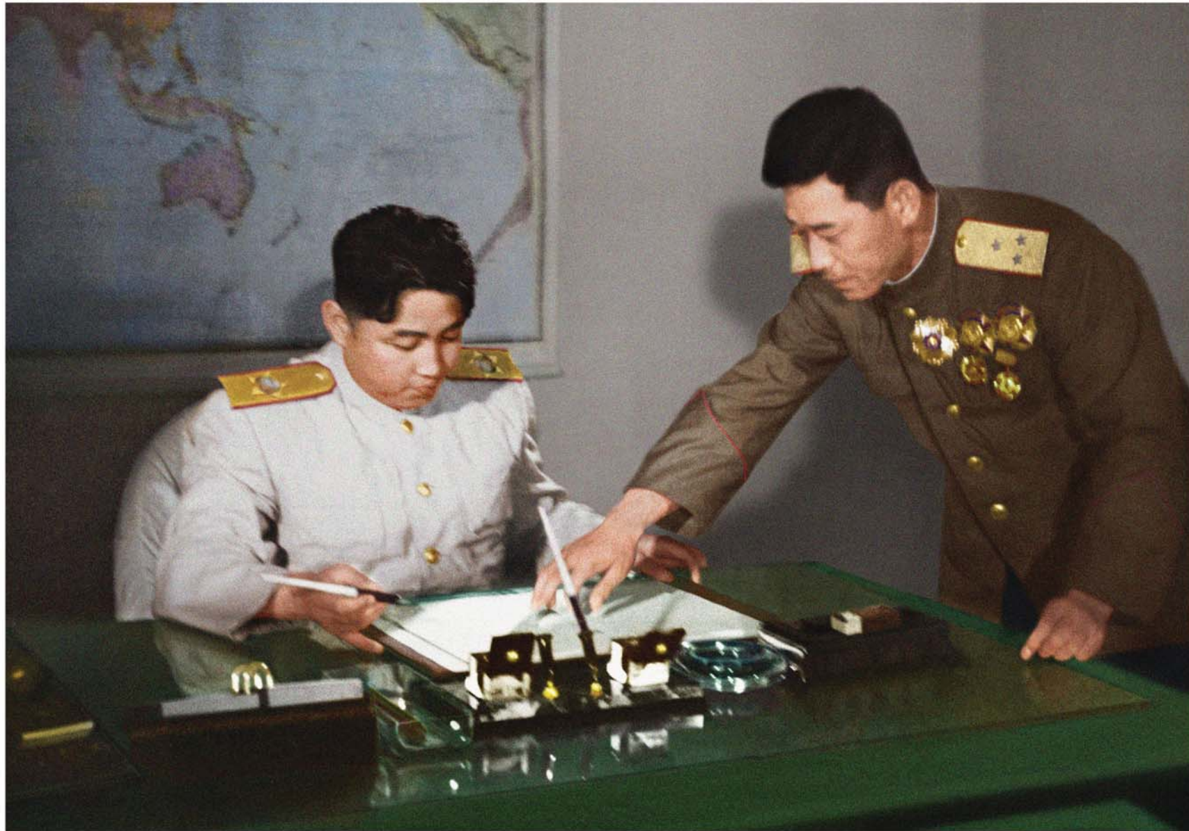
Kim Il Sung ratifying the Korean Armistice Agreement [July Juche 42 (1953)]