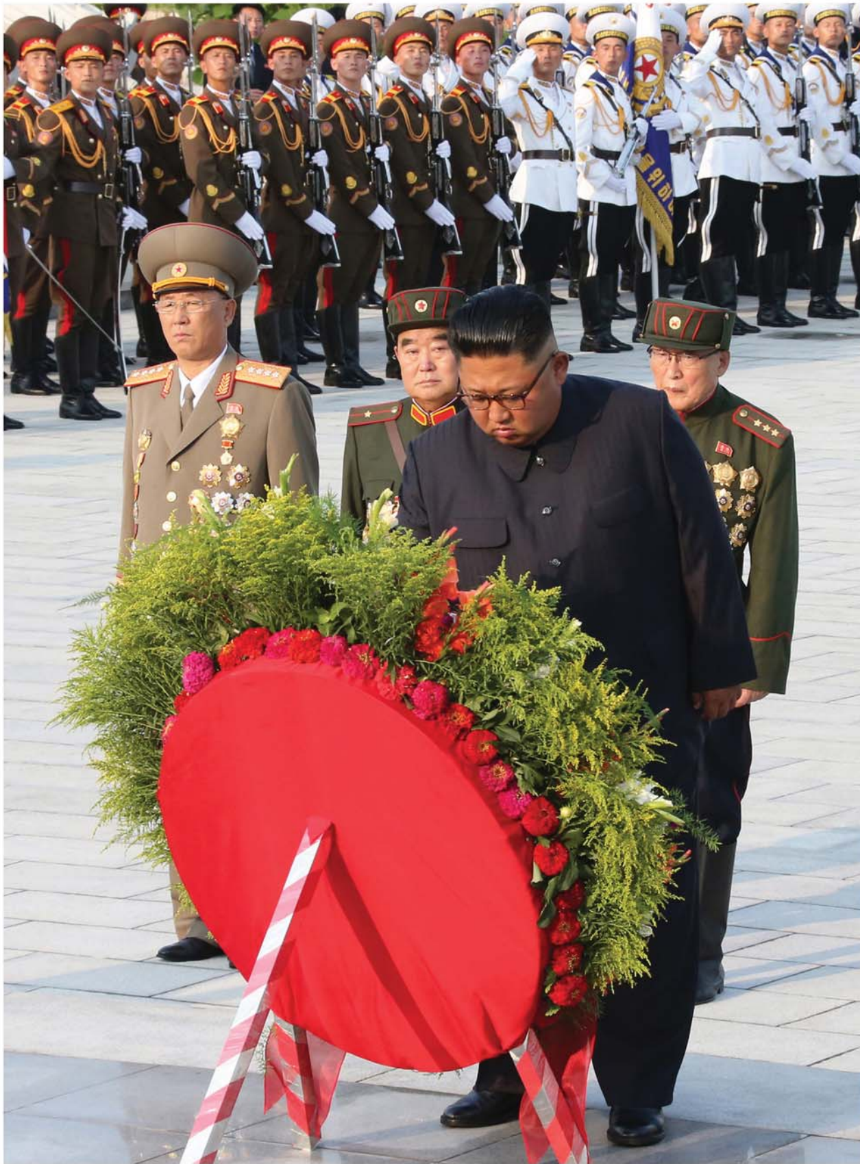
Supreme Leader Kim Jong Un visiting the Fatherland Liberation War Martyrs Cemetery to pay homage to the fallen soldiers of the KPA to mark the 65th anniversary of the victory in the war [July Juche 107 (2018)]

Kim Jong Un, Chairman of the Workers' Party of Korea, Chairman of the DPRK State Affairs Commission and Supreme Commander of the Korean People's Army, visited the Fatherland Liberation War Martyrs Cemetery to pay homage to the fallen soldiers of the KPA on July 26 to mark the 65th anniversary of the victory in the war.