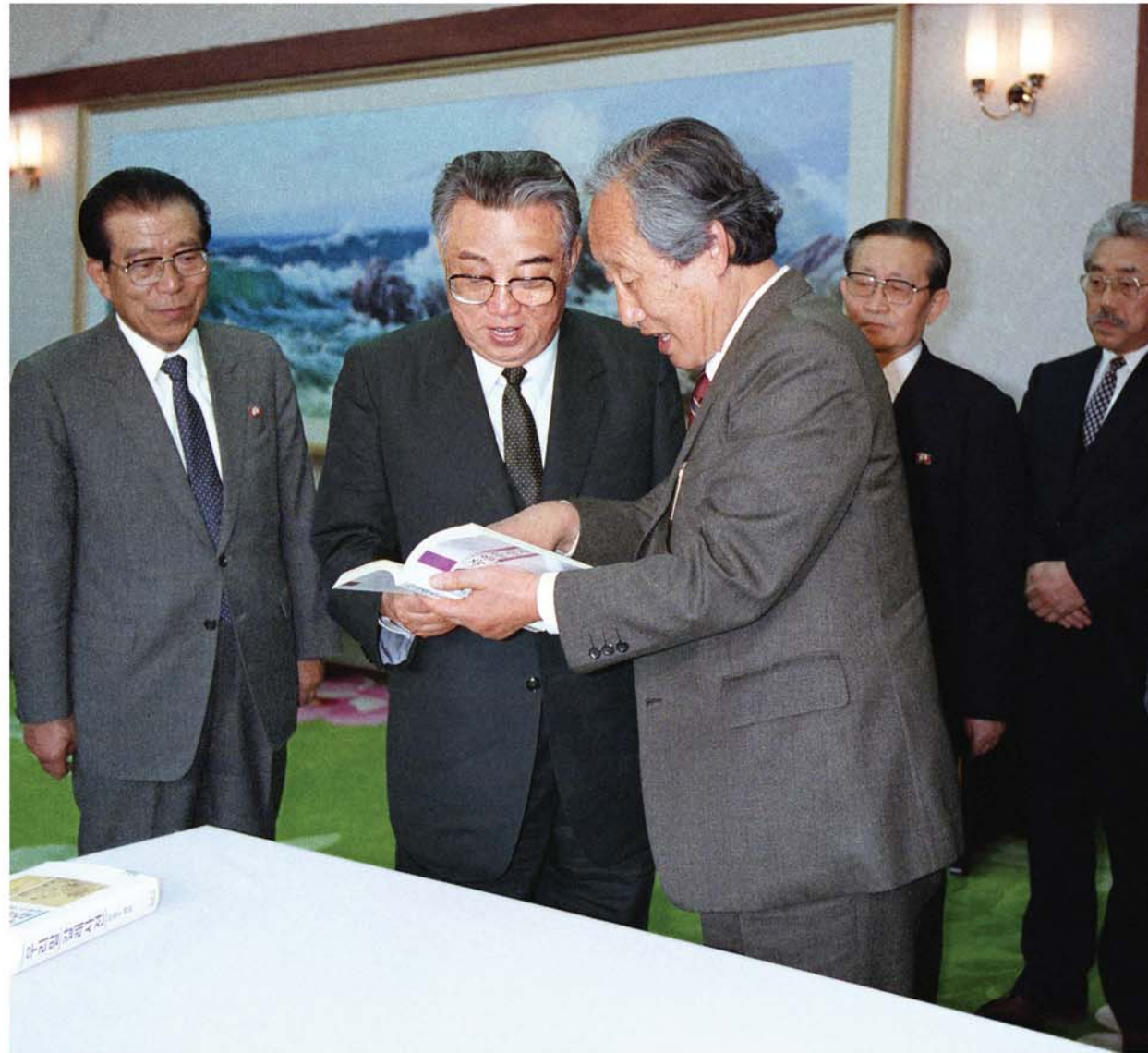
Kim Il Sung meeting with Rev. Moon Ik Hwan, advisor to the Coalition for the National Democratic Movement in south Korea [March Juche 78 (1989)]