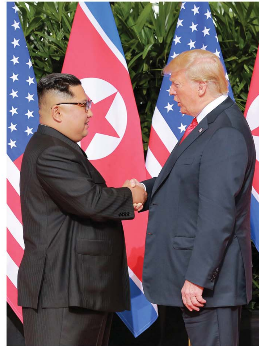
Kim Jong Un, Chairman of the State Affairs Commission of the DPRK, meeting and talking with Donald J. Trump, President of the United States of America [June Juche 107 (2018)]