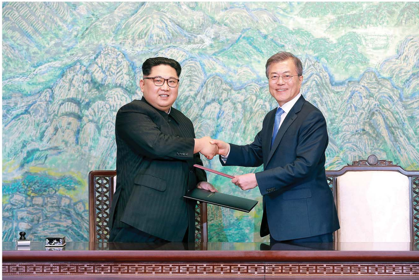
Supreme Leader Kim Jong Un signing the Panmunjom Declaration for Peace, Prosperity and Reunification of the Korean Peninsula and exchanging documents with President Moon Jae In [April Juche 107 (2018)]