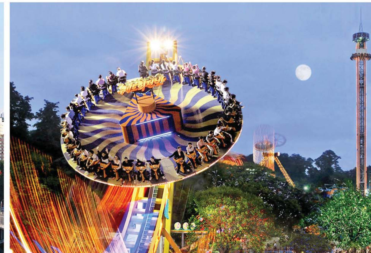
Thanks to the people-oriented policy of the DPRK government light industry factories, socialist streets, and bases for cultural and leisure activities are built all across the country to contribute to the people's material life and well-being