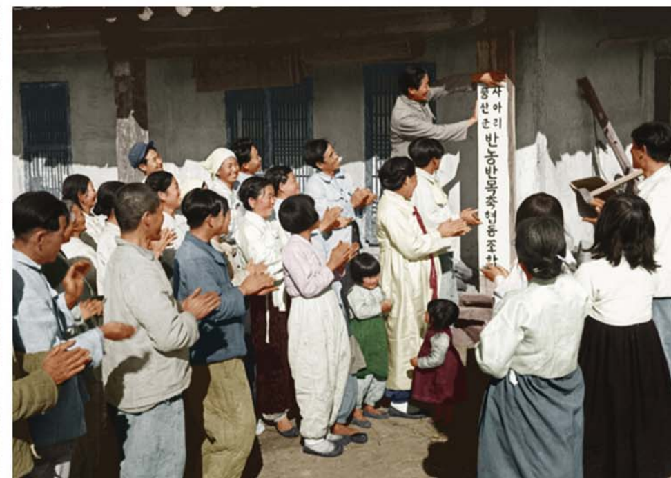
The Korean people waged vigorous campaigns for postwar reconstruction and socialist transformation of production relations