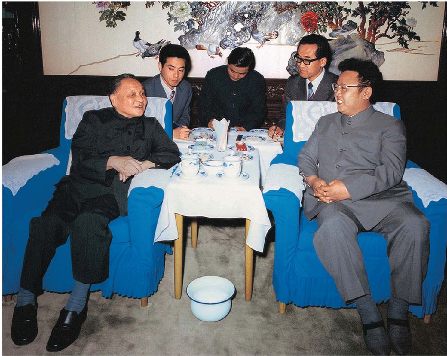
Kim Jong Il having an amicable talk with Deng Xiaoping, Chairman of the Central Advisory Commission of the Communist Party of China [June Juche 72 (1983)]