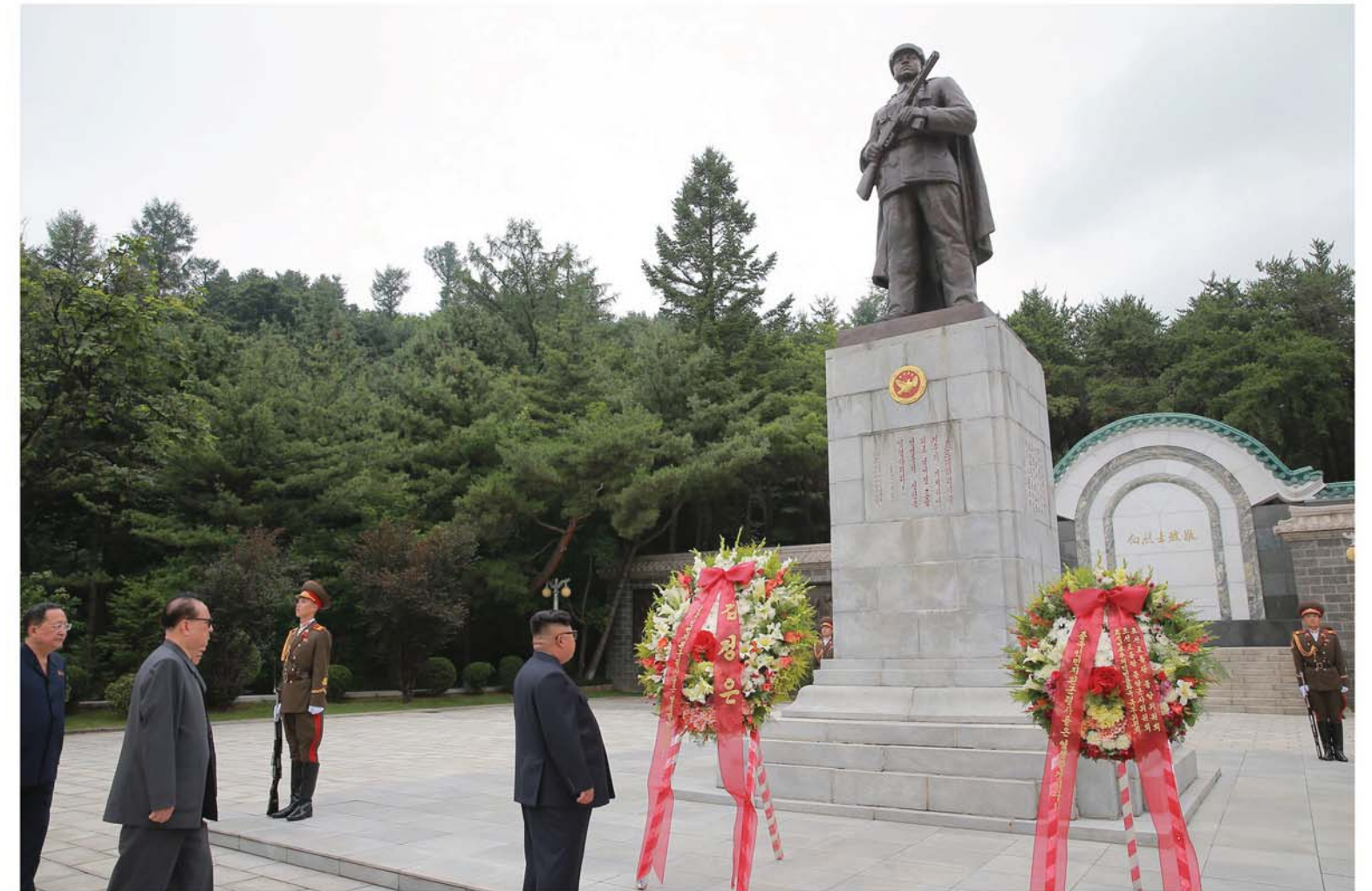
Supreme Leader Kim Jong Un laying the wreath at the Chinese People's Volunteers Martyrs Cemetery on the occasion of the 65th anniversary of the victory in the war [July Juche 107 (2018)]

martyr in the name of the Supreme Leader, which was followed by another wreath in the joint name of the WPK Central Committee, WPK Central Military Commission and the DPRK SAC. The Supreme Leader observed a moment's silence in memory of the CPV martyrs.