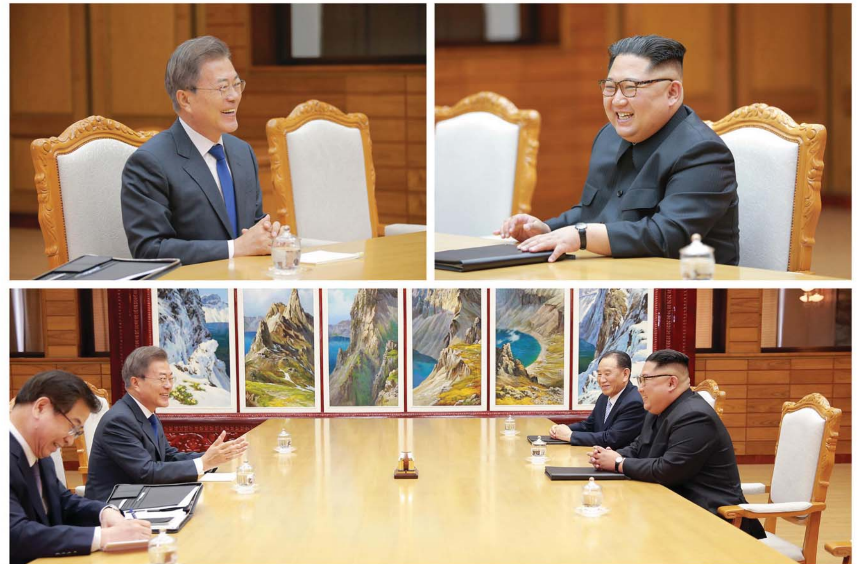
Supreme Leader Kim Jong Un meeting President Moon Jae In again and talking with him [May Juche 107 (2018)]

higher stage of development and accelerating the reunification movement.