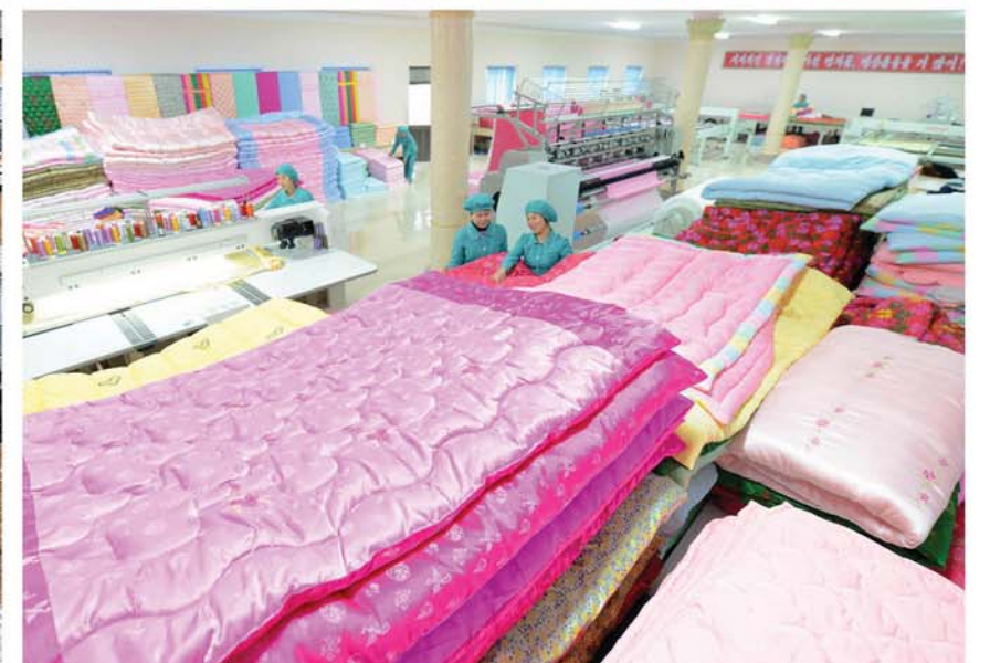
The Korean people are giving full play to the great dynamic force of science and technology and the spirit of self-reliance and development so as to make leaps forward and innovations in all the sectors of economic construction