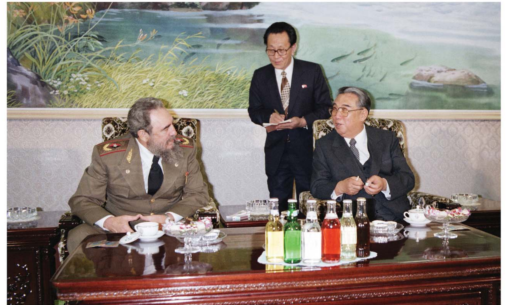
Kim Il Sung talking with Fidel Castro Ruz, President of the State Council of the Cuban Republic [March Juche 75 (1986)]

cope with them, the DPRK has consolidated its international profile and solidarity.