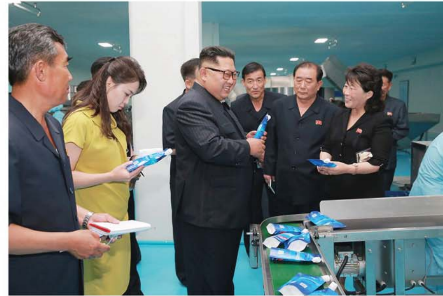
Supreme Leader Kim Jong Un looking round the Sinuiju Cosmetics Factory [June Juche 107 (2018)]

At the Samjiyon Potato Farina Factory the Supreme Leader looked round the production process of farina and set the task that the factory should be equipped with modern machines and facilities for producing delicious and nutritive processed potato products in large amounts.