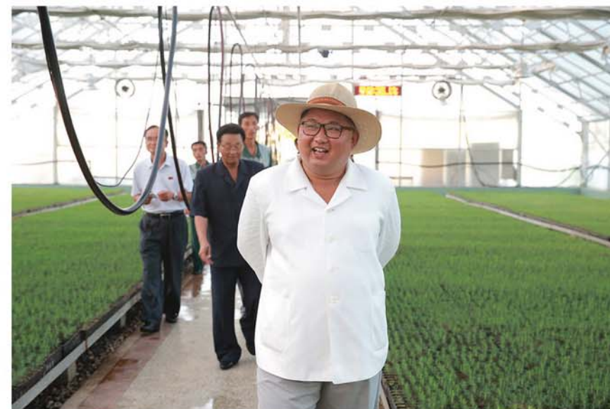
Supreme Leader Kim Jong Un visiting the Kangwon Provincial Tree Nursery [July Juche 107 (2018)]