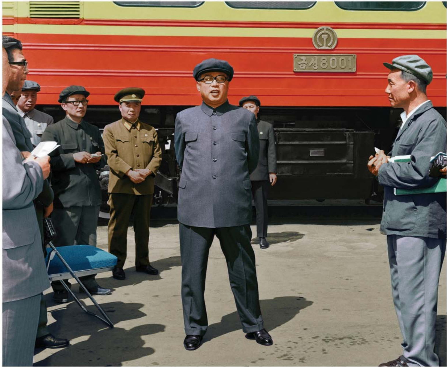
Kim Il Sung seeing Kumsong , a diesel locomotive engine newly manufactured at the Kim Jong Thae Electric Locomotive Factory [May Juche 64 (1975)]