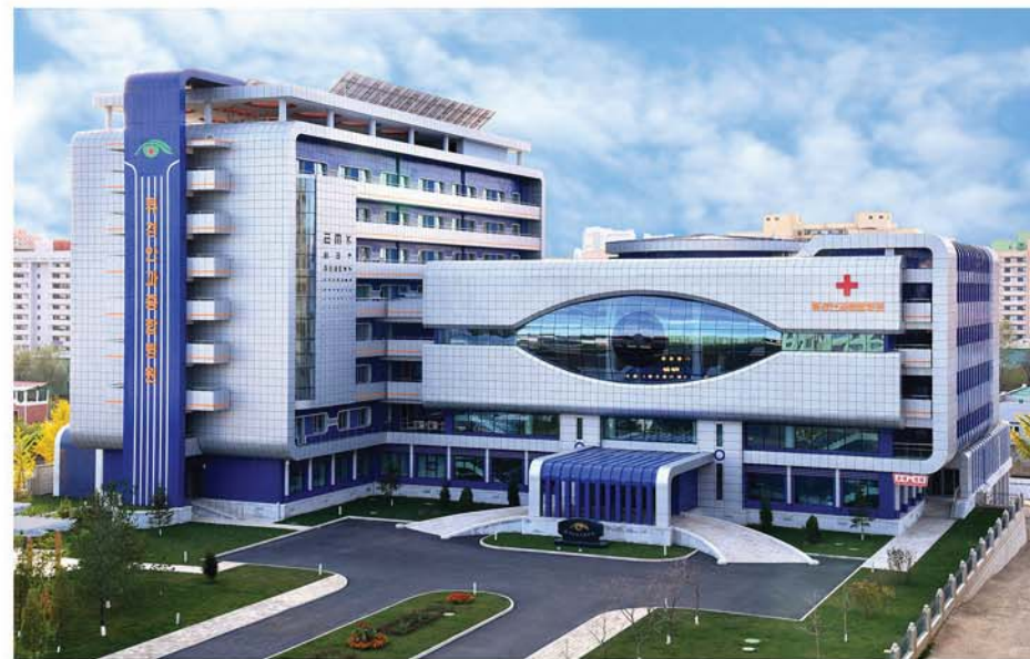
Medical establishments are built for the people to enjoy the benefits of free medical treatment