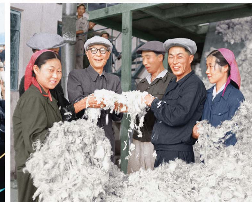
The Chollima era when victorious achievements of self-reliance were made