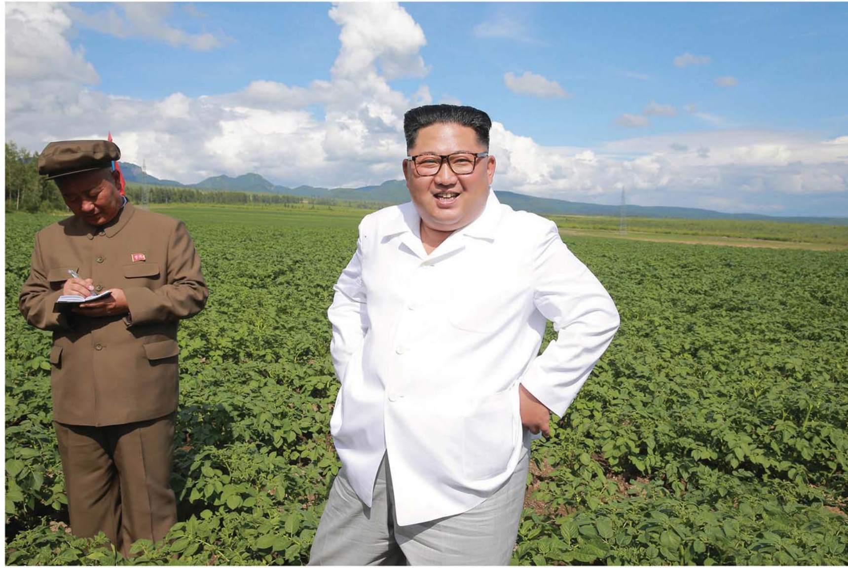
Supreme Leader Kim Jong Un visiting the Junghung Farm in Samjiyon County [July Juche 107 (2018)]