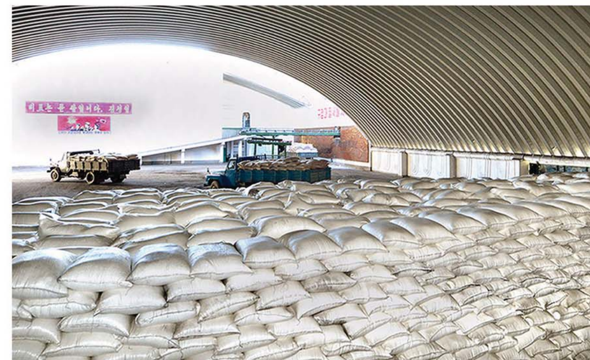
By consolidating independence and Juche character of the national economy in the face of the imperialist manoeuvres to isolate and stifle it, the DPRK laid solid foundations for producing Juche iron, vinalon and fertilizer