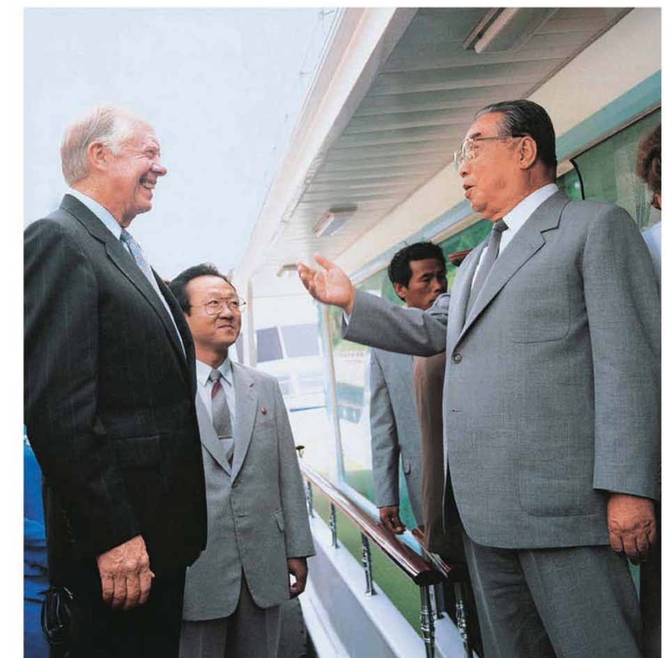
Kim Il Sung meeting Jimmy Carter, former President of the USA [June Juche 83 (1994)]