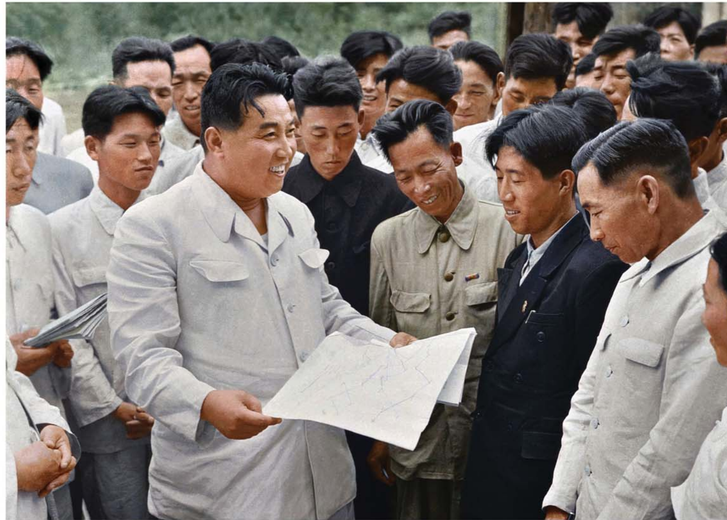
Kim Il Sung talking with workers of the Hwanghae Iron Works [September Juche 48 (1959)]

Seventy-year-long history of the Democratic People's Republic of Korea records the one of building a self-sufficient national economy from scratch.