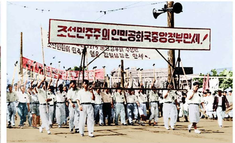
The DPRK's founding filled the people with great pride and delight in being masters of the government