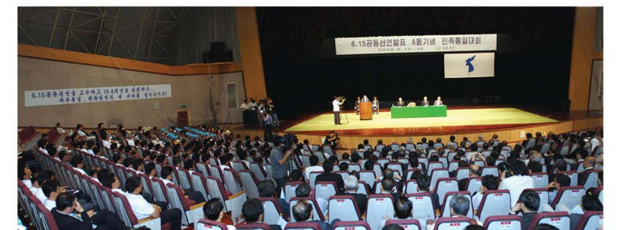
Vigorous struggle was conducted to defend the June 15 North-South Joint Declaration and implement the October 4 Declaration to open up a new era of independent reunification, peace and prosperity