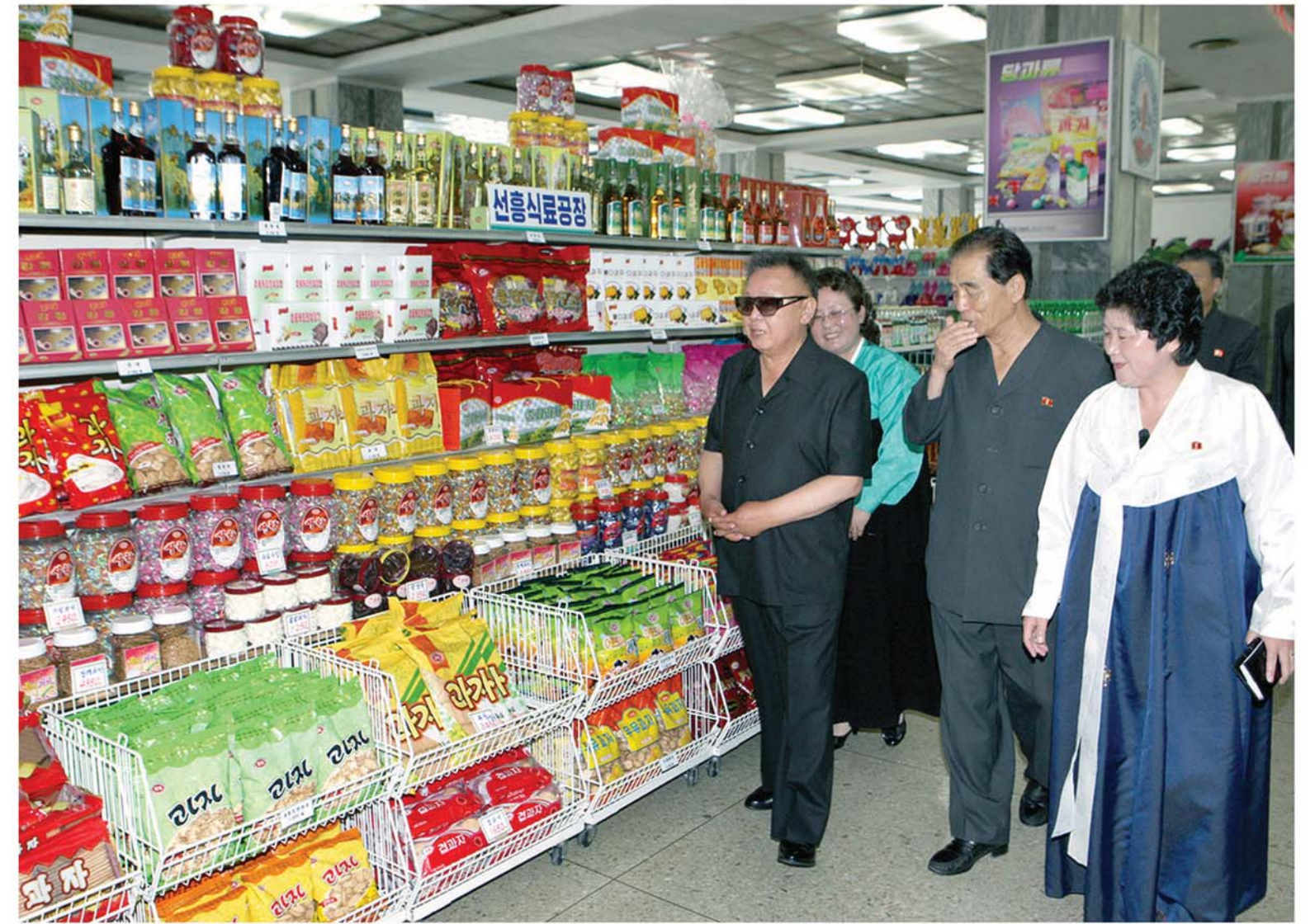
Kim Jong Il looking round the second goods show at Pyongyang Department Store No. 1 [July Juche 100 (2011)]