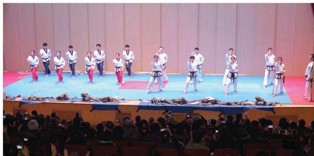
During the 23rd Winter Olympics held in south Korea the Samjiyon Orchestra gave an excellent performance reflecting the ardent wish of the people in the north, and Taekwon-Do practitioners of the north and the south staged a joint exhibition, displaying the mettle and courage of the Korean nation