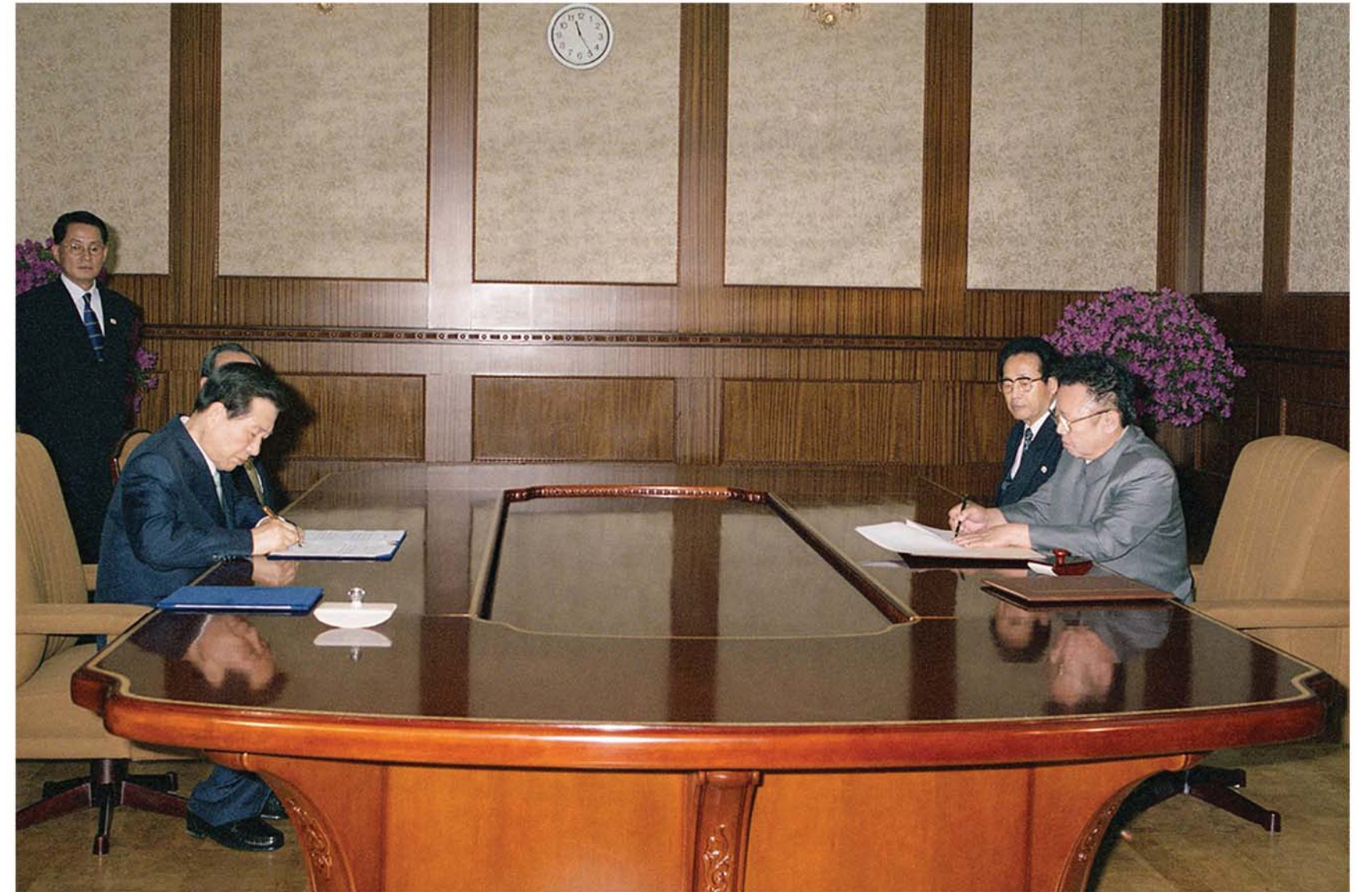
Kim Jong Il signing the North-South Joint Declaration [June Juche 89 (2000)]