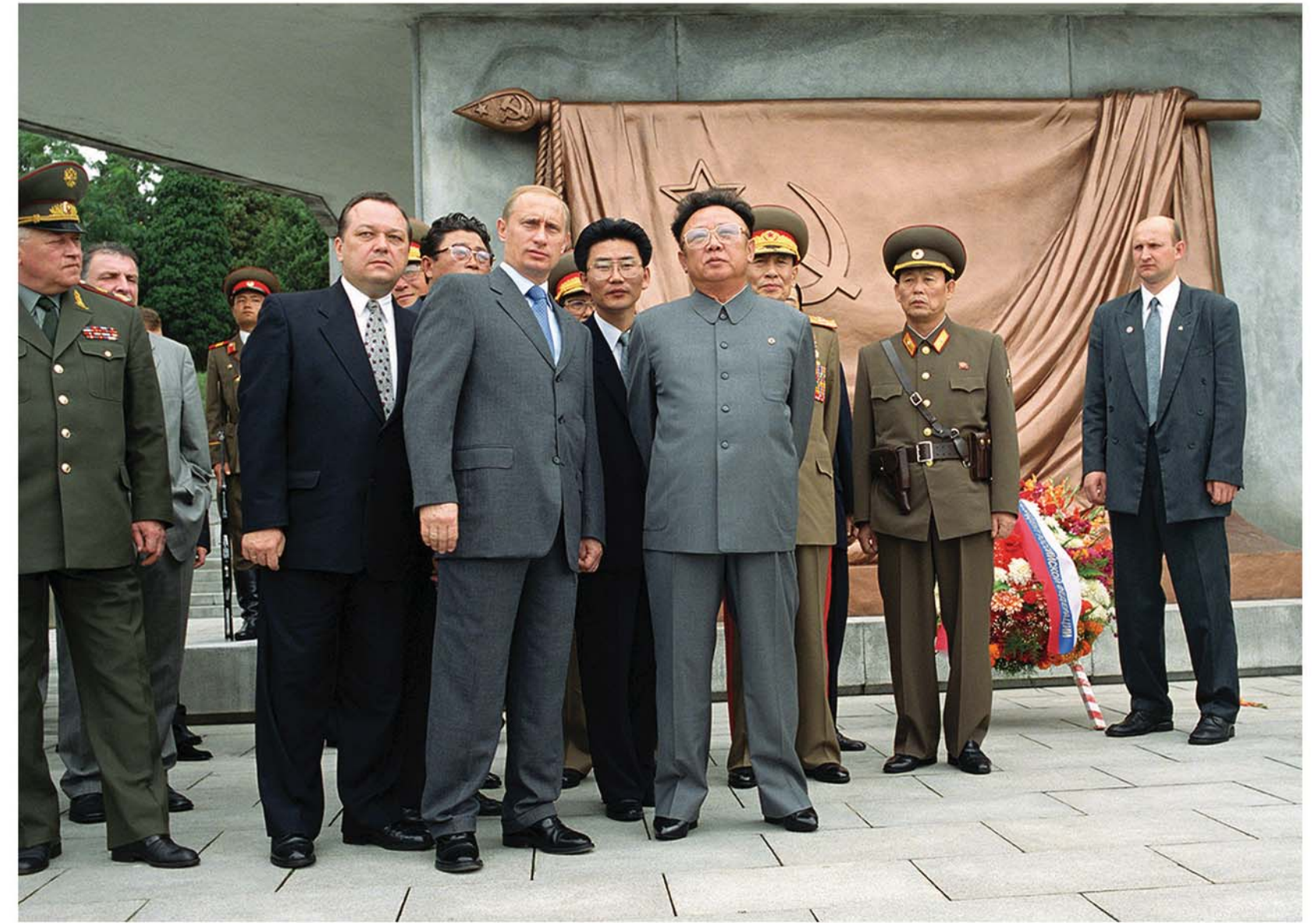
Kim Jong Il looking round the Tower of Liberation with President V. V. Putin of Russian Federation [July Juche 89 (2000)]

In the grim period when the international socialist movement was experiencing severe frustration the DPRK waged a powerful struggle to defend and advance the cause of socialism and thus encouraged the revolutionary peoples in their struggle to rebuild socialism.