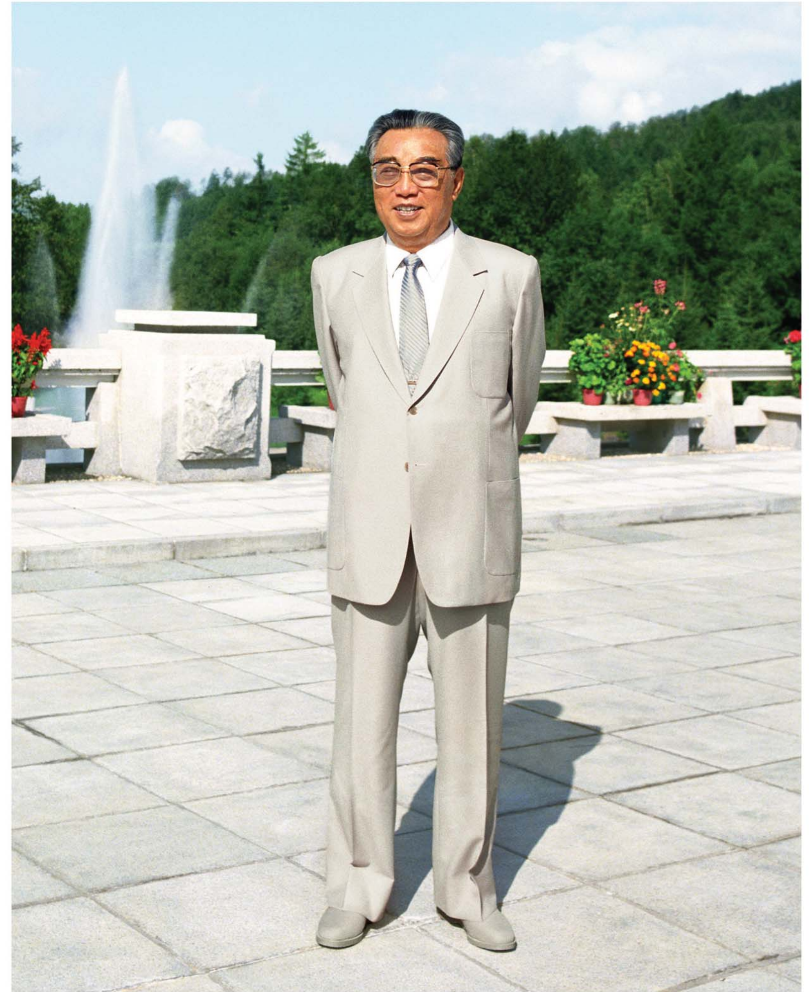
Kim Il Sung, founder of the Democratic People's Republic of Korea