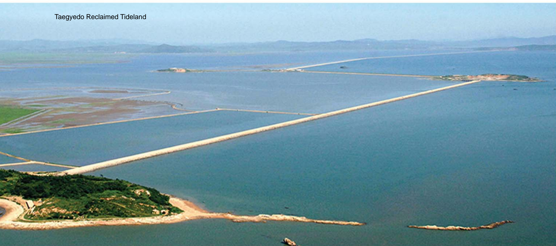
Taegyedo Reclaimed Tideland