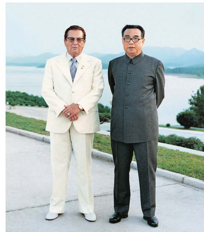
Kim Il Sung posing for a photo with Josip Broz Tito, President of the Socialist Federal Republic of Yugoslavia [August Juche 66 (1977)]

As it maintains independence in working out external policies and settling international issues, never tolerates any attempts to either violate or infringe upon the country's sovereignty, however trifle they may be, and resolutely