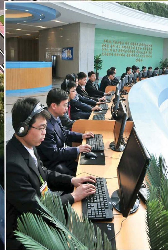
The universal 11-year compulsory education, the first of its kind in the world, was enforced in 1972 and the universal 12-year compulsory education in 2014. The DPRK is now arousing state interest in education and increasing investment in placing education on a scientific, IT and modern basis.