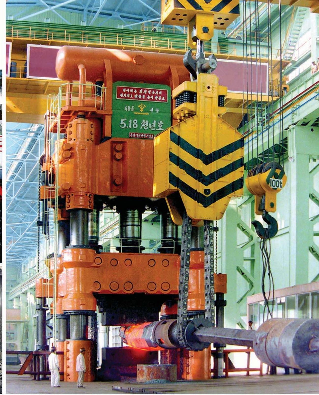
Material and technological foundations for socialism were laid in the heavy and light industries, agriculture and other sectors of the national economy