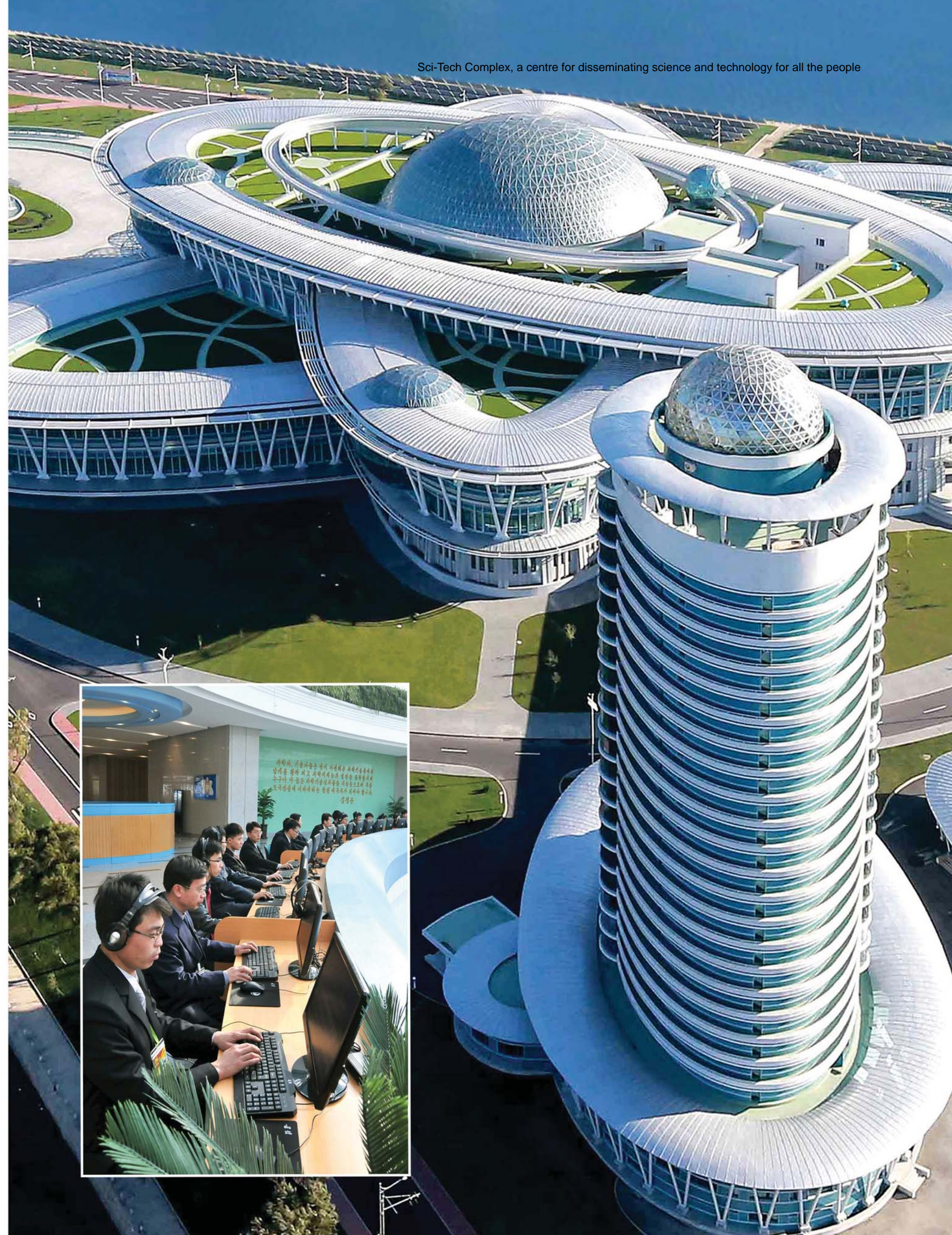
Sci-Tech Complex, a centre for disseminating science and technology for all the people