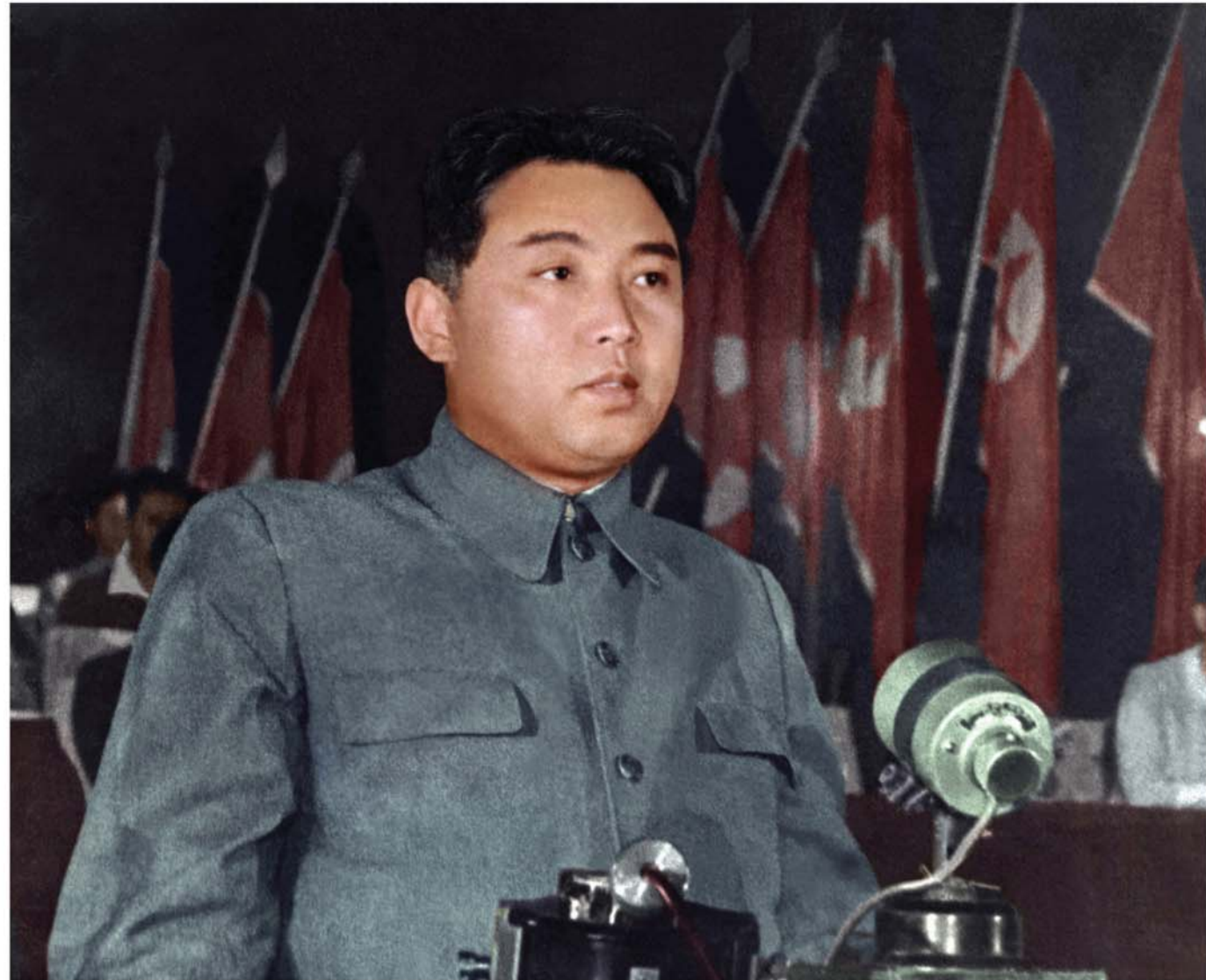
Kim Il Sung making public the political programme at the first session of the Supreme People's Assembly of the DPRK [September Juche 37 (1948)]

The name of the country, the Democratic People's Republic of Korea, clearly reflected its independent, democratic and people-oriented character, and its flag and emblem incorporated in them the symbols of the republic being a dignified, independent and sovereign state. The national anthem was also created to vividly depict the pride and dignity of the nation blessed with a beautiful country and sage fighting traditions.