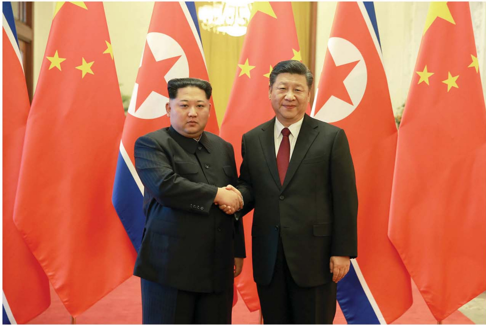
Kim Jong Un, Chairman of the State Affairs Commission of the DPRK, meeting and talking with Xi Jinping, President of the People's Republic of China [March Juche 107 (2018)]