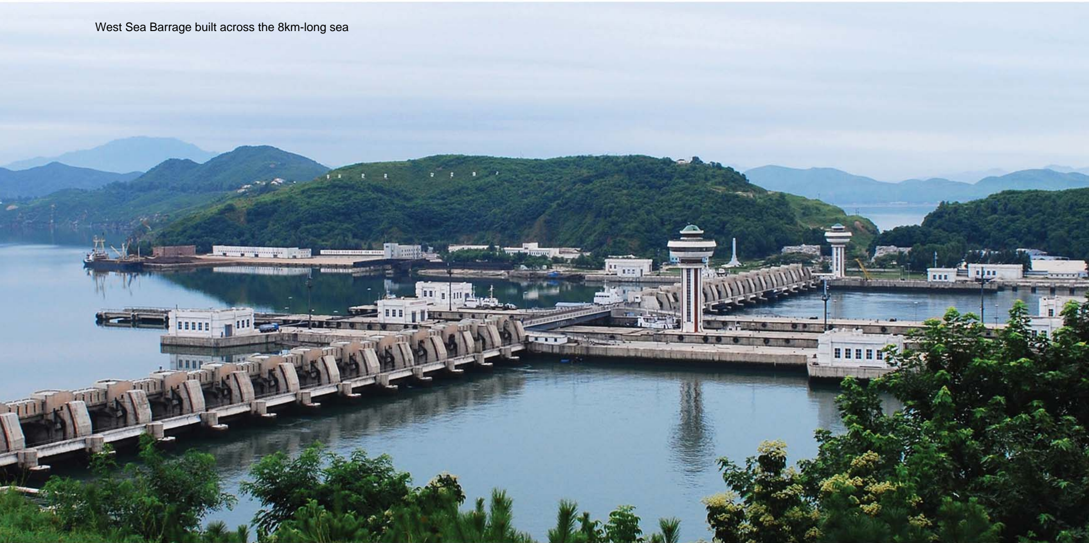
West Sea Barrage built across the 8km-long sea