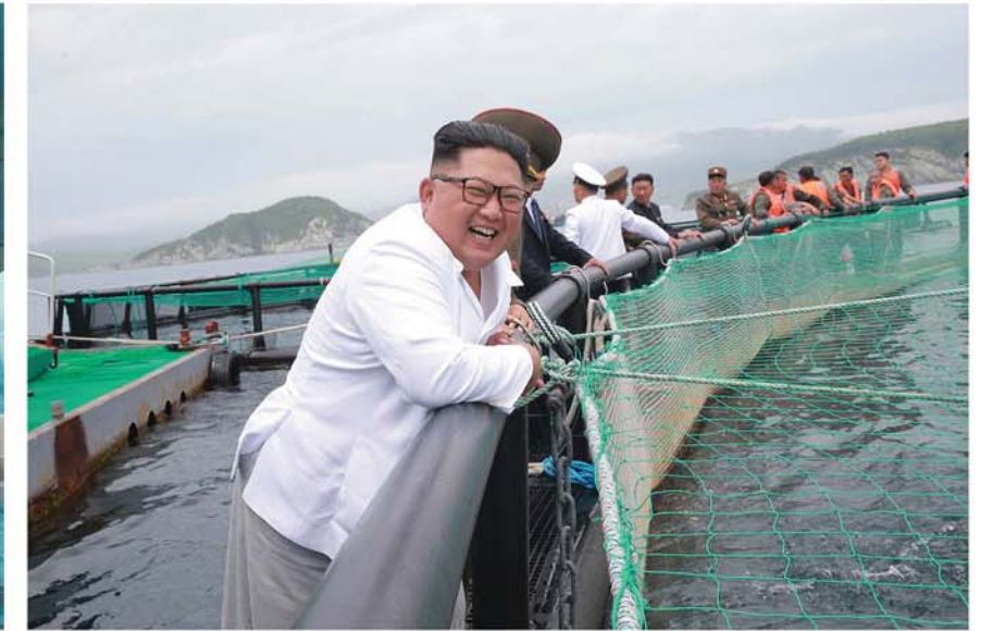
Supreme Leader Kim Jong Un visiting the Atlantic Salmon Pedigree Farm [July Juche 107 (2018)]