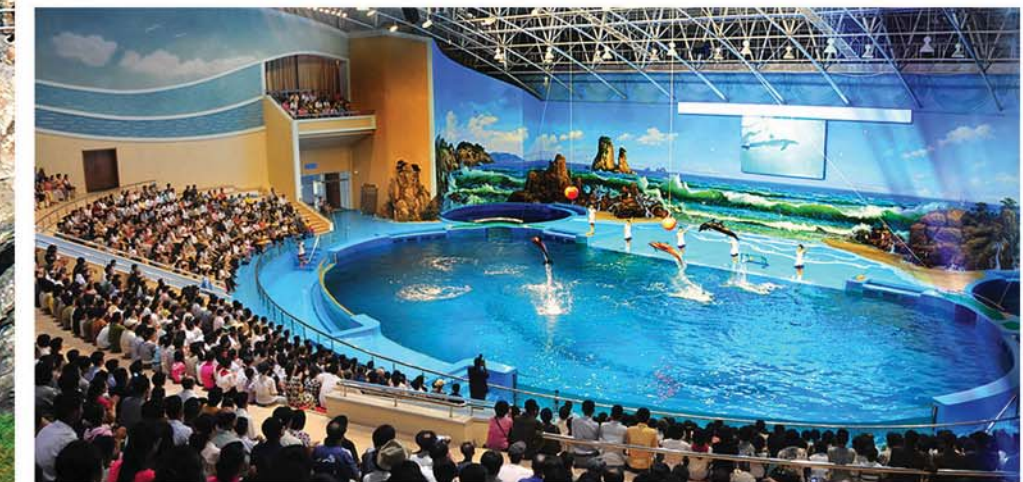
Bases for people's cultural and leisure activities are built splendidly