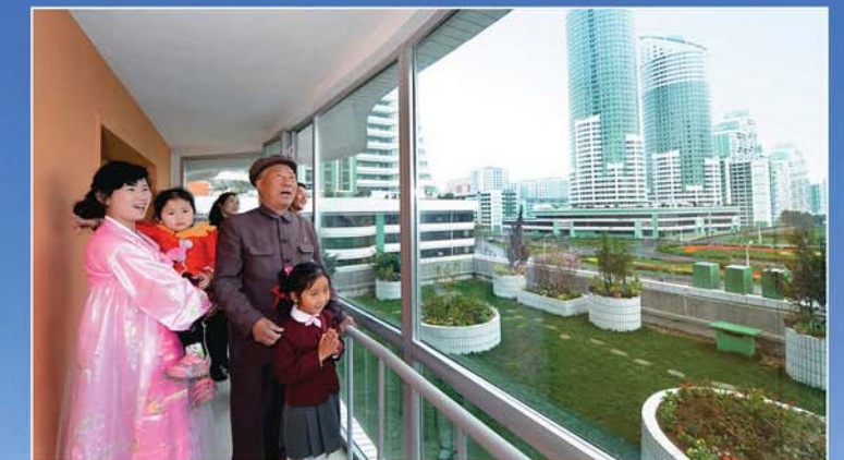
Dwelling houses are provided to people by state free of charge