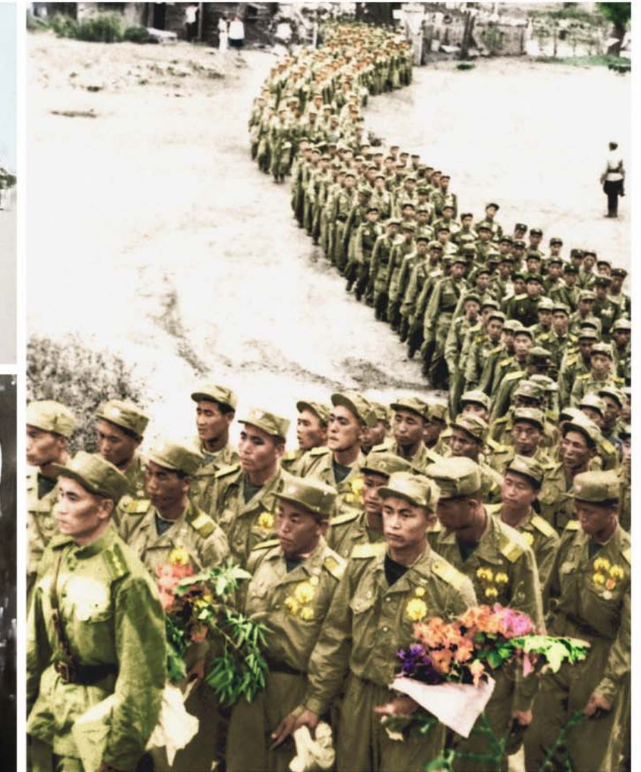
The Korean people achieved great victory in the Fatherland Liberation War against armed invasion of the imperialist forces by displaying mass heroism and the spirit of defending the country