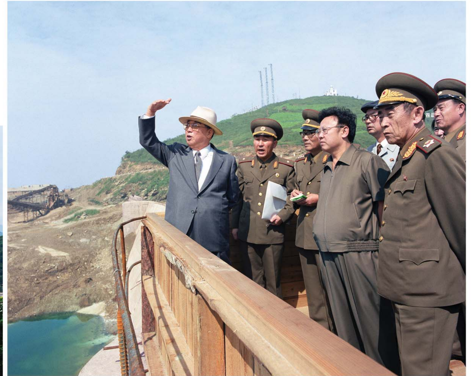
Kim Il Sung and Kim Jong Il visiting the construction site of the West Sea Barrage [September Juche 74 (1985)]