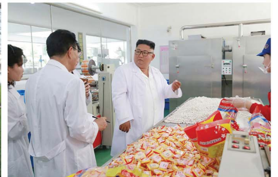
Supreme Leader Kim Jong Un visiting the Songdowon General Foodstuff Factory [July Juche 107 (2018)]

Supreme Leader Kim Jong Un provided field guidance in North Hamgyong Province, including the construction sites of the Orangchon Power Station and Yombunjin Hotel, Onpho Holiday Camp and Chongjin Bag Factory, and made a field survey of the site for a large-scale vegetable greenhouse farm in Jungphyong-ri of Kyongsong County.