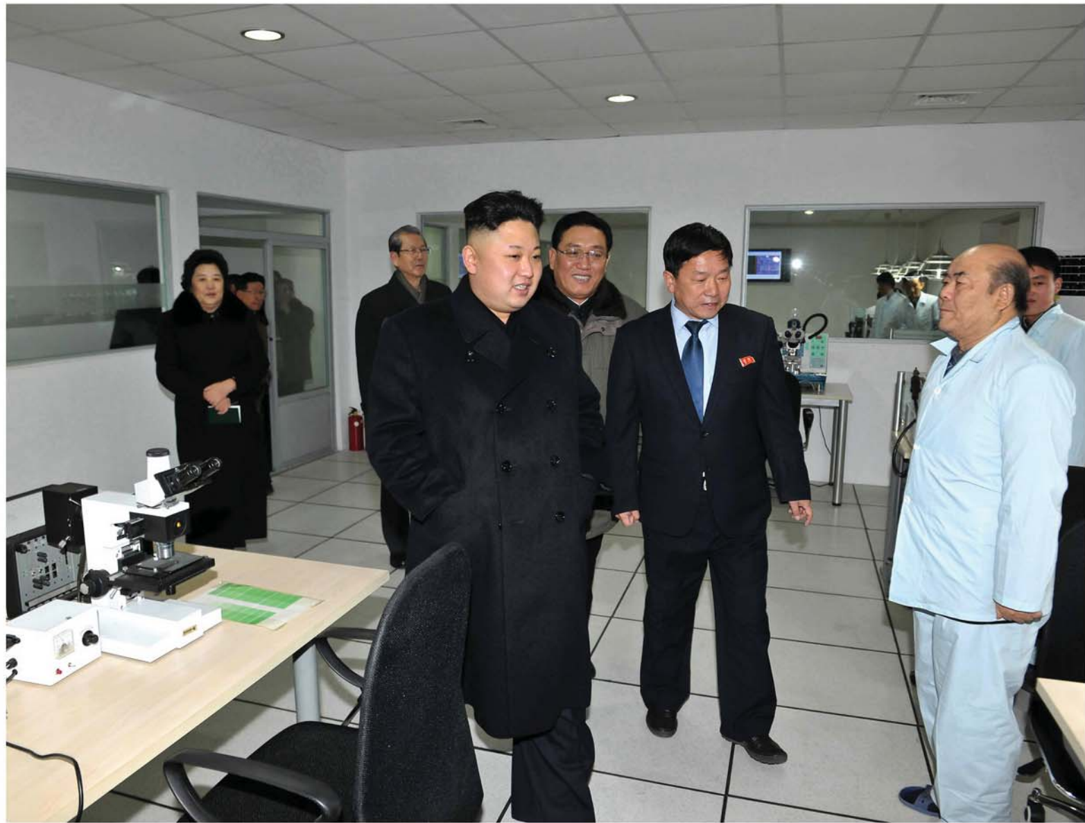
Kim Jong Un visiting the State Academy of Sciences [January Juche 103 (2014)]