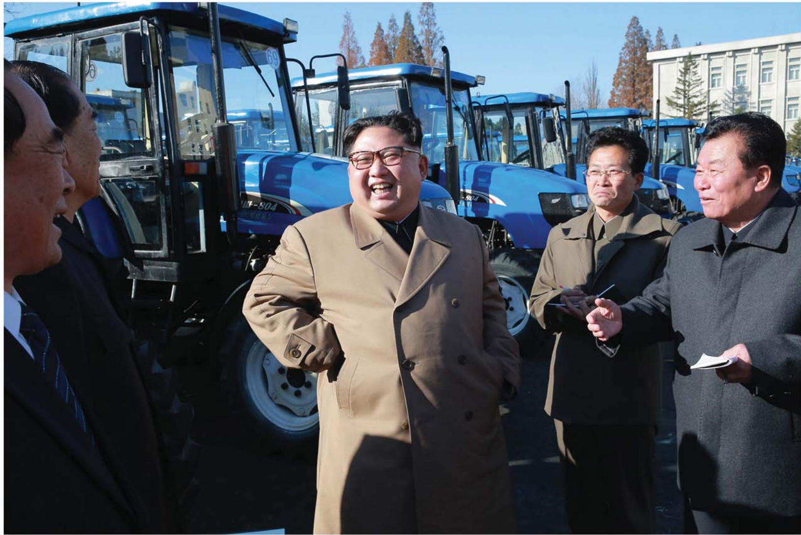
Kim Jong Un giving field guidance at Kumsong Tractor Factory [November Juche 106 (2017)]