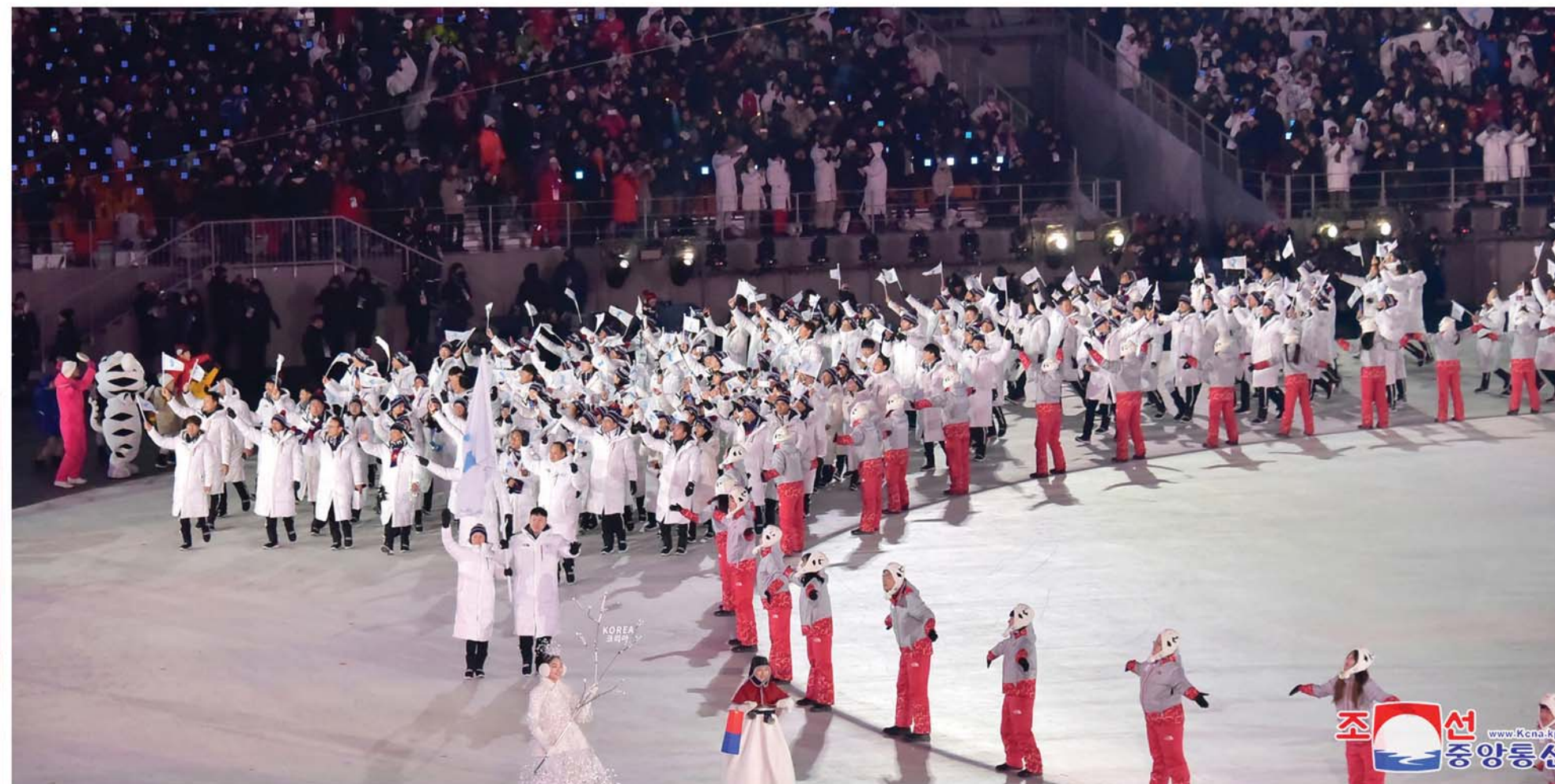
Sportspersons of the north and south of Korea jointly entering the opening ceremony of the 23rd Winter Olympics held in Pyongchang of south Korea, preceded by the One Korea flag