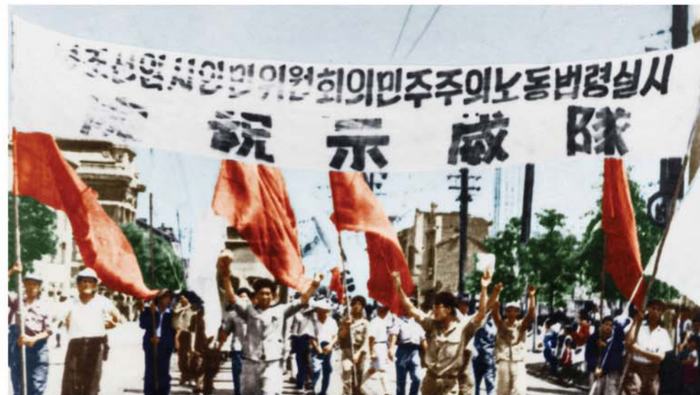
After Korea's liberation from Japanese military occupation such democratic reforms as the agrarian reform were carried out, making the working people masters of land and factories