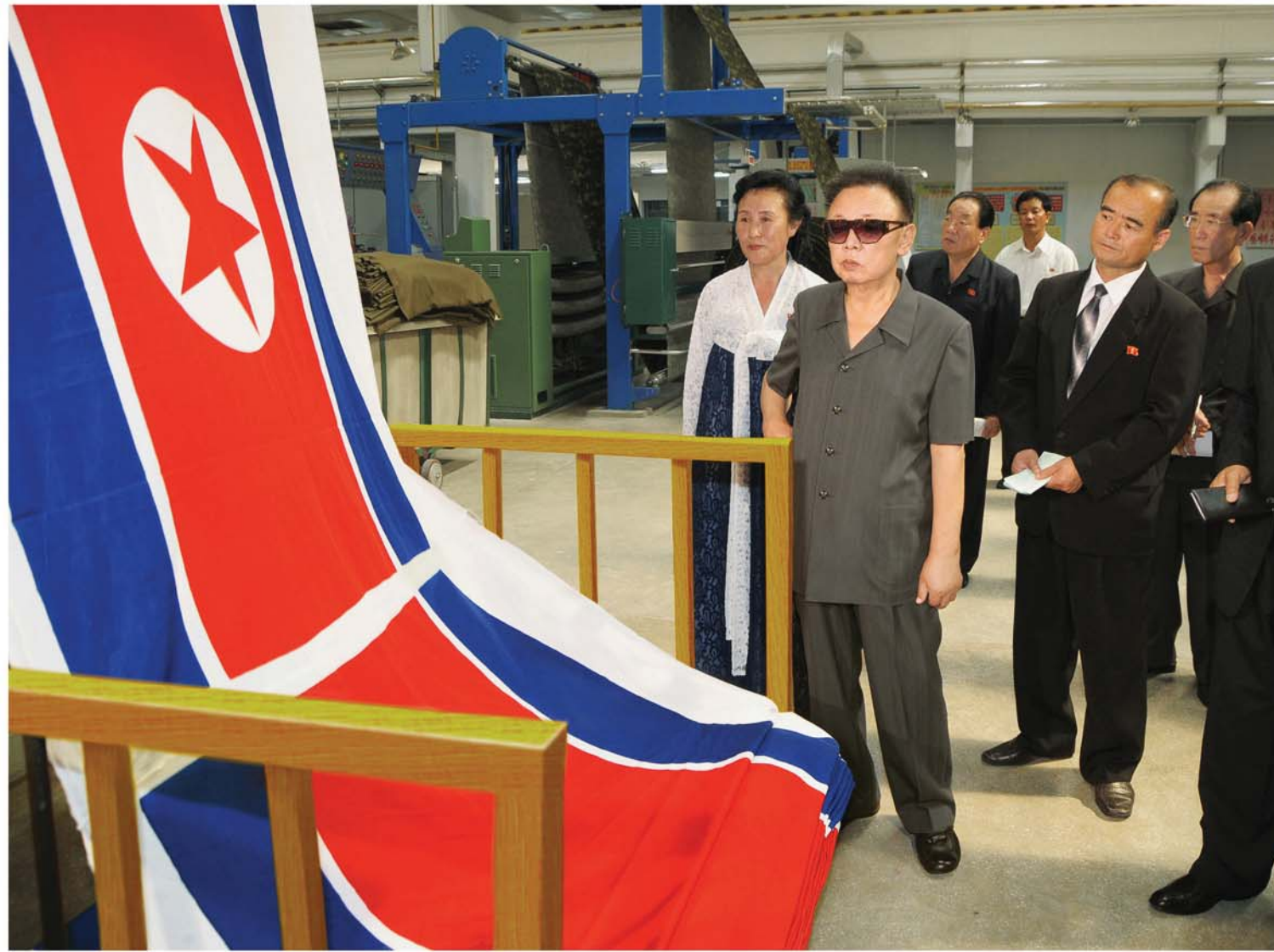
Kim Jong Il giving field guidance at the Pyongyang Textile Mill [July Juche 98 (2009)]