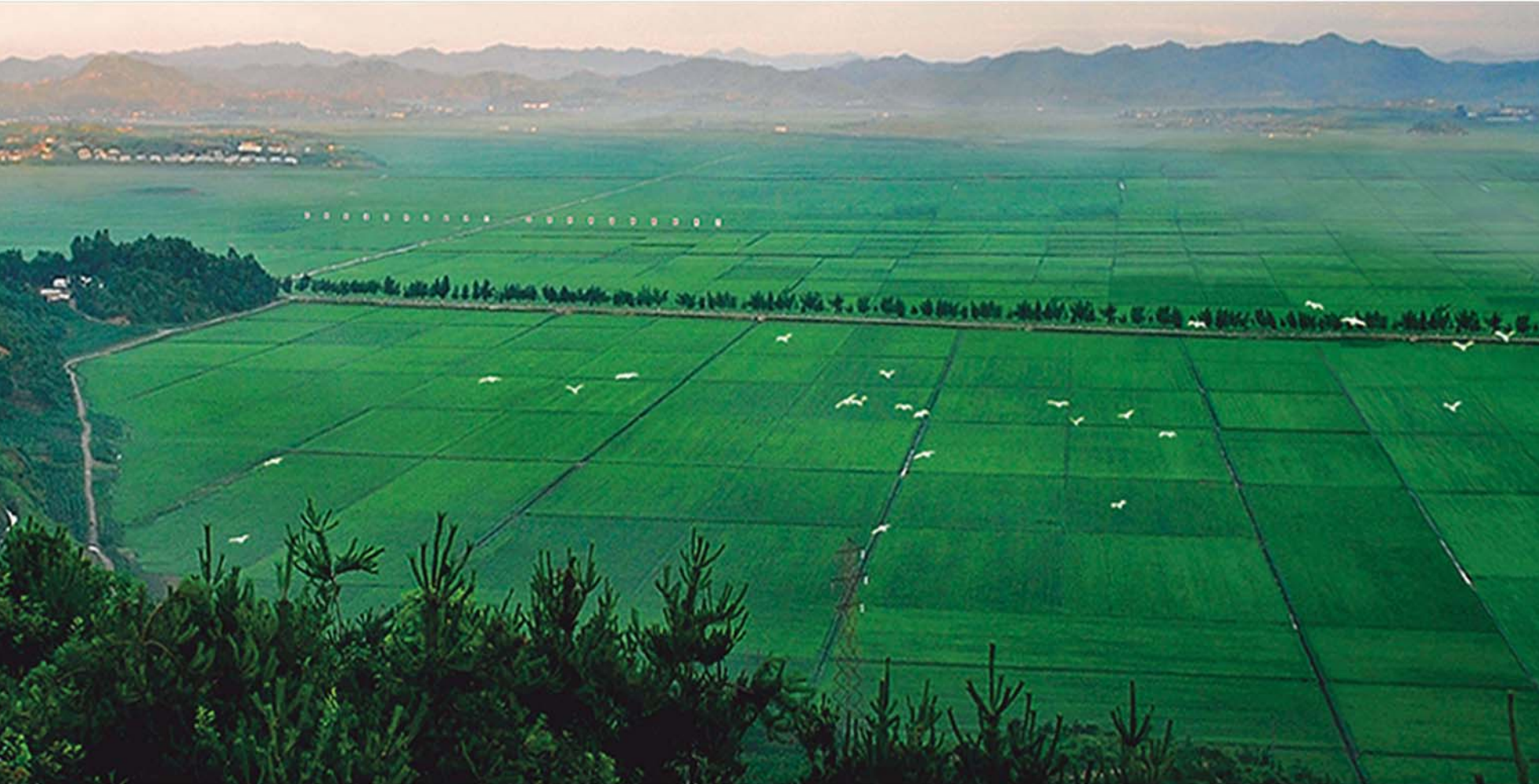
Land realignment project was carried out to turn the fields of the country into standardized ones