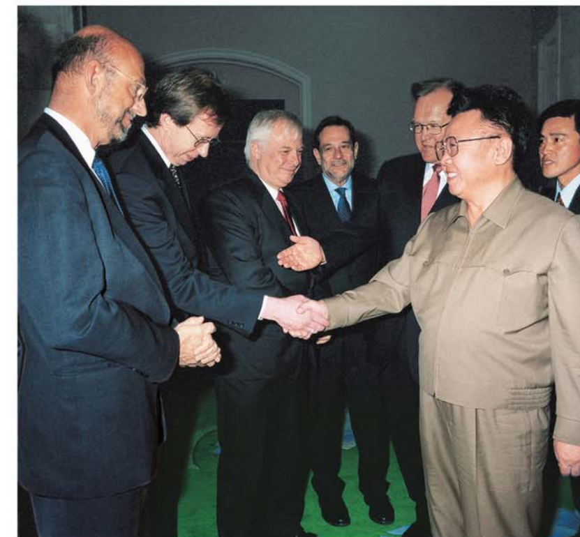
Kim Jong Il meeting EU's high-ranking officials' delegation [May Juche 90 (2001)]