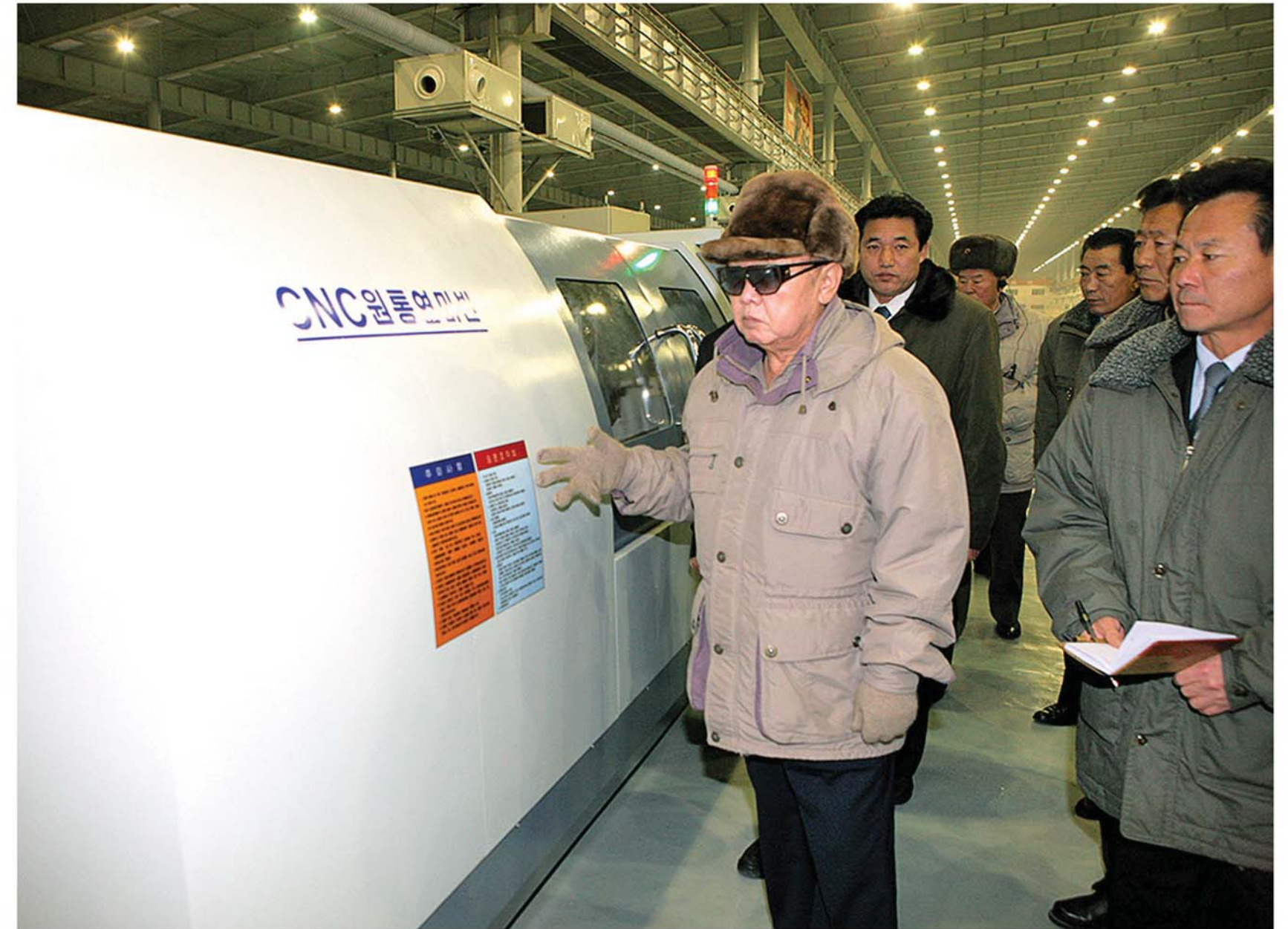
Kim Jong Il looking at new-type CNC machine tools [December Juche 99 (2010)]