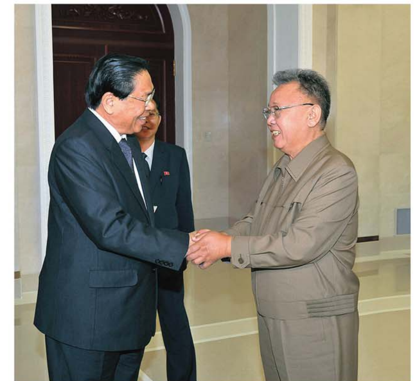
Kim Jong Il meeting President Choummaly Sayasone of the Lao People's Democratic Republic [September Juche 100 (2011)]