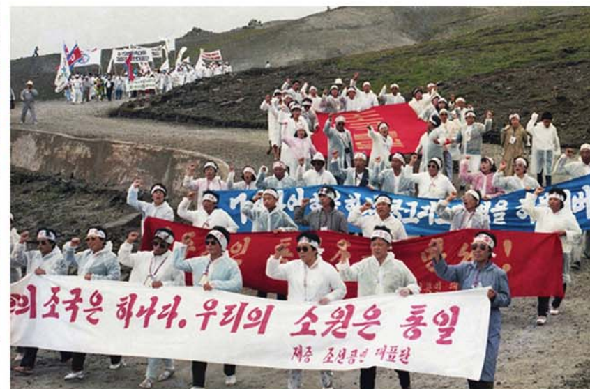
Nationwide movement was launched to put an end to national division by outside forces and achieve the country's reunification without fail

of all foreign troops from the country and the accomplishment of the country's reunification by the Korean nation's own efforts as a policy of the government. Afterwards, it put forth lines and policies for national reunification reflecting the nation's demand and desire for independence at every period and stage of its development and directed continuous efforts to carry them out.