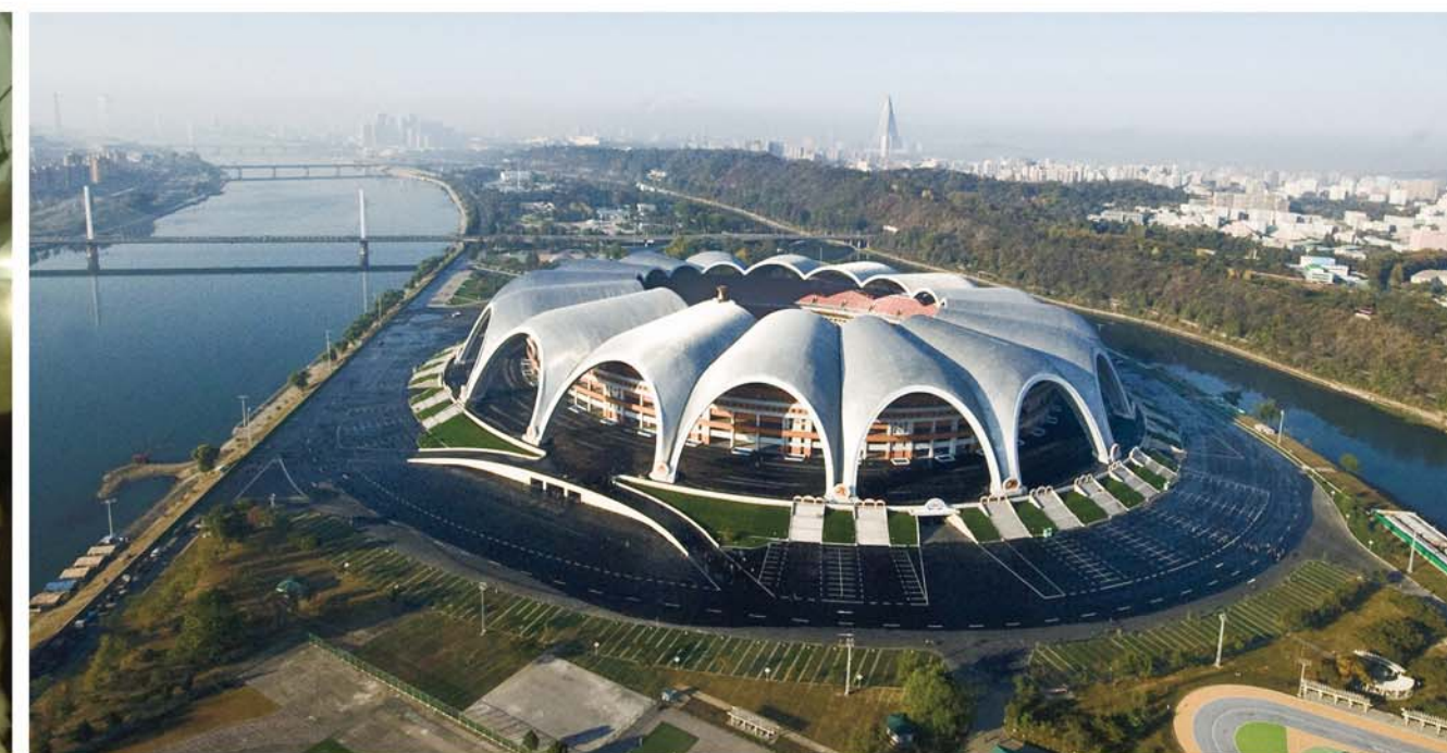
Such monumental edifices as the Kwangbok Street, Pyongyang Underground and May Day Stadium were built