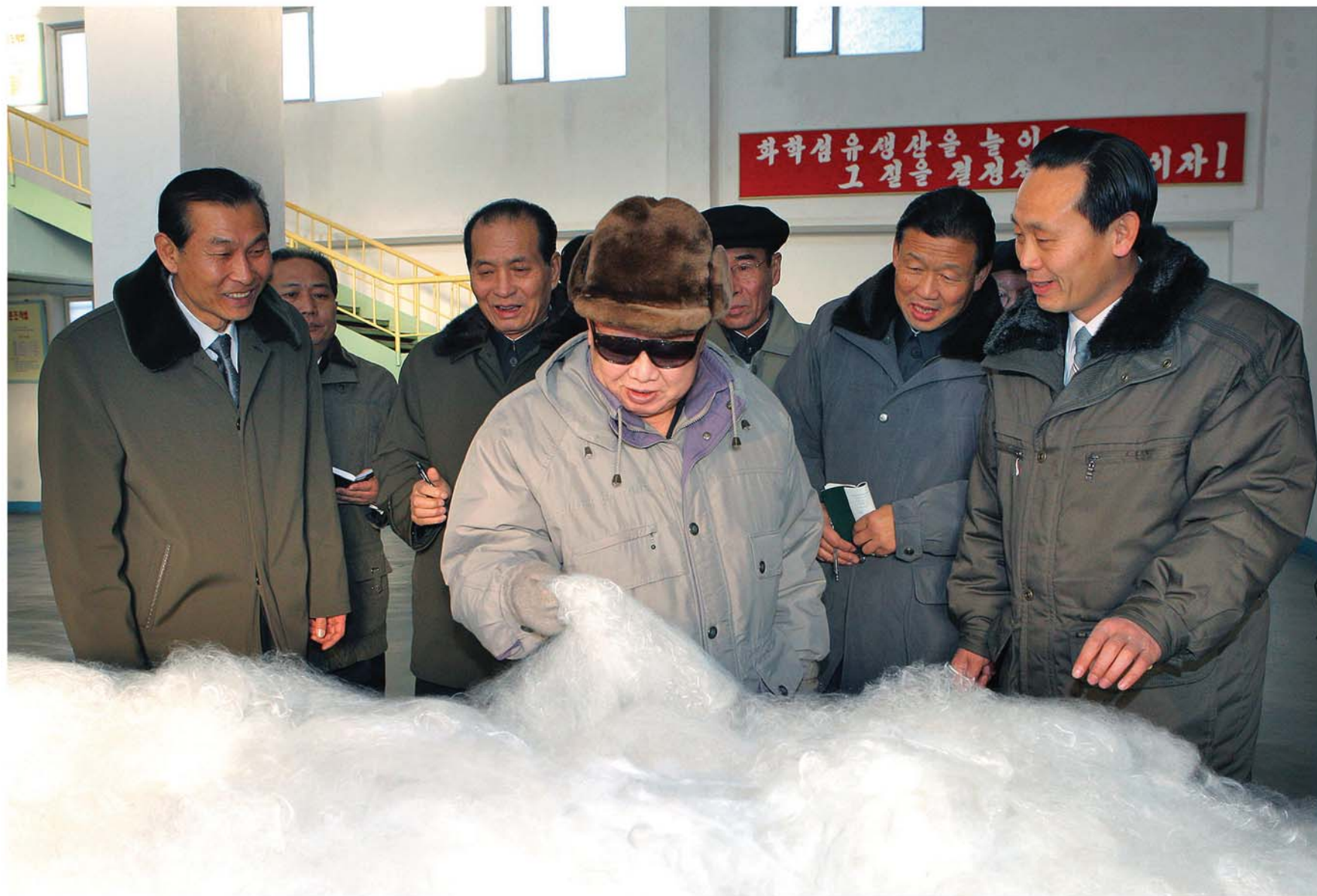
Kim Jong Il appreciating vinalon cotton at the February 8 Vinalon Complex [January Juche 100 (2011)]