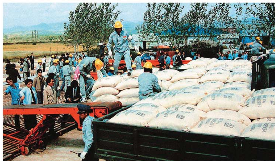
The DPRK government sent relief materials to flood victims in south Korea in Juche 73 (1984)

When it was founded in September Juche 37 (1948), the DPRK made public the withdrawal