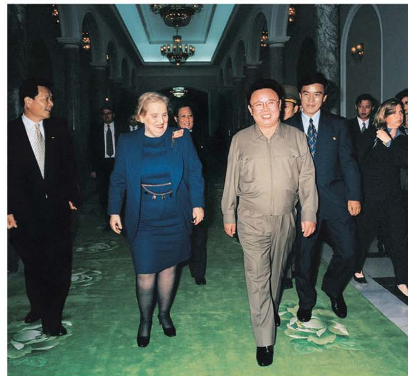
Kim Jong Il meeting Madeleine K. Albright, US State Secretary [October Juche 89 (2000)]