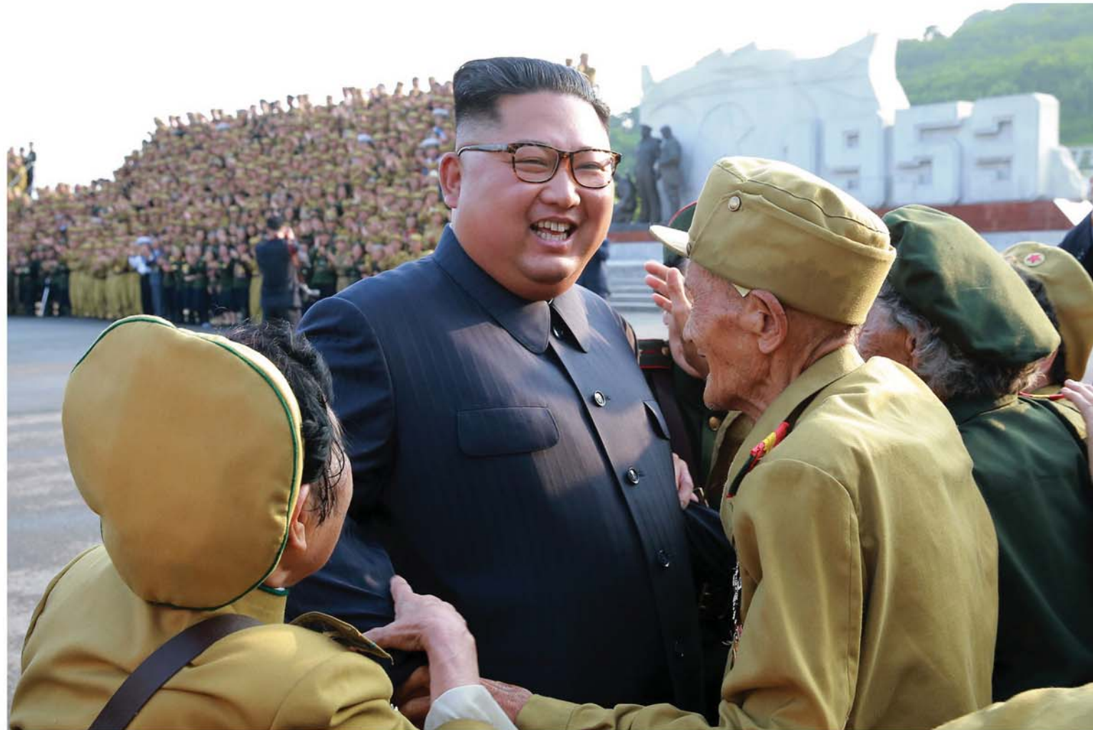
Supreme Leader Kim Jong Un meeting with the participants in the Fifth National Conference of War Veterans [July Juche 107 (2018)]