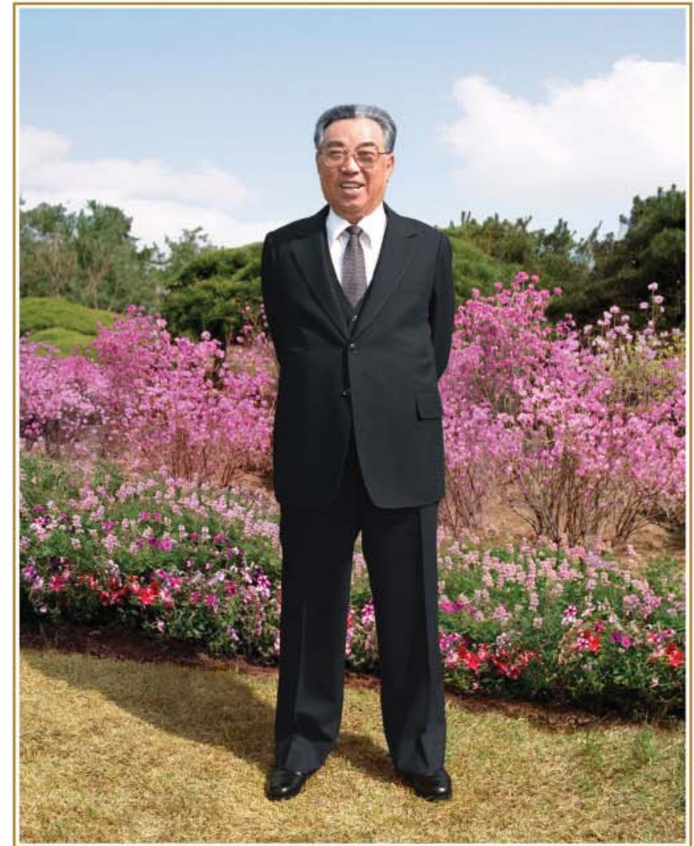
Kim Il Sung, great leader of the Korean people.