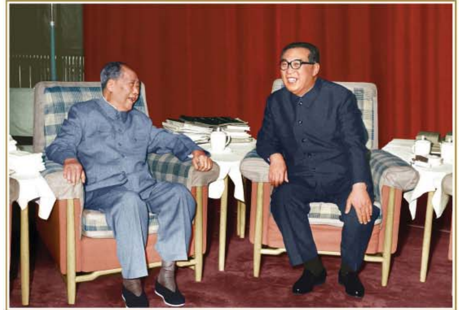
Kim Il Sung talks with Chairman Mao Zedong of the People's Republic of China [April Juche 64 (1975)].