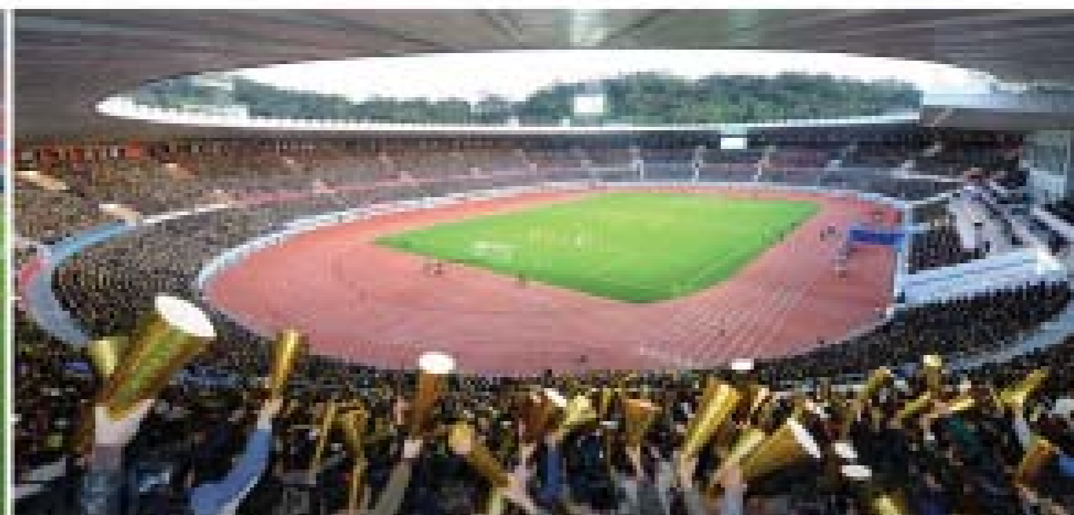
The stadium is furnished with facilities for sporting and cultural activities as well as welfare services, and plays host to national political and cultural events, to say nothing of international and domestic sports games.