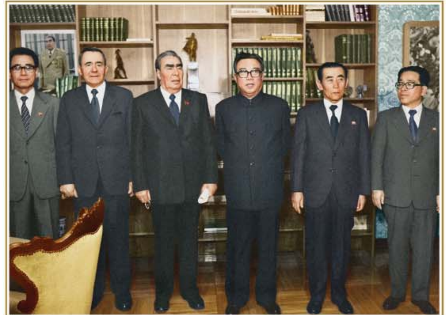
Kim Il Sung poses for a photograph with L. I. Brezhnev, General Secretary of the Communist Party of the Soviet Union [May Juche 69 (1980)].