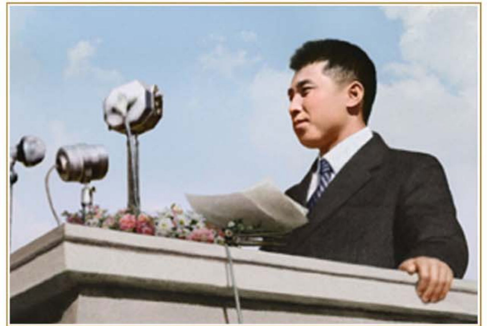
Kim Il Sung delivers a speech at the Pyongyang mass rally held to welcome his triumphal return home [October Juche 34 (1945)].

always emerged victorious in fierce battles.