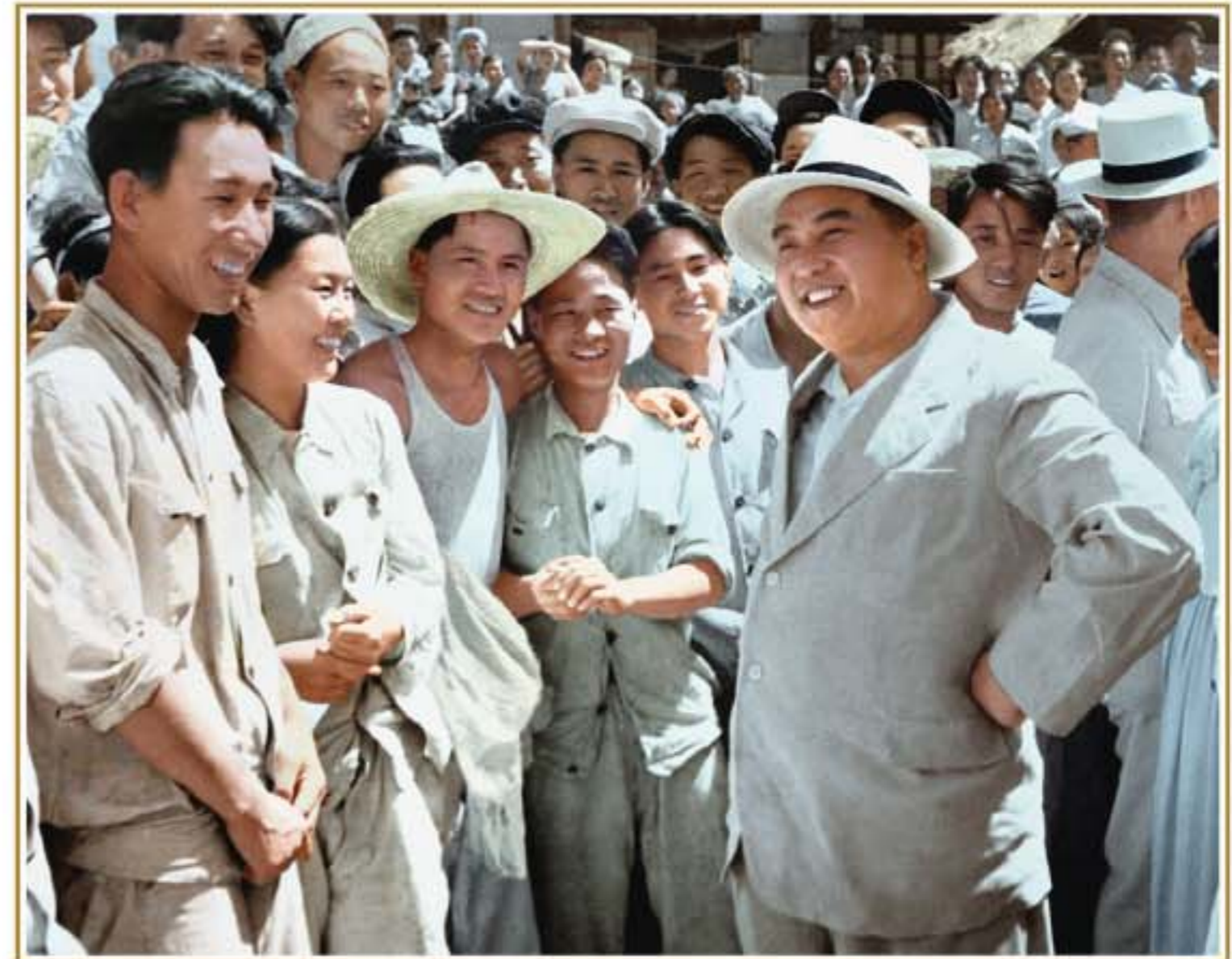
Kim Il Sung meets the teaching staff and students of Kim Il Sung University who are seconded to the city construction [June Juche 46 (1957)].

Since he began his revolutionary career by going among the people, the