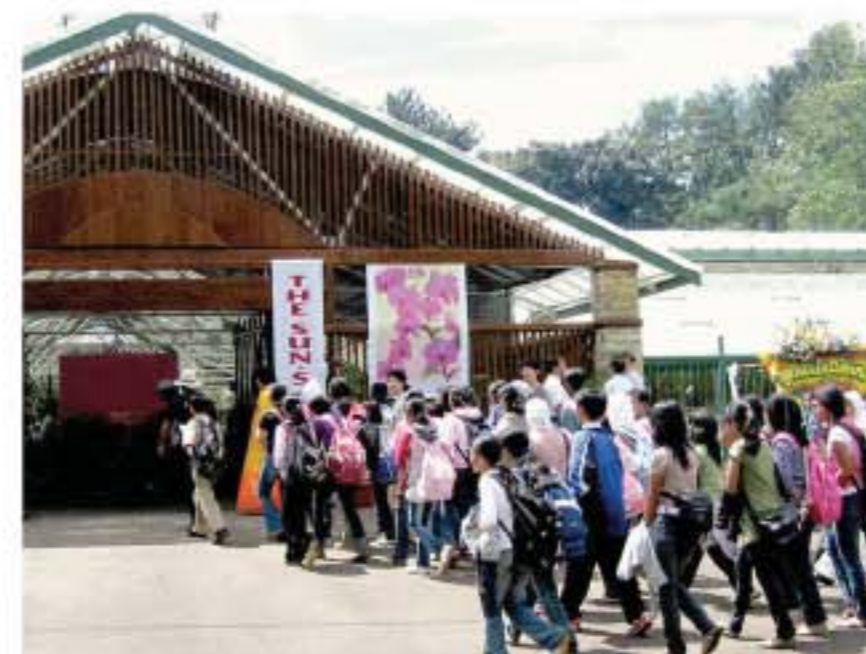
Bogor Botanical Garden in Indonesia is the birthplace of Kimilsungia, immortal flower.