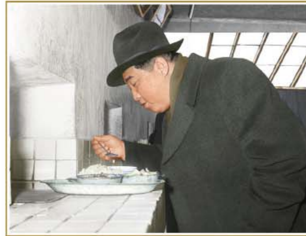
Kim Il Sung looks after the dietary life of the workers at the Taean Electrical Machinery Plant [December Juche 50 (1961)].

He grew flowers and trees in his garden, did farming and raised chickens at home. In the course of this, the Juche farming method was created and the grand plans were made to turn the country into a fairyland with all sorts