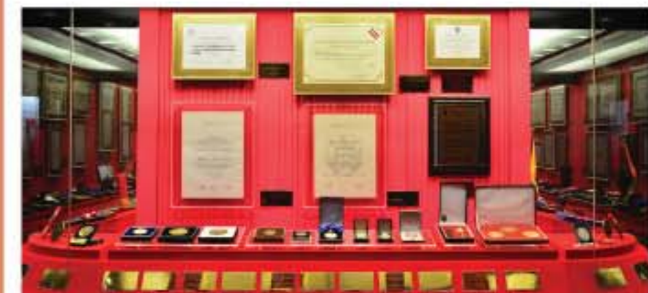
Partial view of the room in the Kumsusan Palace of the Sun that exhibits orders, medals and honorary title certificates.