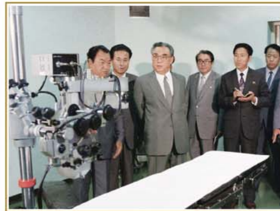
Kim Il Sung looks round the Kim Man Yu Hospital [June Juche 75 (1986)].