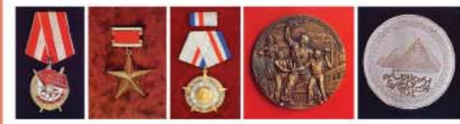
Kim Il Sung is awarded orders, medals and honorary titles by over 70 countries and international organizations, more than 30 cities and 20 odd universities in the world.