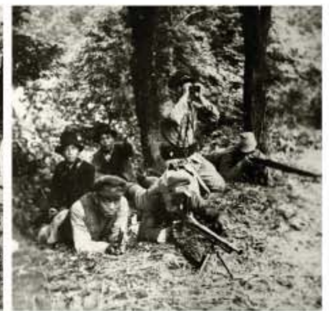
The anti-Japanese armed struggle organized and waged under the leadership of Kim Il Sung won great victory, defeating the Japanese militarism, and the Korean people achieved the national liberation.