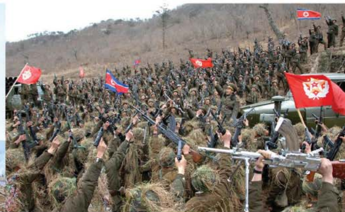
The KPA service personnel have prepared themselves as a-match-for-a-hundred combatants in the embrace of brilliant Songun commanders.