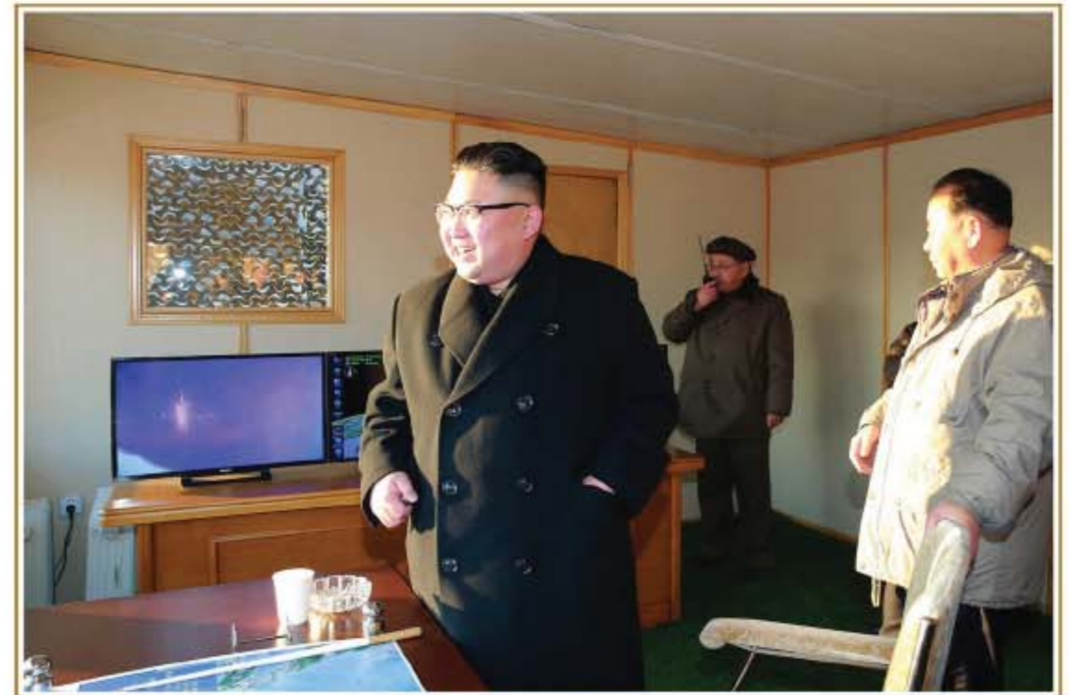
Supreme Leader Kim Jong Un guides on the spot the test-fire of a new strategic weapon [February Juche 106 (2017)].