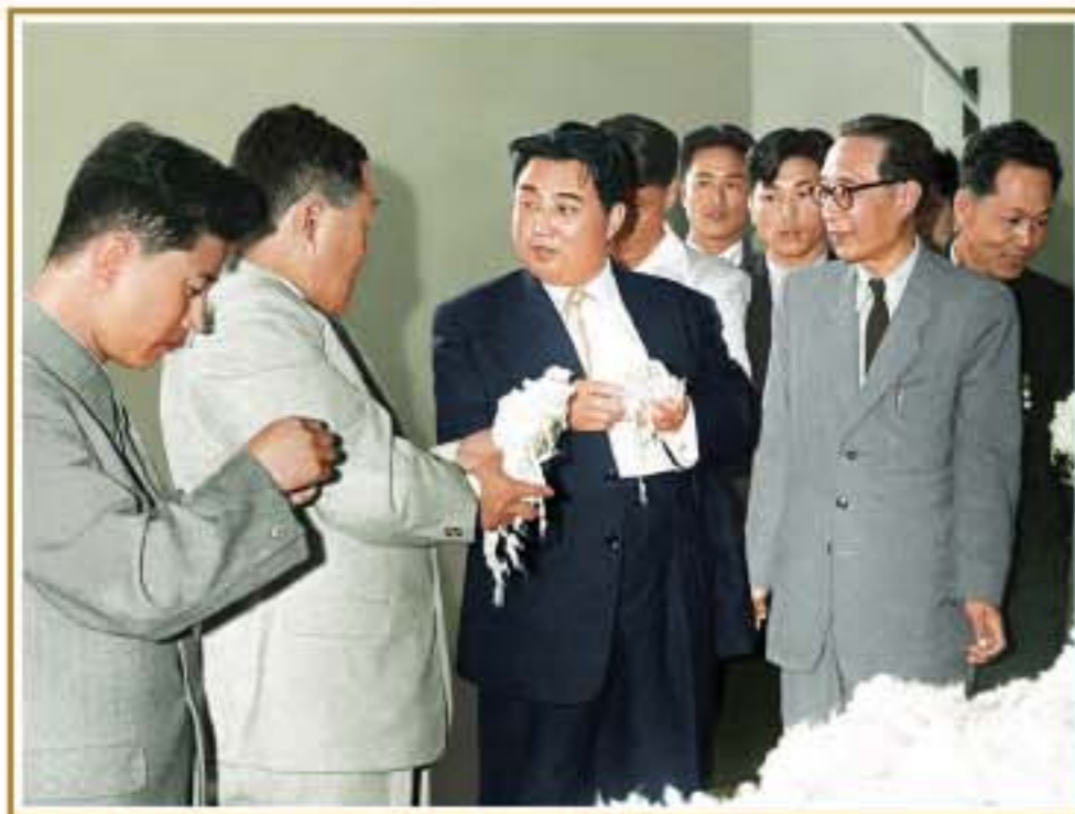
Kim Il Sung gives on-site guidance at the February 8 Vinalon Factory [October Juche 50 (1961)].