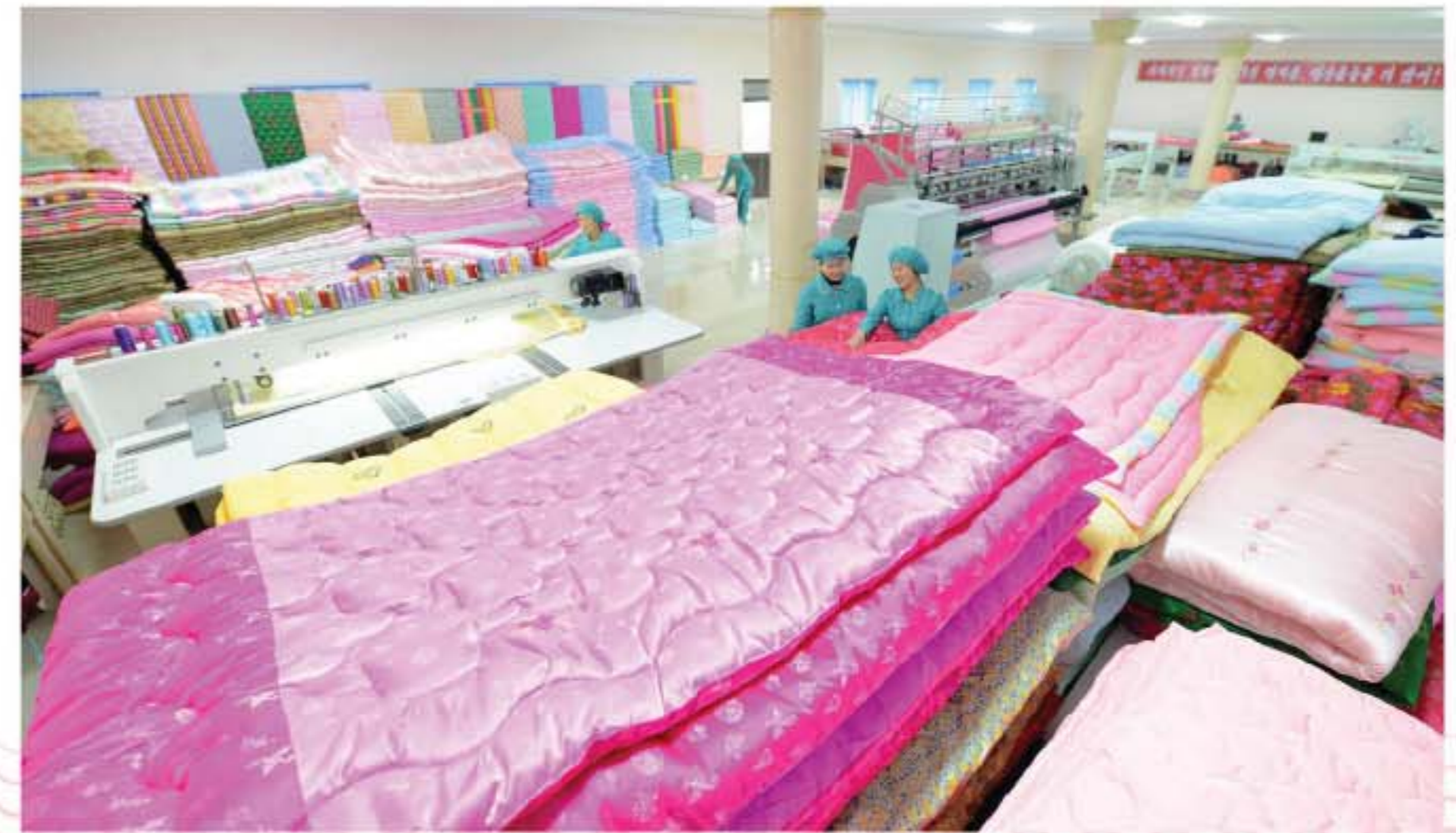
A variety of quality quilts are produced to satisfy the tastes and feelings of the people.