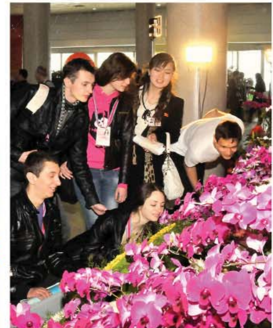
Foreigners visit the venue of the Kimilsungia festival.