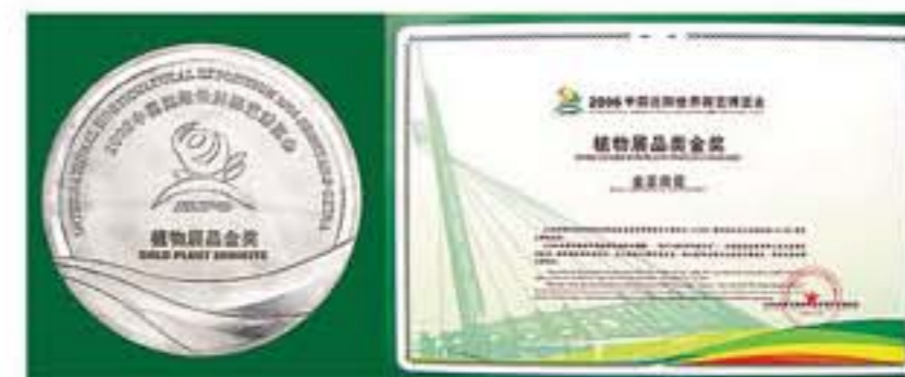
Gold prize and diploma awarded to Kimjongilia at the World Horticultural Expo in Shenyang in 2006.