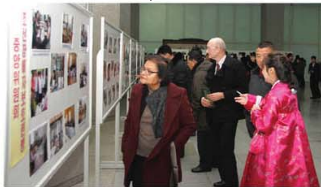
Participants looked round the photo show.