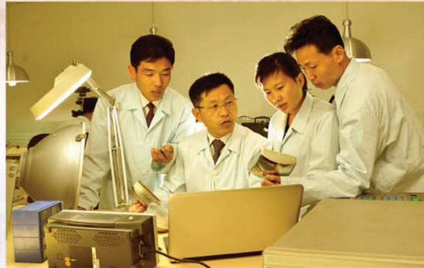
Researchers pool their efforts to introduce into reality newly-developed light fittings.

This super-focusing LED floodlight raises the light utility to nearly 100 per cent, though previous models had produced light below 60 per cent, by projecting the most LED light to the targeted object. The new floodlight has a light intensity five to ten times greater, saves over 95 per cent of electric power for lighting, forms 0.9° in light diffusion angle and thus increases light utility rates and focusing efficiency.