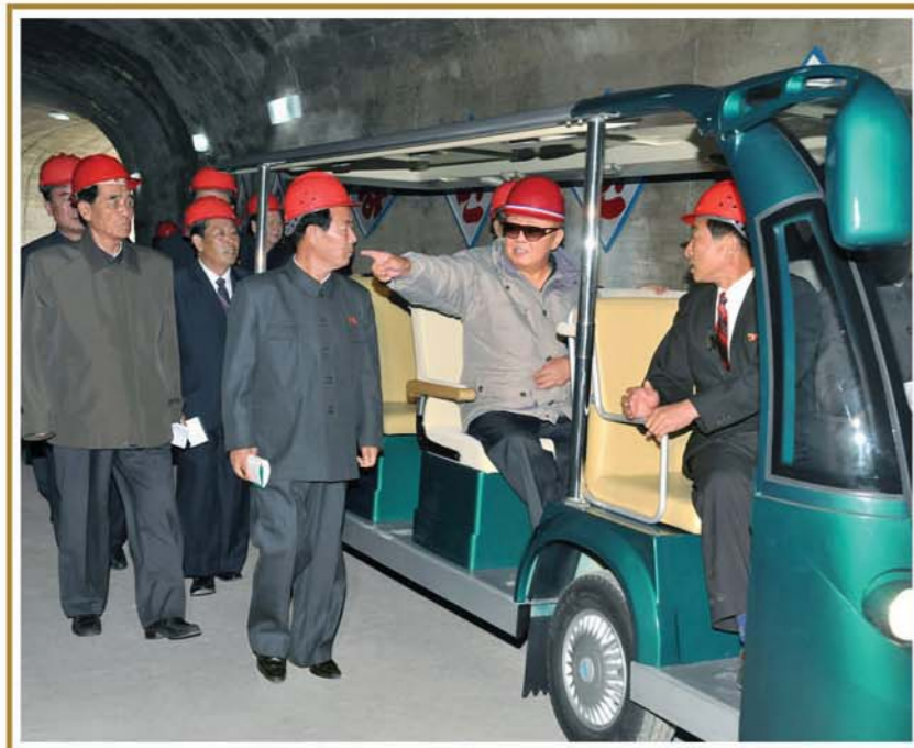
Kim Jong Il on his field guidance to the Ryongyang Mine [October Juche 100 (2011)].

Artificial satellites were launched into space, and all the sectors of national