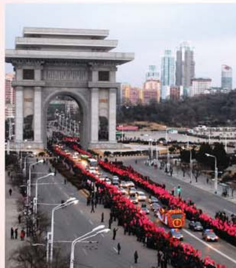
Pyongyang citizens extend hearty welcome to footballers who brought home glory.

Footballers of the DPRK won the 2016 FIFA U-20 Women's World Cup.