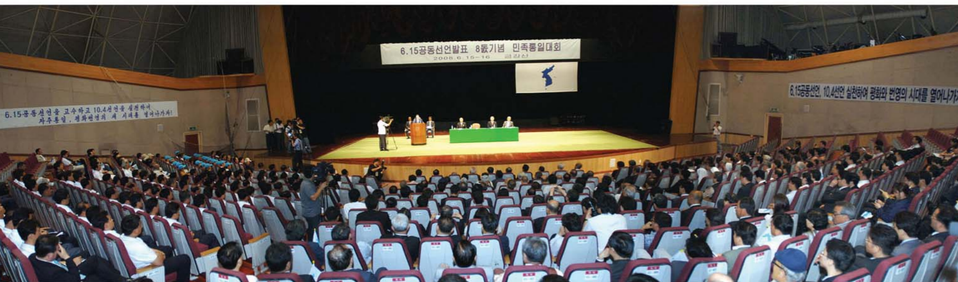
Rally for national reunification held on the occasion of the 8th anniversary of the publication of the June 15 Joint Declaration [Juche 97 (2008)].