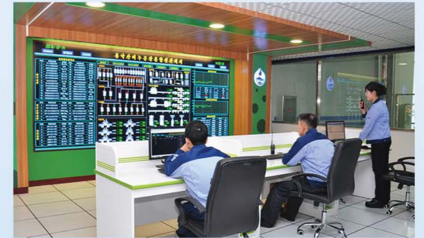
IMS control room.