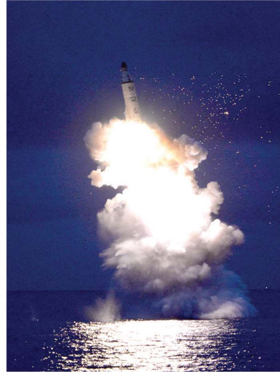
The Korean People's Army has developed into a formidable army capable of defeating any aggressors at a stroke.