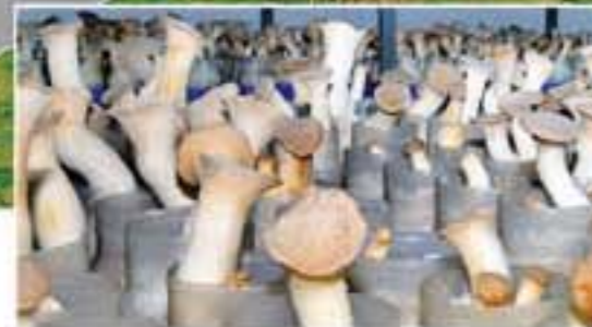
White club-shaped mushroom.