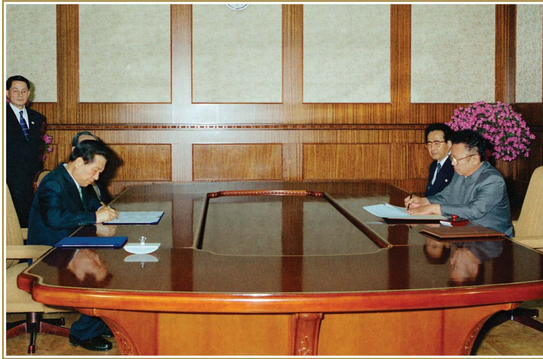
Kim Jong Il signs the North-South Joint Declaration [June Juche 89 (2000)].