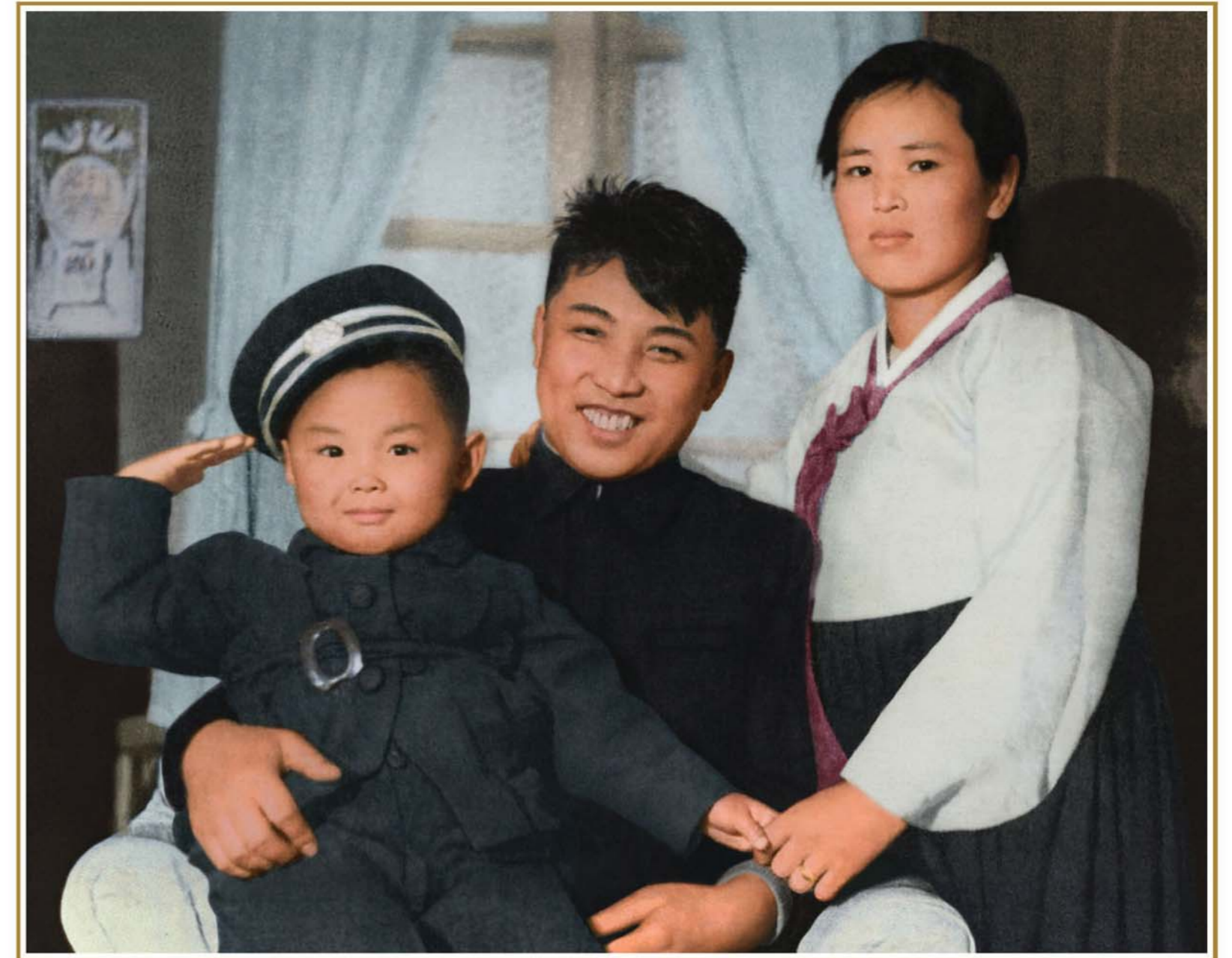
Kim Jong Il with his parents [March Juche 36 (1947)].

Marking the 75th anniversary of the birth of General Kim Jong Il, the Korean service personnel and people are burning their hearts with great yearnings for him and visiting his birthplace in the Paektusan Secret Camp.