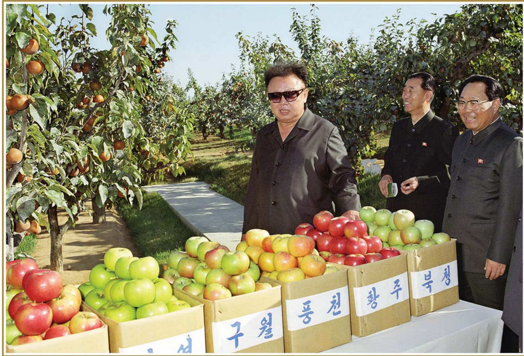
Kim Jong Il gives on-site guidance to Kwail County, South Hwanghae Province [September Juche 90 (2001)].

country. He defined the spirit of defending the leader to the death, the spirit of implementing his instructions whatever the cost and the heroic self-sacrificing spirit displayed by the service personnel during the Arduous March and forced march in the 1990s, as the revolutionary soldier spirit and led the whole Party and society to learn from them.