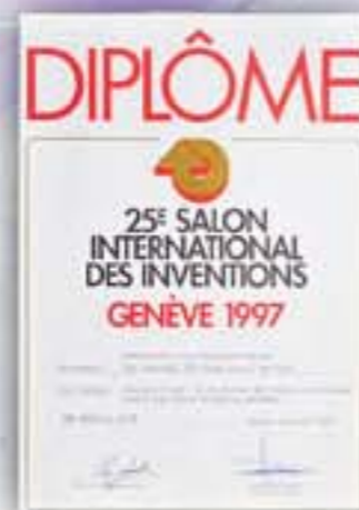
Diploma for gold medal won at the 25th Geneva international inventions & new technologies exhibition [Juche 86 (1997)].