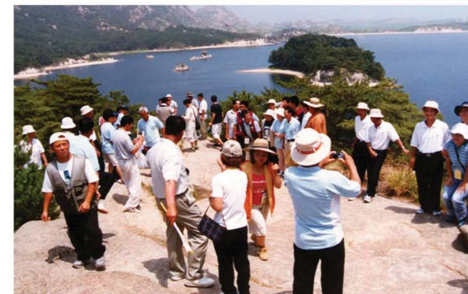
Tourism to Mt Kumgang, reunion of separated families and relatives and other inter-Korean exchanges were promoted.