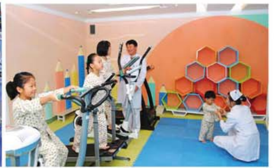
Okryu Children's Hospital.

operation of eye diseases and examination of the eyesight, as well as an eyeglass shop.