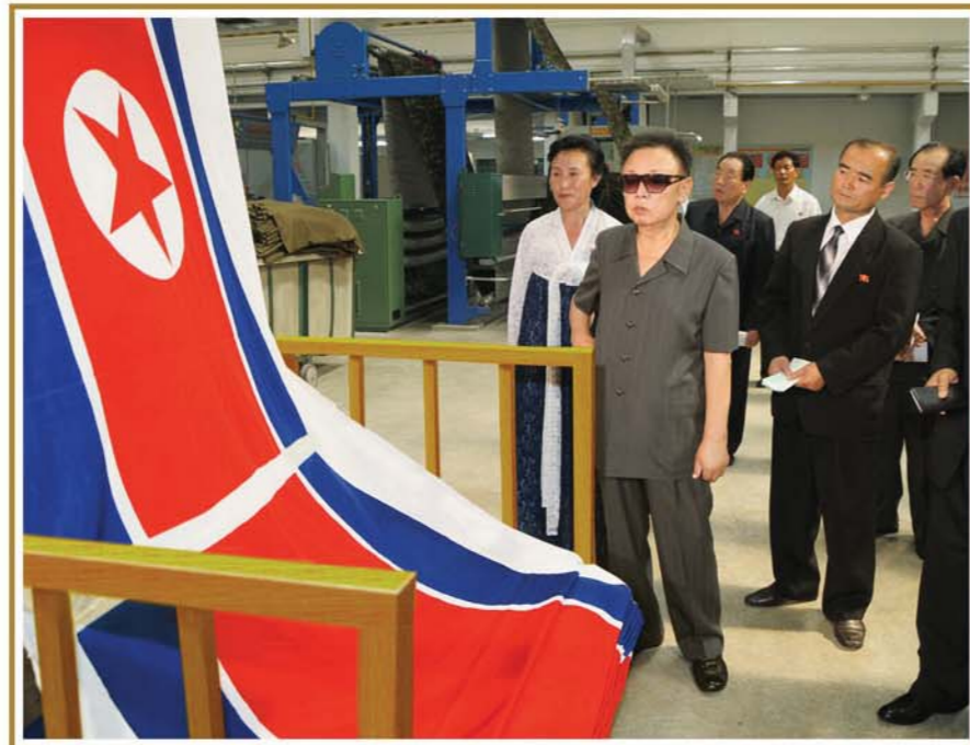
Kim Jong Il gives on-the-spot guidance to the Pyongyang Textile Mill [July Juche 98 (2009)].