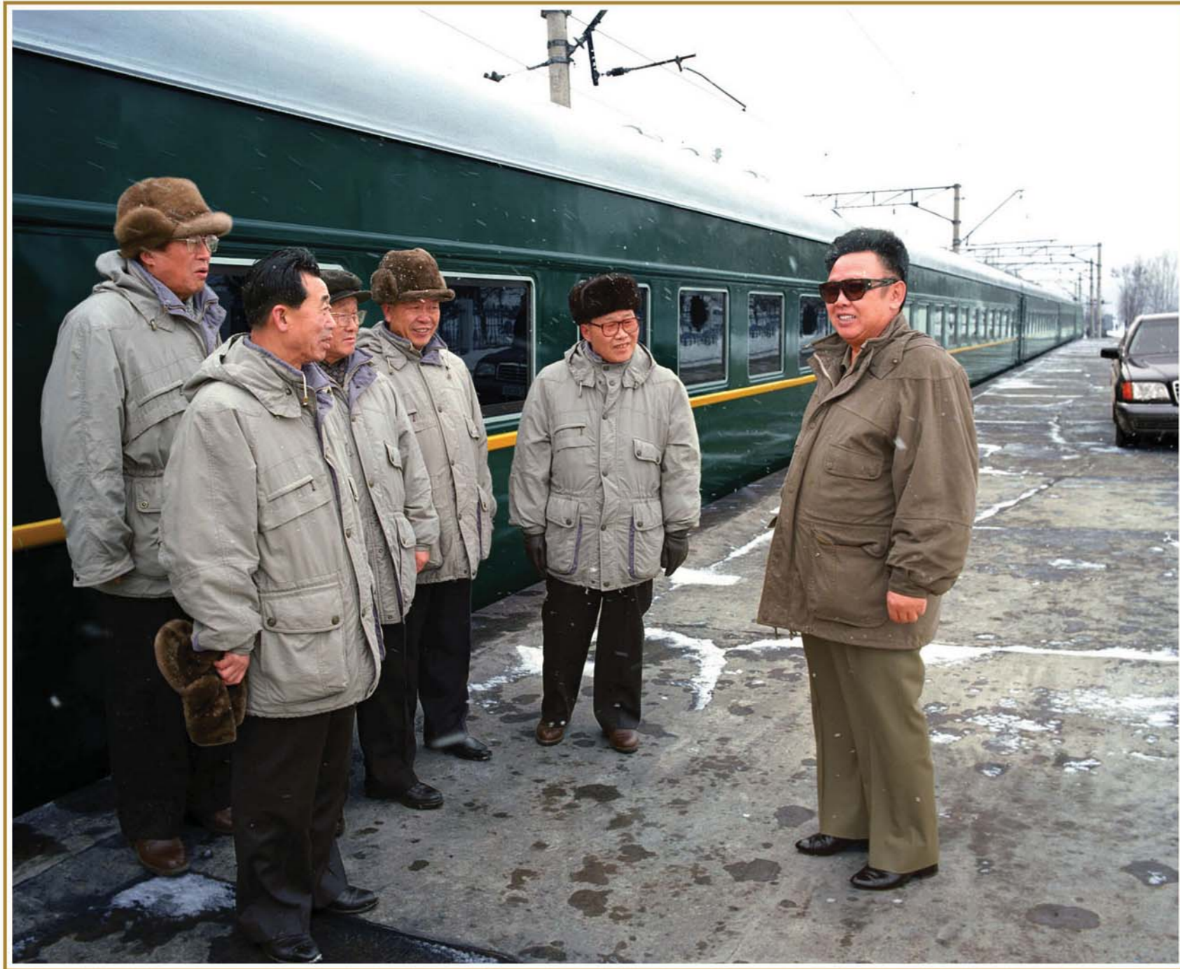
Kim Jong Il continues his journey of field guidance [January Juche 87 (1998)].