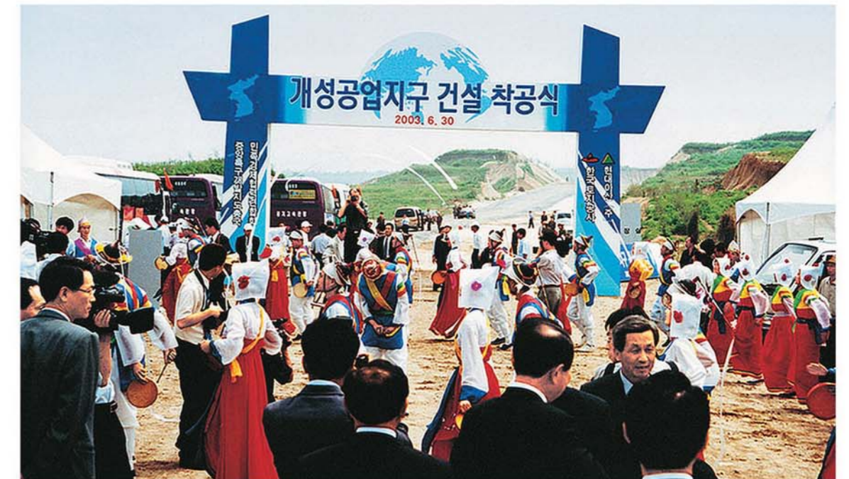
Ground-breaking ceremony for the building of the Kaesong Industrial Zone [Juche 92 (2003)].

and collaboration were achieved between various organizations and personages from every walk of life.