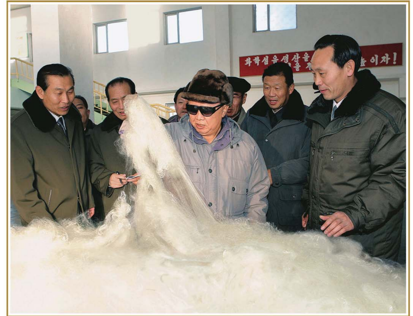
Kim Jong Il sees vinalon cotton at the February 8 Vinalon Complex [January Juche 100 (2011)].

Energetic guidance of the General gave birth to the spirit of the times and kindled the fierce flames of a new great revolutionary upsurge across the