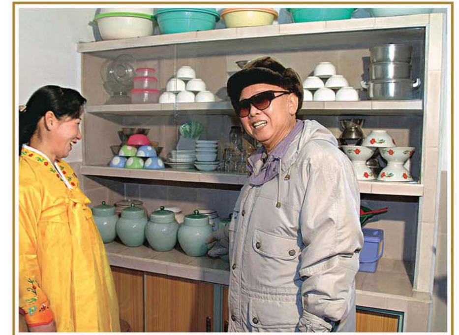
Kim Jong Il visits a discharged soldier's family that moved into a new house [January Juche 98 (2009)].