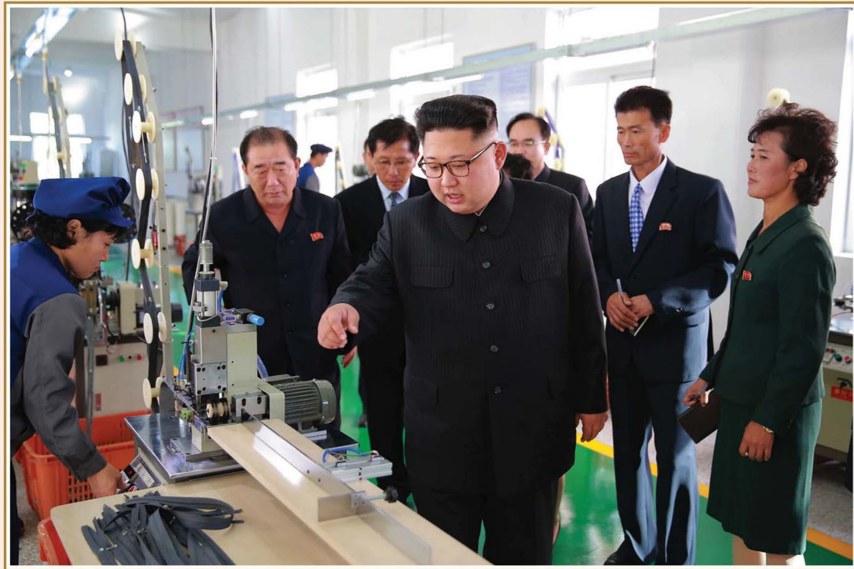
Supreme Leader Kim Jong Un visits Mangyongdae Revolutionary Site Souvenir Factory [October Juche 105 (2016)].