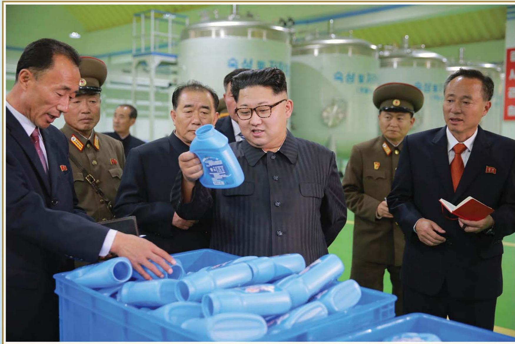
Supreme Leader Kim Jong Un visits Ryongaksan Soap Factory [October Juche 105 (2016)].