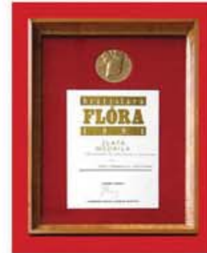
Gold medal and diploma awarded to Kimjongilia at the 12th international flower exhibition held in Bratislava, Czechoslovakia, in Juche 80 (1991).