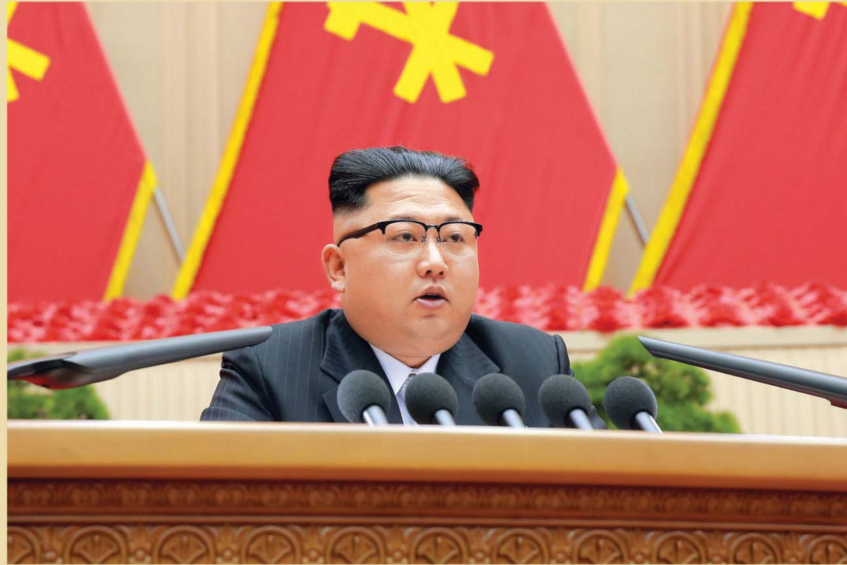
Kim Jong Un, Chairman of the Workers' Party of Korea, delivers a concluding speech at the conference [December Juche 105 (2016)].