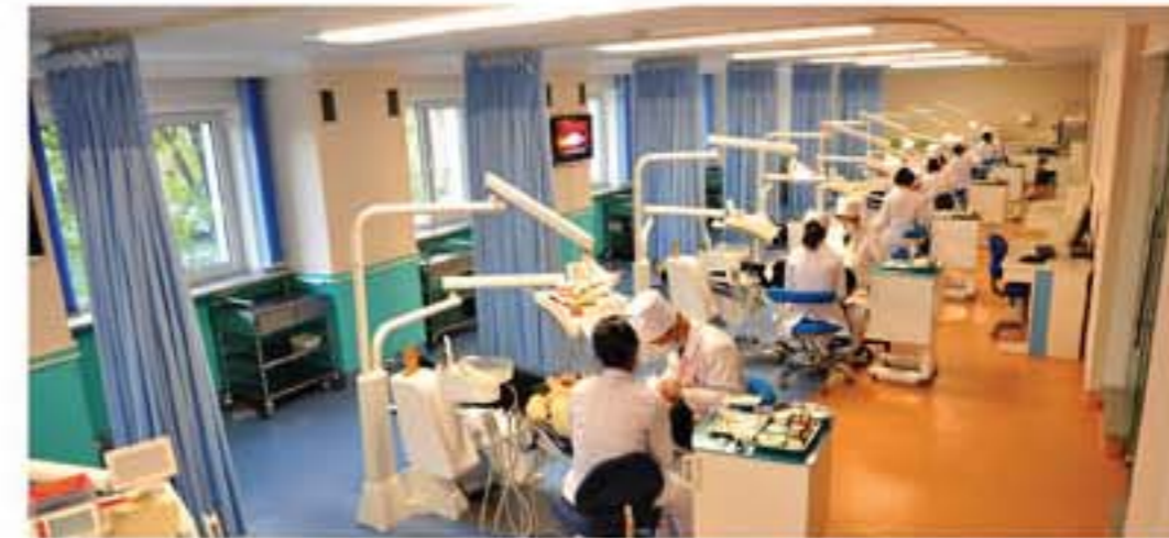
Ryugyong Dental Hospital.