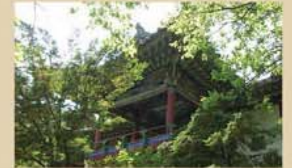
Partial view of Chonju Pavilion.

Article: Pak Pyong Hun