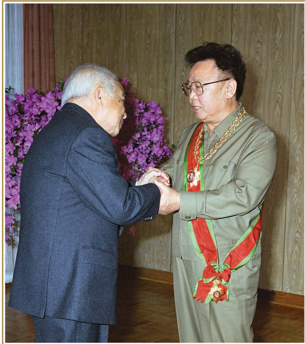
Samdech Norodom Sihanouk of Cambodia presents an order to Kim Jong II [July Juche 93 (2004)].