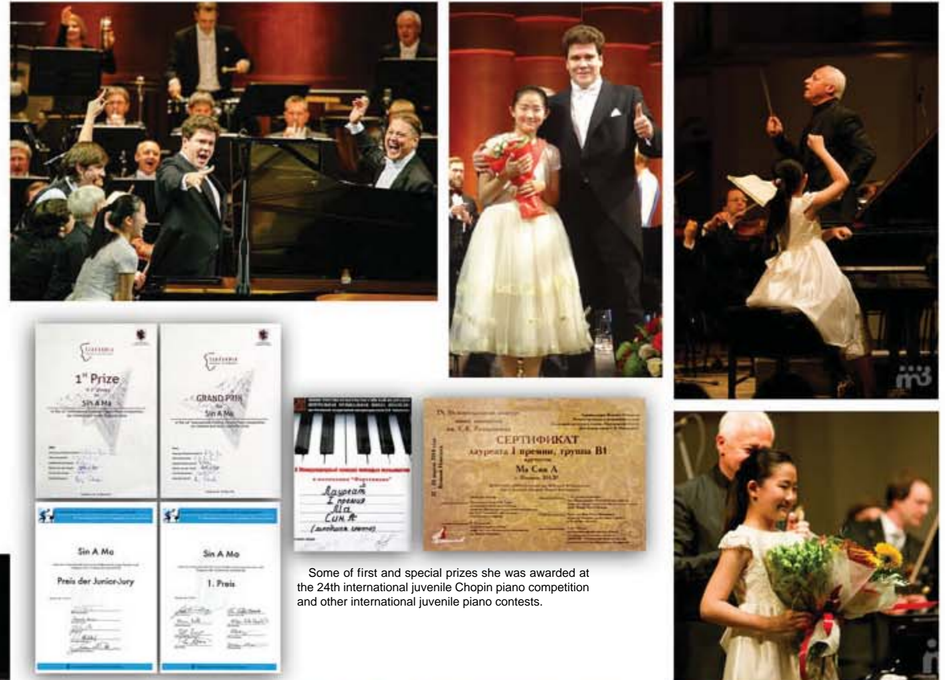
Some of first and special prizes she was awarded at the 24th international juvenile Chopin piano competition and other international juvenile piano contests.

Article: Kim Thae Hyon