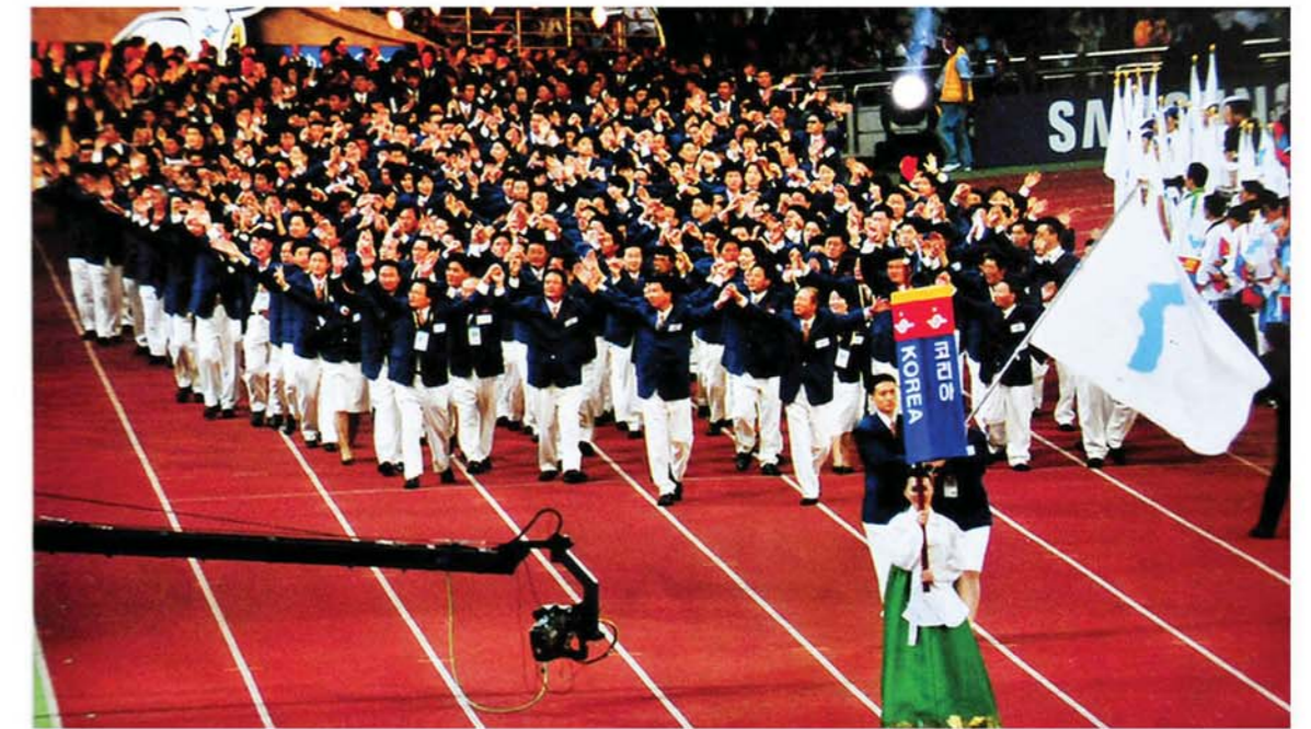
Sportspeople from the north and the south of Korea enter the venue for opening ceremony of the 14th Asian Games [Juche 91 (2002)].

Inter-Korean dialogues and cooperation, contact and exchange in the fields of politics, the economy and culture gained momentum, producing precious fruits shared by the nation, to the delight of all compatriots, and solidarity