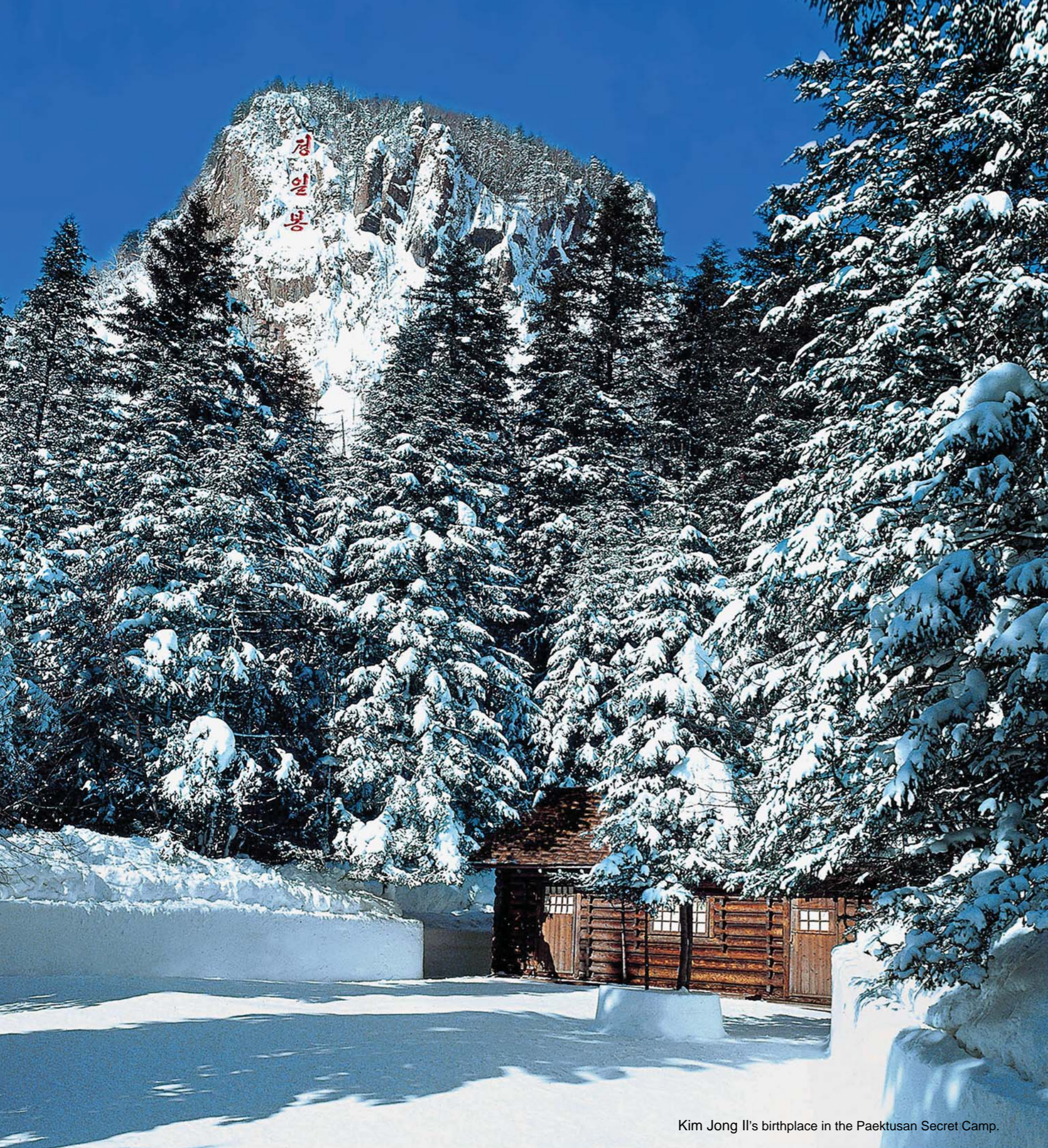
Kim Jong Il's birthplace in the Paektusan Secret Camp.