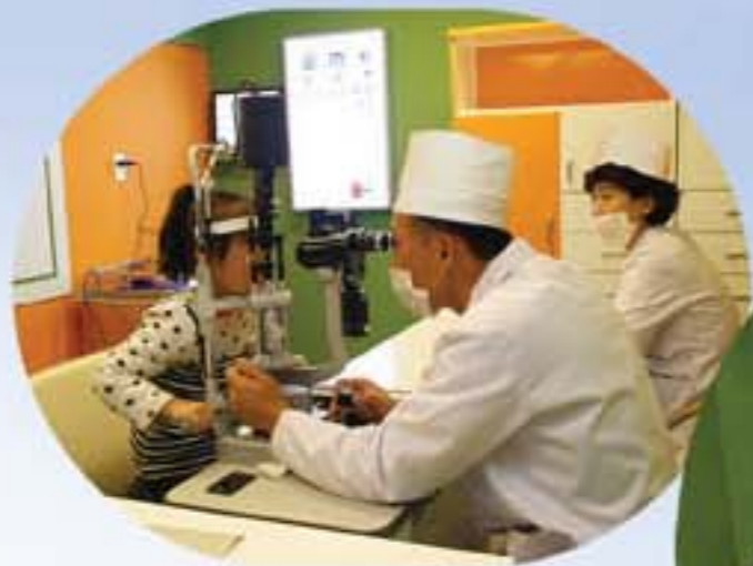
Ryugyong General Ophthalmic Hospital.