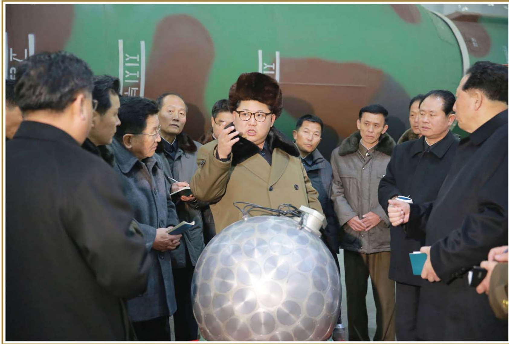
Supreme Leader Kim Jong Un guides nuclear weaponization [March Juche 105 (2016)].