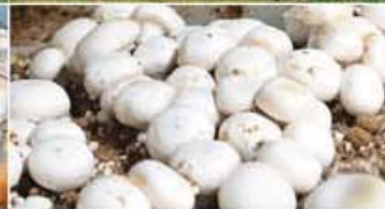
Agaricus bisporus .