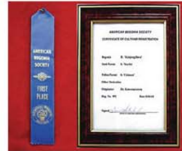
The first prize ribbon awarded to Kimjongilia at the begonia show held in the US in Juche 93 (2004) and the certificate of registration of Kimjongilia as a new variety No. 991 of begonia.