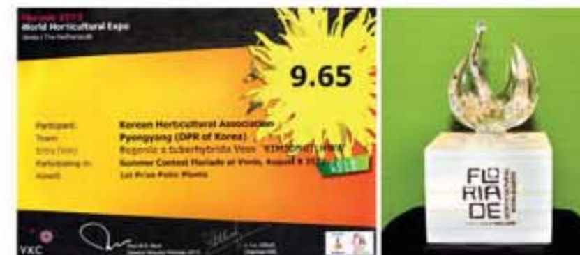
First prize Kimjongilia won at the Venlo World Horticultural Expo held in the Netherlands in 2012.