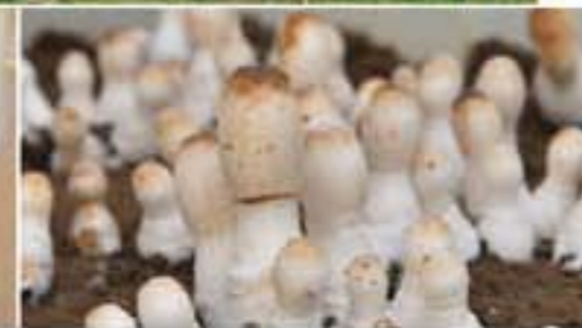
Coprinus comatus .