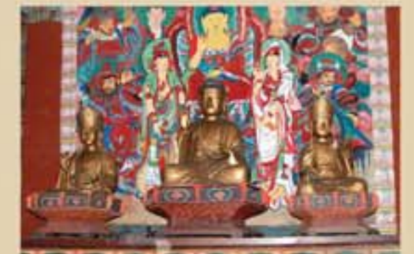
Buddhist images in Pogwang Hall.