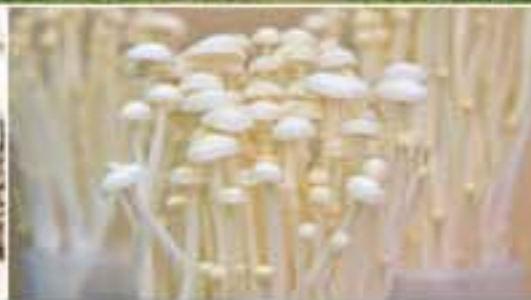
Flammulina velutipes .