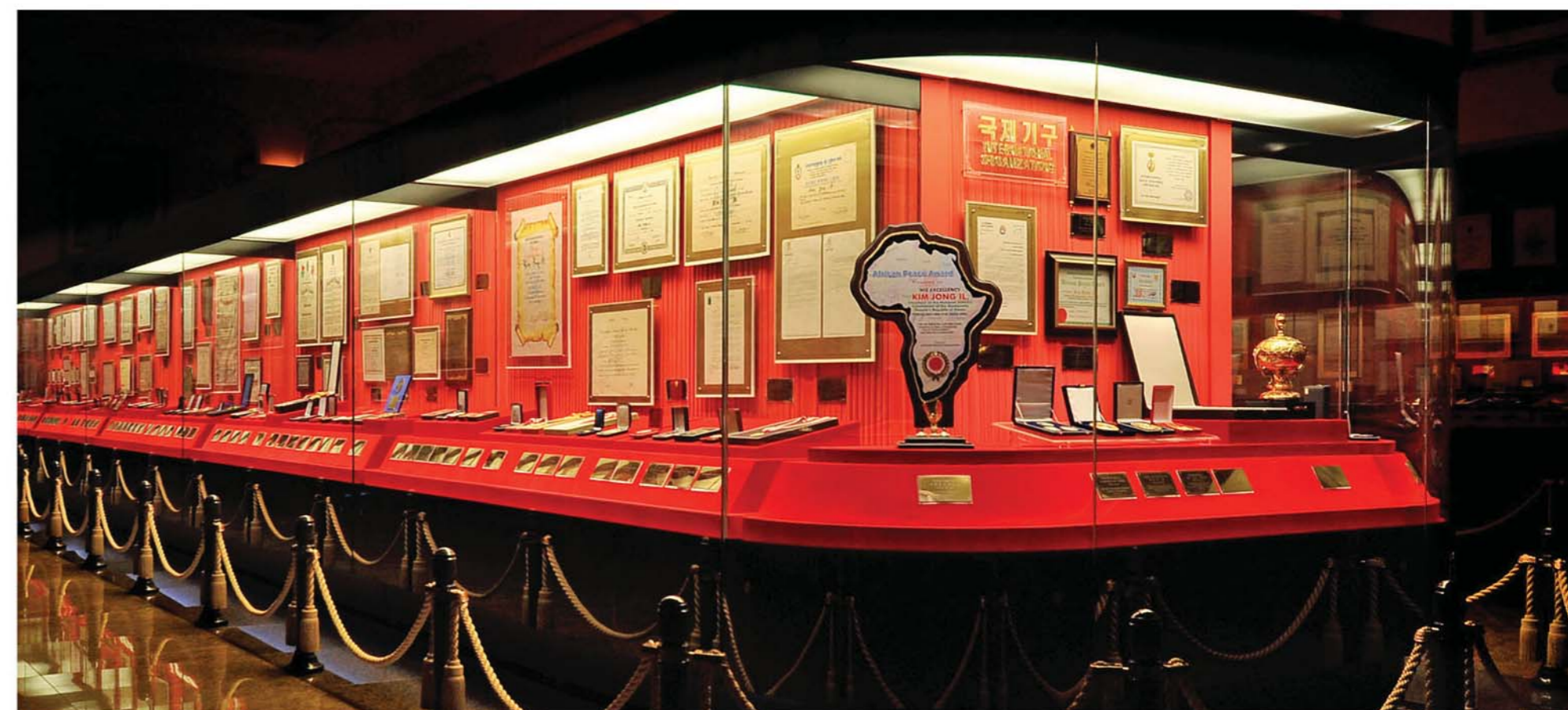
Partial view of the room that preserves orders and medals Kim Jong II received from heads of the state, political and public figures of many countries, international organizations and regions.