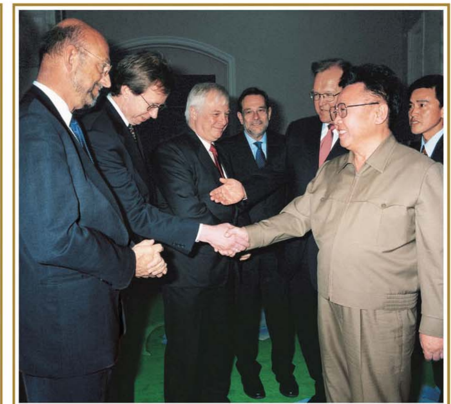
Kim Jong Il meets a high-level delegation from the European Union [May Juche 90 (2001)].