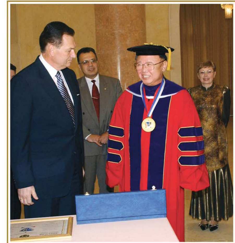
Kim Jong II wears the gown of the Far Eastern National University Honorary Doctor of Law [October Juche 94 (2005)].

Highest reverence and admiration for the Chairman is fully demonstrated in that he is continuously awarded with orders, medals and honorary titles by the world progressive peoples even after his demise.