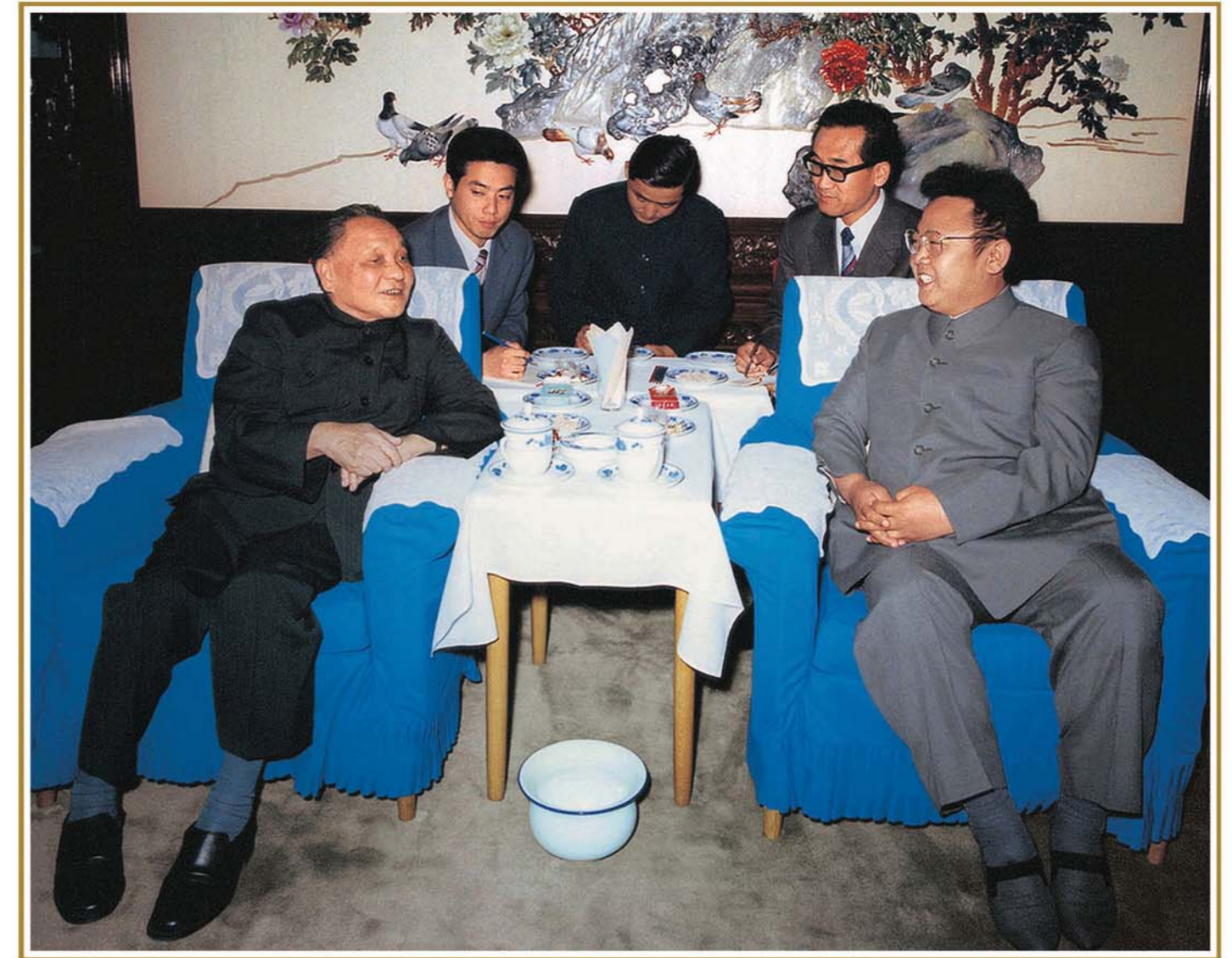
Kim Jong Il talks with Deng Xiaoping, head of the Advisory Committee of the Communist Party of China [June Juche 72 (1983)].