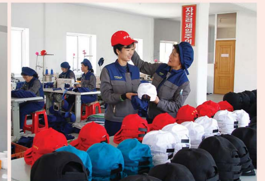
Melamine resin goods and other quality consumer goods are produced.