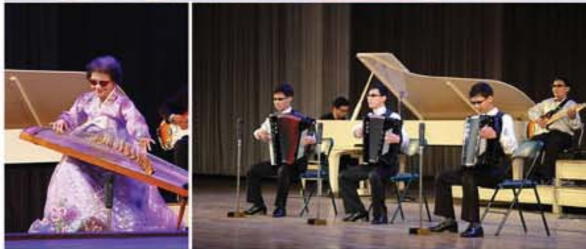
The performance was given by the artist group of disabled persons on the occasion of the International Day of Persons with Disabilities.