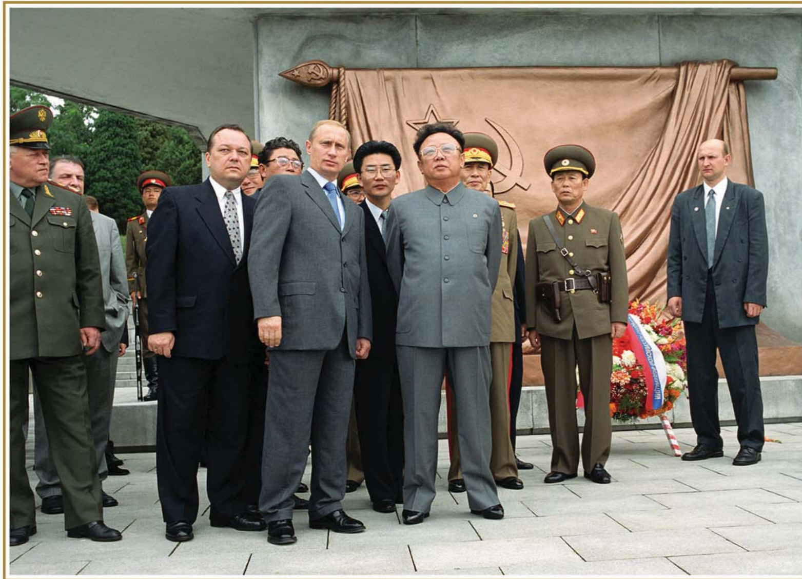
Kim Jong Il, together with Russian President V. V. Putin, visits the Liberation Tower [July Juche 89 (2000)].