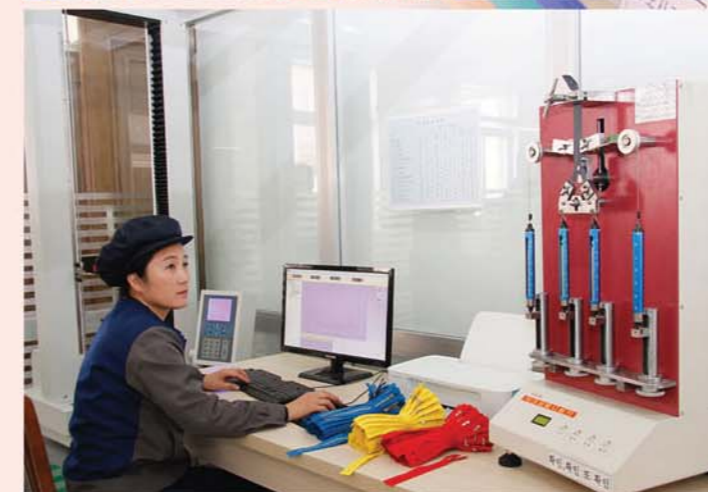
The factory equipped with modern machines and facilities produces various zippers.