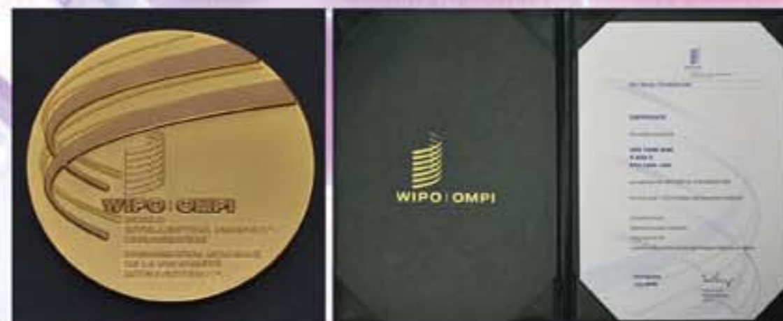
Inventor's medal and diploma awarded by WIPO [Juche 105 (2016)].