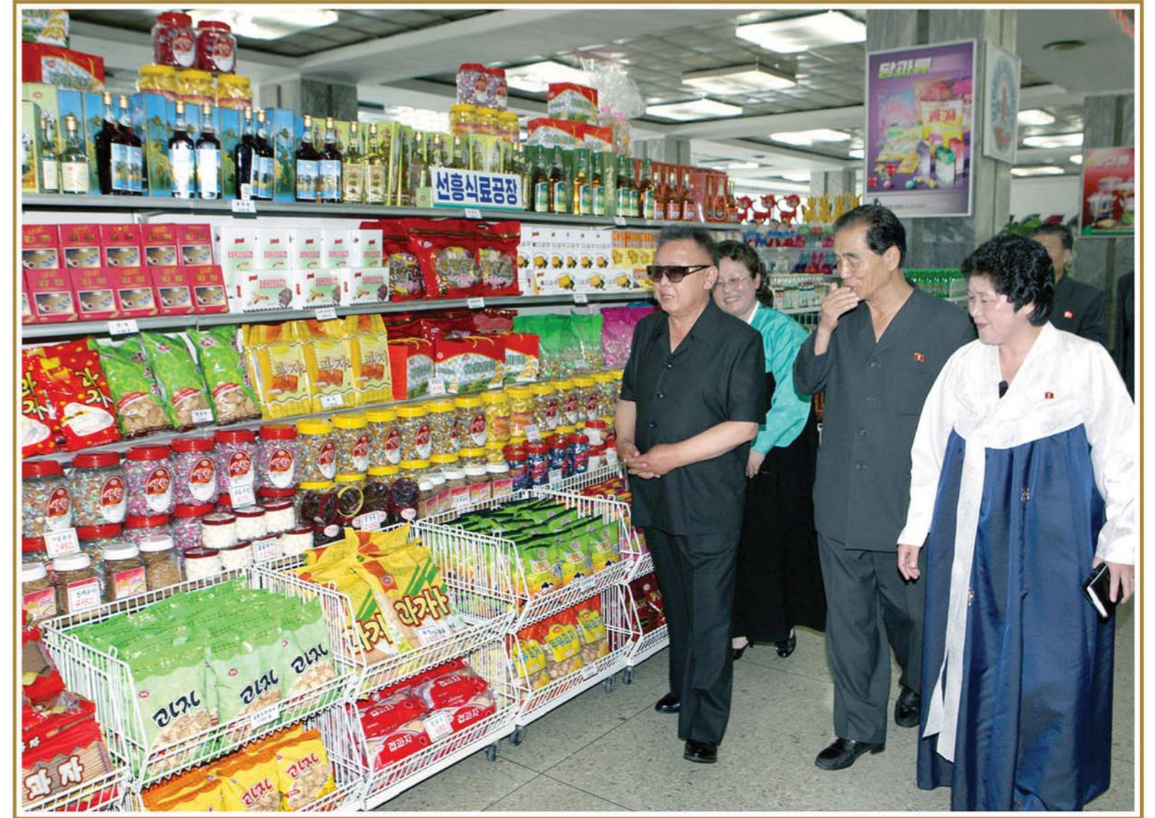
Kim Jong Il looks round the second consumer goods show in Pyongyang Department Store No. 1 [July Juche 100 (2011)].

economy, including the metal, chemical and machine building industries, were put on a Juche-oriented, modern and scientific footing at a high level.