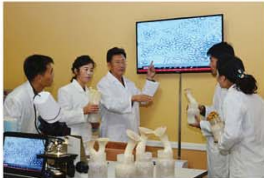
Efforts are made to put mushroom farming on a scientific and intensive footing.

A mushroom farm was newly built in Hwasong-dong, Ryongsong District in the suburbs of Pyongyang and started its operation in late October last year.