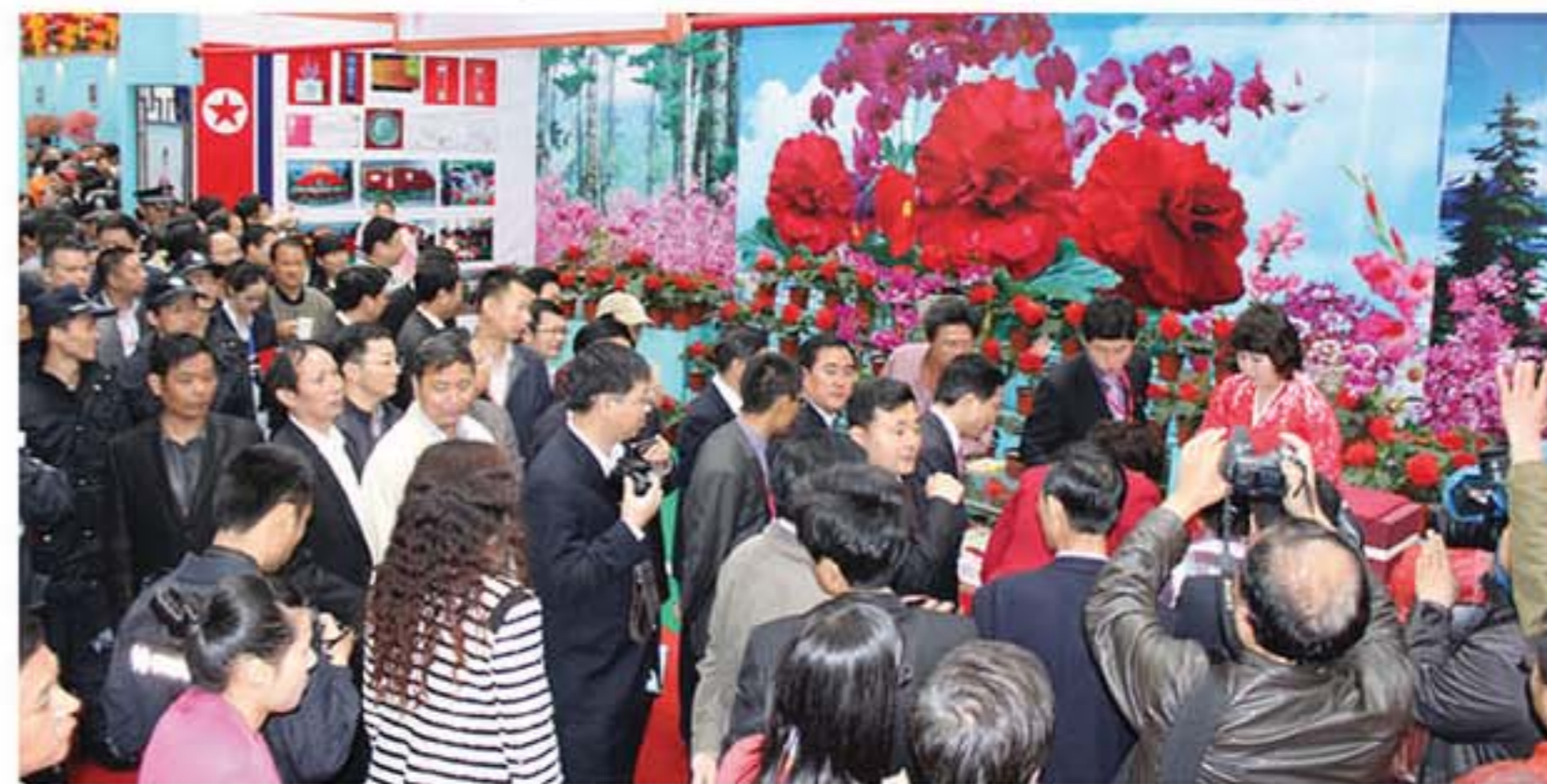
Kimjongilia was presented at the 2012 Shanghai Exposition.