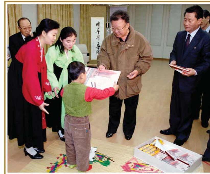
Kim Jong Il sees the calligraphic works and pictures by the children from Ponbu Kindergarten in Sinuiju City [January Juche 95 (2006)].