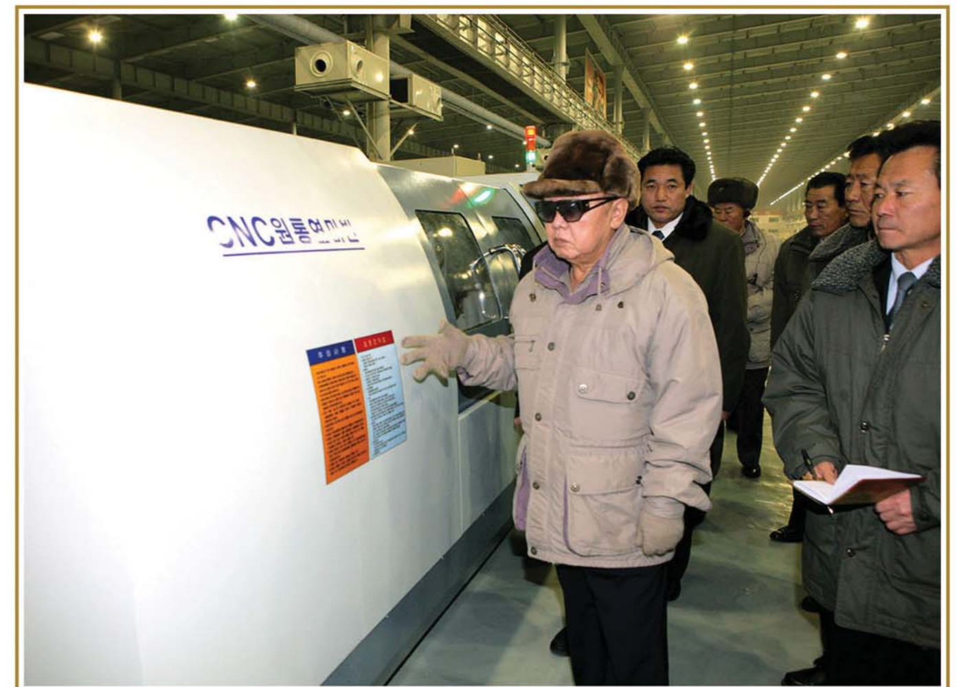
Kim Jong Il sees CNC machine tools of new type [December Juche 99 (2010)].