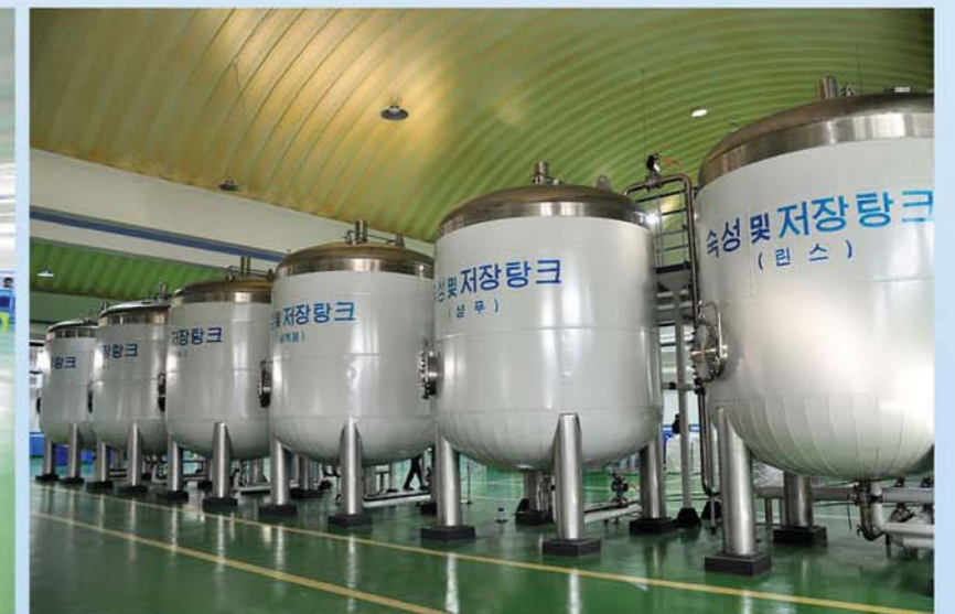
All the processes from feeding raw materials to packing are automated.