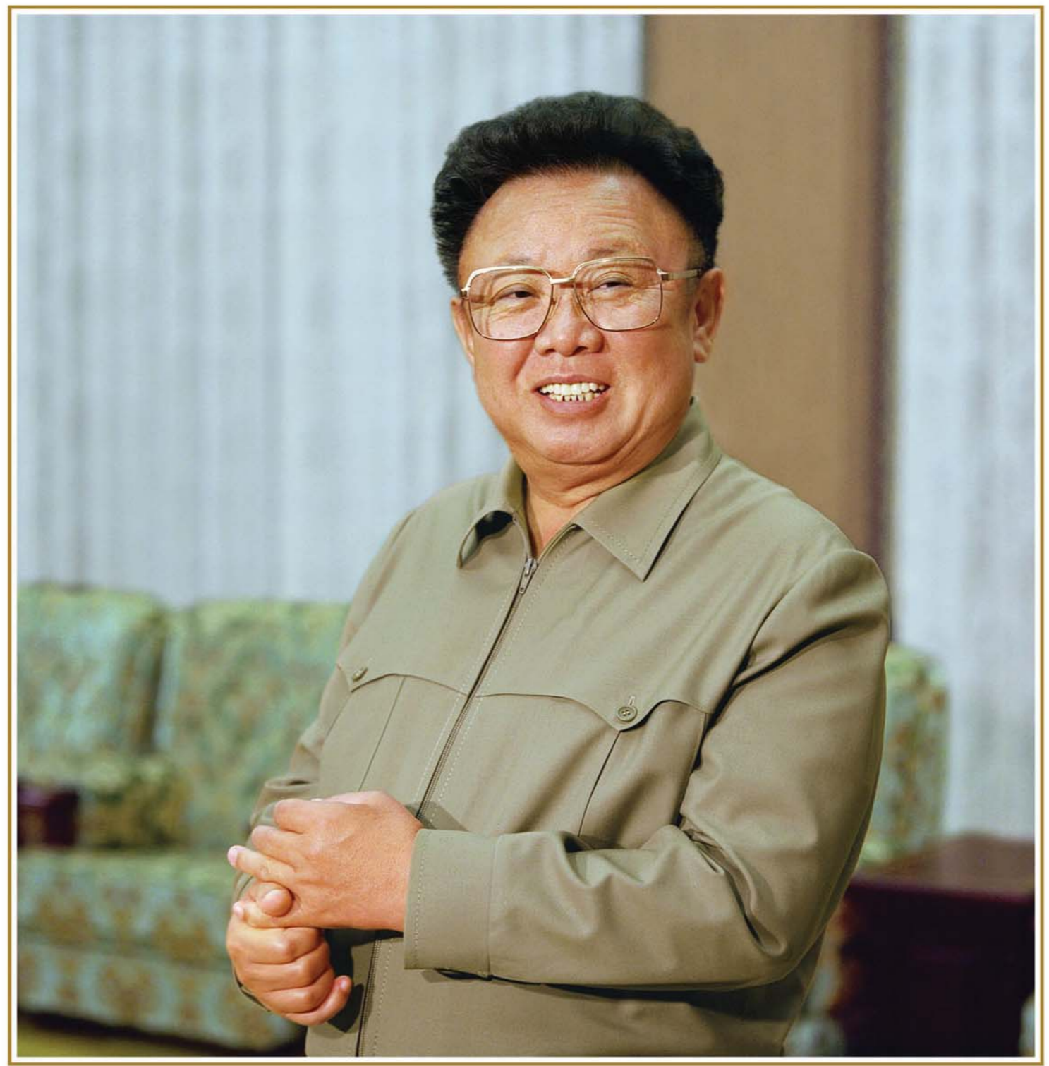
Kim Jong II, eternal General Secretary of the Workers' Party of Korea.