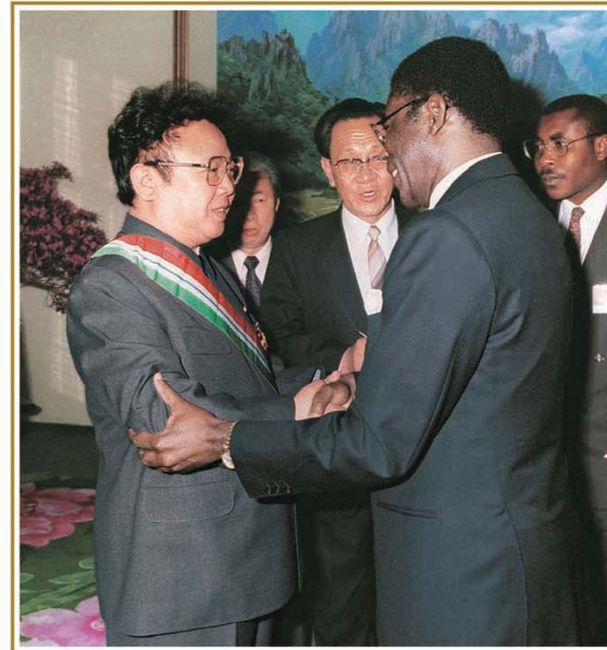
Obiang Nguema Mbasogo, President of the Republic of Equatorial Guinea, presents an order to Kim Jong II [April Juche 81 (1992)].

Conferring their supreme orders, medals and honorary titles, heads of the state, political and public figures of many countries highly praised Chairman Kim Jong II as the eternal sun illuminating the road of the cause of global