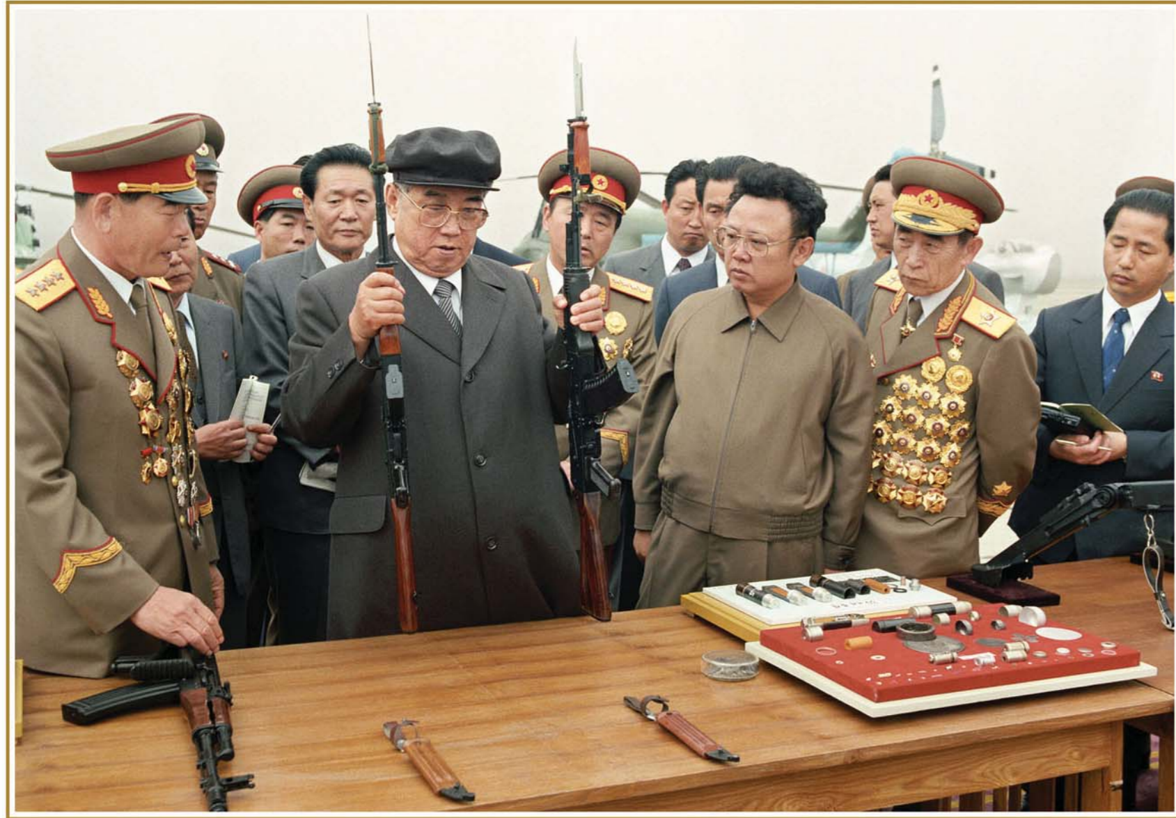
President Kim Il Sung and General Kim Jong Il see military hardware [April Juche 75(1986)].