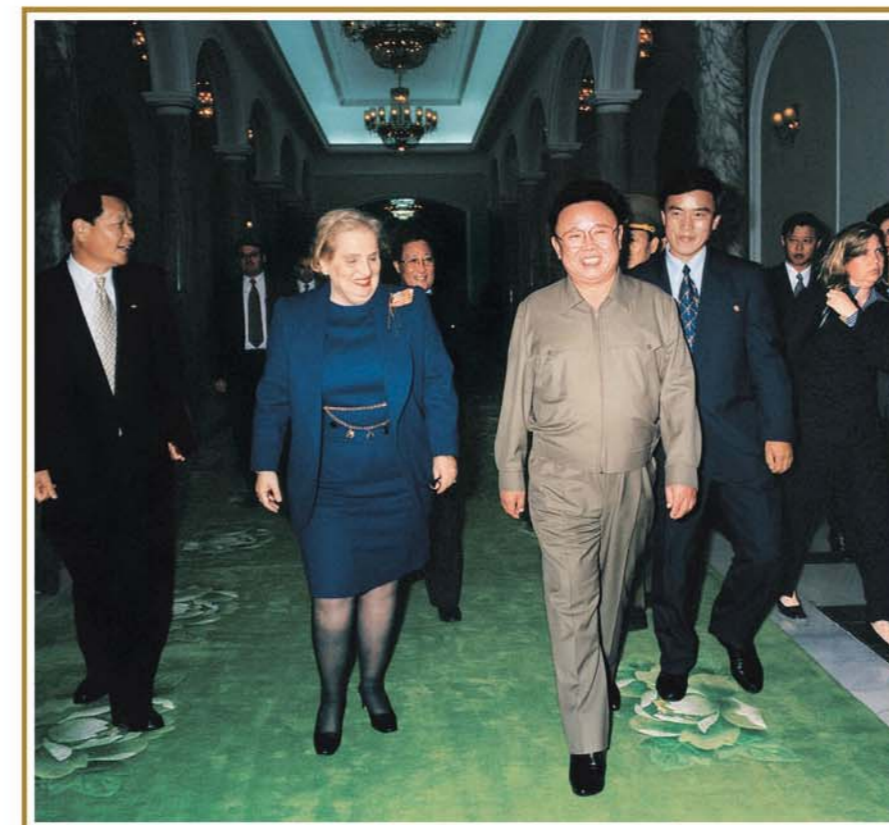
Kim Jong Il meets Madeleine Albright, Secretary of State of the United States of America [October Juche 89 (2000)].