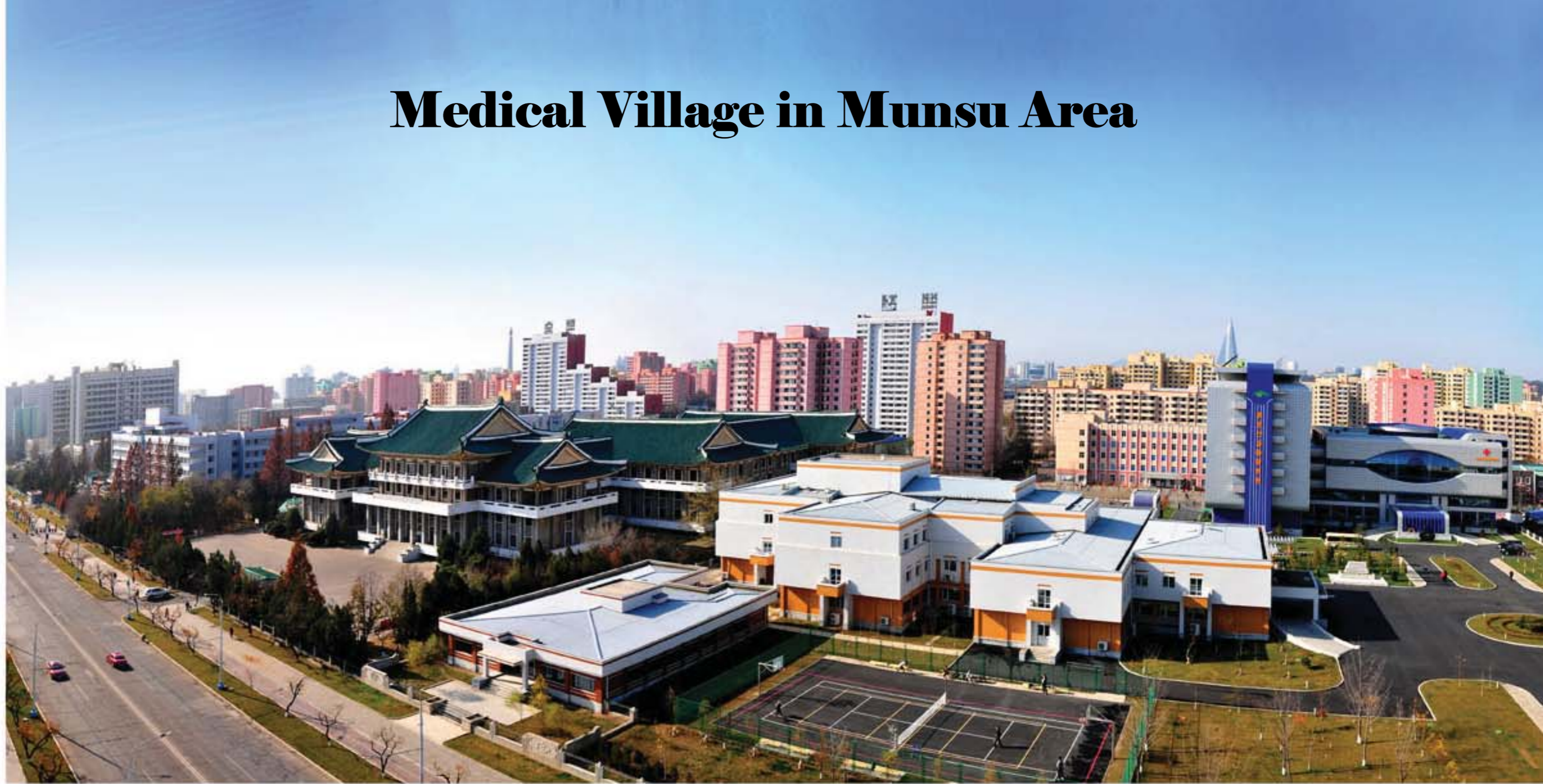
Pyongyang Maternity Hospital and Breast Tumour Institute under the hospital.

The Ryugyong General Ophthalmic Hospital built in October last year is furnished with up-to-date facilities and equipment for the treatment and