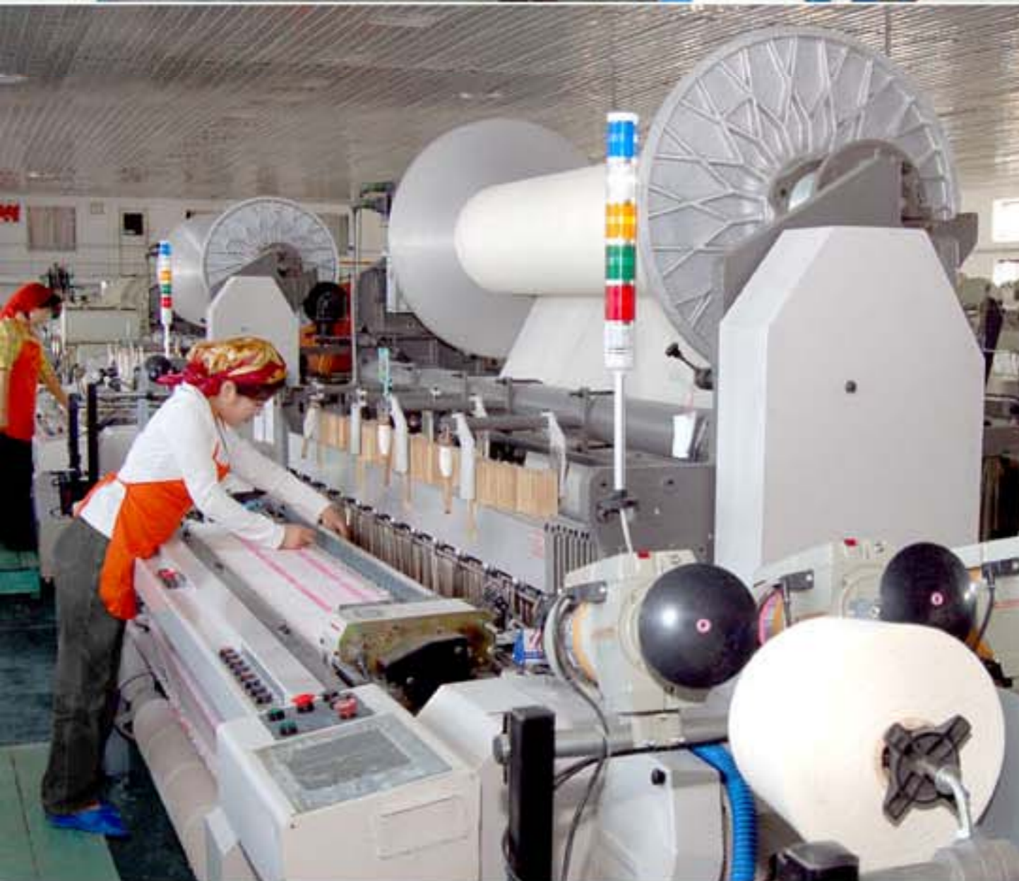
The Sinuiju Unha Towel Factory strictly observes technical regulations and standard operating instructions to increase production