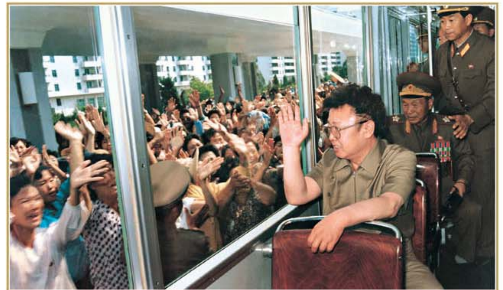
Kim Jong Il acknowledges the cheering masses from a tram bound for the Kumsusan Memorial Palace (July 1995)