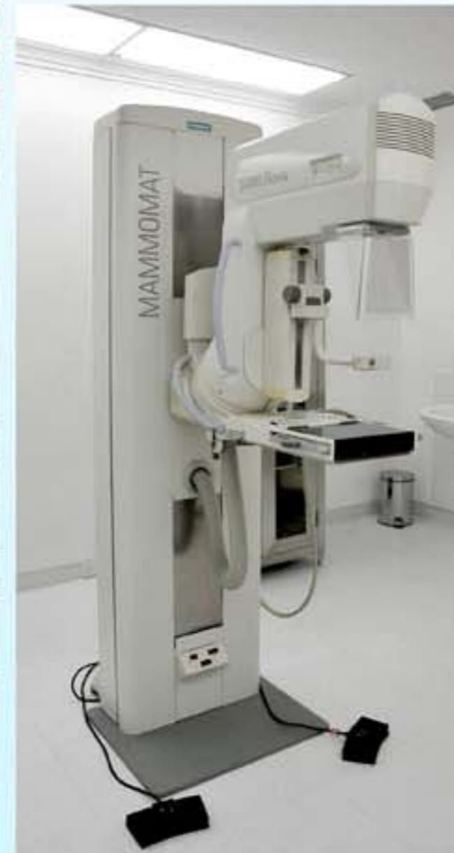
Mammary gland photographing room