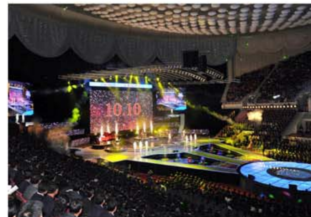
The performance of the Moranbong Band vigorously encourages all the Korean service personnel and people out in their grand march