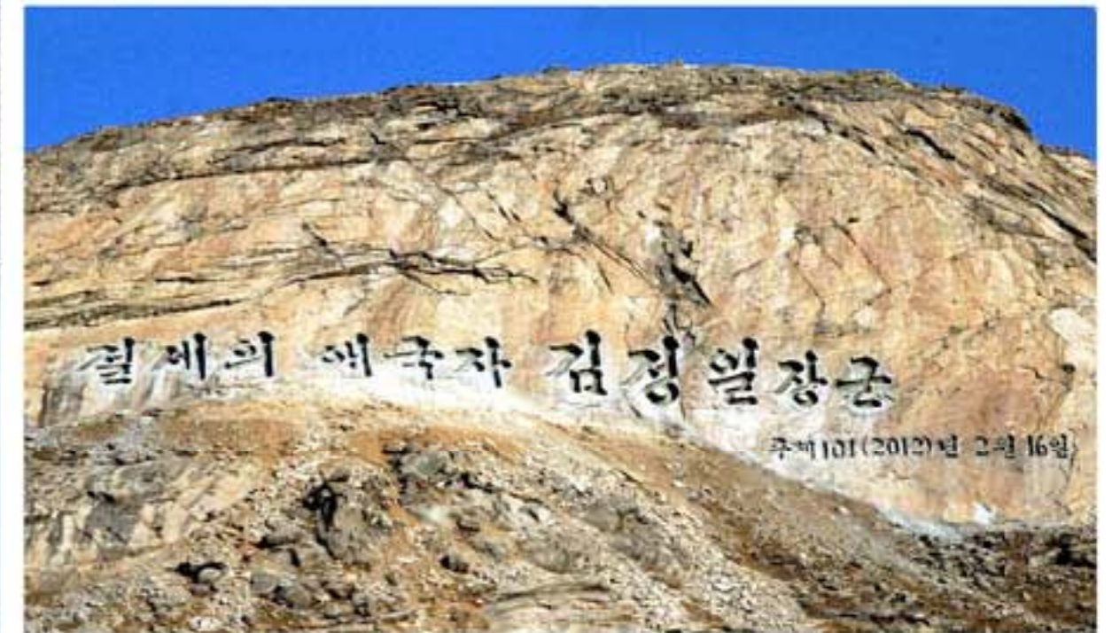
Letters "General Kim Jong II, Peerless Patriot" are carved on a natural rock in Mt. Sokta, Jungsan County, South Phyongan Province