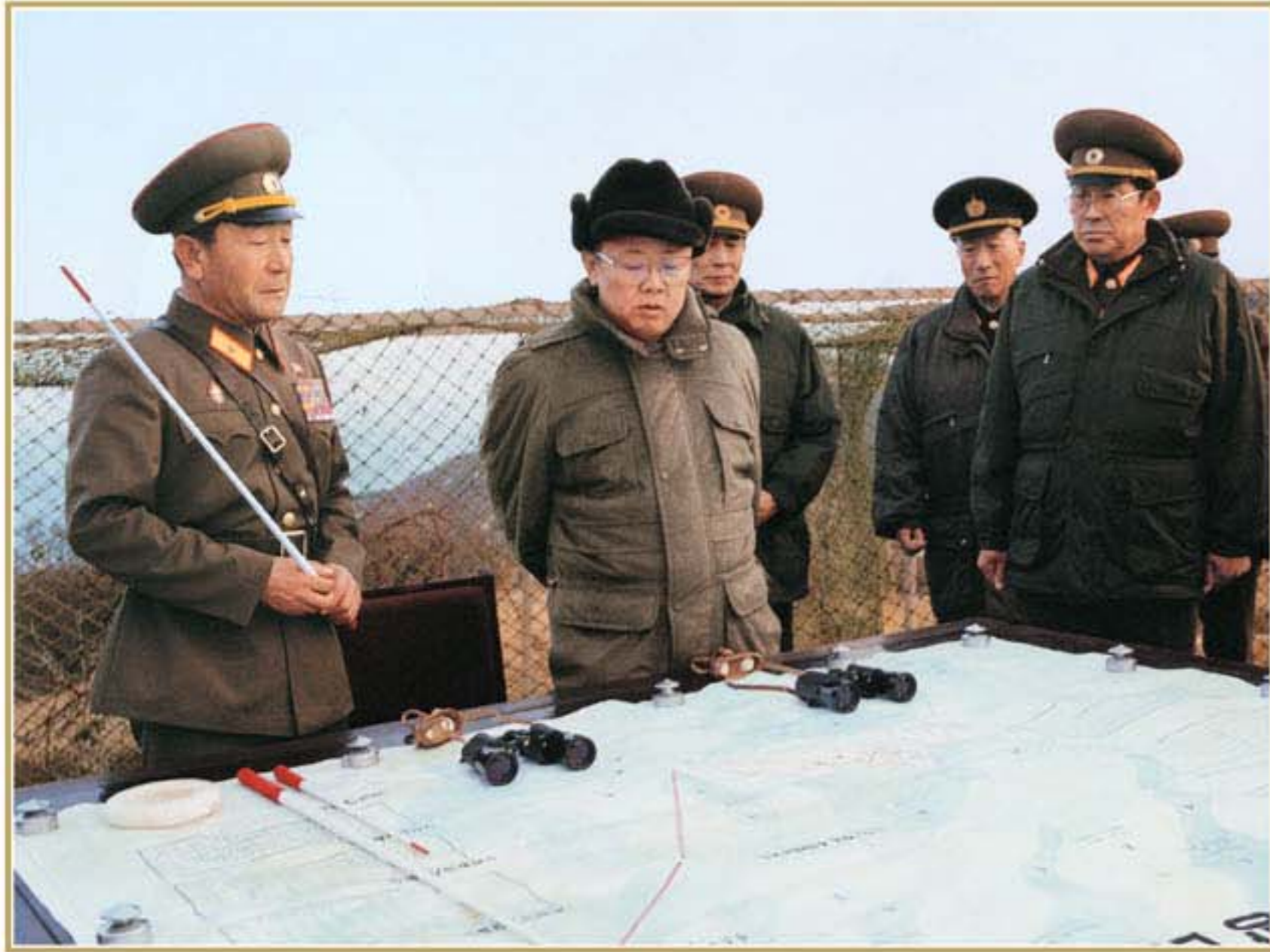
Kim Jong Il inspects the unit defending Cho Islet, a frontline post on the West Sea of Korea (November 1996)