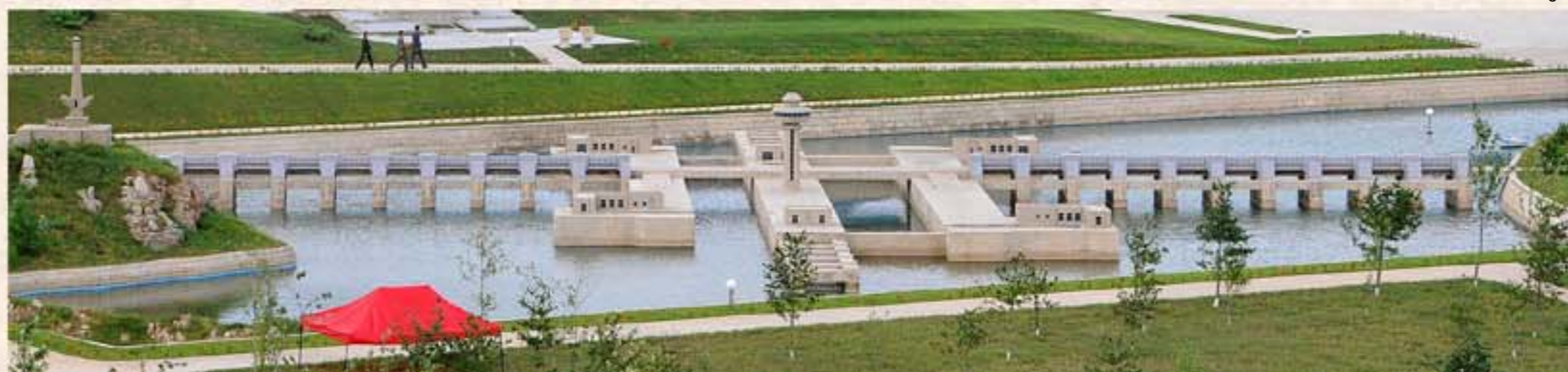
West Sea Barrage