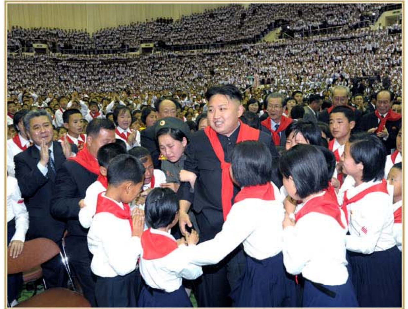
The respected Marshal Kim Jong Un embraces the delegates to the celebrations of the 66 th founding anniversary of the Korean Children's Union (June 2012)