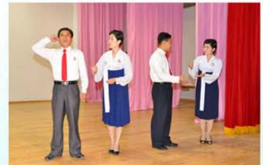
Students prepare themselves to be the capable education workers for the future

The first pedagogical university in the DPRK, Kim Hyong Jik University of Education was founded on October 1, 1946.