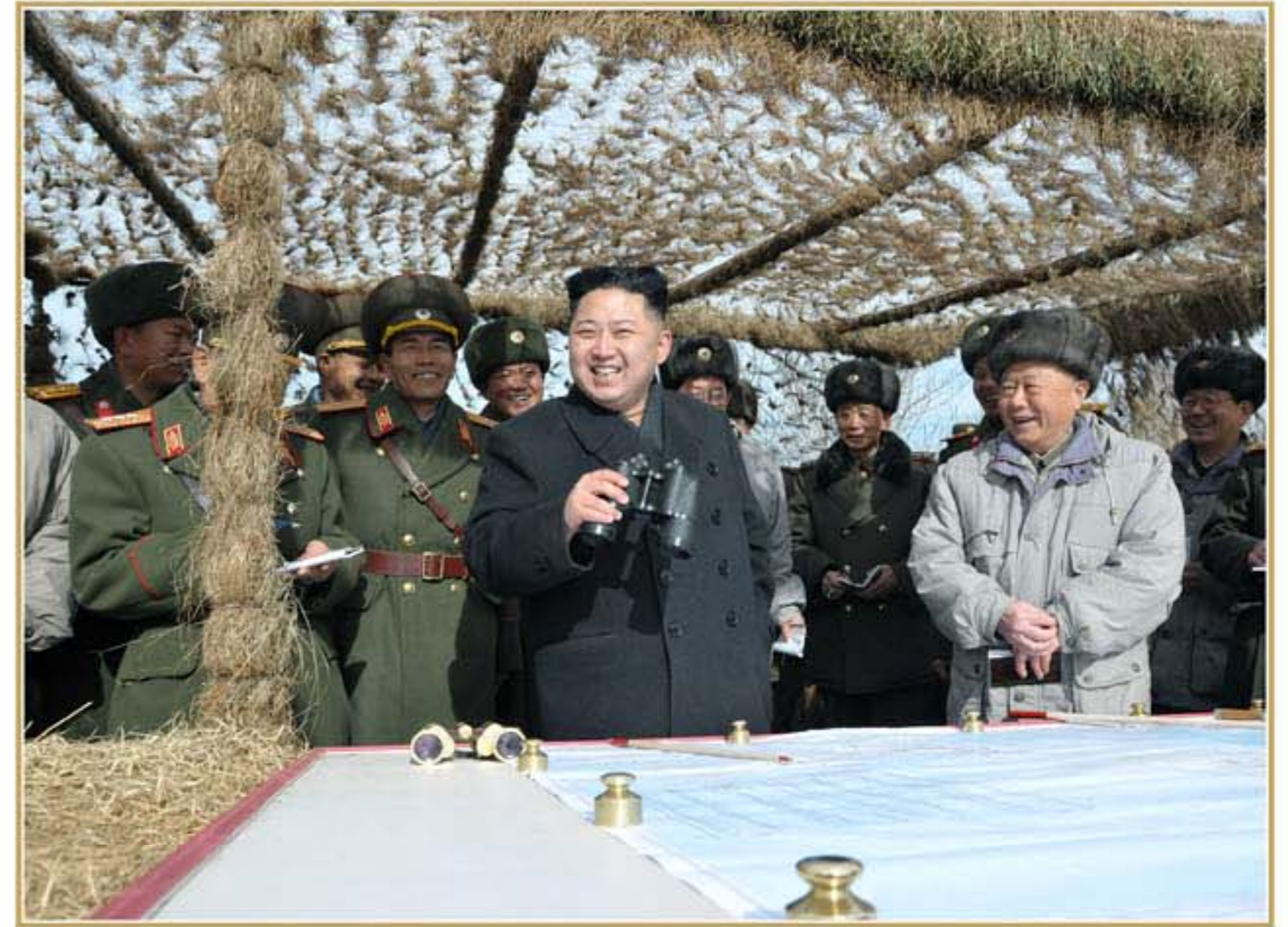
Kim Jong Un, Supreme Commander of the Korean People's Army, inspects a KPA unit (February 2012)