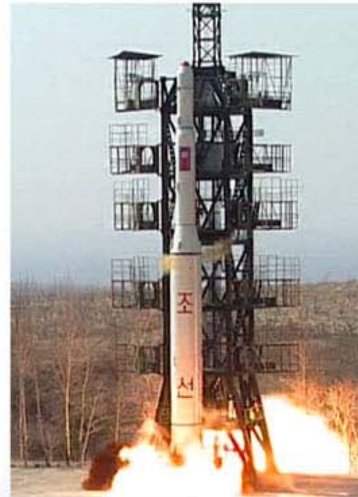
The launch of the artificial earth satellite Kwangmyongsong 2 in 2009