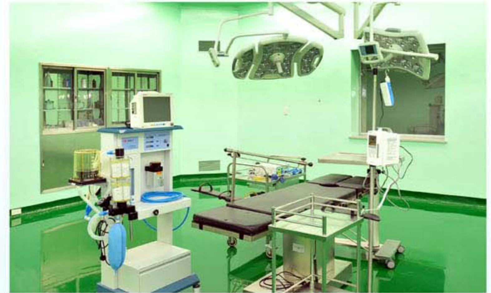
General operating room