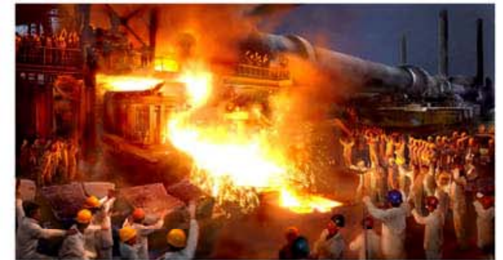
The establishment of the Juche-based iron production system in the Songjin Steel Complex