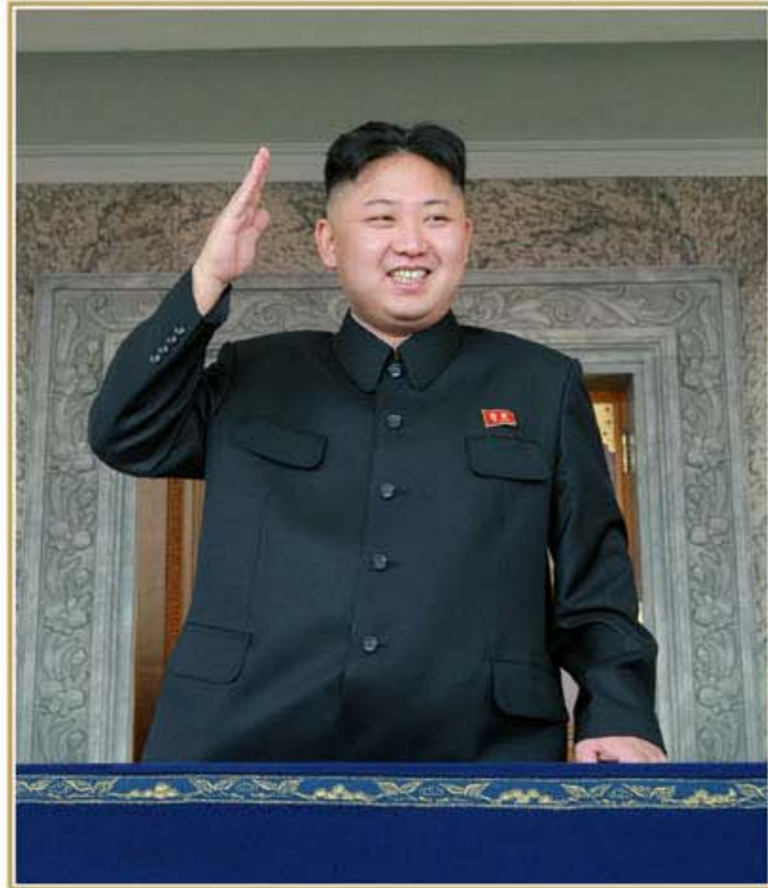
Kim Jong Un, Supreme Commander of the Korean People's Army, salutes the cheering paraders at the military parade held in celebration of the centenary of the birth of President Kim Il Sung (April 2012)