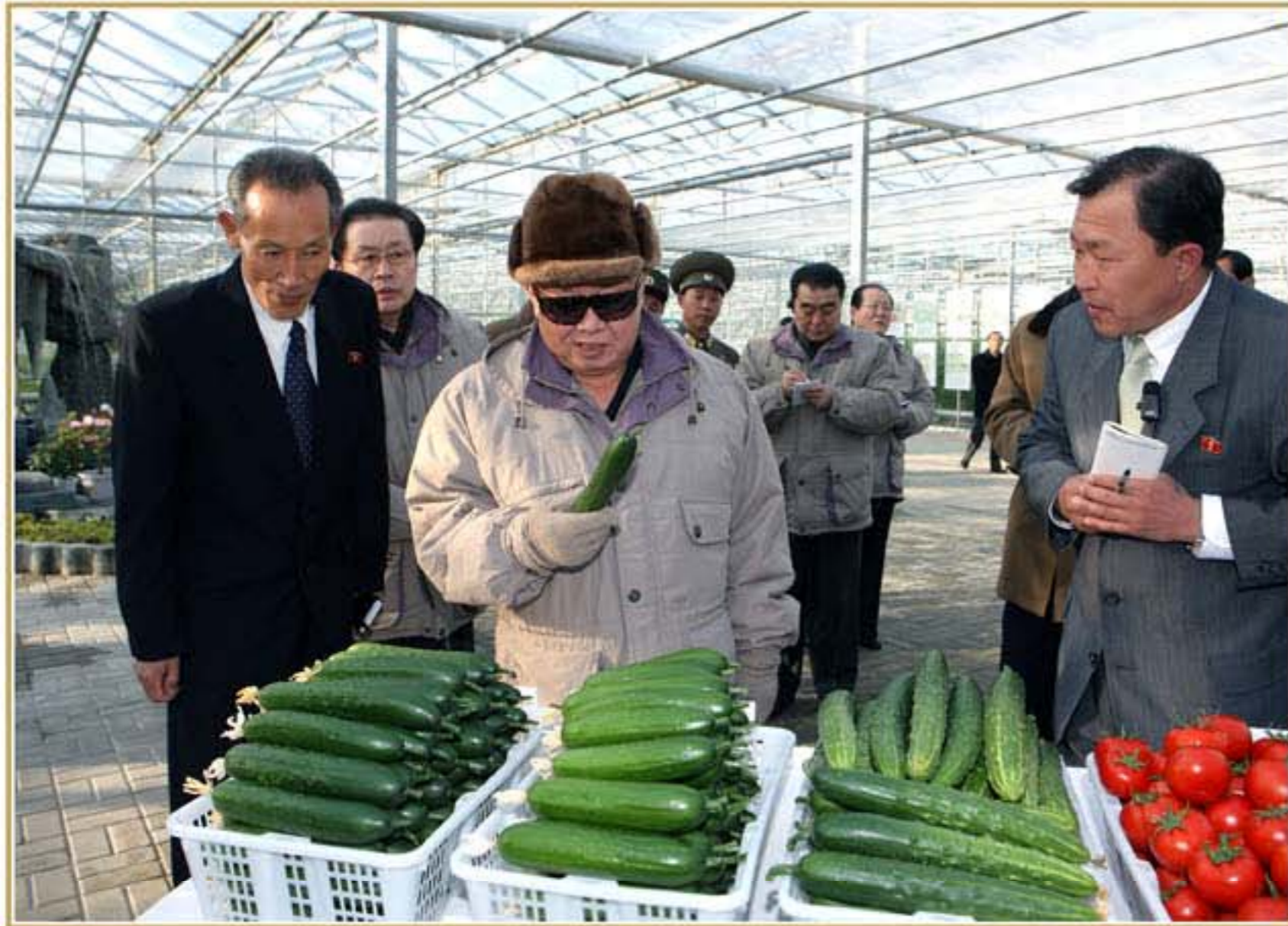
Kim Jong Il provides field guidance to the Pyongyang Vegetable Research Institute (March 2011)