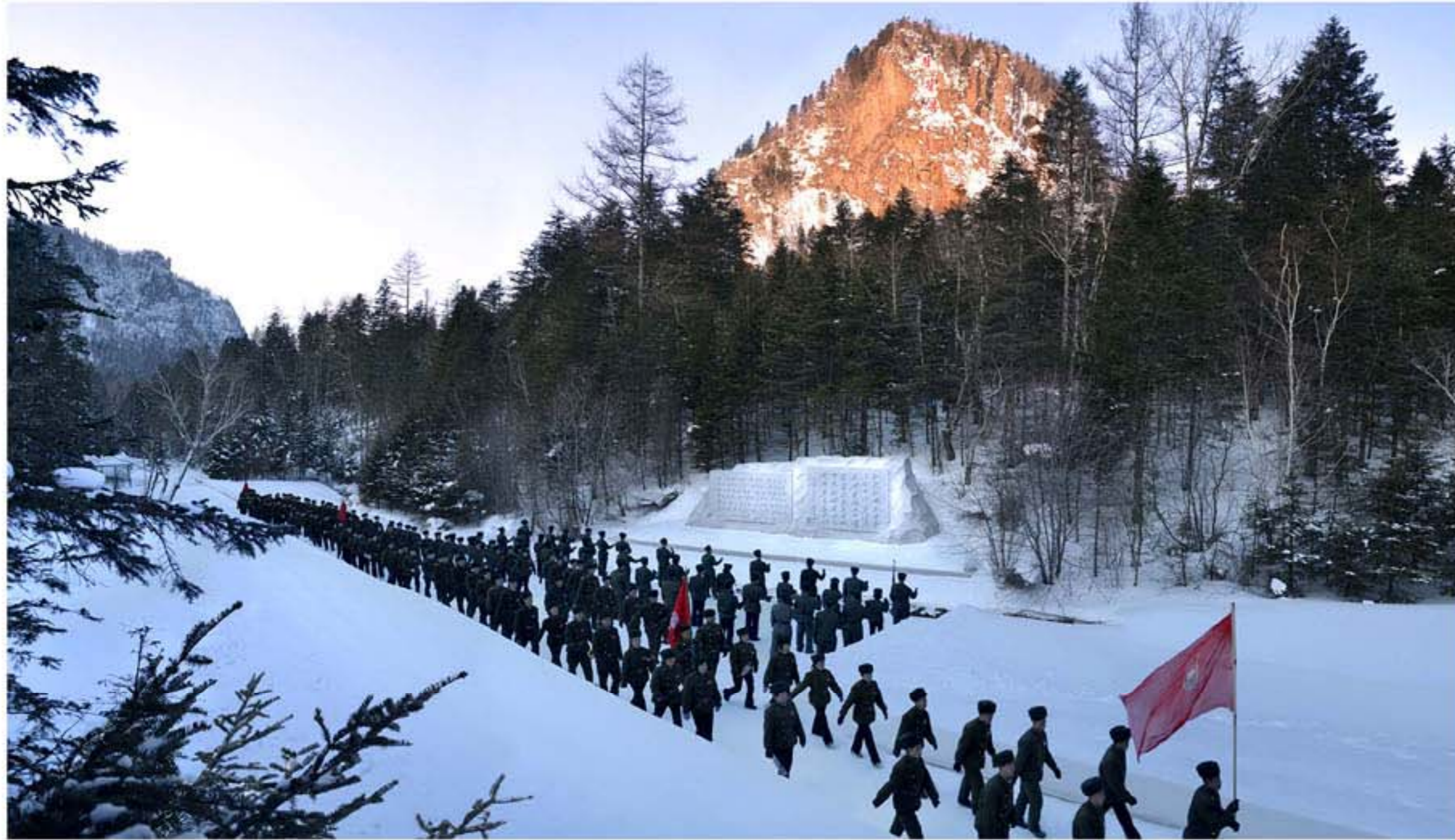
People visit Kim Jong II's birthplace in the Paektusan Secret Camp