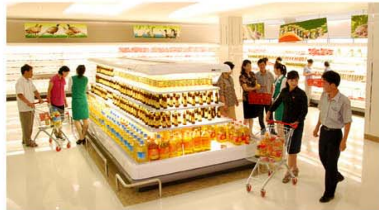
Mansugyo Meat & Fish Shop