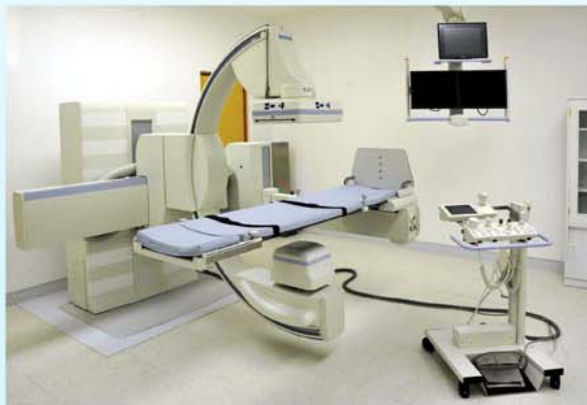
Multipurpose X-ray room