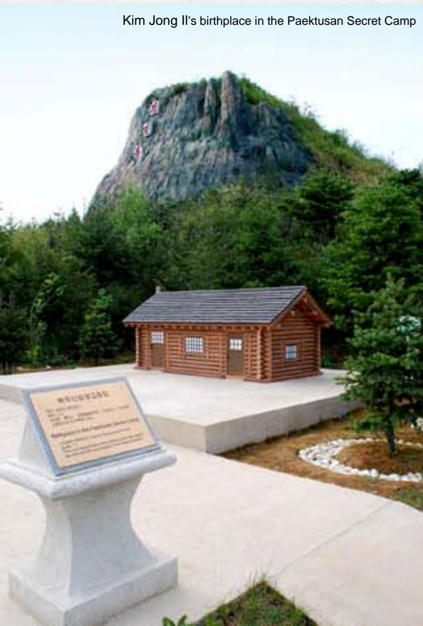
Kim Jong Il's birthplace in the Paektusan Secret Camp