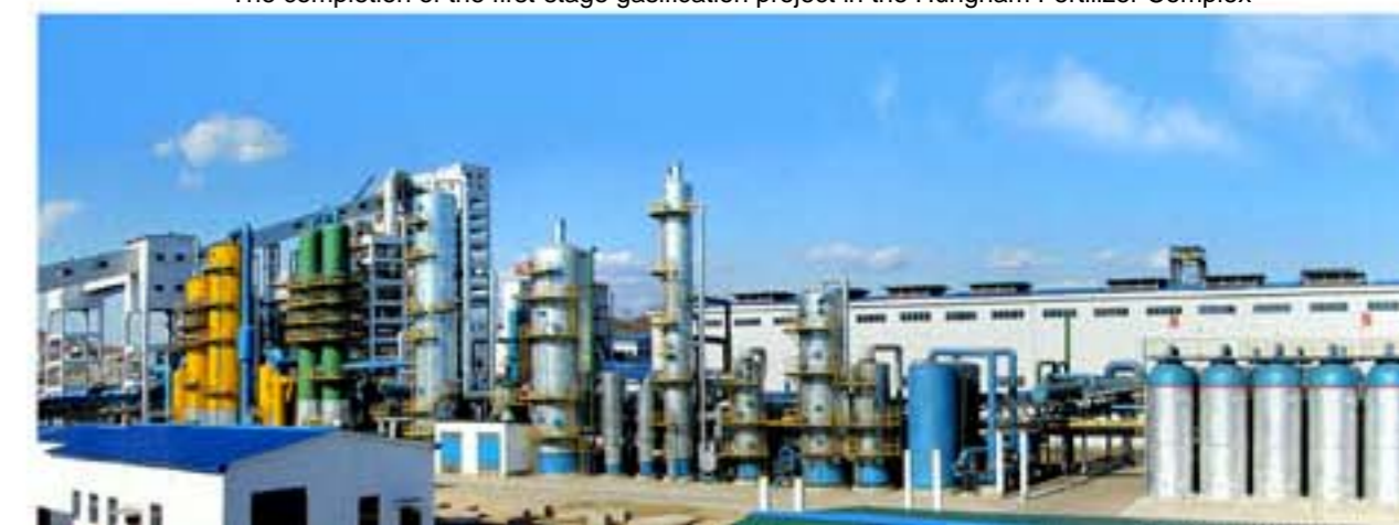
The completion of the first-stage gasification project in the Hungnam Fertilizer Complex