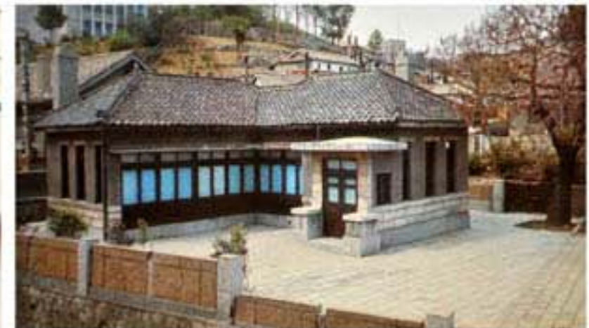
An office of the Puryong County People's Committee (left) Kim Jong Suk visited and a house (right) where she talked with the Women's Union officials from Ingok-dong, Chongjin, North Hamgyong Province after Korea's liberation