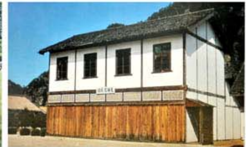
The place in Yondu Peak (left) where Kim Jong Suk guided the meeting of heads of the underground organizations and the Kwangson Photo Studio (right) she used while engaging in underground political activities during the anti-Japanese armed struggle