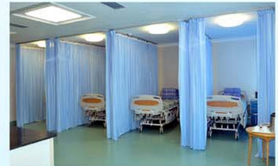
Intensive care room