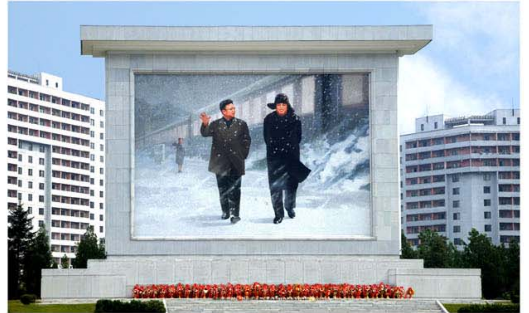
The mosaic mural portraying the great Comrades Kim Il Sung and Kim Jong Il is set up in Thongil Street in Pyongyang in September 2012