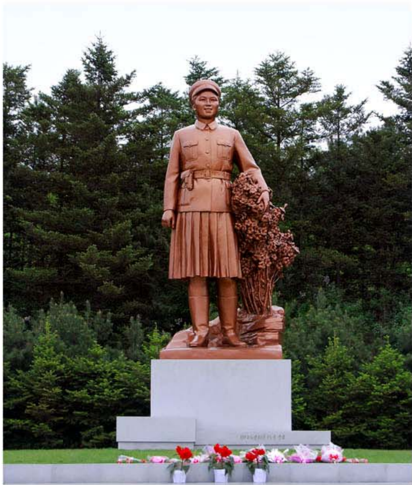
Statue of Kim Jong Suk, anti-Japanese heroine, erected in Hoeryong, North Hamgyong Province