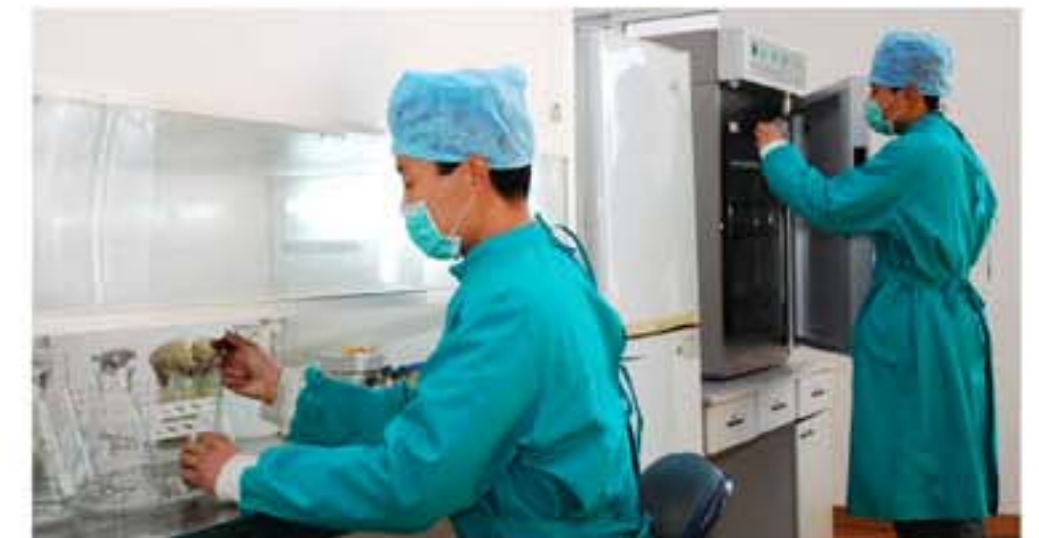
To attain a higher goal (in the bioengineering branch of the academy)