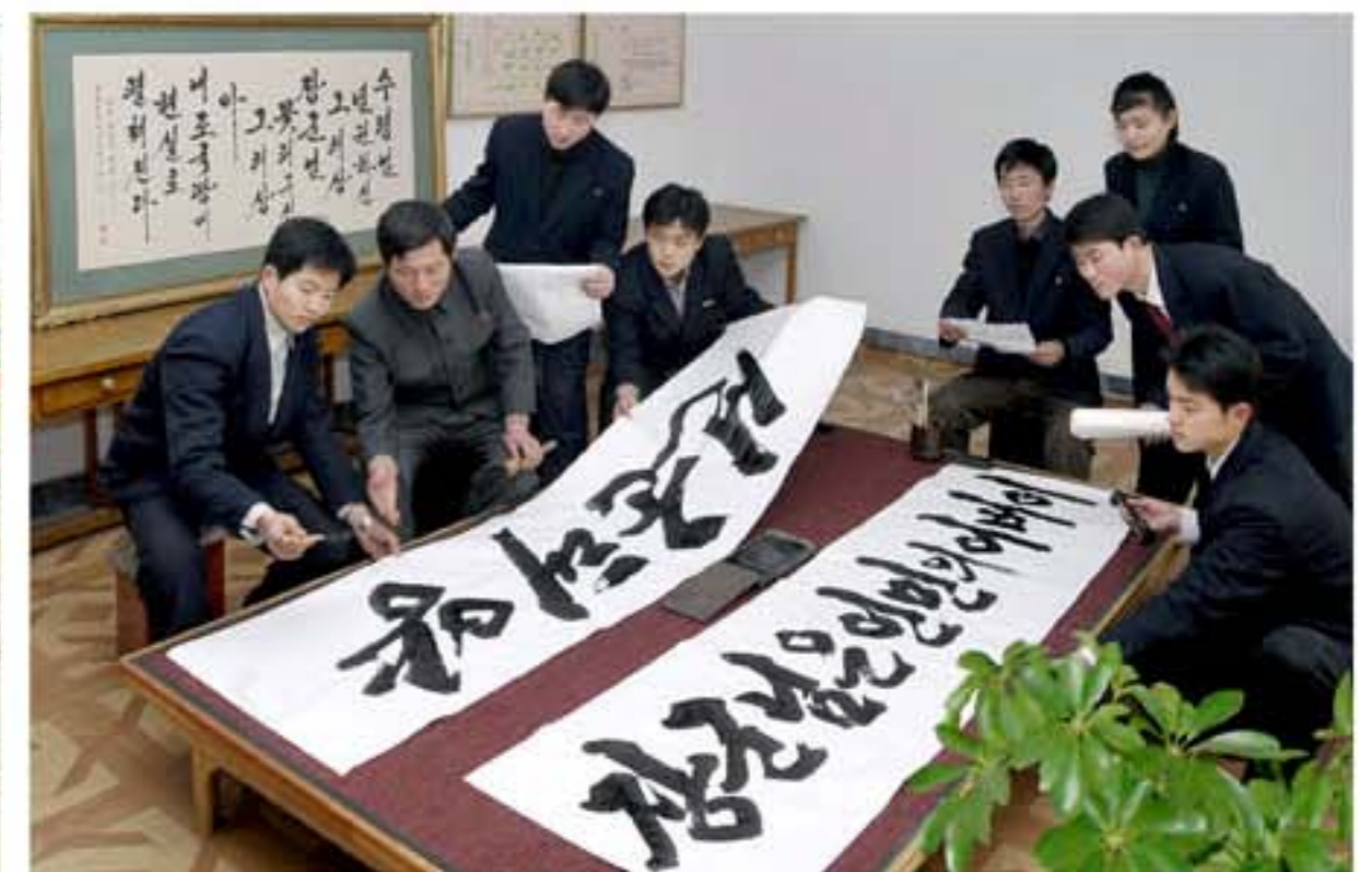
With ardent yearning for General Kim Jong II