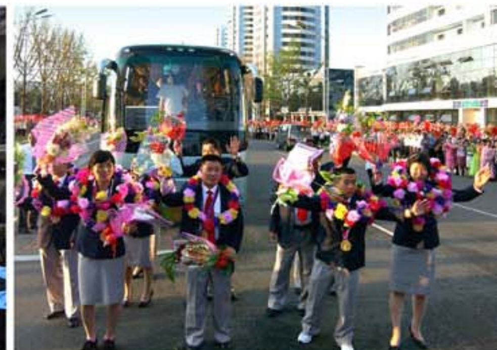
Winners at the 30 th Olympic Games