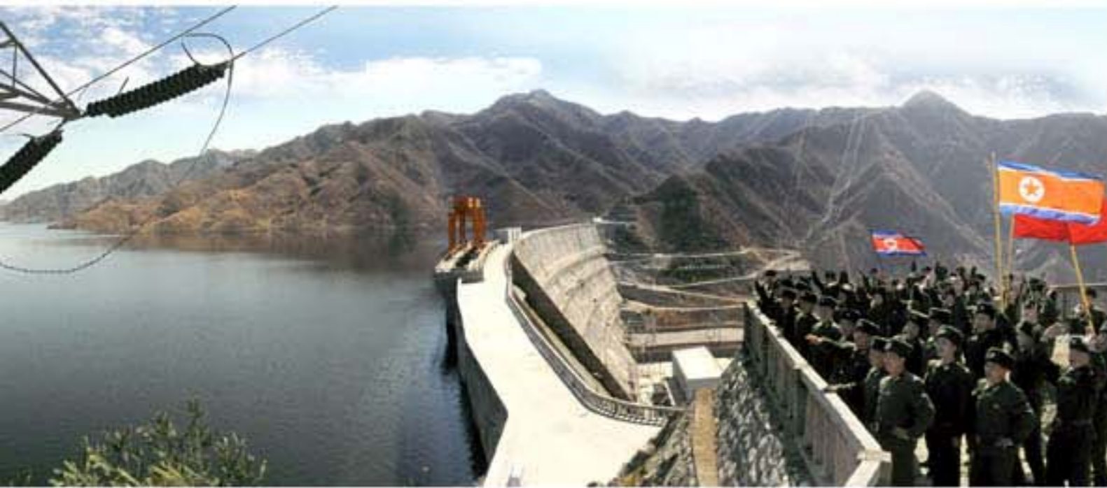
Huichon Power Station No. 2 puts into commission