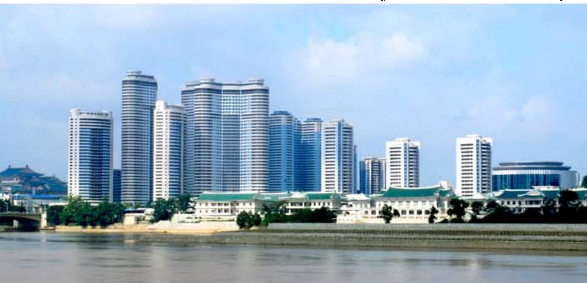
Changjon Street built as a monumental structure in the Songun era