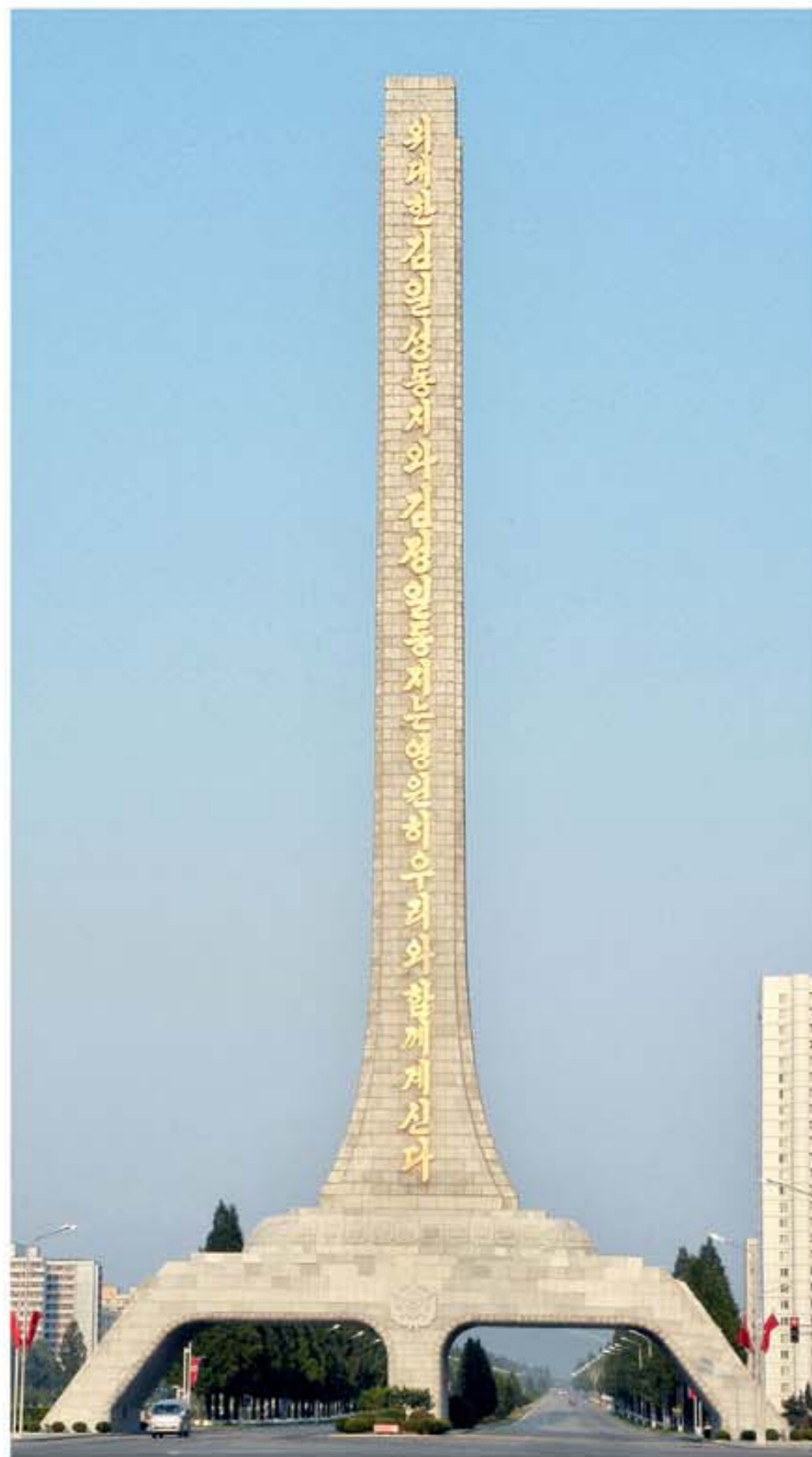
Tower to the immortality of the great leaders, "The Great Comrades Kim Il Sung and Kim Jong Il Will Always Be with Us."