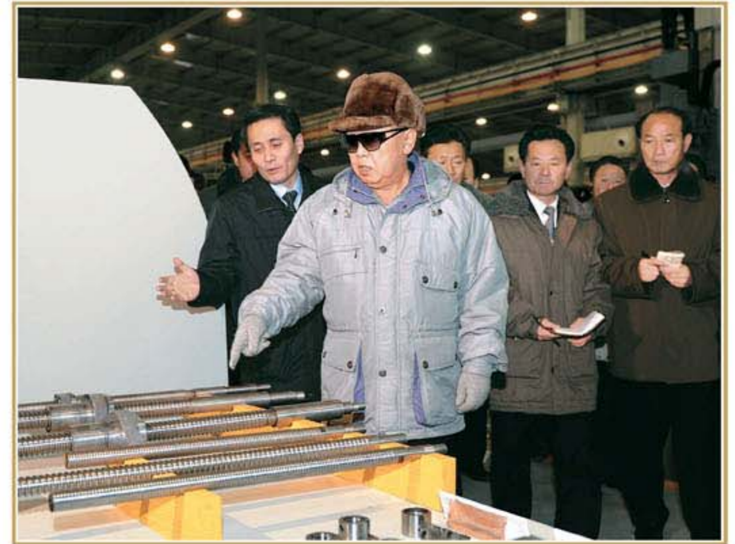
Kim Jong Il visits the Huichon Ryonha General Machine Factory (December 2010)