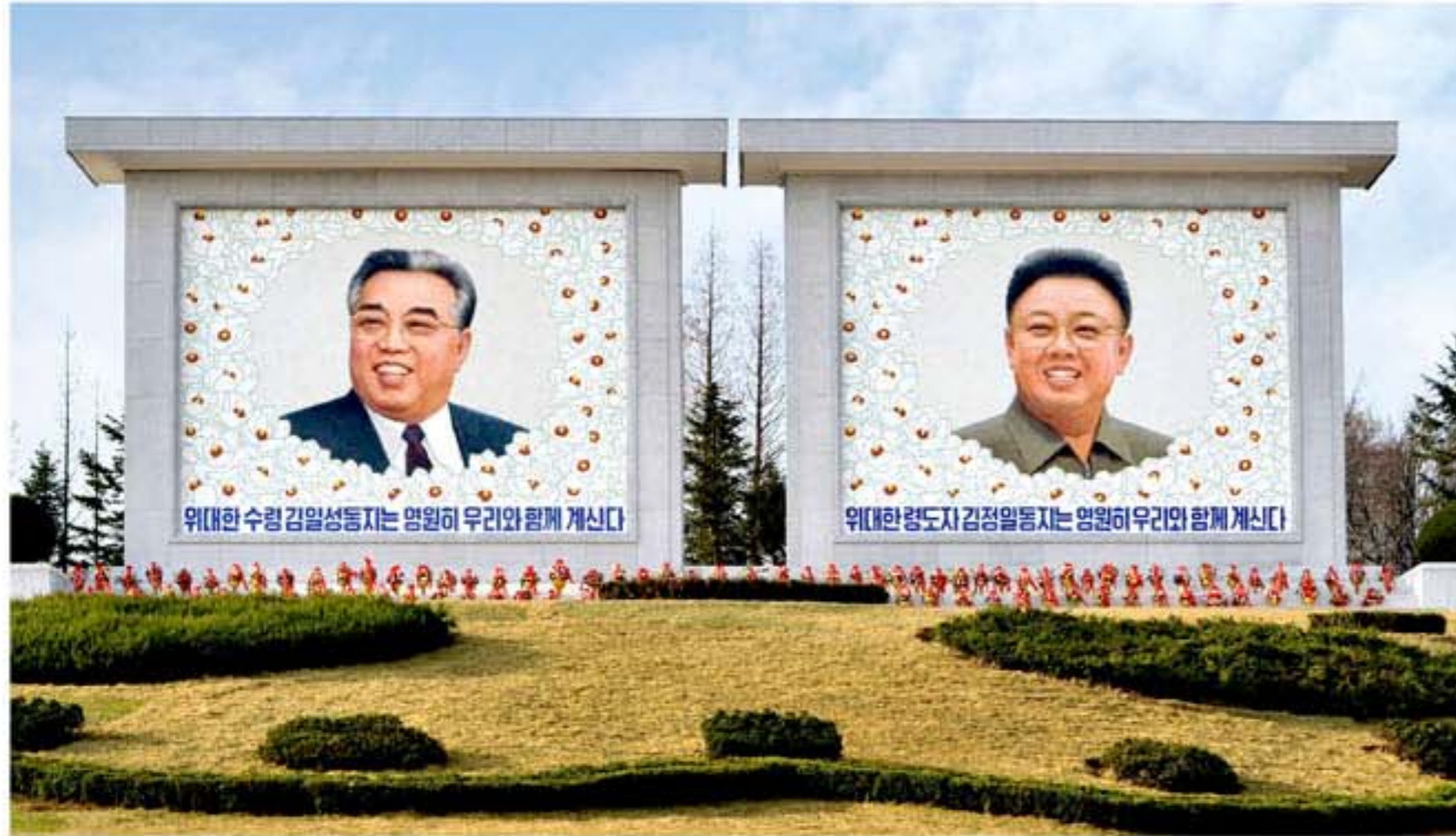
The mosaic murals bearing the beaming images of Kim Il Sung and Kim Jong Il are erected on Jangdae Hill in Pyongyang in April 2012