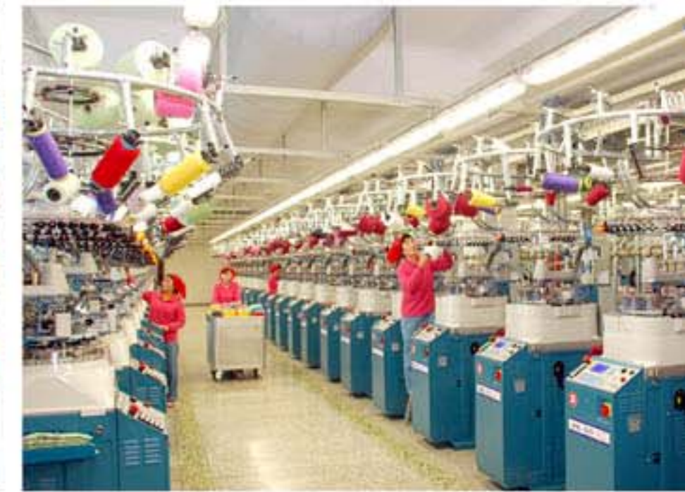
A lot of modern light-industry factories are built to turn out quality consumer goods (Pyongyang Hosiery Factory)