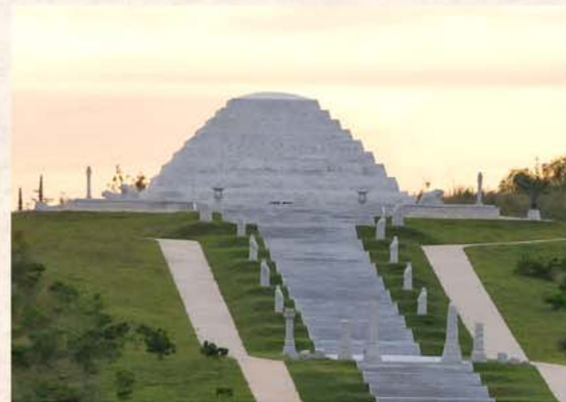
Mausoleum of King Tangun

The respected Marshal Kim Jong Un, while looking round the park on the eve of its inauguration, said in deep retrospect that the park reminded him of the fatherly General who initiated its construction and the General must have