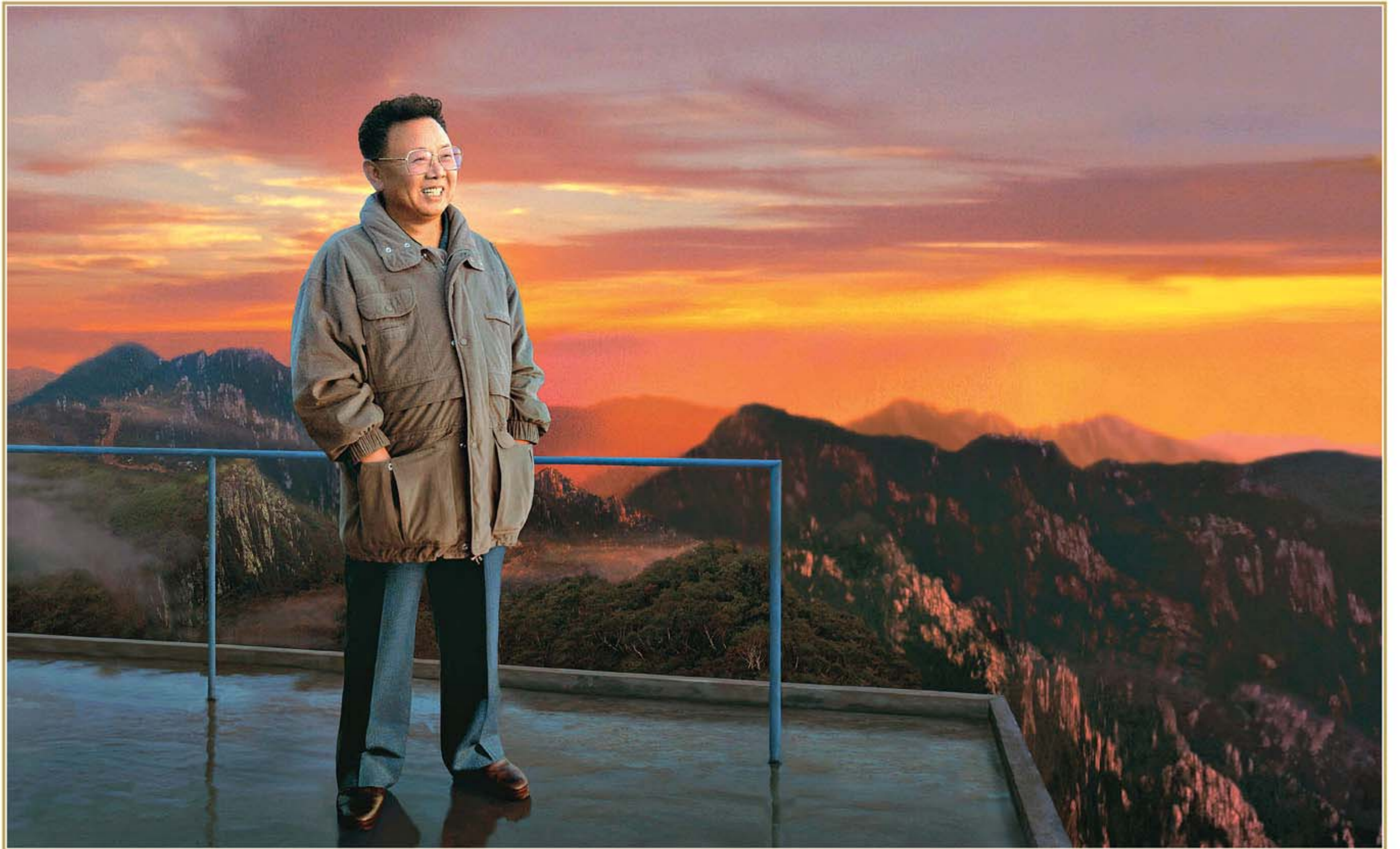
Kim Jong Il Optimistic about Rosy Future of Songun Korea