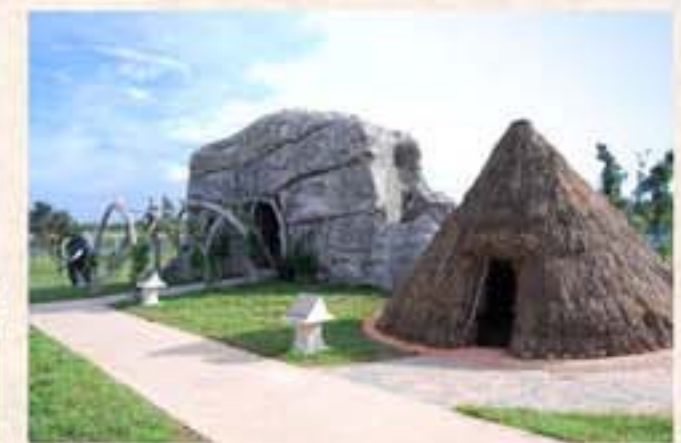
Some relics related to the life of primitive men