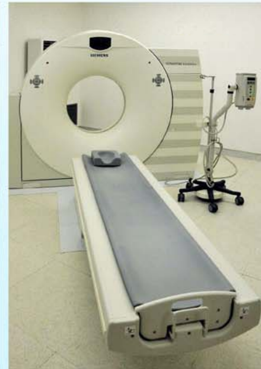
CT scanning room