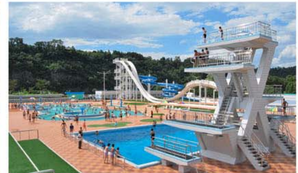
Rungna Islet in Pyongyang turns into the comprehensive resort for people (Rungna Wading Pool)