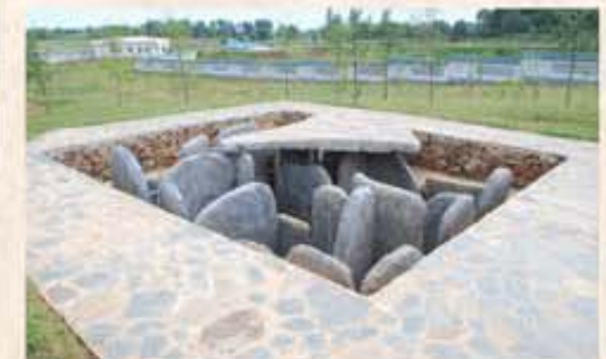
A tomb in Ryongsan-ri, where the slaves were buried alive with their dead lord

been glad to see the splendidly-built park.