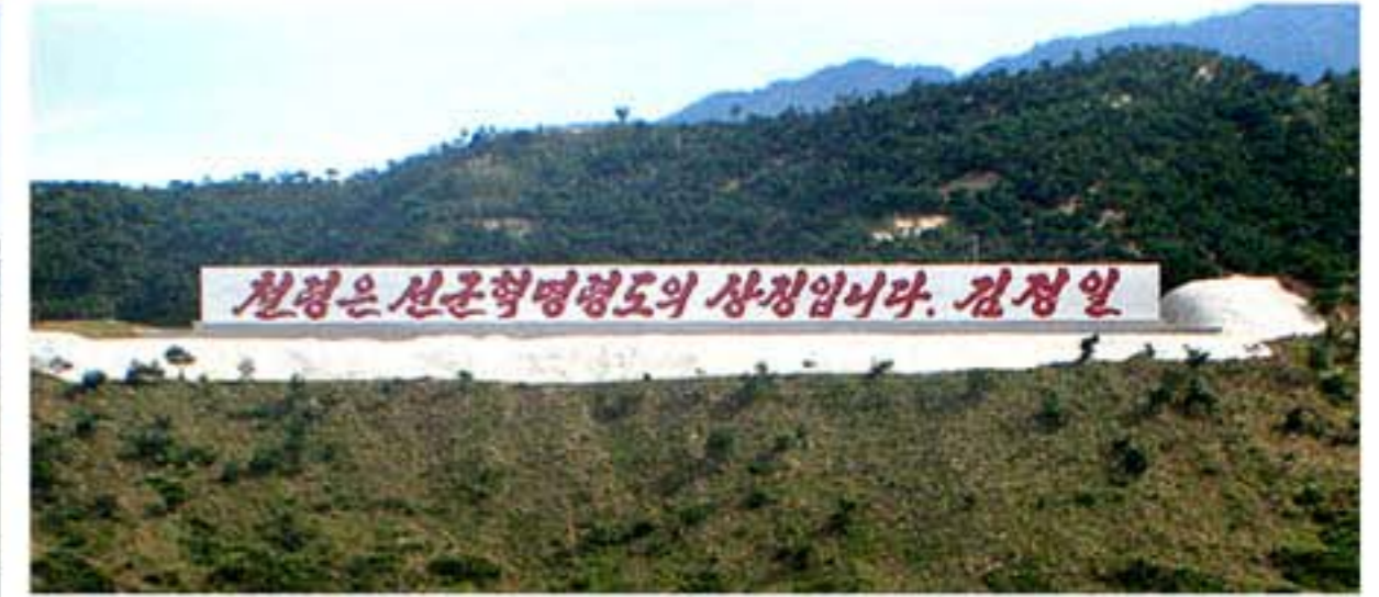
A monument bearing the instruction "Chol Pass is symbolic of the Songun-based revolutionary leadership. Kim Jong II" is erected at the entrance to Chol Pass in September 2012