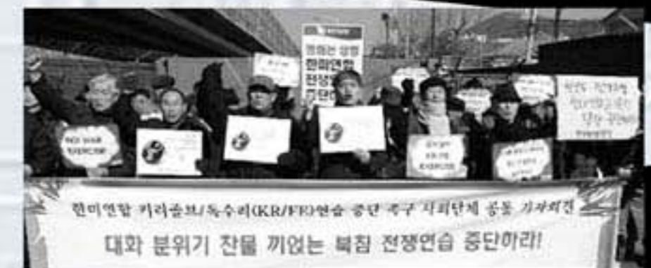
South Koreans denounce the north-targeted war games