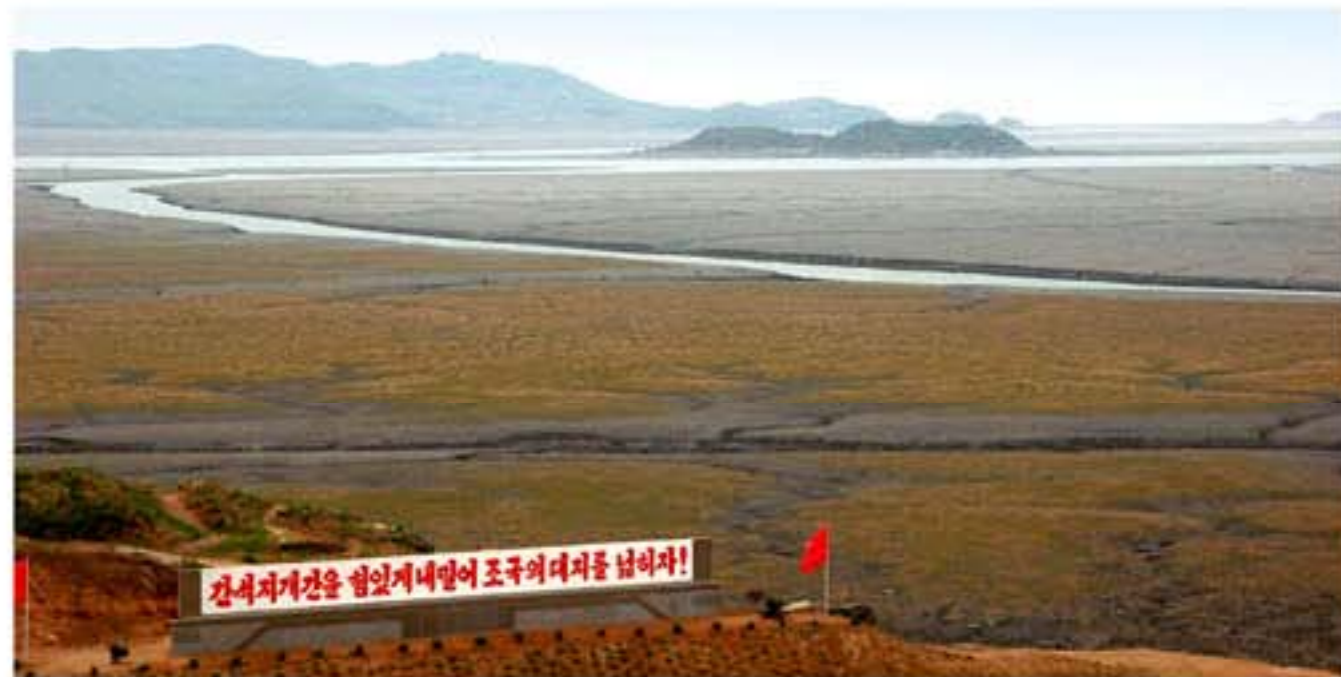
Second-stage of the Kwaksan tideland reclamation project is completed