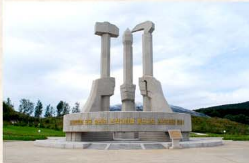
Party Founding Memorial Tower