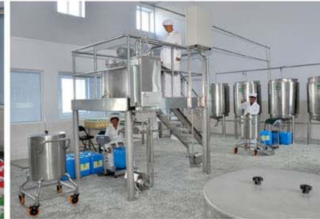
The factory produces various kinds of essential oil for foods and industrial purposes