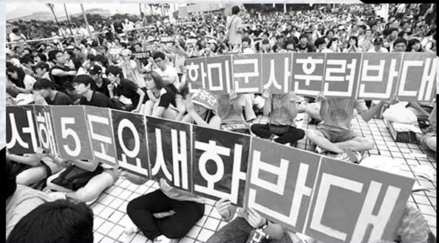
The US troops and south Korean army are conducting north-targeted war games, building up the tension on the Korean peninsula