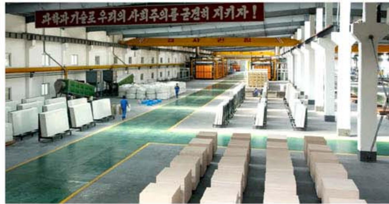
Partial view of the renovated Taedonggang Tile Factory