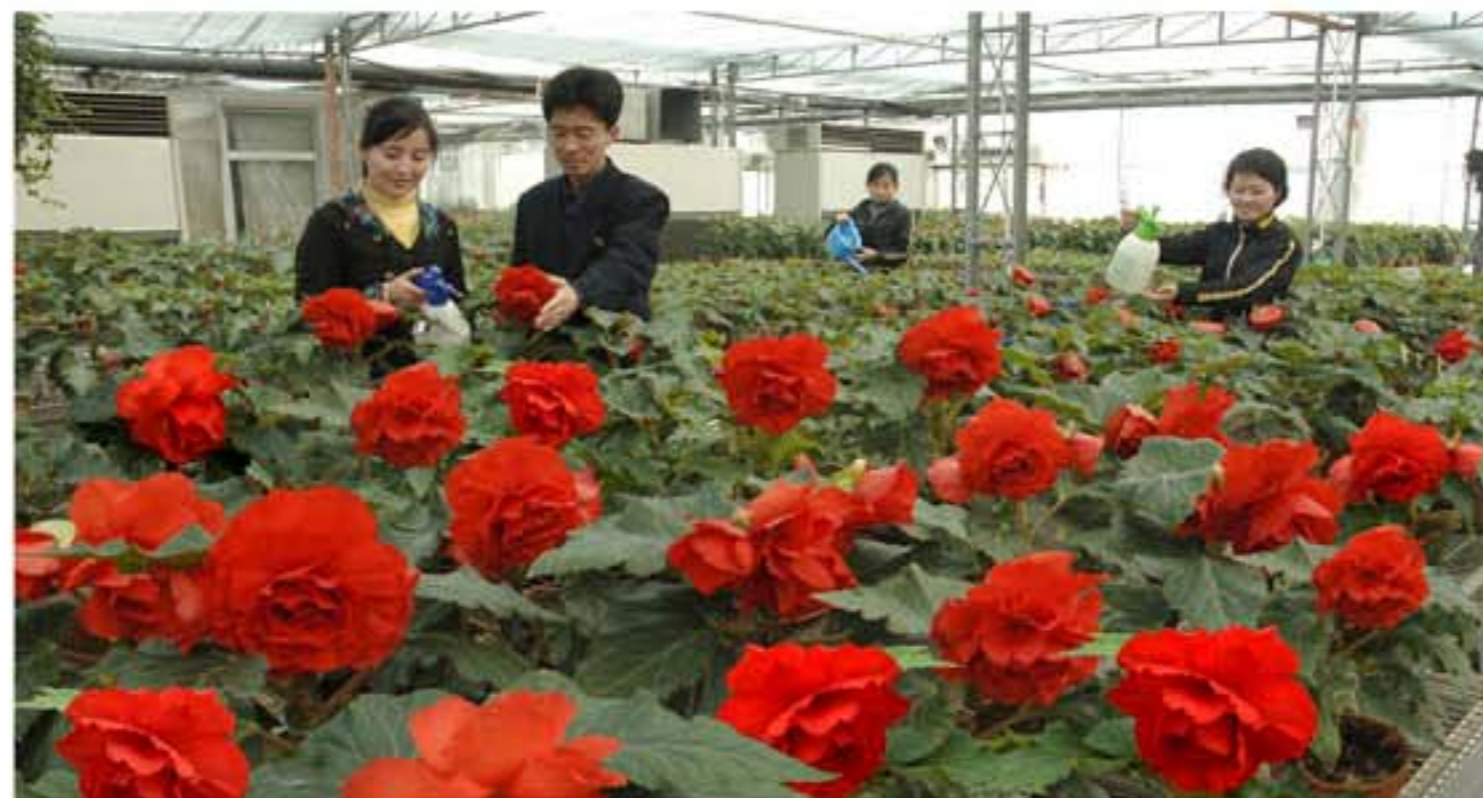
Devotion to cultivating the immortal flower Kimjongilia

With each passing day the Korean people feel stronger yearning for him, which encourages them to step up the dynamic advance to the building of a thriving socialist country as wished by the General, under the leadership of Marshal Kim Jong Un.