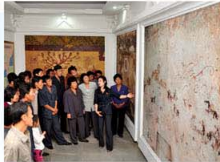
Visitors look round the hunting paintings in the Yaksu-ri tomb