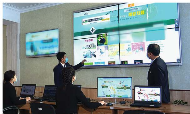
The range of commercial introduction increases through the e-commerce website Manmulsang .