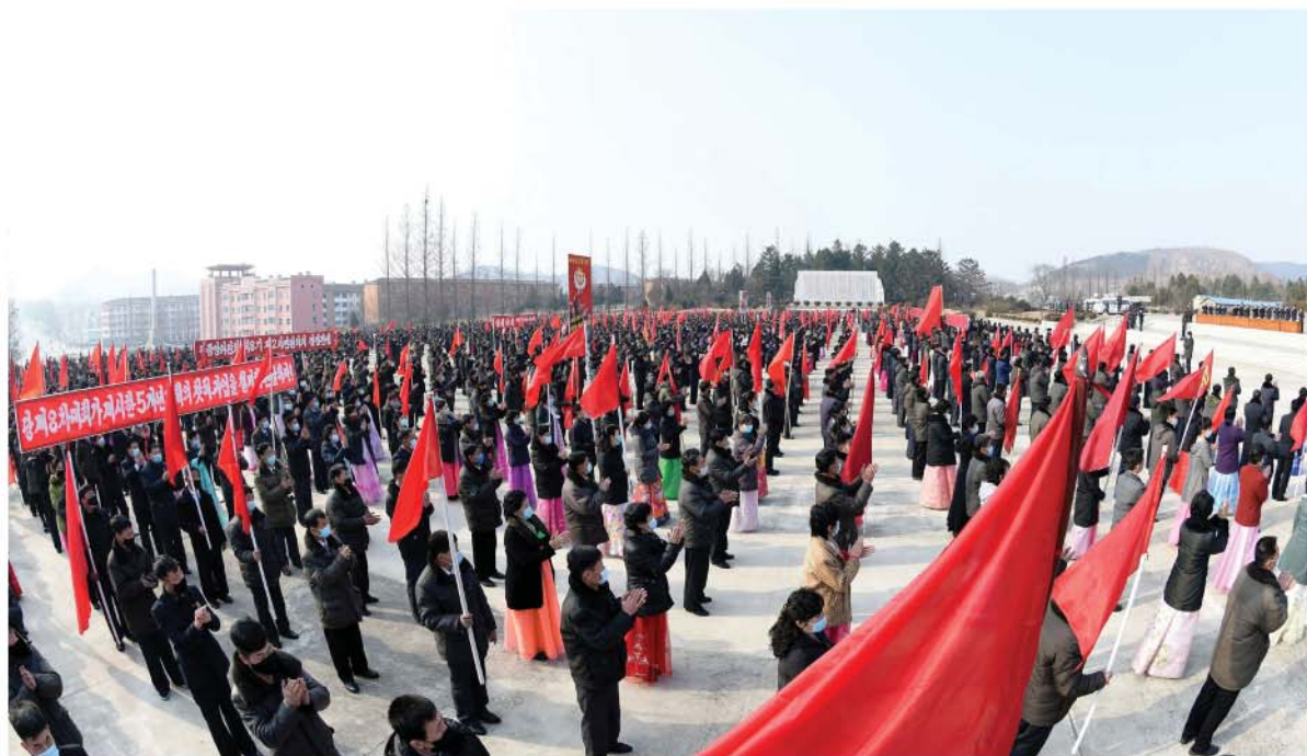
The workers of the Hwanghae Iron and Steel Complex held a rally to affirm their commitment to carry out their first-year tasks of the five-year plan true to the spirit of the Second Plenary Meeting of the Eighth Central Committee of the Workers' Party of Korea, and adopted an appeal to all other working people across the country in February 2021.