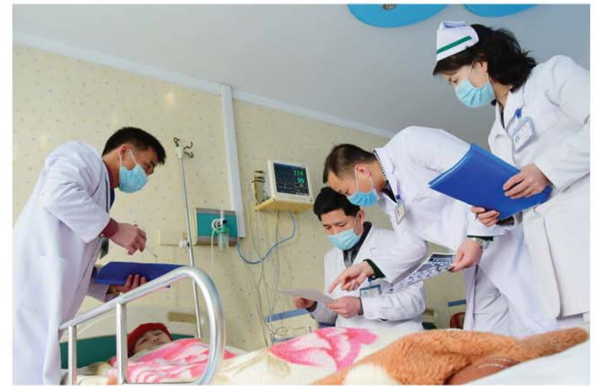
Parental care is given to a child.