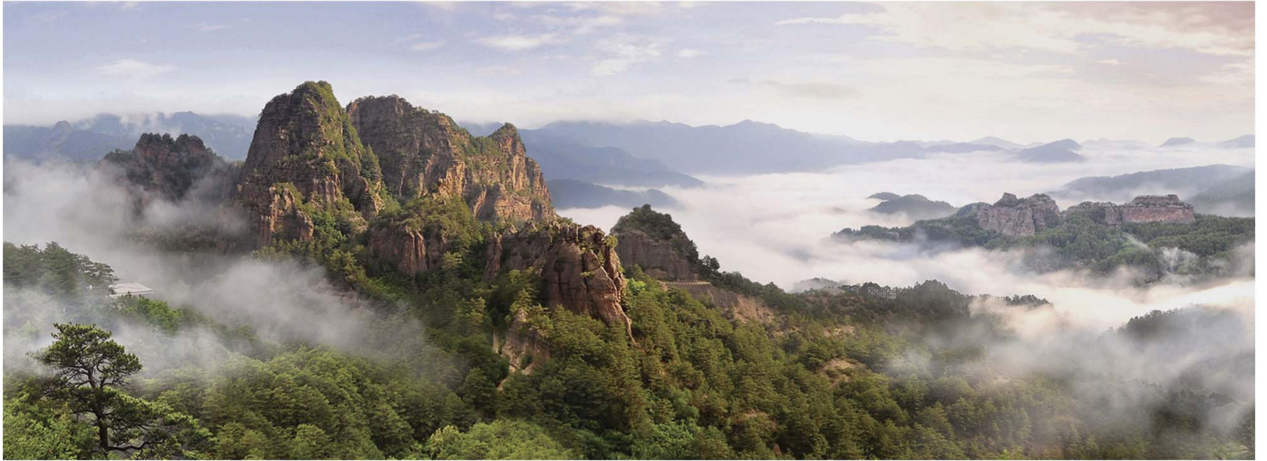
Scenic beauty of Inner Chilbo.