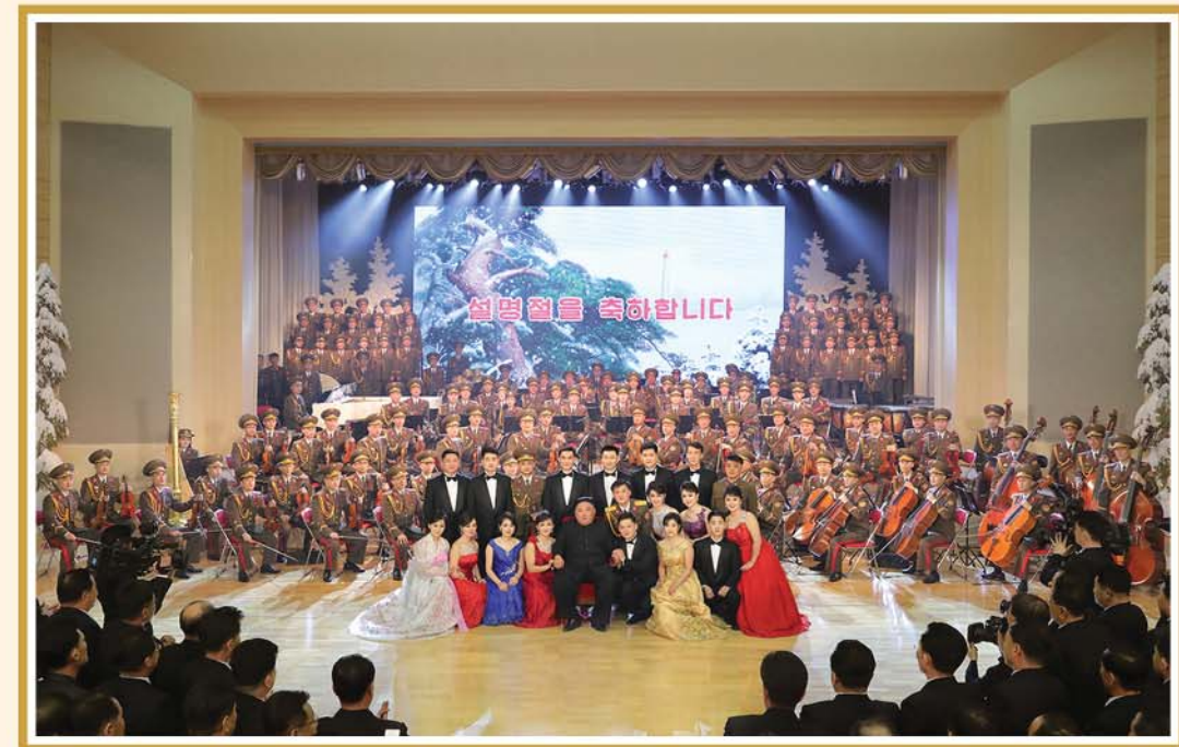
Kim Jong Un has a photo taken with the participants in the lunar New Year's Day performance after seeing it in February 2021.