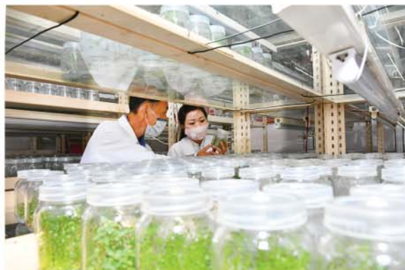
Researchers observe the state of tissue culture of the blueberry.