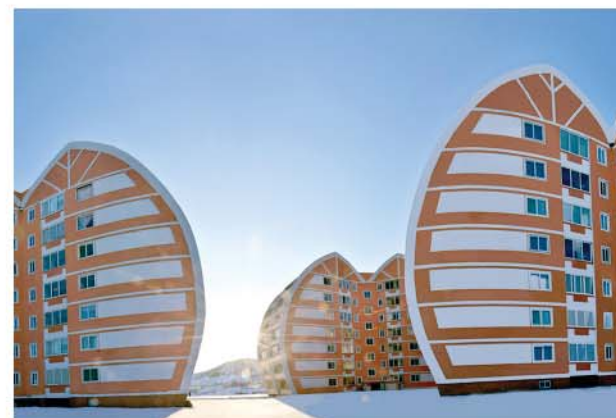
At a newly-built house.

The county has also pushed ahead with the river improvement as the masses' own effort at the same time. According to Ri Chol Hak, an official of the