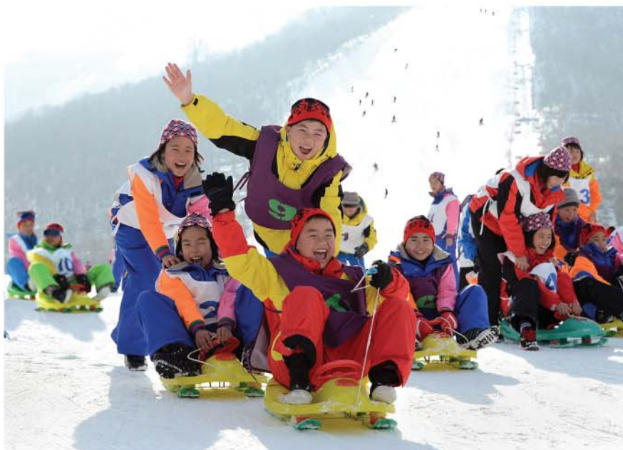
Children go sledding at the Masikryong Ski Resort in December 2018.