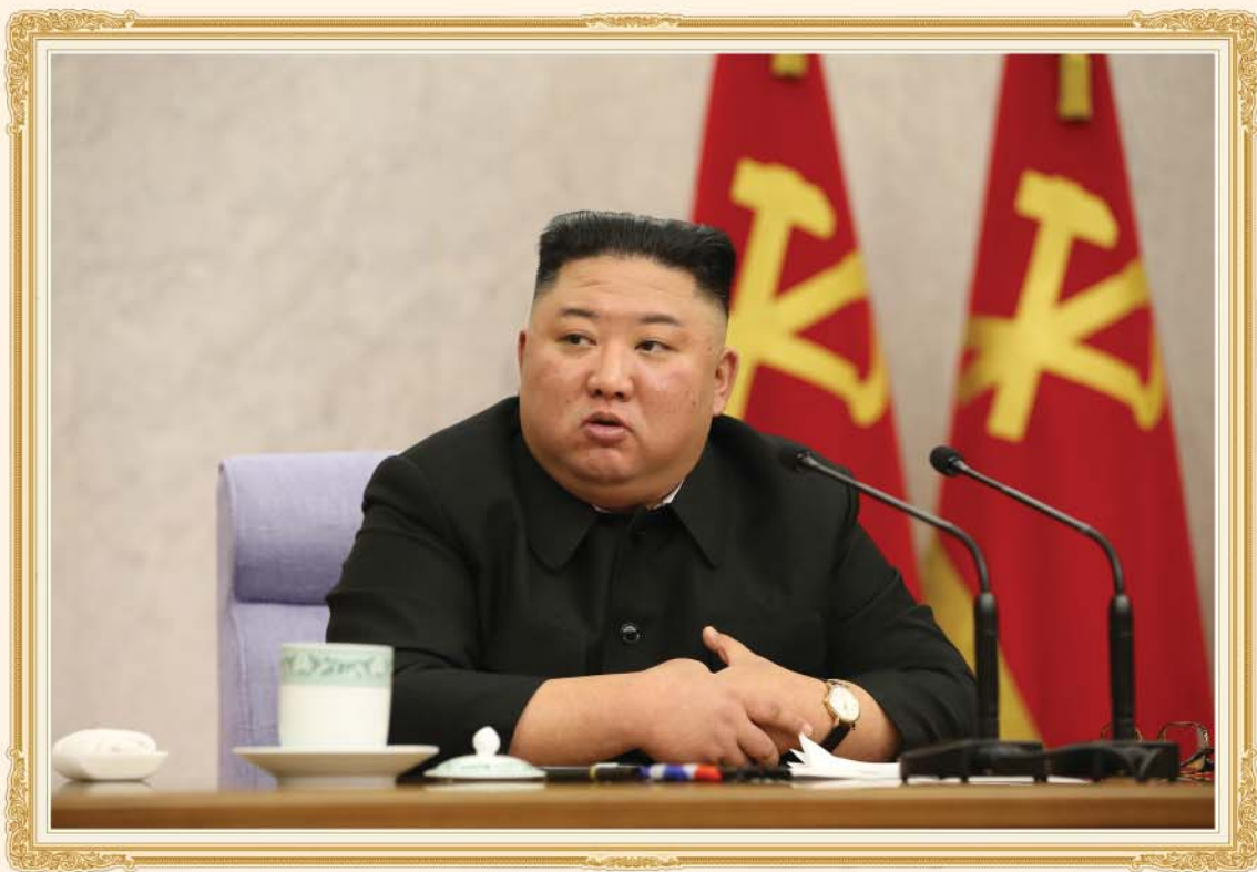
Kim Jong Un, general secretary of the Workers' Party of Korea, guides the Second Plenary Meeting of the Eighth Central Committee of the WPK in February 2021.