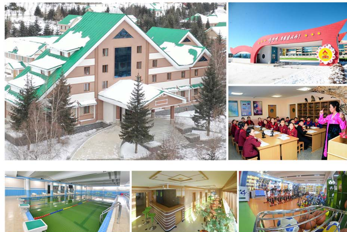
An apartment house, a school and public welfare facilities in Samjiyon.

Later the Supreme Leader solved all problems arising in the project from the formation of a strong construction unit to the supply of equipment, materials and fund, and inspected relevant construction sites several times, giving scrupulous guidance to the builders so that they