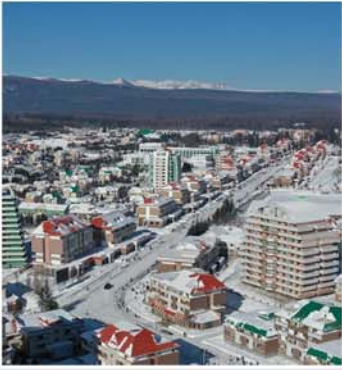
Front Cover: A bird's-eye view of Samjiyon