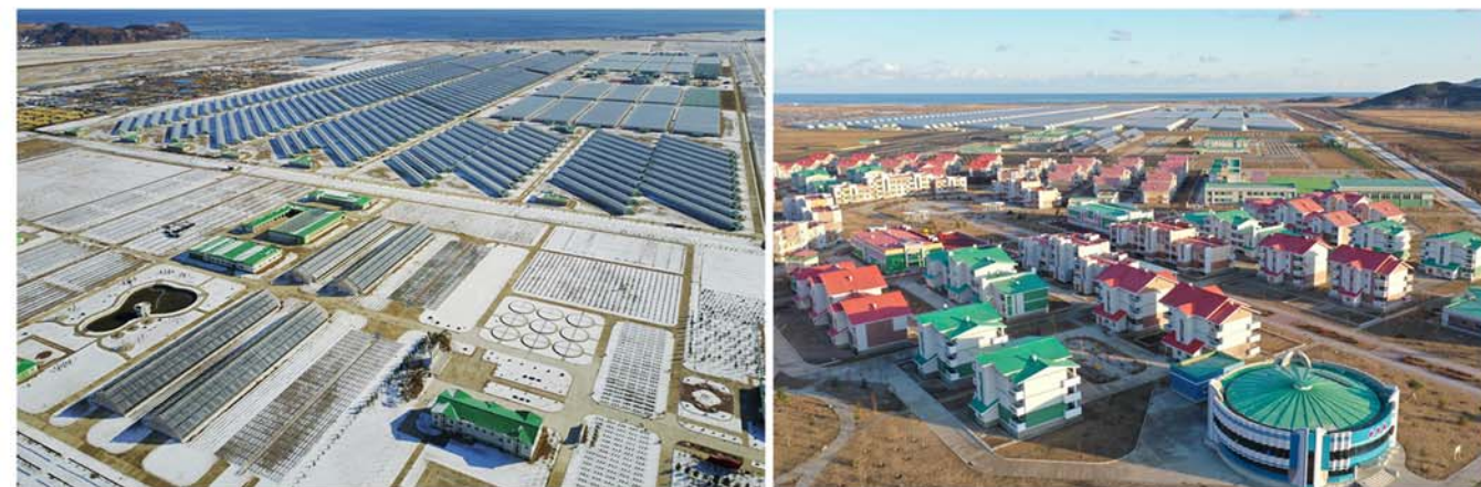
The Jungphyong Vegetable Greenhouse Farm and Tree Nursery, and houses.

As soon as it was reported that a greenhouse farm for the diet of the provincial people was about to be built, graduates of Chongjin University of Agriculture were the first to volunteer to work at the farm, and lots of builders from across the country went there and pushed ahead with the infrastructure and foundation work in the greenhouse, residential and tree nursery districts and the construction of buildings. Thus they wrought a miracle of completing 320 greenhouses, a tree nursery and houses for hundreds of families in the area of 200 hectares in a little over a year. ►