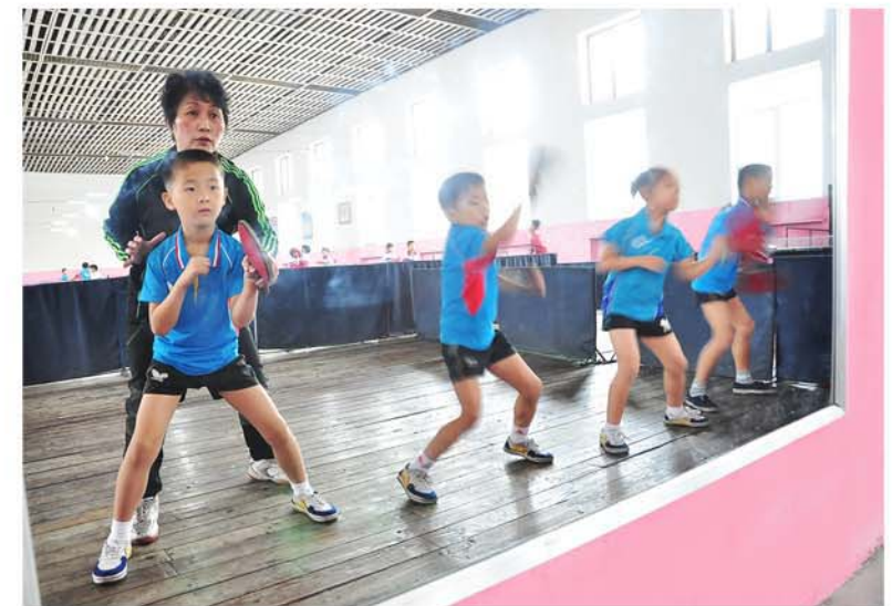
Proper posture is developed.

Standing on the podium for the winners, members of the team shouted, "We want to pre-