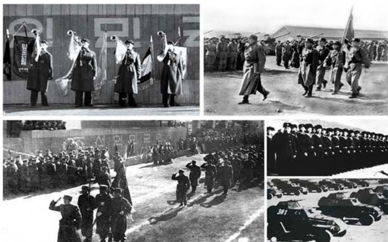
The first military parade of the Korean People's Army held on February 8, 1948.