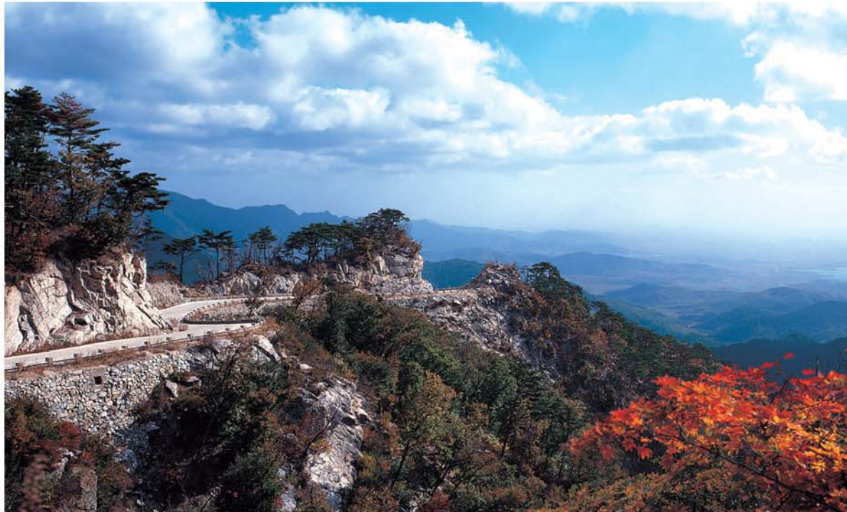
The road to the Kuwolsan Fort.

M T KUWOL IN THE NORTHWESTERN part of South Hwanghae Province has long been known as one of the six celebrated mountains in Korea as it has a unique beauty of mountains and valleys. It was named Kuwol (September) for its beautiful scenery of golden leaves in that month.