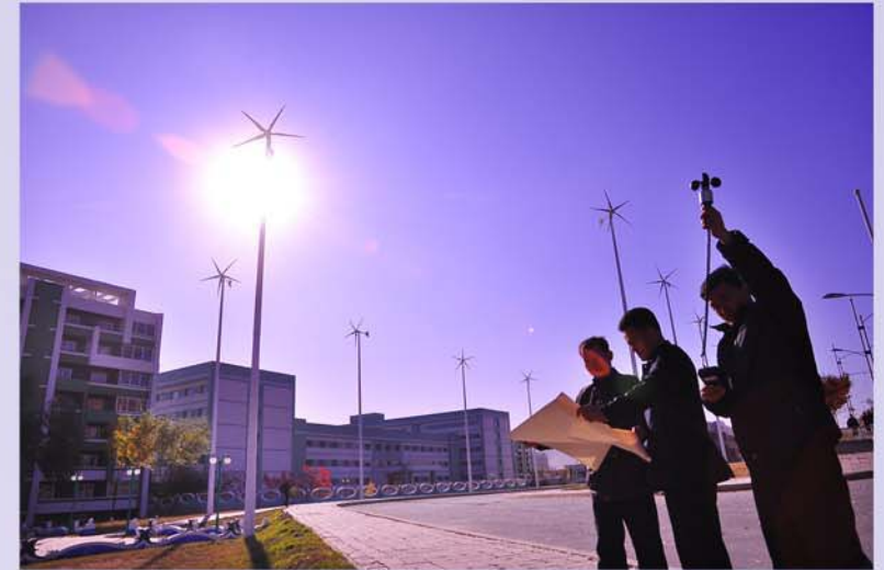
Specifications of wind-driven generators are examined in a residential district.

Now the institute is focusing its efforts on projects for raising the efficiency of power production system based on various kinds of renewable energy, de-