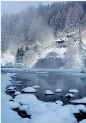
Back Cover: Rimyongsu in winter