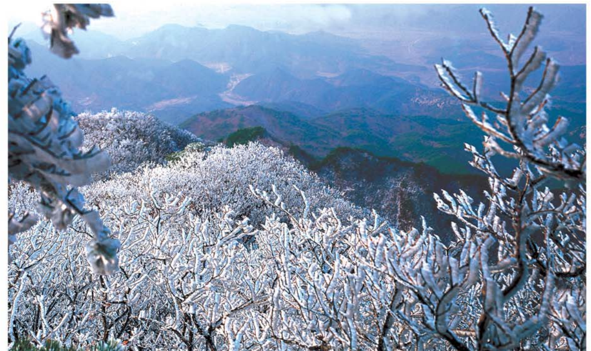
Mt Kuwol covered with frost.