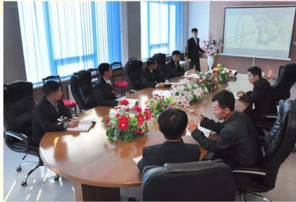
A sci-tech discussion is under way.