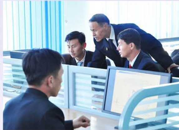
The geothermal device laboratory.

T HE RENEWABLE ENERGY Institute of the State Academy of Sciences has made not a few achievements through vigorous research, development and application.