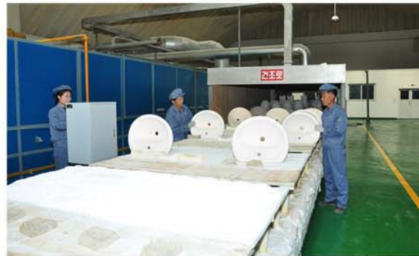
Efforts are made to improve the quality of building materials and increase their variety.

The varieties of sanitary ware from the factory number over 20, including urinals for children, 0.5 m- and 0.7 m-high perpendicular urinals, kitchen sinks, washstands and toilet stools for ships.