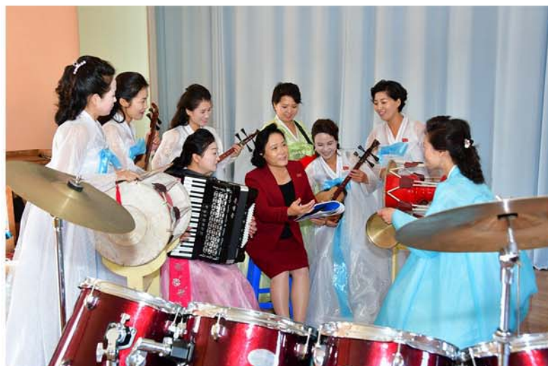
Efforts are made to improve artistic skills.

They wanted to bring pleasure to more people by their singing, so they joined the art circle of the Ryokpho District House of Mass Culture. They were of different characters, hobbies and ages, but they shared the same purpose and mind developing their skills on the stage of the house of culture. Then, they toured factories and enterprises in the district on various occasions to encourage the workers with their singing and put on congratulatory performances together with members of the local factories' art circles. In the course of this they felt more keenly that greater sounds of music are the sign of greater