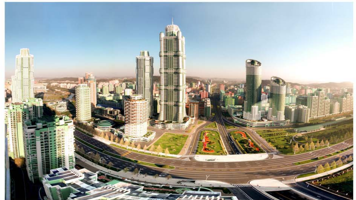
A panorama of Ryomyong Street.