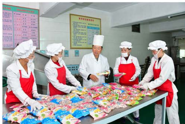
Different foodstuffs are produced and supplied to children.