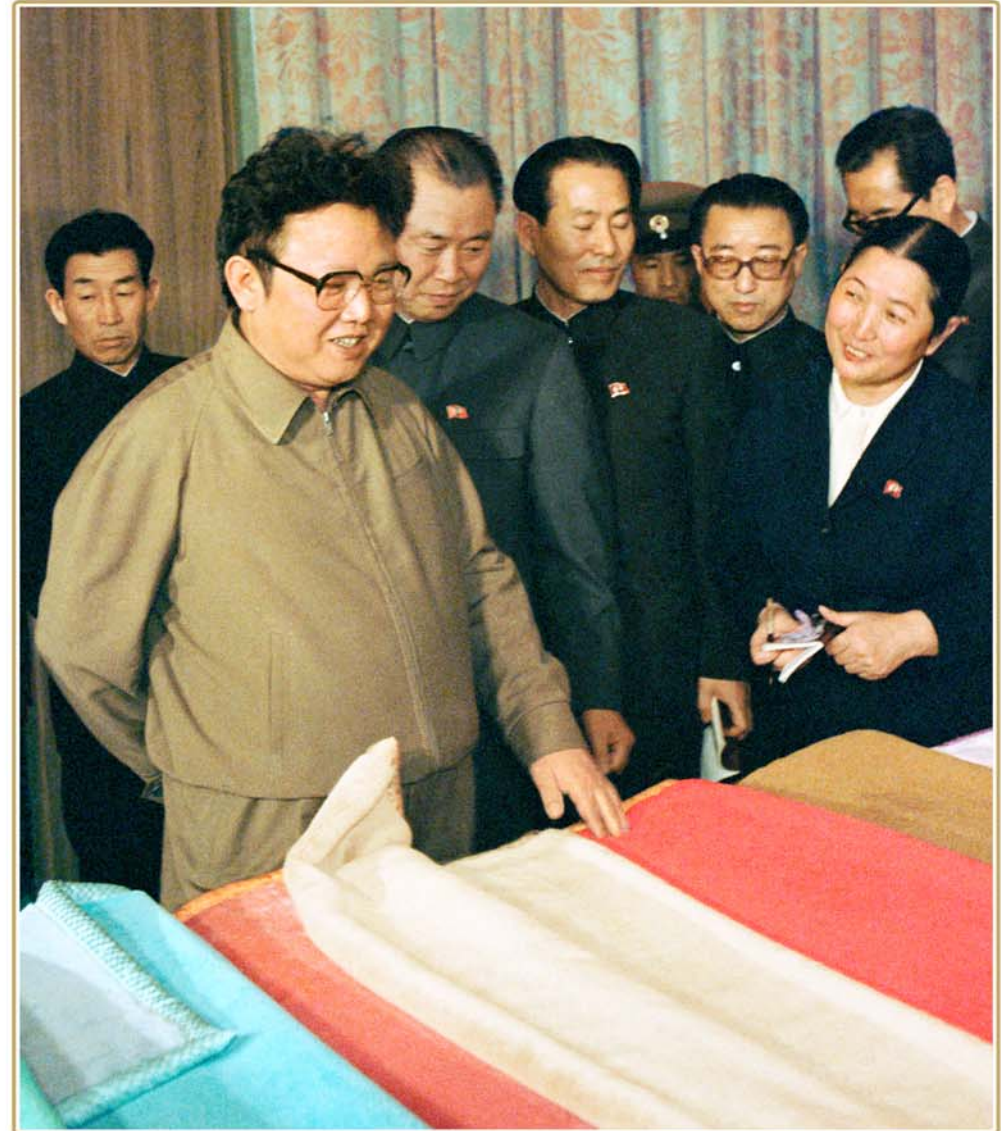
Chairman Kim Jong Il examines a newly produced blanket and names it Maansan Blanket in March 1984.