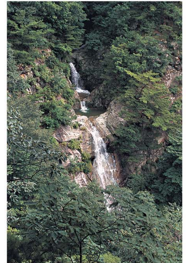
A three-tier waterfall in the mountain.

The mountain also has scenic spots like the Tanphung Recreation Ground, the Sansong Recreation Ground, the Jonggok Recreation Ground and the Phaldam Recreation Ground, all associated with legends. Now it serves as a popular public resort for sightseeing and recreation. □