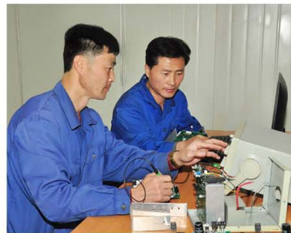
A mobile roentgen-generating device is assembled.

T HE NATIONAL PUBLIC health sci-tech achievements exhibition 2018 was held in that year in the capital city of Pyongyang, the DPRK. At the exhibition a mobile roentgen equipment developed by the scientists and technicians of the Pyongyang Medical Appliance Technology Company won special prize as a valuable medical appliance.