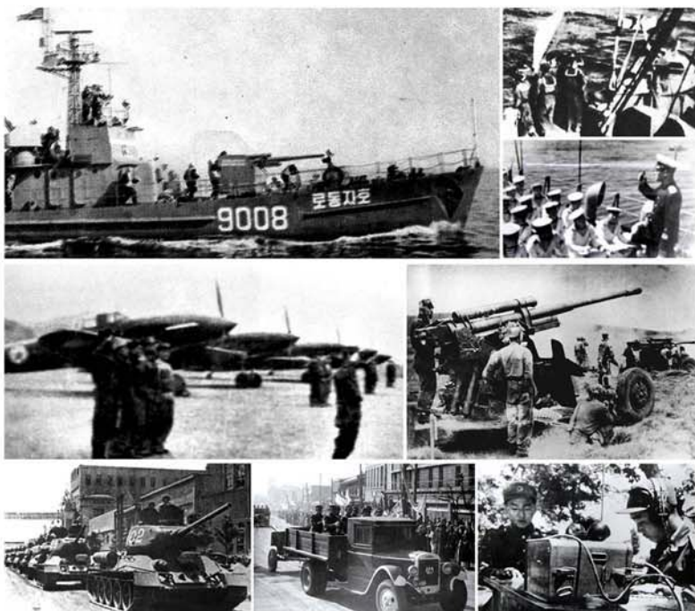
Different services and arms are established.