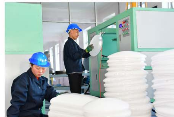
Production lines for plastic lamp shade and artificial turf production.