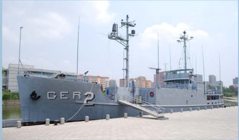
The Pueblo on show at the Victorious Fatherland Liberation War Museum.

► “retaliation” and return an all-out war for an all-out war, and signed a letter of apology recognizing the spy ship’s espionage and hostile acts and guaranteeing that any other warship would not intrude into the DPRK territorial waters. Dwelling on the fact Washington Post said in a leading article that the Pueblo incident that easily made a fool of the US and its government’s apology were very distressing and that it might be a more correct expression to say that their country which had boasted of being the strongest in the world was bleeding at the nose, knocked by the small country of Korea, like a clumsy back street villain.