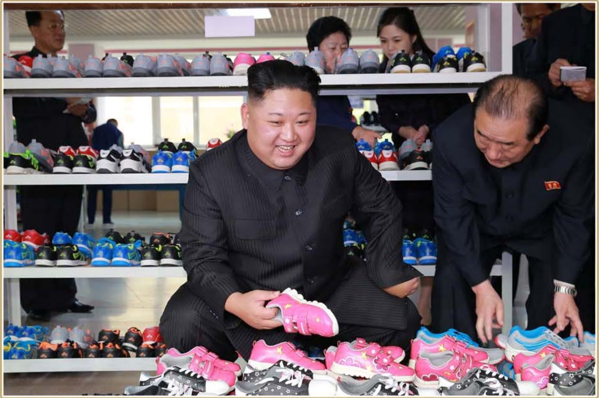
Supreme Leader Kim Jong Un inspects the newly renovated Ryuwon Footwear Factory in October 2017.