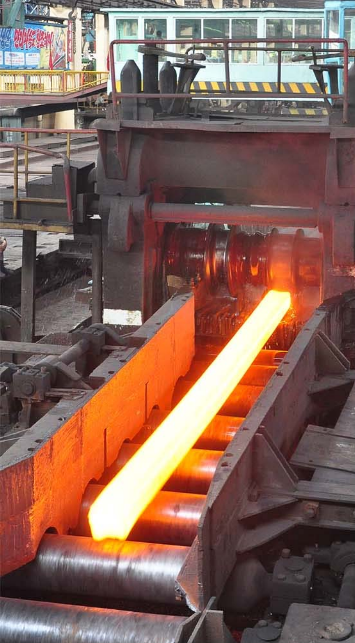
Steel production is on the increase.