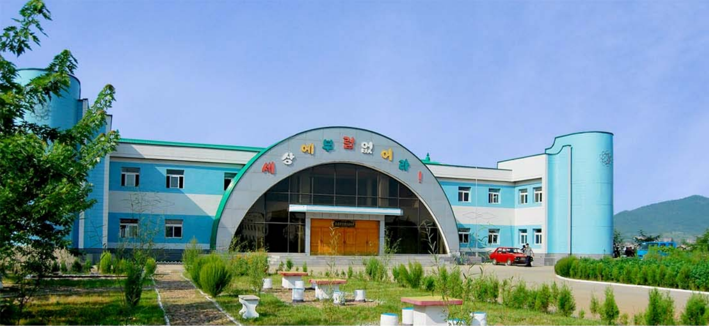
The Songnim City Schoolchildren's Hall.