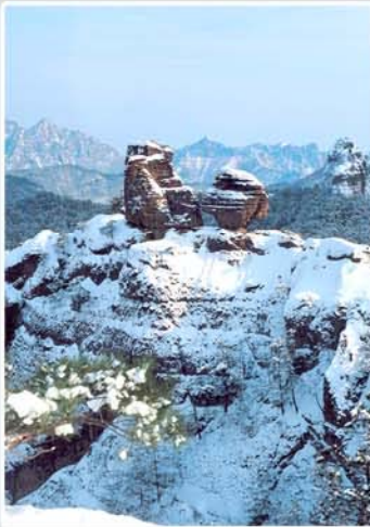
Back Cover: Piano Rock in Mt. Chilbo