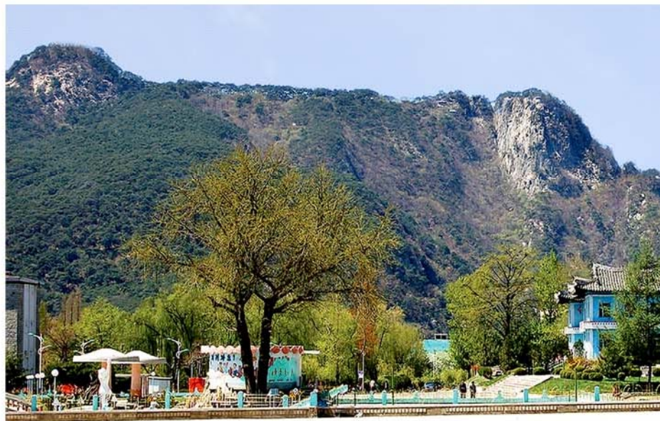
Yaksandongdae in Nyongbyon.