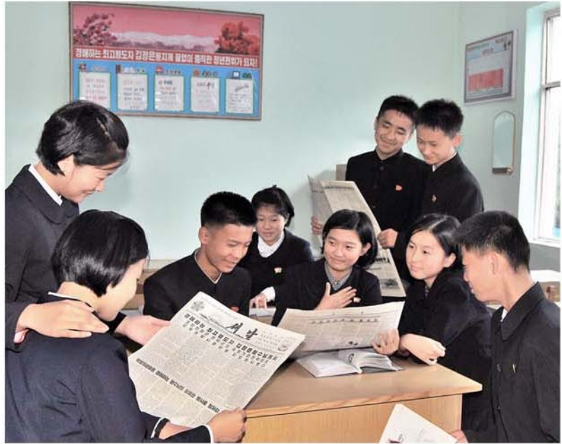
Saenal is a close companion of schoolchildren.

The SCU and other anti-Japanese organizations used the paper as a textbook and a means of motivating the masses. Thus, it greatly helped educate the broad sections of youngsters and other people in the anti-Japanese patriotic idea, consolidate their organizations and implant a revolu-