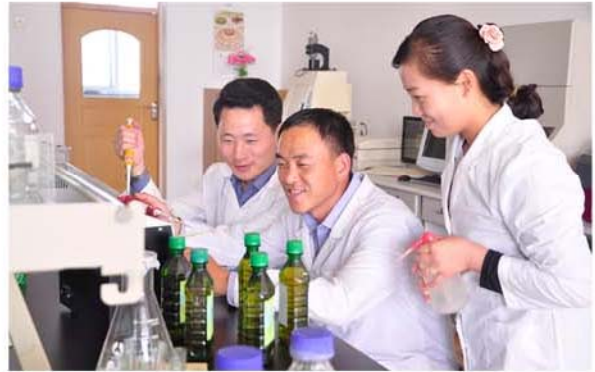
The researchers who developed agar oligosaccharide nutritive liquid.

The result of clinical examination at several units proved that its treatment efficacy is considerably higher than other medicines. As it is prepared with a natural material and has different functions, the