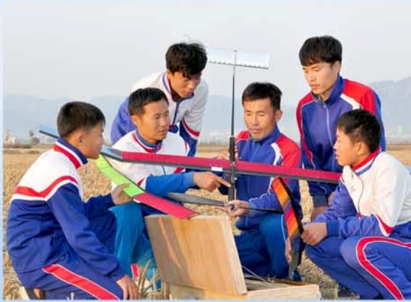
The structure and operational principles of the rubber-propelled model plane are taught.

computer simulation tests they finally made a glider of their own type. They improved their skill of flying the glider higher through steady training. Now the club puts efforts in developing other events including the power-driven glider event in which they are inexperienced. Besides, it pushes ahead with the work to arrange a popular aero sports service base.