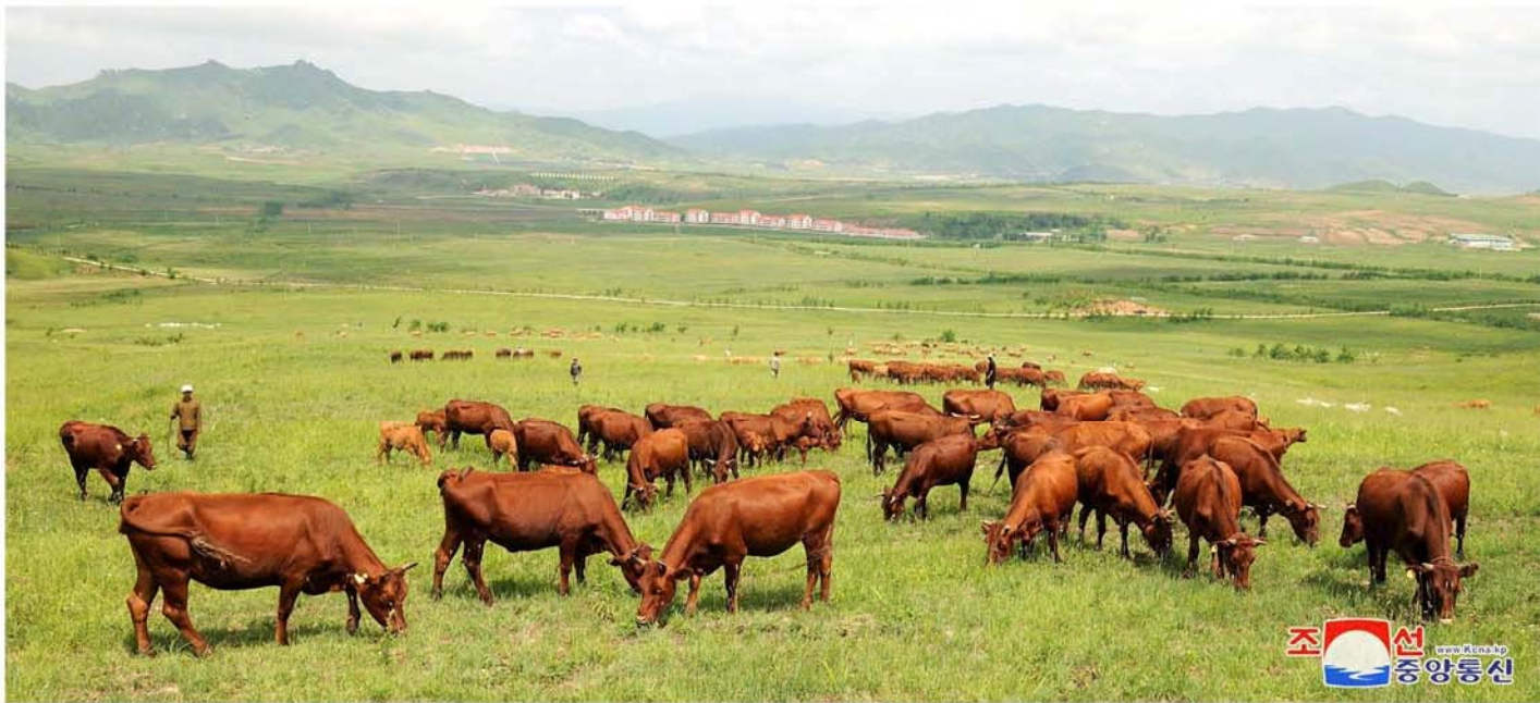
Some of the achievements of the Korean people based on their own efforts.