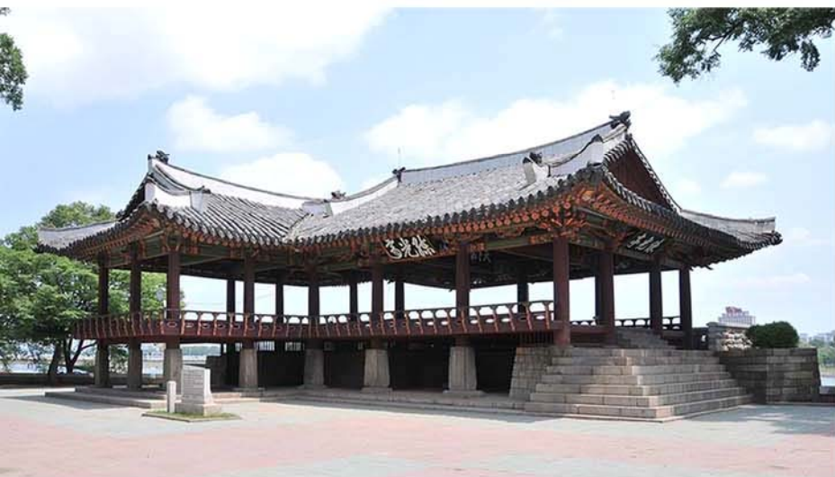
Ryongwang Pavilion in Pyongyang.

It was the pavilion attached to the Songchon Inn in Songchon Town, Songchon County, South Phyongan Province. It was used as a venue of banquets for officials of the feudal government and foreign envoys staying in the inn. Its layout was characteristic, and the variation in the height of the floors matched well with its architectural and spatial changes. With its front open wide, the pavilion blended well with the crystal-clear Piryu River, and one could enjoy a view of the 12 peaks on Mt. Hulgol across the river. The pavilion and several buildings of the inn were damaged during the Japanese imperialists' military occupation