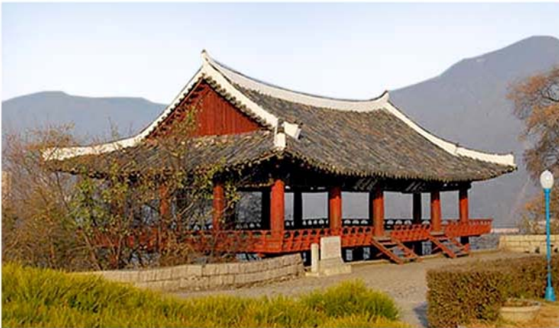
Inphung Pavilion in Kanggye.

The pavilion is situated in Inphung-dong, Kanggye, Jagang Province. It stands on a cliff along the Jangja River which meanders round the northwestern part of the city. As a command post in the northwest of the wall around the town of Kanggye, the pavilion was widely used for training and inspection of soldiers. It was built in 1472 and rebuilt in 1680. It reflects the outstanding wisdom and artistic skills of Koreans—every building material and painting agree with the characteristics of the pavilion ►