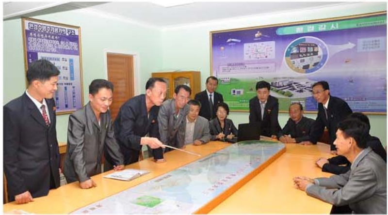
Matters of environmental protection are discussed.