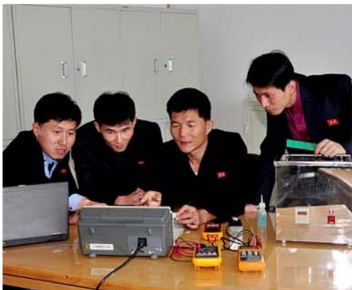
Developers of cutting-edge products like ultrasonic washers.