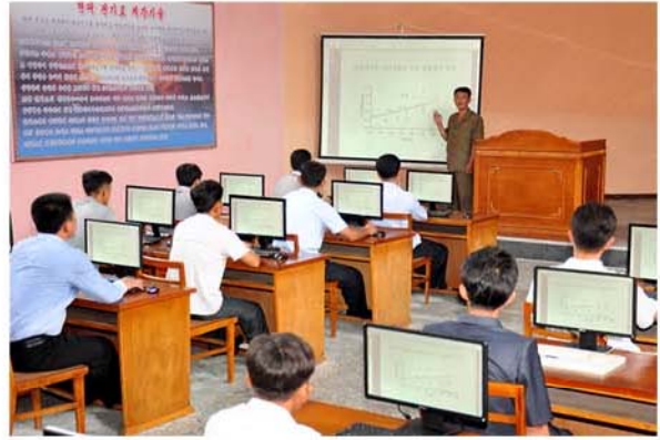
In the sci-tech learning space.

As a result, the whole project was finished in two months which otherwise would have taken half a year, and they put the production of ores for that of ferromanganese on a normal basis. And they decided to use the existing ferroalloy furnace of the ferroalloy workshop for the ferromanganese production, and introduced a rational melting method for the operation of the ferroalloy furnace, remarkably succeeding in producing ferromanganese with wad available in