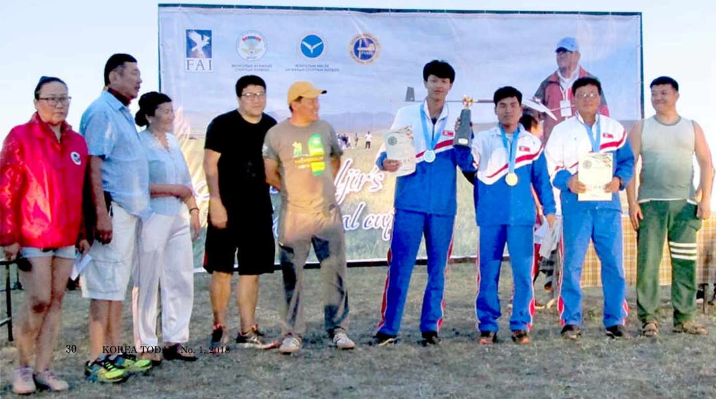
The Kaesong Aero Club won the Asian Cup 2017 of the FAI World Cup Event in Ulan Bator, Mongolia.

In the late 16 th century the Korean people made and used Pigo (a flying vehicle) on a similar principle to making of today's glider. While referring to the scientific and technological successes of the ancestors they tried to make a glider in keeping with the trend in the global development of gliders. It was not an easy job. What mattered especially was to obtain necessary material and introduce a wireless control technique. To solve the problem they frequently vis- ▶