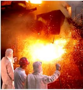
Front Cover: Molten iron production is on the increase at the Hwanghae Iron and Steel Complex.