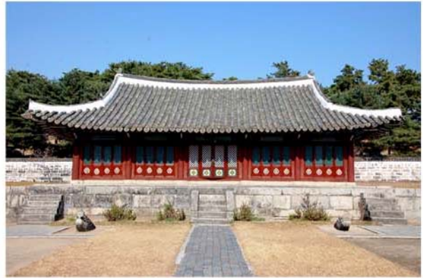
The Taesongjon of the Koryo Songgyungwan.

Koryo Songgyungwan, located in Pangjik-dong, Kaesong, was the highest institution of education in the period of Koryo (918–1392), a feudal state. It has the longest history of its kind in the world. In 992 Kukjagam, the highest national institution of education, was set up in Kaegyong, the capital of Koryo. In 1087 it moved into Taemyong Palace, a detachment of the royal palace, built in Kaegyong in 1047. It was reorganized as Songgyungwan in 1298, as Songgyungwan in 1308, as Kukjagam in 1356 and finally as Songgyungwan in 1362. The buildings of the