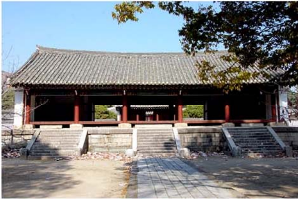
The interior of the Myongryundang of the Koryo Songgyungwan.

Kon was registered in the UNESCO list of world cultural heritage as it is a valuable historical and cultural relic carrying the history of the building of the unified state.