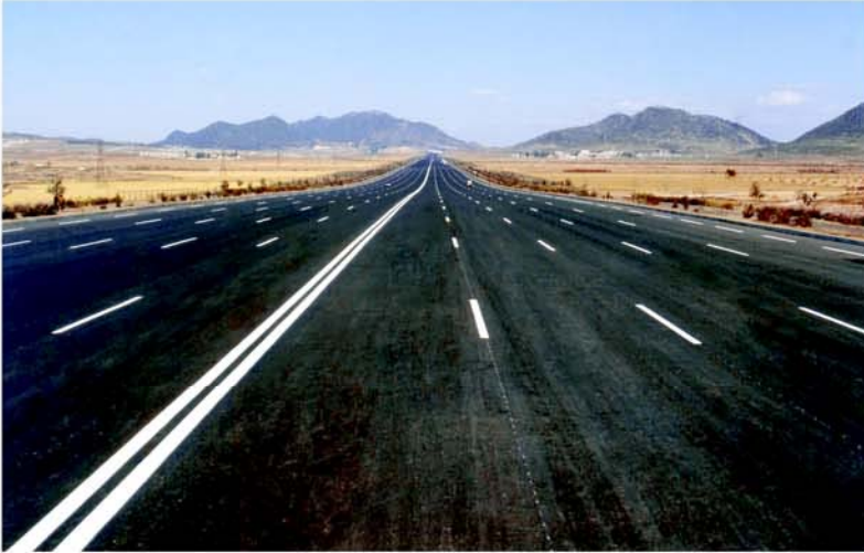
A section of the Youth Hero Road.