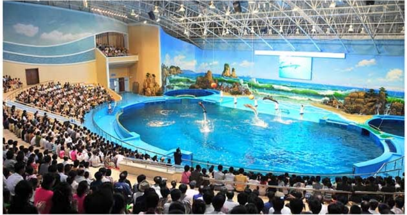
The Rungna Dolphinarium.