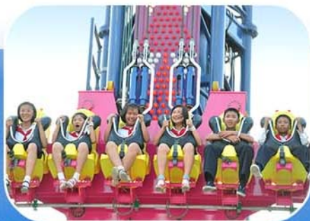
At the Rungna Amusement Park.