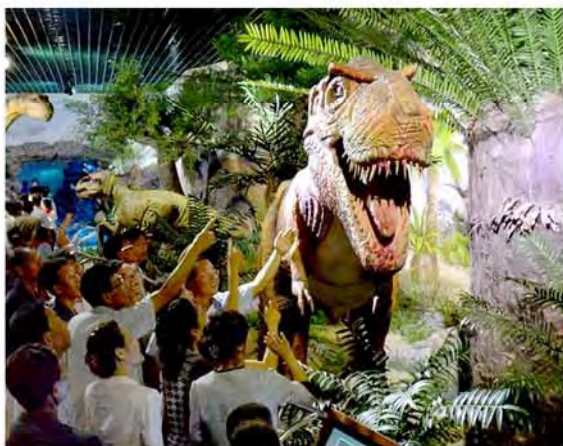
Working people and schoolchildren look round the Mesozoic hall.

Saying that the animal ancestor of the human being was a monkey with two legs and the