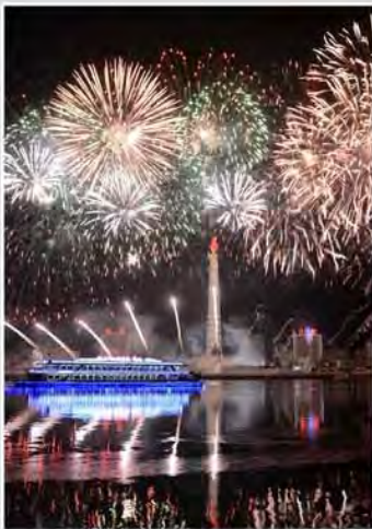
Back Cover: A firework display in celebration of Chairman Kim Jong Il's birthday in February