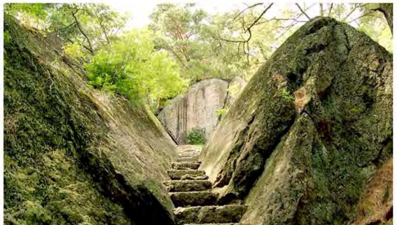
The road to Ssang (couple) Rock.