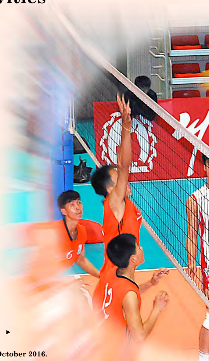
Scenes from the 13 th People's Games in October 2016.

In the tennis event, the South Phyongan Province team was ranked high. Having learned a lot of experience and lessons from the National Inter-provincial Games-15, they achieved an unprecedented success at the last People's Games. The coach organized the team with industrial and farm workers from the lowest echelons who had practiced tennis while engaged in everyday sports activities. And he trained them strenuously. He concentrated on the