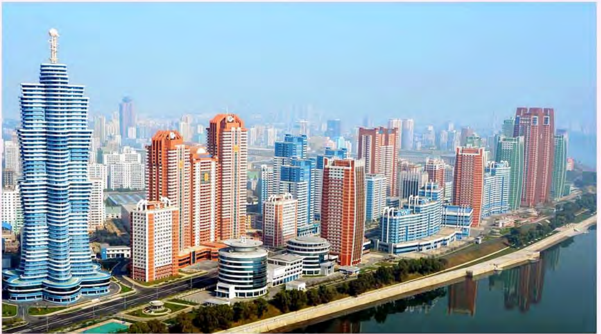
The Mirae Scientists Street.