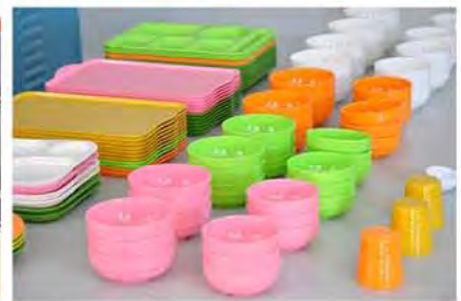
Different kinds of zips and melamine resin products.

phisticated to save time and labour while checking the quality of zips accurately. The annual production capacity can fully meet the national demand for zips needed for production of necessities of life.