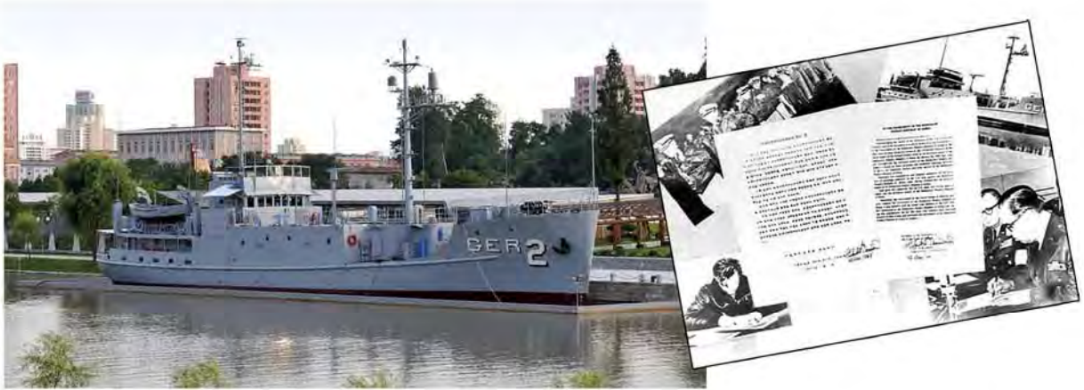
Captured American armed spy ship Pueblo and the letter of apology of the US imperialists.

► own armament industry, the KPA finally took its first step as regular armed forces. The birth of the KPA was a glorious declaration to put an end to the tearful national history of being ridden over by the foreign invaders because it was too weak to defend the country, and predict the future of a powerful independent nation.