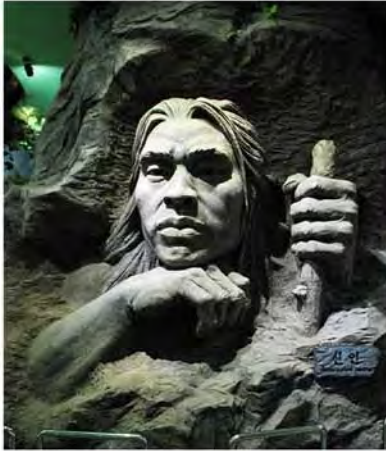
A head model of Neolithic man.

▶ modern man was born through the stages of Pithecanthropus, Palaeolithic man and Neolithic man, the guide concluded that lots of fossils of mankind and their stonework as well as mammal fossils were discovered in the Taedong River basin centring Pyongyang, vividly proving that Korea is one of the cradles of