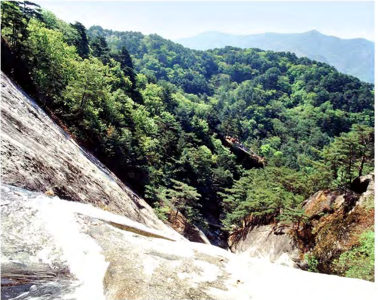
On the Manphok Rock.