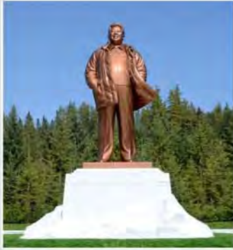
Front Cover: Statue of Chairman Kim Jong Il erected in Samjiyon County in September 2016