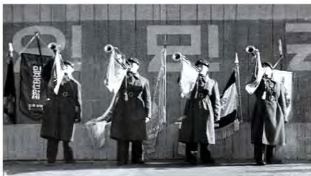
Scenes of the first military parade of the Korean People's Army in celebration of its development into regular revolutionary armed forces in February 1948.

The leader Kim Il Sung, who had defeated by guerrilla warfare the Japanese imperialists—who were swaggering as "leader of Asia"—and accomplished the historic cause of national liberation, regarded the construction of regular armed forces as a vital problem related to the construction of a new Korea and the future of the nation and accelerated the building of a regular army purposefully. In 1945 the Pyongyang School was established and in 1946 the Central Security Cadre School was founded. The Marine Security Cadre School and the Flying Corps were set up in 1947. Thanks to the energetic guidance of the leader who paid deep attention to the training of military and political officers, founding of different services, arms, special units, and deciding military ranks and uniforms, and developing Korea's