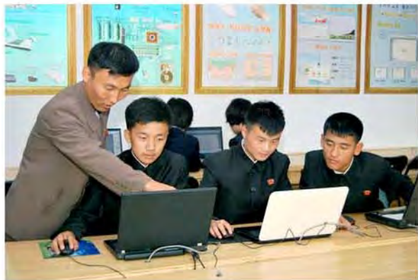
The IT circle.