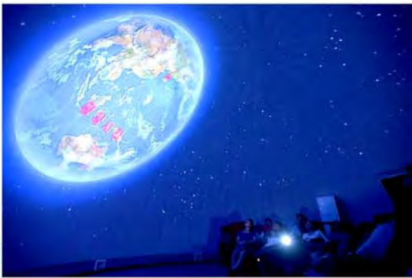
The outer space hall.