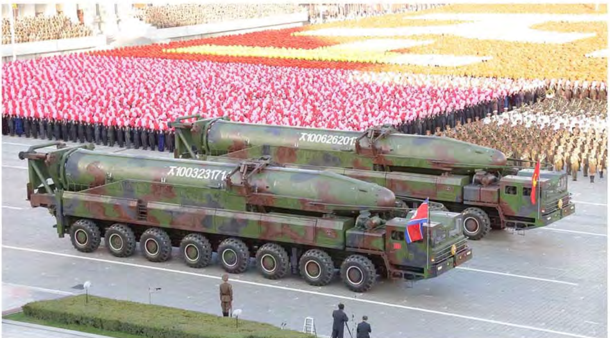
A scene from the military parade and Pyongyang citizens’ mass demonstration in celebration of the 70 th founding anniversary of the Workers’ Party of Korea in October 2015.