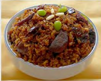
Yakbap (sweet rice).