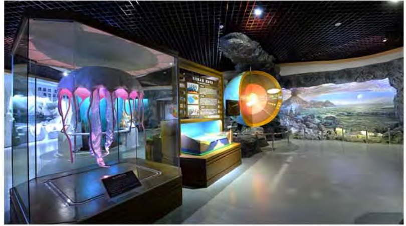
The general hall of ancient life.

▶ modern man was born through the stages of Pithecanthropus, Palaeolithic man and Neolithic man, the guide concluded that lots of fossils of mankind and their stonework as well as mammal fossils were discovered in the Taedong River basin centring Pyongyang, vividly proving that Korea is one of the cradles of