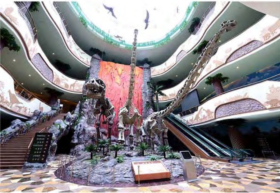
The central hall.

► knowledge of stars. One of the editions was about a meteorite that fell down in a country in March 1976.