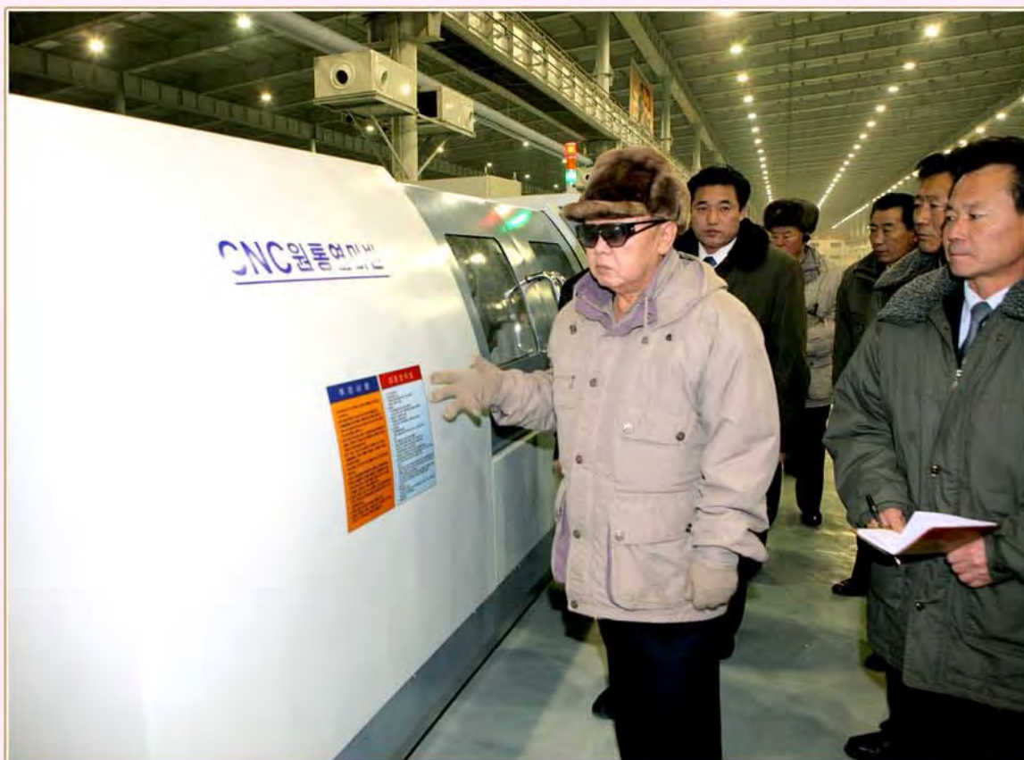
Chairman Kim Jong Il sees new models of CNC machine tools in December 2010.

T HE DEMOCRATIC PEOPLE'S REPUBLIC of Korea's cause of building a socialist power is suffering all sorts of difficulties due to atrocious anti-DPRK schemes of hostile forces. Despite the difficulties the Korean people are advancing vigorously on the strength of their own resources, their scientific and technological potentialities.