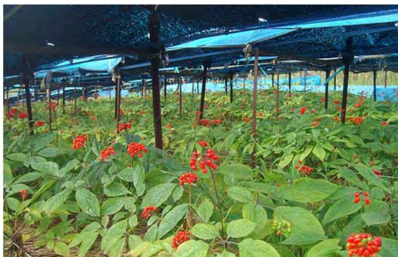
An insam plot.

Insam was widely known as an excellent medicinal material from long ago and used as the best tonic. It has good effects in strengthening restorative and immune functions, stimulating the central nervous system, improving the hematogenous function and the digestion and absorption of foods. It also has nice effects on metabo-