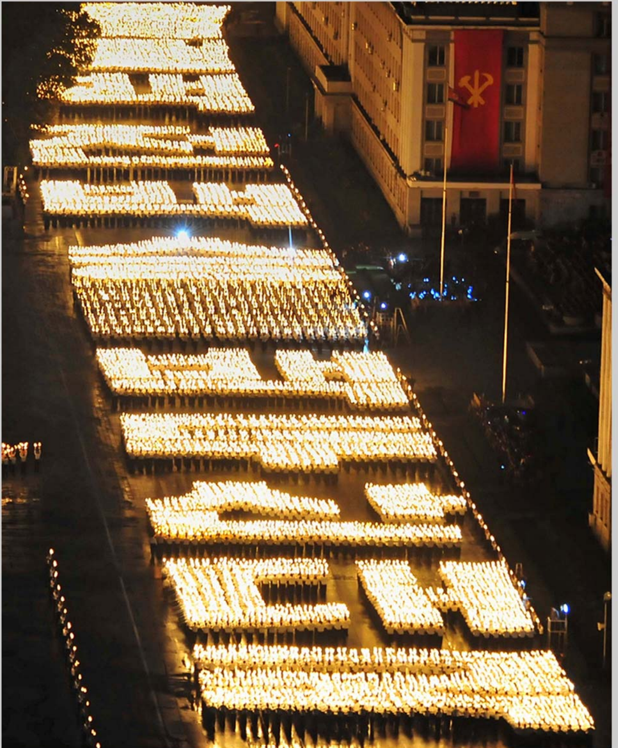
The youth and students' torchlight procession was held in October 2015 in celebration of the 70 th founding anniversary of the Workers' Party of Korea.