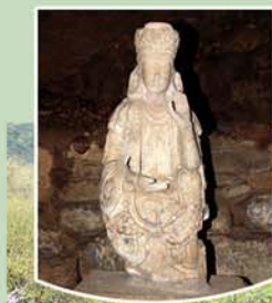
The image of the Buddhist Goddess of Mercy, and the Taeung Hall.