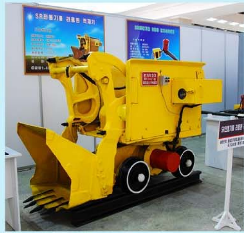
Some machines and equipment the Koreans manufactured in honour of the Seventh Congress of the WPK.