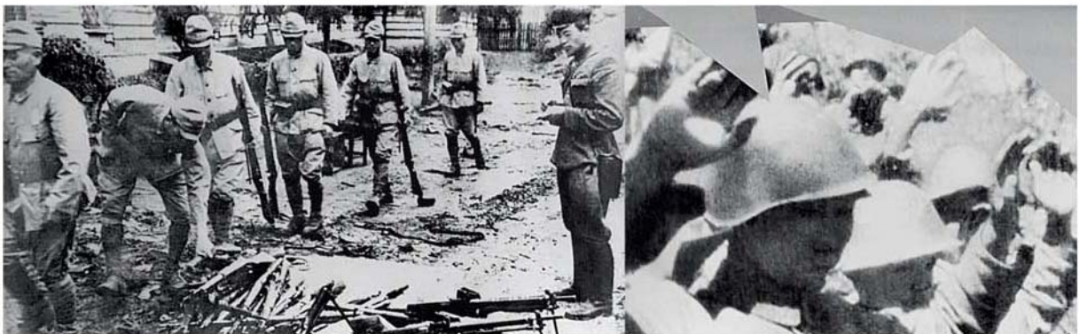
The defeated Japanese imperialists (August 1945).

Arguing about ideologies and doctrines is no way to national unity. We must find a common denominator and make it absolute, burying our doctrinal differences, as we did when heralding the great event of national liberation in the first half of the 1940s. Hence the importance of the experiences and lessons of the anti-Japanese revolution. □