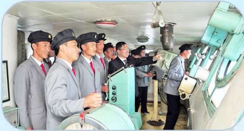
At a place of practice.