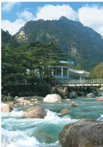
Back Cover: Singye Stream of Mt. Kumgang in summer