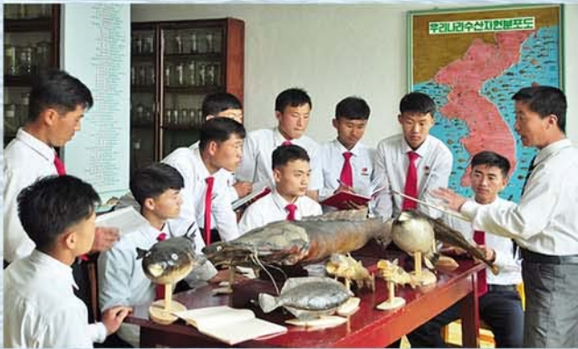
Students acquire multifarious knowledge.

The teachers and researchers are also working hard to settle scientific and technical problems arising in the seafood production and processing. By making a strenuous endeavour to develop the fish processing so as to contribute to improvement of the eating habit of Korean people, the seafood processing faculty advanced a number of methods to enhance the quality of cold-storage goods, preserved goods, pickled foods, tinned and smoked foods. Researchers of the fisheries institute opened the prospect of doubling the production of seaweed and tangle in the offshore culture while using less ropes and buoys. The old convention was that the production of sea- ▶