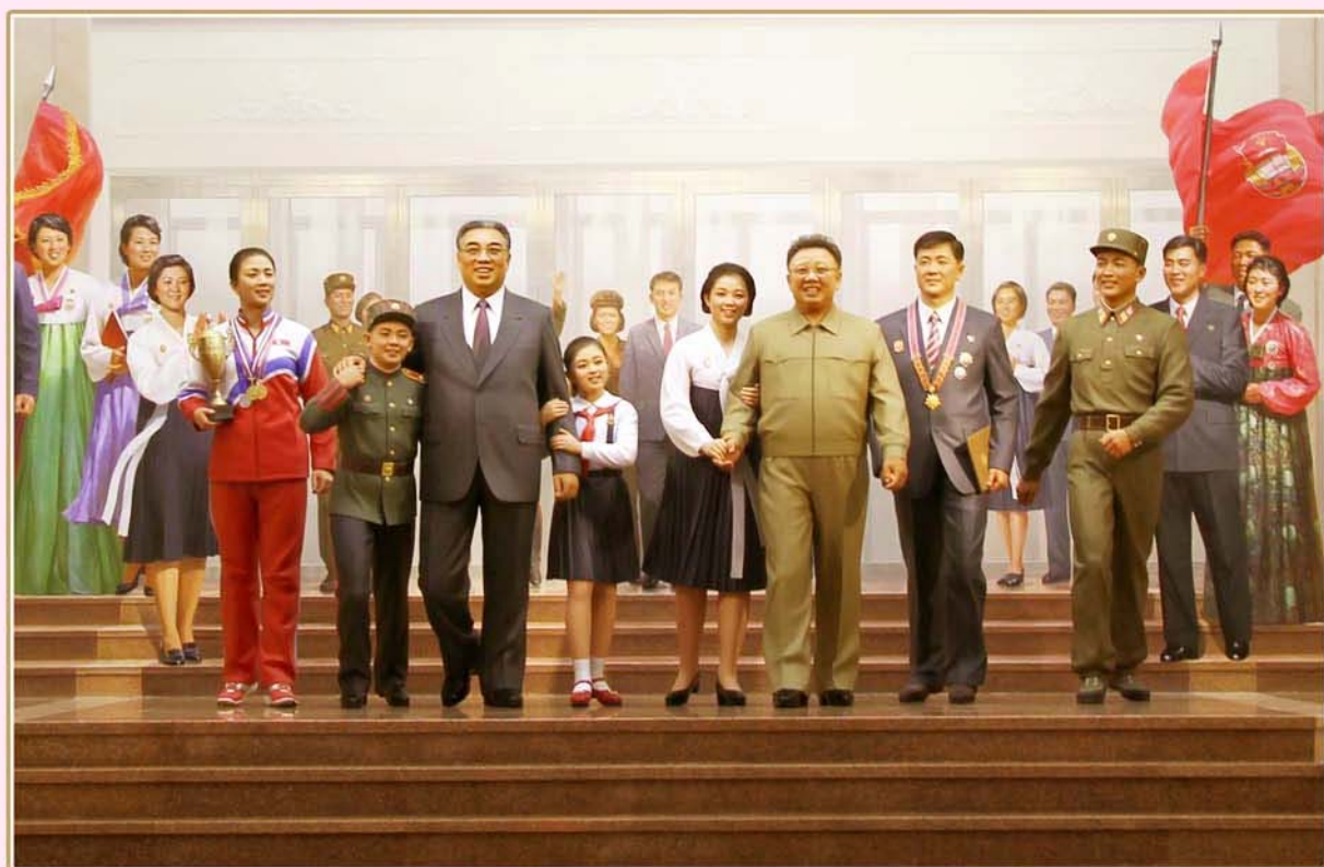
The general review hall features statues of President Kim Il Sung and Chairman Kim Jong Il among children and young people.

T HE KOREAN YOUNG people have always played a vanguard role in implementing the policies of the Workers' Party of Korea, demonstrating fully their indomitable spirit and inexhaustible might. This is entirely attributable to President Kim Il Sung, Chairman Kim Jong Il and supreme leader Kim Jong Un's idea of attaching importance to the youth.