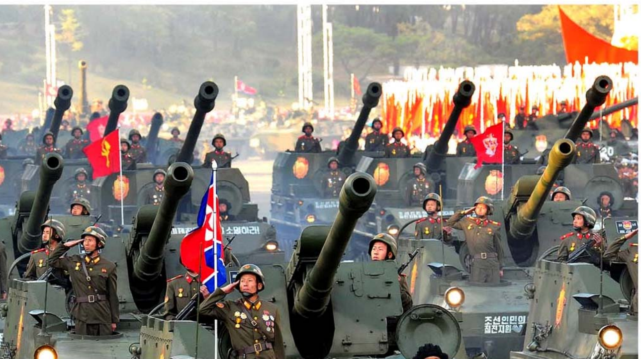
A scene from the military parade in celebration of the 70 th founding anniversary of the WPK in October 2015.