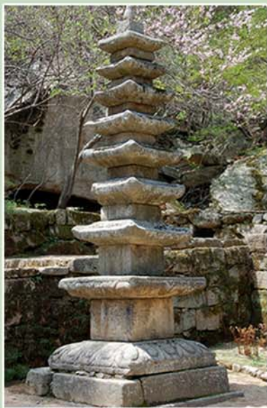
A seven-storyed pagoda at the Kwanum Temple.

The history of the temple began when a monk named Popingksa placed a pair of Bodhisattva sculptures in a cave and