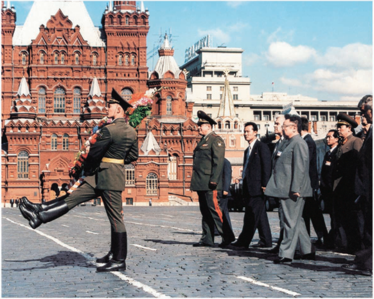
Kim Jong Il lays a wreath in front of the Lenin Mausoleum (August 2001)