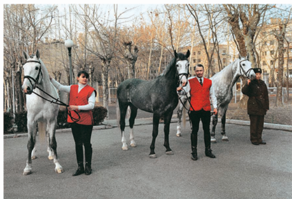
Kim Jong Il appreciates the Orlov stallions, a gift from President Vladimir Putin of the Russian Federation (February 2003)