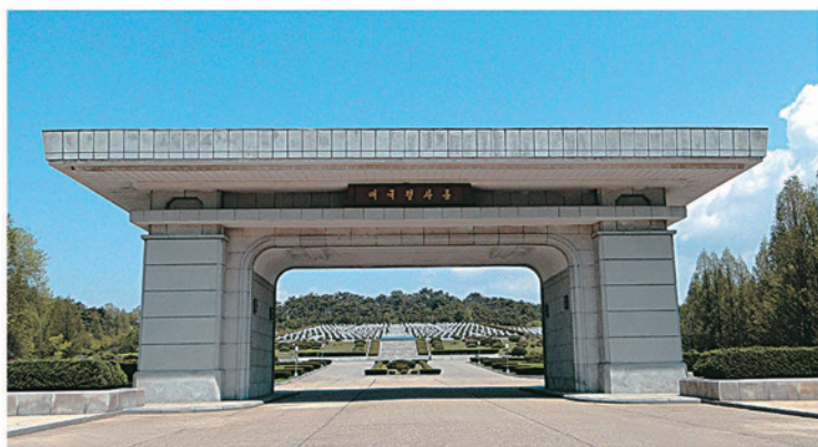
Archway to the Patriotic Martyrs Cemetery