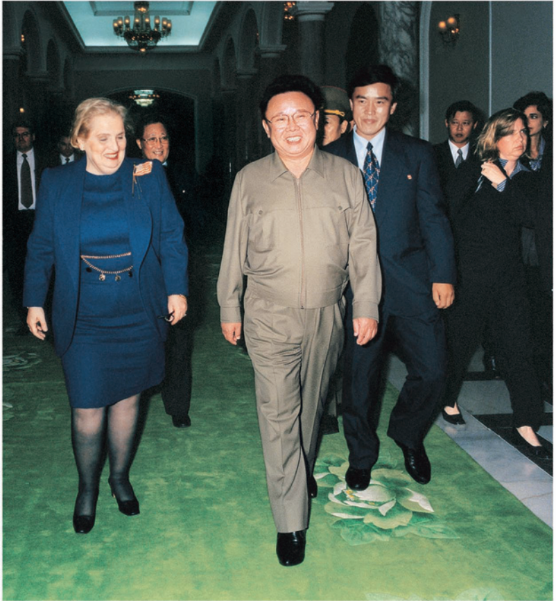
Kim Jong Il meets Madeleine Albright, US Secretary of State (October 2000)