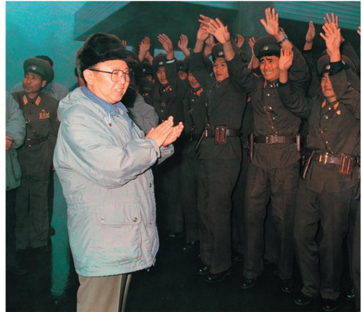
Kim Jong Il inspects the Panmunjom Mission of the KPA (November 1996)