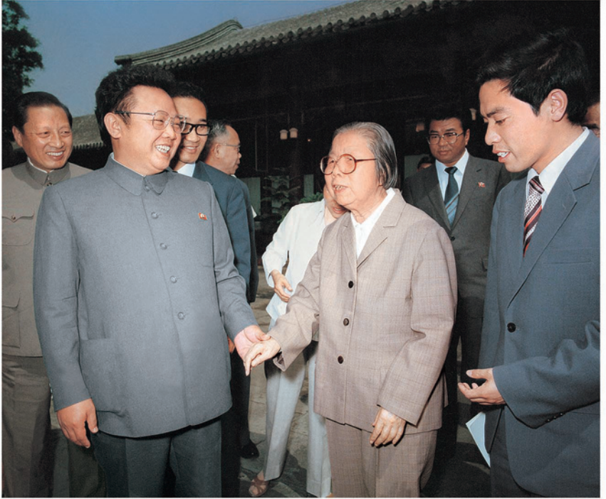
Kim Jong Il shakes hands with Deng Yingchao, chair of the National Committee of the Chinese People's Political Consultative Conference (June 1983)