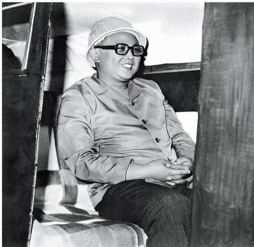
Kim Jong Il goes down a pit on a man-trip during his on-site guidance at the Komdok Mine (July 1975)