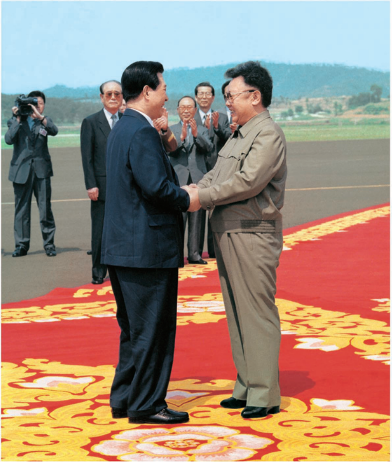
Kim Jong Il receives south Korean president Kim Dae Jung who has come to Pyongyang for inter-Korean summit (June 2000)