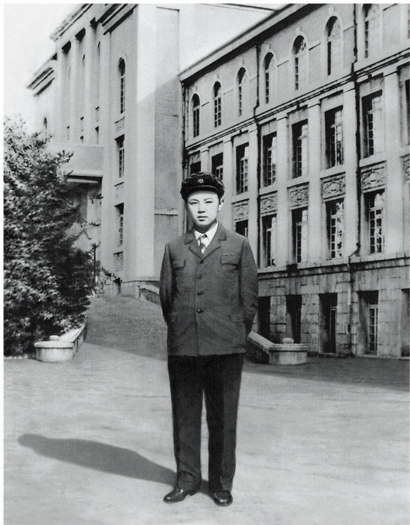
Kim Jong Il in his days at Kim Il Sung University