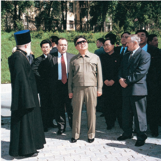
Kim Jong Il visits a Russian Orthodox church in Khabarovsk