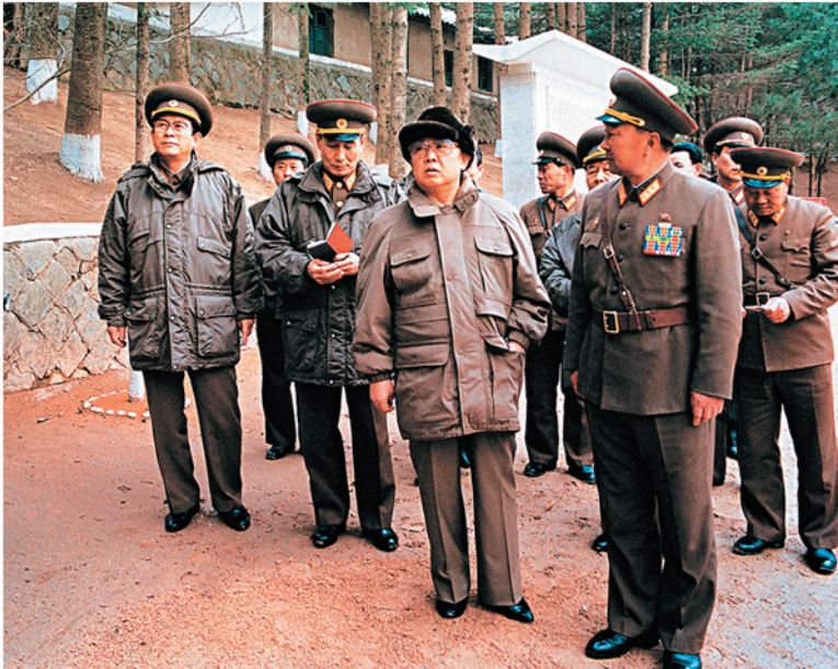
Kim Jong Il inspects a KPA unit on Mt. Taedok (March 1996)