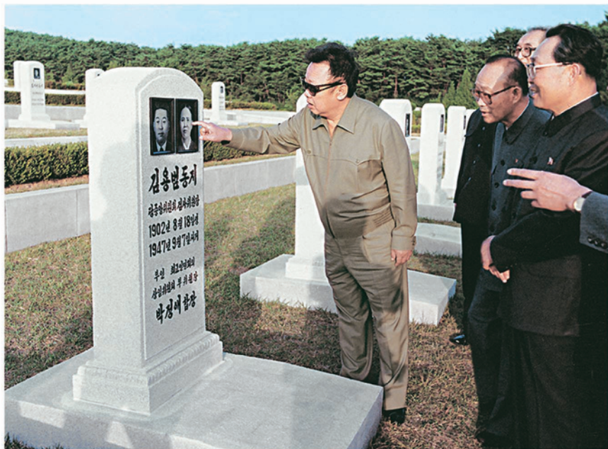
Kim Jong Il tours the Patriotic Martyrs Cemetery (September 1998)