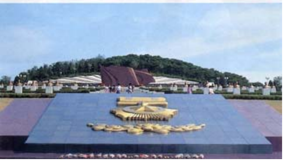
The Revolutionary Martyrs Cemetery