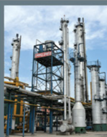
Namhung Youth Chemical Complex