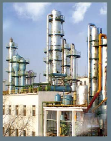
February 8 Vinalon Complex