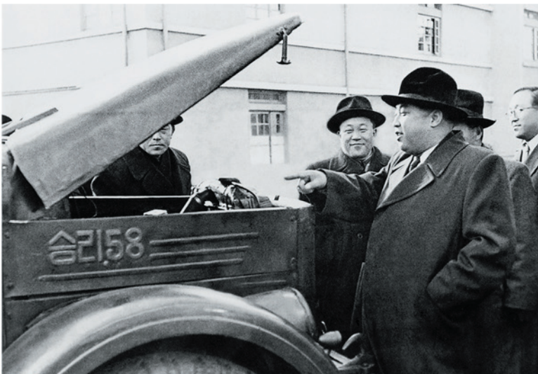
Kim Il Sung examines the first Sungni-58 truck (November 1958)