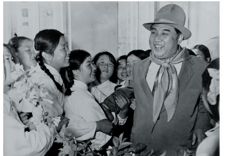
Kim Il Sung with students of a school for bereaved children (May 1961)