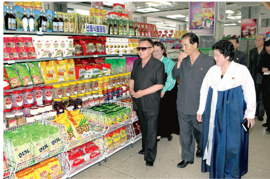
Kim Jong Il looks round a goods show (July 2011)