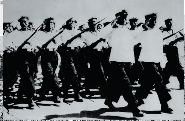
Kim Il Sung acknowledges enthusiastic cheers of the heroic service personnel and people