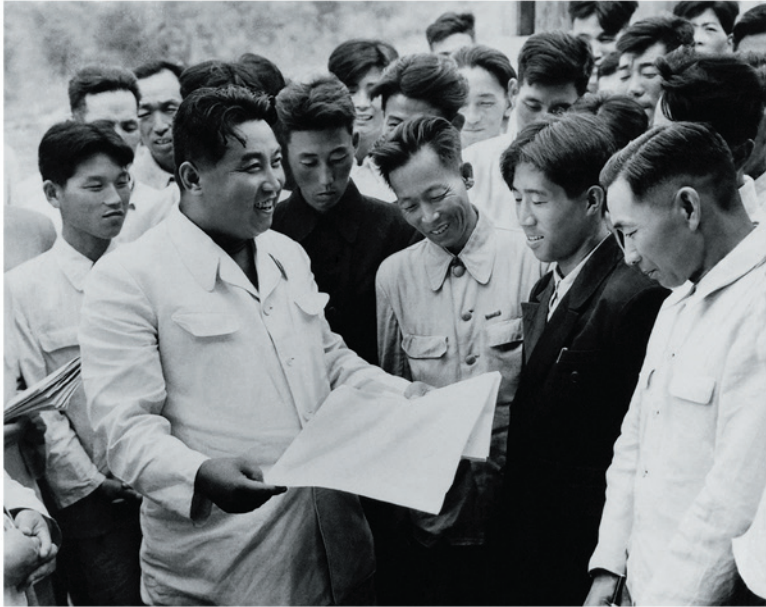
Kim Il Sung meets workers (September 1959)