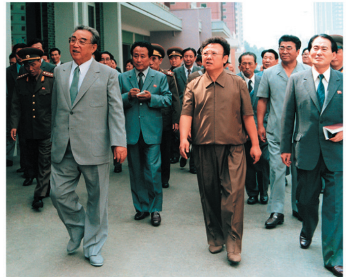
Kim Il Sung and Kim Jong Il look round houses (August 1985)