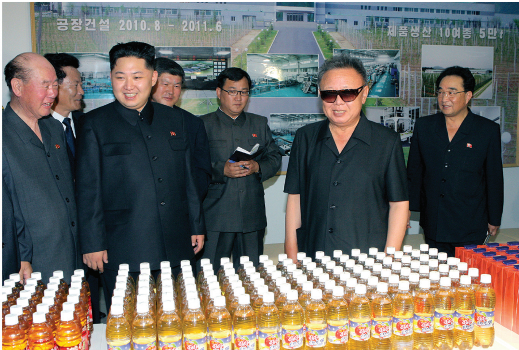
Kim Jong Il and Kim Jong Un give field guidance at the Taedonggang General Fruit Processing Factory (July 2011)