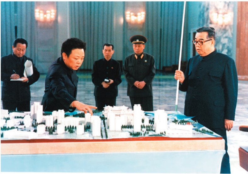
Kim Il Sung and Kim Jong Il examine the relief map of a street (April 1980)