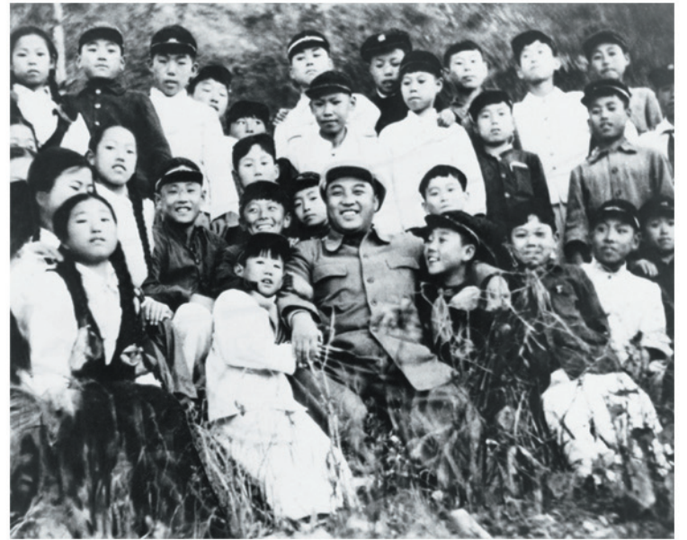
Kim Il Sung with secondary school students (October 1957)