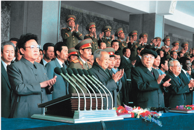
Kim Il Sung and Kim Jong Il on the rostrum of the parade held in celebration of the 60th anniversary of the KPA (April 1992)