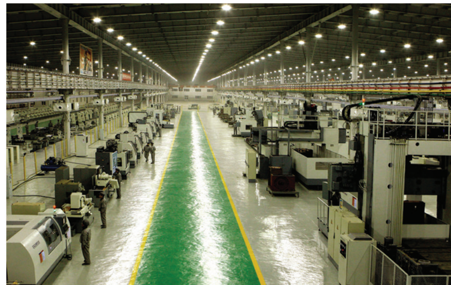
Huichon Ryonha General Machine Factory