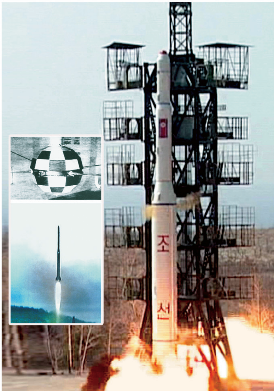
Launching of the artificial earth satellites Kwangmyongsong 1 and 2