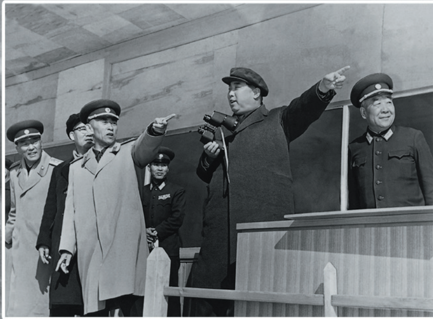
Kim Il Sung gives guidance to a joint military exercise of the KPA combined units (October 1970)